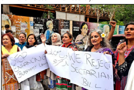
KARACHI: Activists of Civil Society holds protest for the rights of minorities, outside press club in Provincial Capital.

The Federal Minister for IT said the IT and Telecom sector has an important role in the economic development of the country.