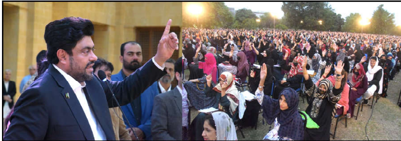
KARACHI: Governor Sindh Kamran Khan Tessori addressing candidates of 22nd and 23rd tests of IT courses at Governor House.

overseas Pakistanis which included establishment of special courts to resolve the property issues faced by the expatriates, one such was being set up in Islamabad which would be replicated in other provinces, establishment of hot lines in the offices under all the chief secretaries and the ICT chief commissioner, setting up Overseas Commission in all provinces, reservation of 10 percent quota for the overseas Pakistanis in all public sector housing projects with 5 percent rebate in case of foreign exchange payment, establishment of dedicated counters at all airports of the country, awarding top ten overseas Pakistan who contributed remittances.