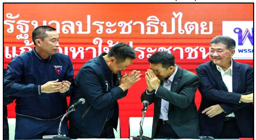
Thailand alliance expands in new effort to form government.