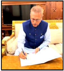
Monitoring Desk ISLAMABAD: President Arif Alvi approved the summary for dissolving the National Assembly (NA) at

Dr. Alvi dissolved the lower house of parliament under the Article 58(1) of the Constitution