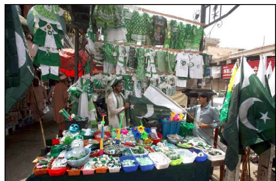
PESHAWAR: Pakistan flags, bunting, printed shirts and other items are being selling on roadside stall in connection of Independence Day of Pakistan coming ahead, at Saddar road.