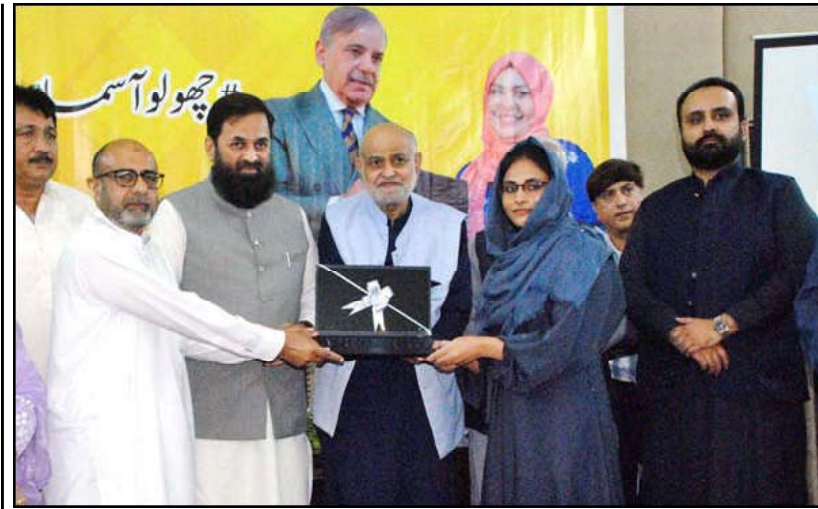
BAHAWALPUR: Governor of the Punjab Engr. Muhammad Baligh Ur Rehman Distributing Laptops to students at the Prime Minister's Youth Laptop Program Ceremony at the Islamia University Bahawalpur.

youth generation to promote hatred, adding, we will not allow the spread of hatred among the people of Pakistan through social media. He said that laptops had been provided to the youth on merit and their political affiliation was with any party. The Governor Punjab said that according to the report of Transparency International, corruption had increased during the tenure of PTI. He said that the issue of the IUB had been exaggerated on social media. Associating dirty videos on social media with the University without research is hurtful, he said and added that a high-level investigation was being conducted on all aspects of the University's financial affairs, drugs and harassment.