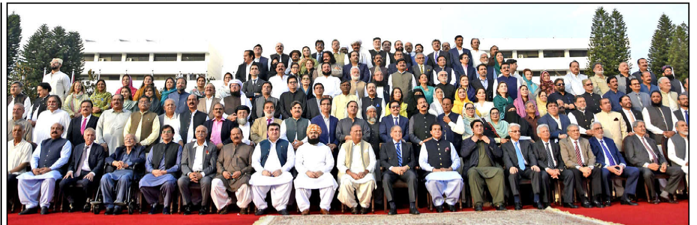
ISLAMABAD: Former Prime Minister Shehbaz Sharif is posing for a group photo graph along with Parliamentarians after attending the last Session of National Assembly in Federal Capital.

For the first time, they arranged a trilateral format among Pakistan, China and Afghanistan to make them realize the concerns of Pakistan and China regarding terrorism, he said, adding Minister of State Hina Rabbani Khar had also visited Afghanistan.