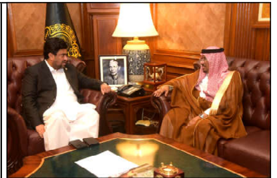
KARACHI: Newly appointed Consul General of Saudi Arabia meeting with Governor Sindh Kamran Khan Tessori.

ISLAMABAD (Online): Islamabad High Court (IHC) while rejecting chairman PTI plea for immediate suspension of his conviction in Toshakhana case has issued notice on the petition regarding suspension of conviction.