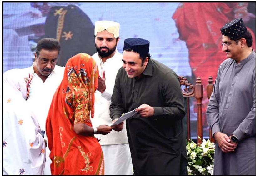
GHOTKI: Peoples Party (PPP) Chairman, Bilawal Bhutto Zardari giving ownership rights among flood affectedes during the inauguration ceremony of construction of houses for 82,746 flood victims under Sindh Peoples Housing for Flood Affectedes (SPHF) in Ghotki.