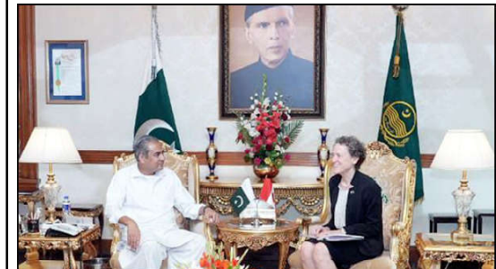
LAHORE: Canadian High Commissioner Ms. Leslie Scanlon meeting with Caretaker Chief Minister Punjab Mohsin Naqvi

during the campaign, more than 13 million saplings will be planted across the province. The chief minister was also informed that under the 10 billion tree project, the total area of forests in the province has been increased by 6.3 per cent. Speaking on the occasion, the chief minister lauded the efforts of Khyber Pakhtunkhwa forest and wildlife department in promoting tree plantation and their preservation adding that it is gratifying that the Forest Department is taking result-oriented steps under a comprehensive strategy to this effect.