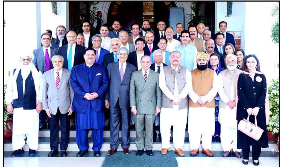
ISLAMABAD: Prime Minister Muhammad Shehbaz Sharif in a group photo with members of the Federal Cabinet.

premier was also asked for the formation of an interim government under Article 224 of the Constitution. The parliamentary affairs ministry will issue a notification on the approval of the summary and the formation of the caretaker government, he added. Meanwhile, PM Shehbaz and Leader of the Opposition in NA now have three days as per the Constitution to finalise a name for the caretaker prime minister.