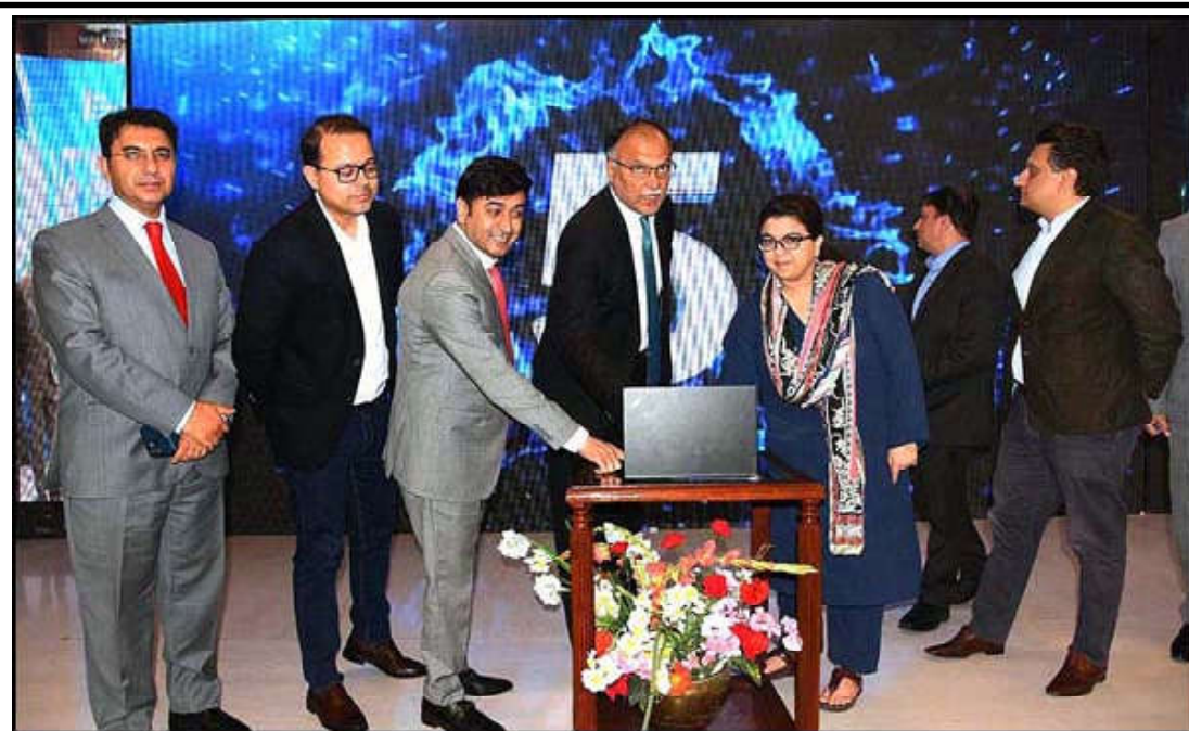
ISLAMABAD: Federal Minister for Planning, Development and Special Initiatives, Prof. Ahsan Iqbal along with Special Assistant to Prime Minister on Youth Affairs Shaza Fatima Khawaja launching Venture Capital Fund at Ministry of Planning.

ing and fastest-growing economies in the world in 10-15 years by ensuring peace, stability, and continuity of policies. "No country in the world has attained success in development without a decade of stability." Recounting the government's initiatives to match the technological changes taking place in the world, he said it established national centres for artificial intelligence, cyber security, big data cloud computing, automation and robotics. Besides, the minister said, a national centre for quantum computing had been set up laying a 'future foundation' for information technology infrastructure to contest the development pace at the international level.