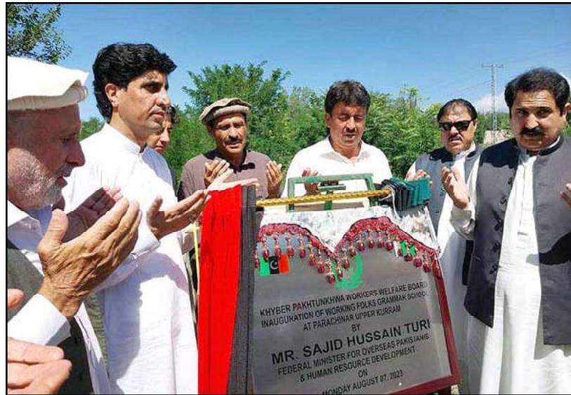
PARACHINAR: Federal Minister for Overseas Pakistani & HRD, Sajid Hussain Turi inaugurates Workers Folk Grammar School.

PID, Pakistan Television (PTV) and Associated Press of Pakistan (APP) had been restored here with his hectic efforts. He said that by inaugurating the PID regional office, another promise made to the local journalists has been fulfilled, adding, it was a good omen for the local journalist community. In this process, he said, Federal Minister for Information and Broadcasting Maryum Aurangzeb extended her full support. The special assistant said the caretaker government will hold its responsibilities within a few days.