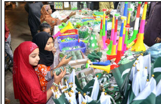
HYDERABAD: Children busy in purchasing bangles and other stuff at Latifabad road in preparations to celebrate Independence Day in befitting manners.