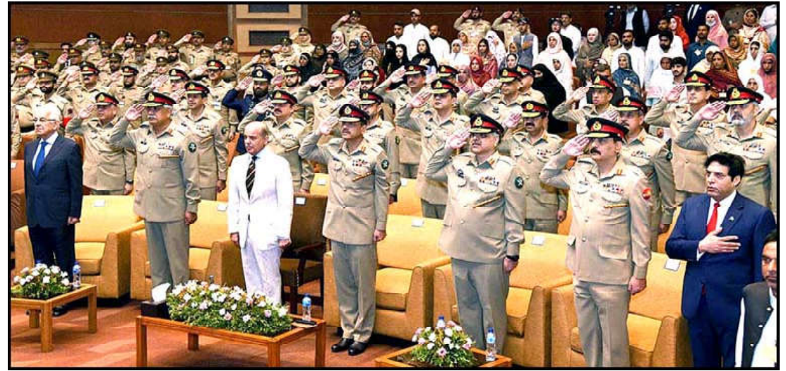
RAWALPINDI: Prime Minister Muhammad Shehbaz Sharif attends a ceremony to honor the Martyrs and Ghazis of Pakistan Army at General Headquarters.

A comprehensive plan was put in place for the progress and prosperity of the country by the incumbent government, he said, adding the Special Investment Facilitation Council (SIFC) had given that vision for the progress of Pakistan with the development of agriculture, minerals and IT sectors.