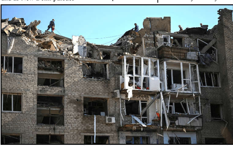
Rescuers work at a site of a building destroyed during a Russian missile strike, amid Russia's attack on Ukraine, in Pokrovsk, Donetsk region, Ukraine.

Monitoring Desk TOKYO: A meandering storm was headed again toward southwestern Japan on Sunday, prompting fresh warnings about dangerously heavy rainfall after the same area was hit several days ago. Tropical Storm Khanun, which means jackfruit in Thai, was returning to the southernmost group of islands of Okinawa moving slowly northward, packing winds of up to 30 meters per second (67 miles per hour) and hovering over Okinawa through Monday, according to the Japan Meteorological Agency. Okinawa Gov. Denny Tamaki warned residents to brace for torrential rains and mudslides. "This could mean that the dangers about to hit the area where you are living are unusual and on a scale you have never experienced," he said of the storm. He asked people to prepare escape routes to safety in advance. "Do not let your guard down," he said. Large parts of Okinawa, including the main city of Naha, was being slammed by extremely heavy rainfall, according to weather reports.