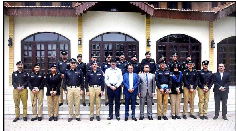
KARACHI: A group photo of Sindh chief Minister Syed Murad Ali Shah with newly promoted Police Officers, PSP, to grade BS-19.