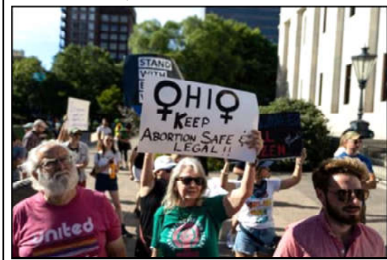
An abortion rights protester holds a sign that says "OHIO KEEP ABORTION SAFE LEGAL!" at a rally in Columbus, Ohio.

Monitoring Desk BANGKOK: The second-eldest son of Thailand's King Maha Vajiralongkorn visited a child-care centre for underprivileged families on Tuesday during a surprise visit to the kingdom, the first time he has been back in his homeland in 27 years. The trip by Vacharaesorn Vivacharawongse, 42, comes at a fraught time for the Thai royal family.