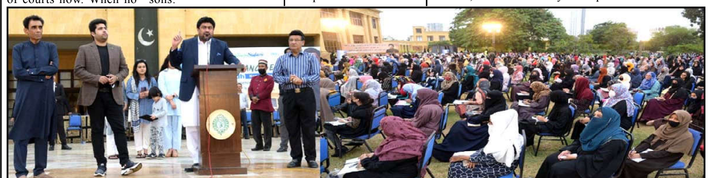
KARACHI: Sindh Governor Kamran Khan Tessori addressing youth participated in test held for IT courses. Convener MQM Dr. Khalid Maqbool Siddiqui is also present.

He said that this project is of utmost importance, so work is being done day and night and it will be completed soon.