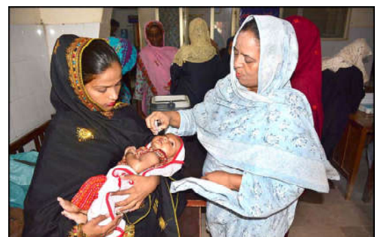
HYDERABAD: Health worker administering polio vaccine drops to a child during a Polio vaccination campaign at Bhitai Hospital.

Barrister Murtaza Wahab was told that 441 fake leases were issued in Maripur truck stand, of which 17 leases were cancelled by the High Court as a result of a case.