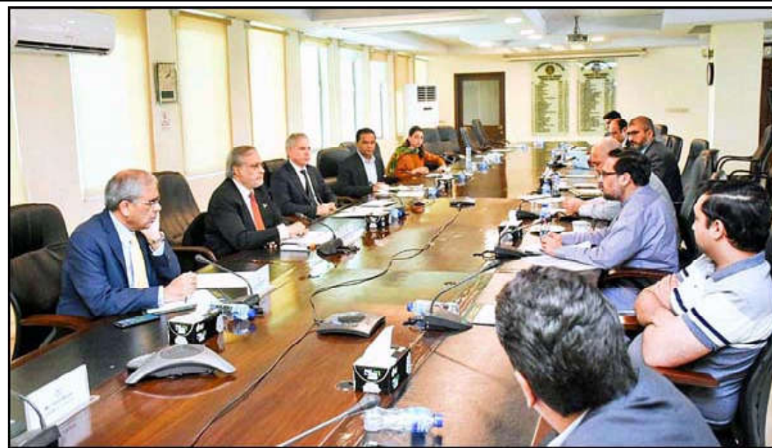
ISLAMABAD: Federal Minister for Finance and Revenue Senator Muhammad Ishaq Dar chaired the meeting of Steering Committee to oversee and guide the progress of work related to outsourcing of airports operations at Finance Division.

The visit of the Saudi delegation manifests the deep interest and willingness on both sides to transform the longstanding fraternal ties into concrete and mutually rewarding economic partnership. The visit will contribute to further enhancement of multifaceted collaboration between the two countries.