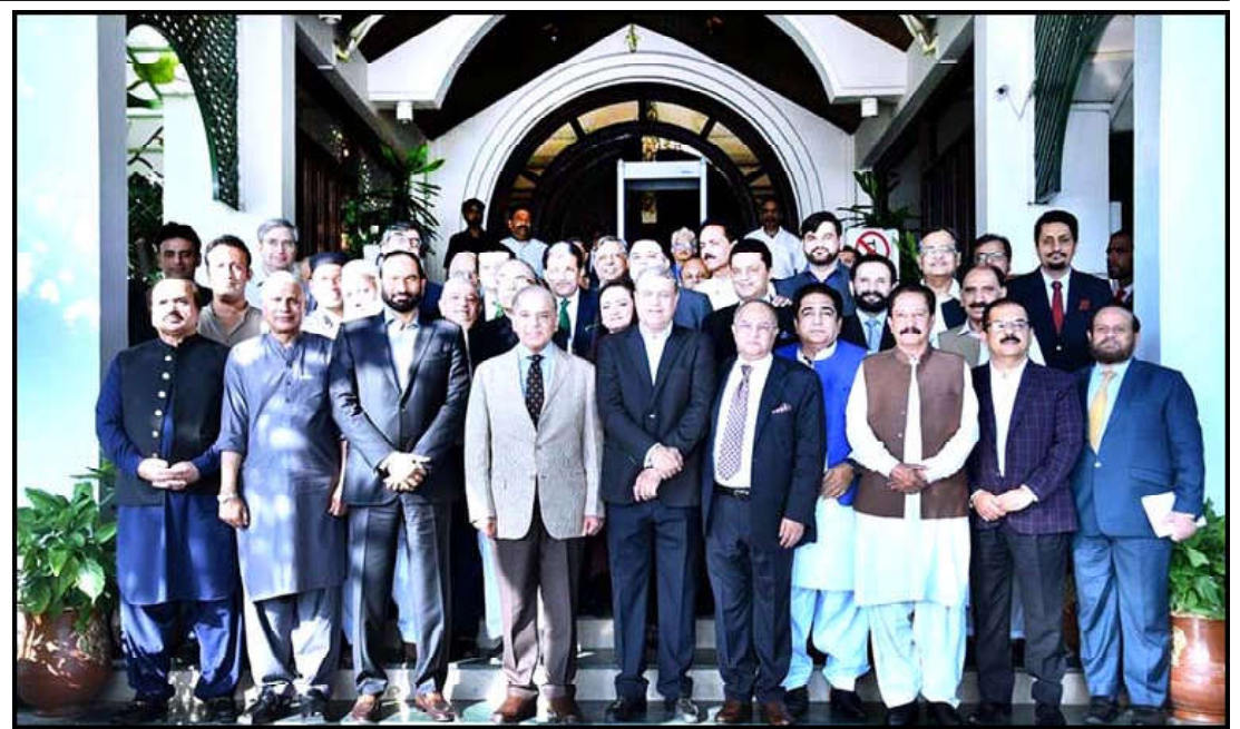
ISLAMABAD: Prime Minister Muhammad Shehbaz Sharif in a group photo with a delegation of Pakistan Broadcasters' Association, All Pakistan Newspapers Society and Council of Pakistan Newspaper Editors.

the incumbent government inherited very tough economic conditions but the coalition parties did not imagine the severity of the situation. The prime minister said the previous government wasted last four years in mere victimisation of political opponents and also strained ties with friendly countries. He said his government had tried its utmost to rectify the relations with friendly countries and had been able to control the damage to a great extent which also led