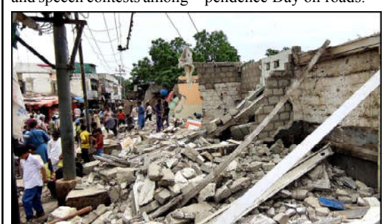
KARACHI: A view of Railway Colony after encroachment operation.

DC said that sapling would be planted at the DC office and other places to mark the day. No person or institution would be permitted to celebrate Independence Day on roads.