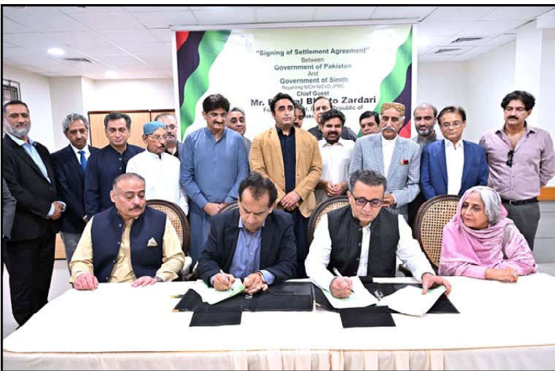
SUKKUR: The settlement agreement of Jinnah Post Graduate Medical College (JPMC) and Sindh Institute of Cardiovascular Diseases (SICVD) signed the MoU between Pakistan and Sindh Government. Chairman Pakistan People's Party and Foreign Minister Bilawal Bhutto Zardari, Federal Minister Syed Khurshid Shah, Federal Minister for National Health Services, Regulations, and Coordination Abdul Qadir Patel, Sindh Chief Minister Syed Murad Ali Shah, Health Minister Sindh Ezra Pechuho and others parents also.