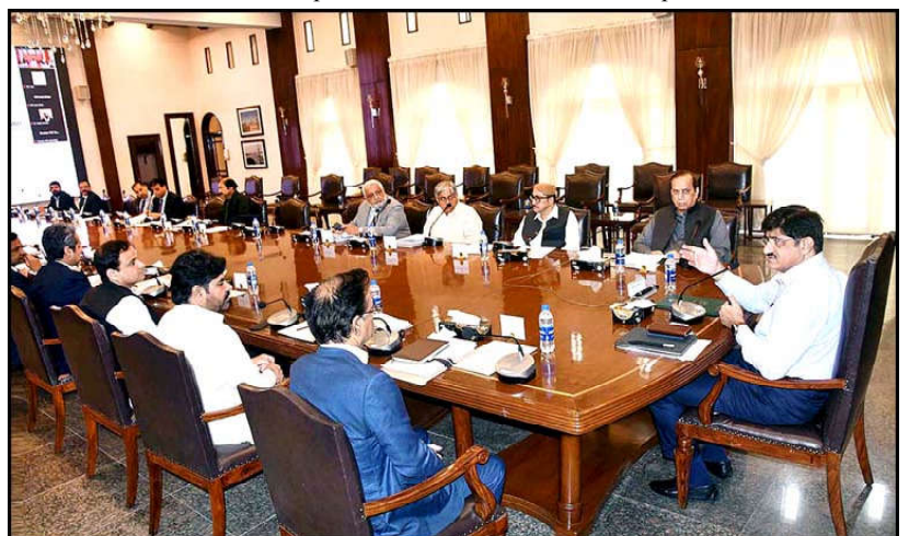
KARACHI: Sindh chief Minister Syed Murad Ali Shah presides over a 41st PPP Policy Board Meeting at CM House.

Earlier, Bilawal Bhutto Zardari also inaugurated the 200 bed Children's Hospital Sukkur.