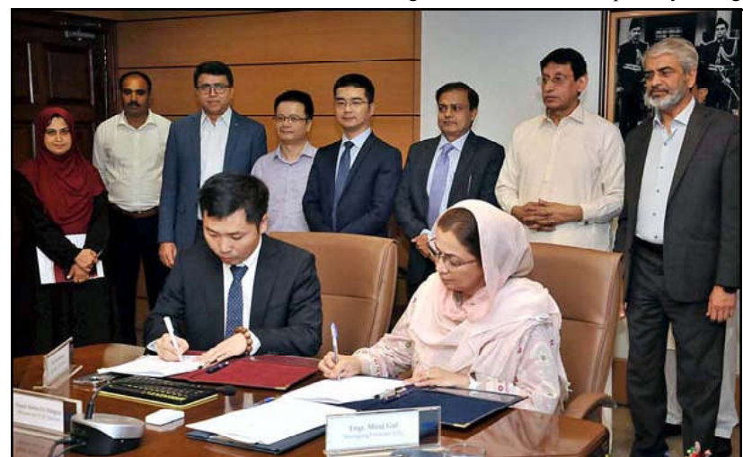
ISLAMABAD: Federal Minister for IT and Telecommunication Syed Amin Ul Haque witnessing signing of MoU between National Telecommunication Corporation (NTC) and Sunwalk.