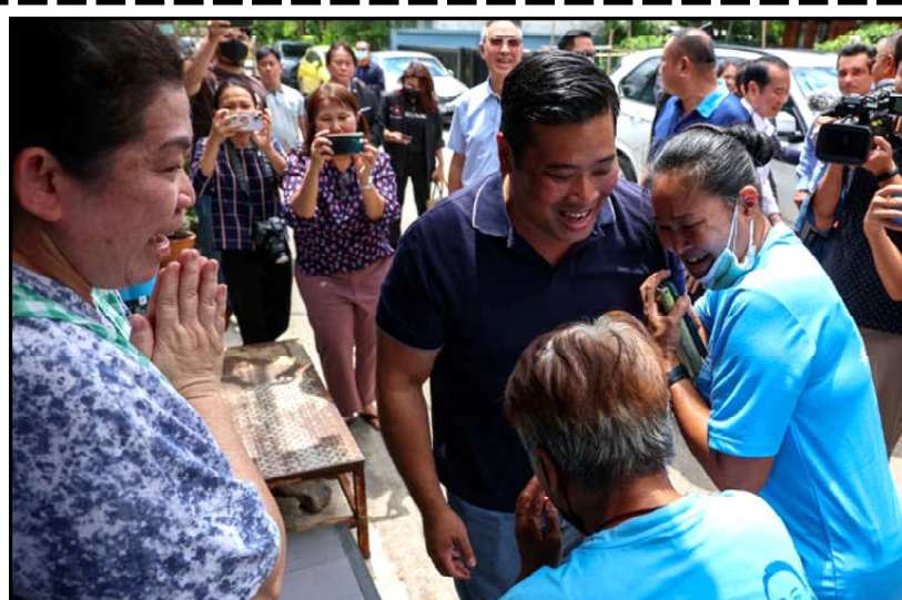
Vacharaesorn Vivacharawongse, 42, the second-eldest son of Thailand's King Maha Vajiralongkorn speaks to well-wishers at the Foundation for Slum Child Care supported by the Royal Family, in Bangkok, Thailand.

Monitoring Desk MOSCOW: Vladimir Putin, the Russian president, has ordered the head of a state-owned defence conglomerate to increase the production of attack drones, as the drone war in Ukraine ramps up. In televised footage of the meeting on Monday night, the Russian president was told by the head of Rostec, which produces around 90 per cent of Russia's military equipment, to increase the number of kamikaze drones being churned out. Putin said Russia needed more Kub and Lancet drones, which have be-