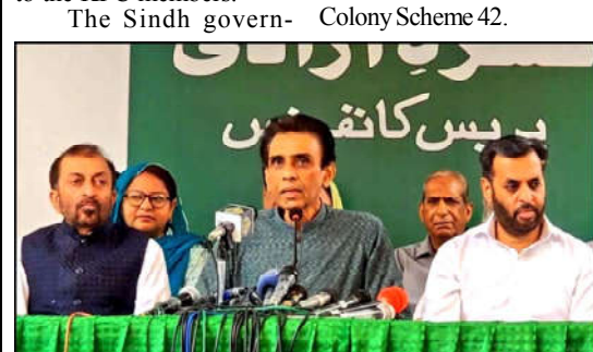
KARACHI: Muttahida Qaumi Movement (MQM-P) Convener, Dr. Khalid Maqbool Siddiqui along with others addresses to media persons during press conference, at Pakistan House in Karachi.

man of the committee was to consult with the President and Secretary of KPC before convening the first meeting of the committee. The participants of the meeting have decided to call the meeting of the committee in the next week, he said. The matter regarding steps for allotment of plots to the remaining KPC members, removal of encroachments from Journalist Colony Scheme 42.