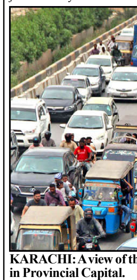
KARACHI: A view of the massive traffic jam at Old Vegetables Market Road in Provincial Capital.

KARACHI (INP): Karachi is witnessing yet another increase in sugar prices, causing concern among consumers and traders alike. The price of sugar has soared by Rs 8, bringing it to Rs 155 per kilogram. In the wholesale market, the impact has been significant, with a 100-kilogram bag of sugar witnessing a staggering increase of Rs 800 within just two days.