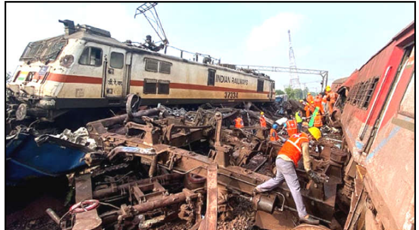
Rescue workers sift through wreckage at the accident site of a three-train collision near Balasore, about 200 km (125 miles) from the state capital Bhubaneswar.

Monitoring Desk STOCKHOLM: More than 50 people were injured and dozens detained in Stockholm on Thursday as clashes broke out at an Eritrean pro-government festival, police and health officials said, with anti-government protesters trashing property at the site. "Another public gathering took place close to the festival site, during which a violent riot broke out," police said, adding in a statement they had detained "around a hundred people".