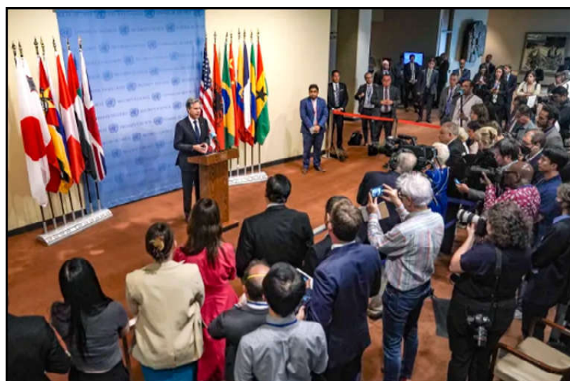
U.S. Secretary of State Antony Blinken stands at a podium as he holds a press conference, during a meeting of the United Nations Security Council where he presides as president.

targeted since the beginning of Moscow's military campaign in Ukraine more than a year ago, but attacks have increased in recent weeks. On Tuesday, Russia's defence ministry said it foiled a Ukrainian drone attack targeting patrol boats in the Black Sea. Three drones were trained on ships navigating in waters 340 kilometres southwest of Sevastopol, the base of Russia's Black Sea fleet in Crimea. A similar attack was repelled a week earlier. The ministry also said on Friday it had downed 13 drones over the Crimean peninsula. There were no casualties or damage in either attack, the ministry said.