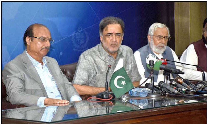
ISLAMABAD: Incumbent Advisor to Prime Minister on Kashmir Affairs, Qamar Zaman Kaira addresses press conference.

in record time, would prove to be a milestone for the country's self-reliance in aerospace technology. He said the Pakistan Air Force was pursuing the vision of Quaid-e-Azam Muhammad Ali Jinnah to achieve self-reliance. The project comprised three campuses with the first one housing private sector companies, second one featuring cyber, AI and IT companies, and the third one was meant for aircraft, space, sensors and Expo center, he added.