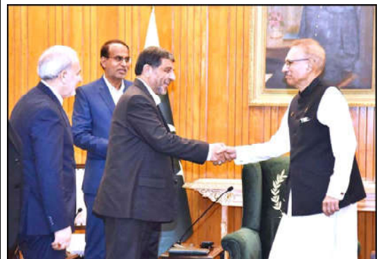
ISLAMABAD: President Dr Arif Alvi welcomes the Iranian Minister for Cultural Heritage, Tourism, and Handicrafts, Syed Ezzatollah Zarghami, at Aiwan-e-Sadr.

The court rejected the appeal for transfer of the criminal case to another court and said that as per the verdicts of the high courts in similar matters a case could only be shifted to the alternative court on the basis of solid reasons.