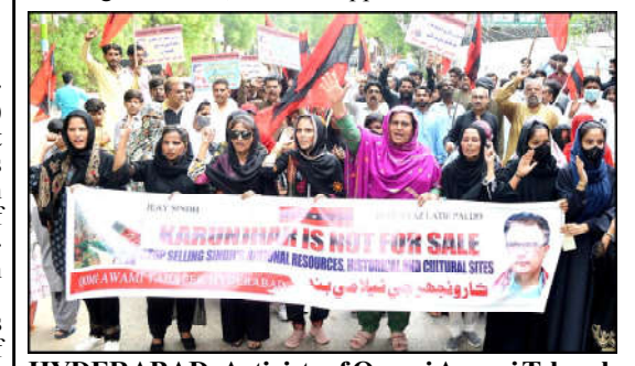
HYDERABAD: Activists of Qaumi Awami Tehreek a protest demanding stop cutting of Karoonjhar mountains outside HPC.