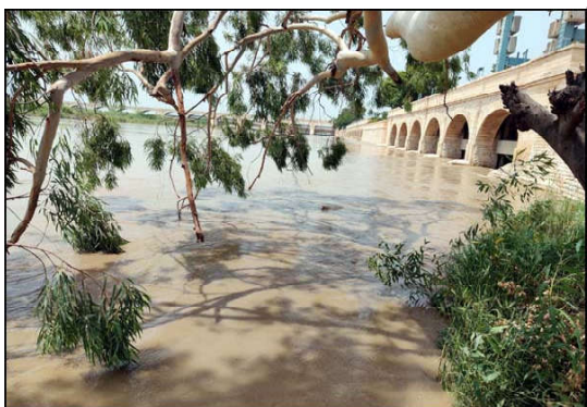
SUKKUR: Water level increases while high grade flood water reaches at Sukkur Barrage into River Indus due to heavy downpour of monsoon season, in Sukkur.

In response to inquiries about the Islamia University Bahawalpur incident, Chief Minister Naqvi said that a judicial commission will be formed and the Punjab government will submit a detailed report to the commission.