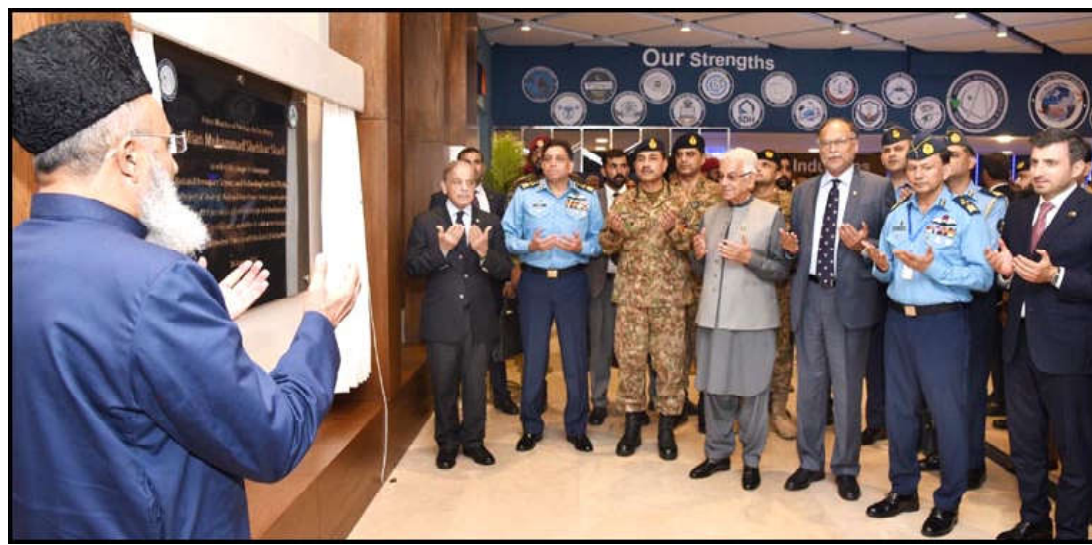
Prime Minister Muhammad Shehbaz Sharif along with Services Chiefs and Federal Ministers inaugurating National Aerospace Science and Technology Park in Rawalpindi.

Expressing her concern over the neglect of the just demands of BISP employees, Shazia Marri noted that their hard work often went unnoticed.