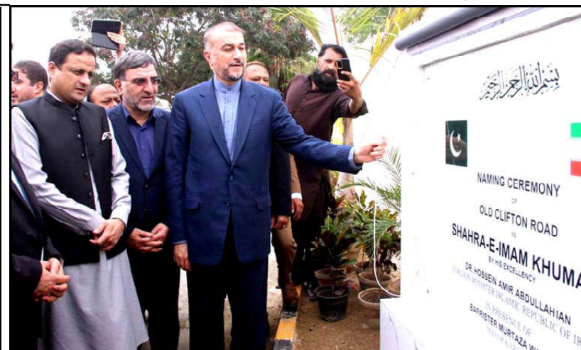
KARACHI: Karachi Mayor Barrister Murtaza Wahab, along with Iranian Foreign Minister Dr. Hossein Amir-Abdollahian, unveils a plaque designating the Old Clifton Road as "Shahra-e-Imam Khumani".

The flags of Pakistan and Kashmir will also be hoisted together at prominent places in the metropolis.