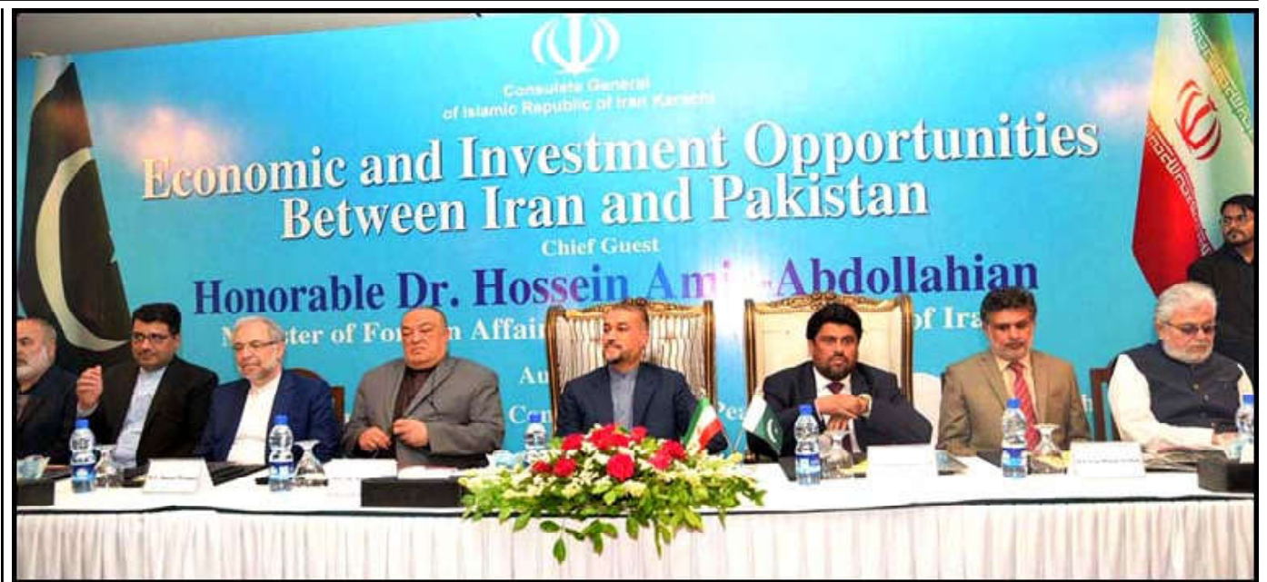
KARACHI: Sindh Governor Kamran Khan Tessori participates in a conference on "Opportunities and Challenges of Economic Relations between Iran and Pakistan".

formance-based Challenge Fund aims to address the issue of out-of-school children and promote early childhood education initiatives across the country. The fund encourages collaboration between the Ministry of Planning, Development, and Special Initiatives, and the Ministry of Federal Education and Professional Training to facilitate innovative programs and projects for enhancing educational opportunities. "This is a historic opportunity for us to collaborate and invest in the future of our nation," he said, adding "Through this challenge fund, we are determined to make a significant breakthrough in the education sector, ensuring that every child in Pakistan has access to quality education." The ceremony concluded with optimism and a sense of collective responsibility as the government, education experts, and stakeholders pledged to work hand in hand to overcome educational challenges and empower the young generation of Pakistan.