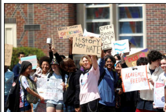
Students stage a walk out from Hillsborough High School to protest after Florida education officials voted to ban classroom instruction on gender identity and sexual orientation in all public school grades, expanding on a law signed by Republican Governor Ron DeSantis that barred such lessons for younger students and was derided by critics as the "Don't Say Gay" bill in Tampa, Florida, U.S.

The House received the resolution, which aims to foster better understanding and respect for the Islamic faith within American society, on July 28 and referred it to the House Committee on Foreign Affairs.