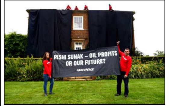
Greenpeace activists hold a banner while others cover British Prime Minister Rishi Sunak's £2m manor house in oil-black fabric in protest of his backing for a major expansion of North Sea oil and gas drilling amidst a summer of escalating climate impacts, in Yorkshire, Britain.

attack. "These are the very ports that have become the foundation of global food security today," he said. The port, across the river from Nato-member Romania, is the main alternative route out of Ukraine for grain exports, since Russia's blockade halted traffic at Ukraine's Black Sea ports in mid-July. Video released by the Ukrainian authorities showed firefighters on ladders battling a huge blaze several stories high in a building covered with broken windows. Several other large buildings were in ruins, and grain spilled out of at least two wrecked silos.