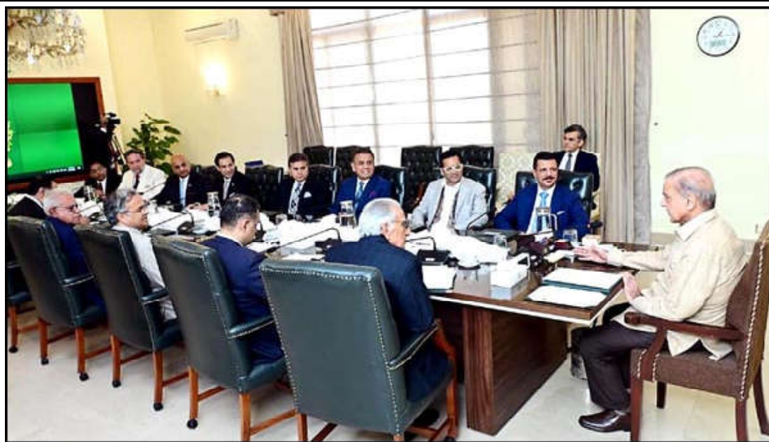
ISLAMABAD: A group of prominent Pakistani-American businessmen and entrepreneurs call on Prime Minister Muhammad Shehbaz Sharif.

He said the purpose of establishing the SIFC was to provide a one-window facility to the potential investors.