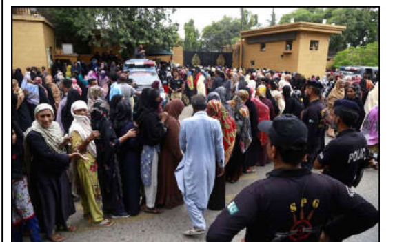
KARACHI: Needy people are gather in a queue for getting rations provided by Governor Sindh Kamran Tessori among family members of martyred and orphans due to price hiking in country, at Governor House in Karachi.