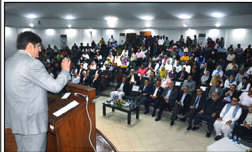
KARACHI: Sindh Chief Minister Syed Murad Ali Shah speaks at ChildLife Foundation program to celebrate the expansion of Telemedicine network to 100 hospitals of every tahsil of the province at Dr. Ruth K. M. Pfau Civil Hospital Karachi, Sindh.

Sindh government sources said that the government has considered over three names for the caretaker chief minister's office and these names will be presented to the party leadership.