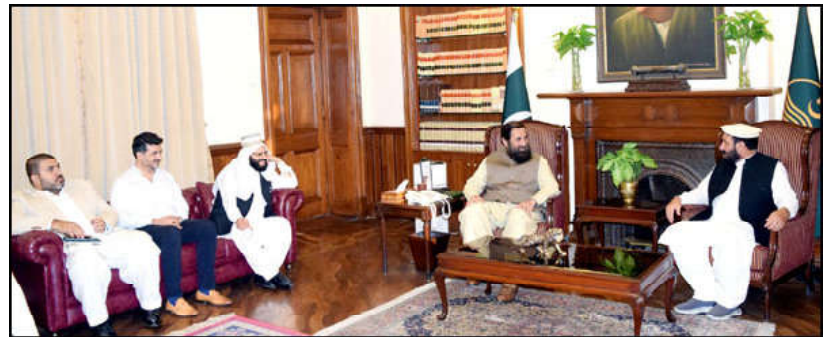
LAHORE: A delegation led by Member National Assembly from North Waziristan, Nazir Khan, meeting with Governor Punjab Muhammad Balighur Rehman at Governor House.

to be aware food handlers regarding personal hygiene and safe food preparation. The director general said that the purpose of the PFA is to bring reforms in food industry. All resources will be utilized to ensure the availability of safe, quality and standard food to the people. Despite the awareness, strict action will be taken against those FBO who sell substandard food, he added.