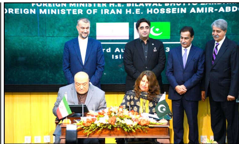
Foreign Minister Bilawal Bhutto-Zardari and Iran Foreign Minister Hossein Amir-Abdollahian witnessing signing of memoranda of understanding between Pakistan and Iran in Islamabad.

The AGP further said that the army is equipped to fire bullets. "It is not possible that if they are attacked, they first approach an SHO to lodge a formal complaint."