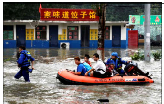
Rescue workers from Shanxi province evacuate people through floodwaters with a boat after the rains and floods brought by remnants of Typhoon Doksuri, in Zhuozhou, Hebei province, China.

China does not announce when leaders go on holiday but typically indicates the start of their vacation with an announcement about meeting experts. Leaders then disappear from public view for about two weeks. It is unclear if Qin, who would be qualified to holiday at Beidaihe with the leadership since he retains the title of state councillor, will turn up. Qin has not been seen in public since June 25. One of Xi's last tasks before going on vacation was to instruct emergency responders to work harder at rescuing those affected by floods battering northern China as a result of Typhoon Doksuri.