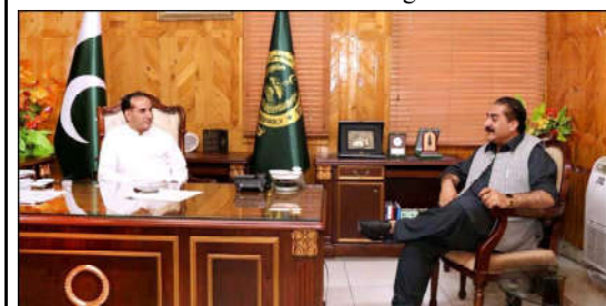
GILGIT: Speaker Gilgit-Baltistan Assembly Nazir Ahmad Advocate in a meeting with Minister Home Gilgit-Baltistan Shams Lone at Assembly Secretariat.

unwavering dedication to safeguarding public health and providing swift assistance during crises. Motorbike ambulances have emerged as invaluable assets for delivering critical medical aid, particularly in areas with challenging terrains or limited accessibility. These agile and well-equipped vehicles will empower Rescue 1122 first responders to navigate rugged landscapes and swiftly reach remote communities, drastically reducing response times in life-threatening situations. Equipped with essential medical tools such as a backpack, pulse oximeter (CE/FDA), BP apparatus, cervical collar, nebulizer, glucometer, portable oxygen cylinder set, tourniquets, digital clinical ear thermometer, silicon Ambo bags, CPR mask, and dressing scissor.