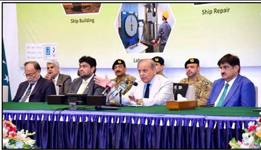
ISLAMABAD: Prime Minister Muhammad Shehbaz Sharif addresses a meeting organized by Karachi Chamber of Commerce and Industries (KCCI).

equitable distribution of electricity and gas. With constitution of the Special Investment Facilitation Council (SIFC), he said, huge foreign investment would be secured. The prime minister, during the meeting, directed the State Bank and Federal Board of Revenue to resolve the business community's issues with their cooperation. He assured that the government would provide electricity to the traders in Karachi at similar rates.