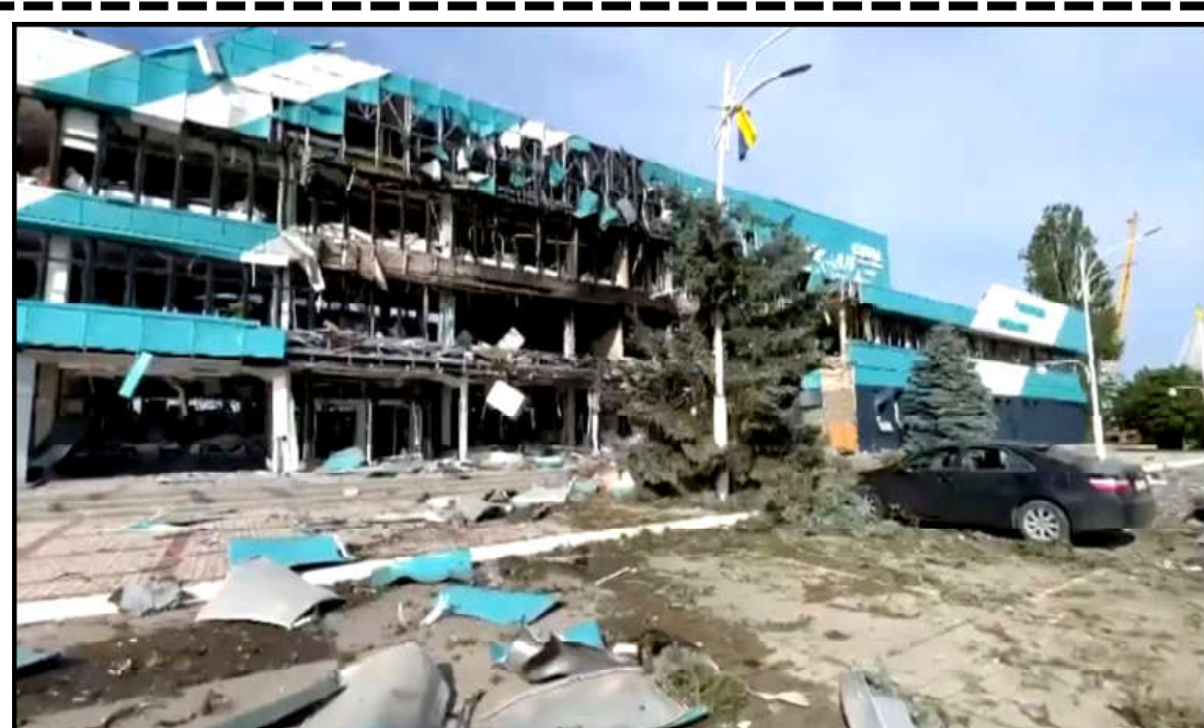
A general view of damaged property, following a Russian drone attack, amid Russia's attack on Ukraine, at Izmail, Odesa region, Ukraine.

visit Turkey, it said. A senior Turkish official said that discussions between Ankara and Moscow were ongoing for a visit in late August. Earlier on Wednesday, Russia attacked Ukraine's main inland port on the Danube River, sending global food prices higher as Moscow ramps up its use of force to reimpose a blockade of Ukrainian grain exports. The port, across the river from NATO-member Romania, has served as the main alternative route out of Ukraine for grain exports since Russia reintroduced its de facto blockade of Ukraine's Black Sea ports in mid-July.