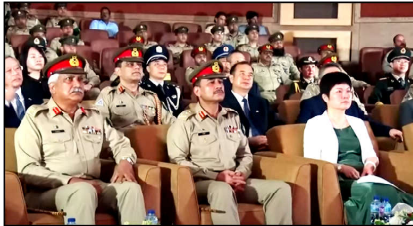
ISLAMABAD: Chief of Army Staff (COAS), General Syed Asim Munir attending 96th anniversary of the founding of the People's Liberation Army (PLA) of China commemorated at General Headquarters (GHQ).

The prime minister said that Pakistan and Turkiye were tied with the commonality of faith, heritage and civilisation with both sharing perspectives on regional and global issues. Referring to the tremendous support by the people of the subcontinent during Khilafat Movement, the prime minister said the bilateral ties predated the establishment of Pakistan.