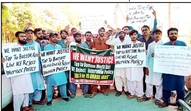
LARKANA: Candidates who passed the IBA Sukkur test for Grade 5 to 15 grade government jobs are holding protest demonstration against the grading policy and interview call, held in Larkana.

LAHORE (APP): At least twelve people were killed while 1153 injured in 1120 road accidents in all 37 districts of Punjab during the last 24 hours. Of whom, 614 people with serious injuries were shifted to different hospitals, while 539 people with minor injuries were treated on the spot by Rescue Medical Teams. Analysis show that 553 drivers, 30 underage drivers, 127 pedestrians, and 485 passengers.