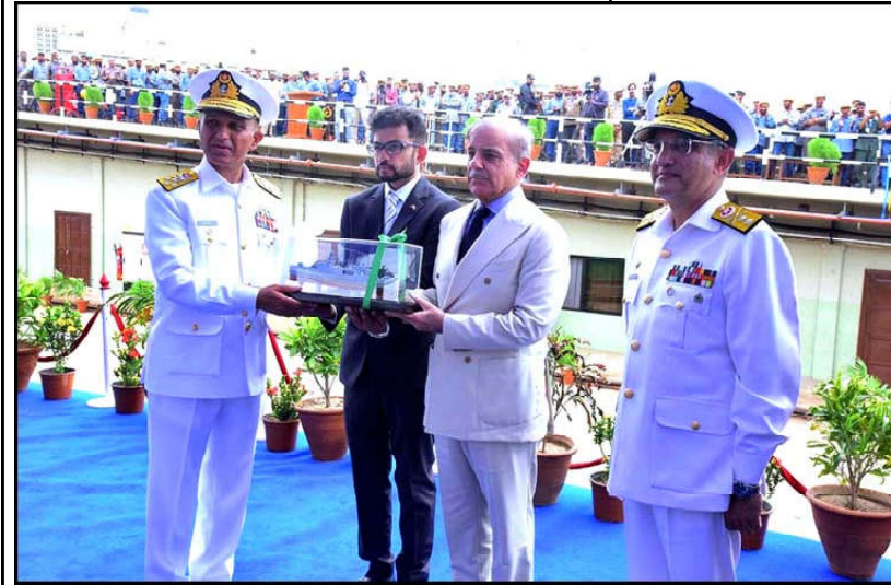
KARACHI: Chief of Naval Staff Admiral Muhammad Amjad Khan Niazi presenting a model of a ship to Prime Minister Muhammad Shehbaz Sharif during the launching ceremony of PNS Tariq.

"This all-weather strategic cooperative partnership between China & Pakistan has stood the test of the time and change of international landscapes", the Chinese Charge d'Affaires remarked. "China & Pakistan have just jointly celebrated the 10th anniversary of the launch of CPEC and in the past months, COAS and other military leaders paid successful visits to China, which has strongly promoted the relationship between the two militaries", the Chinese Charge d'Affaires endorsed.