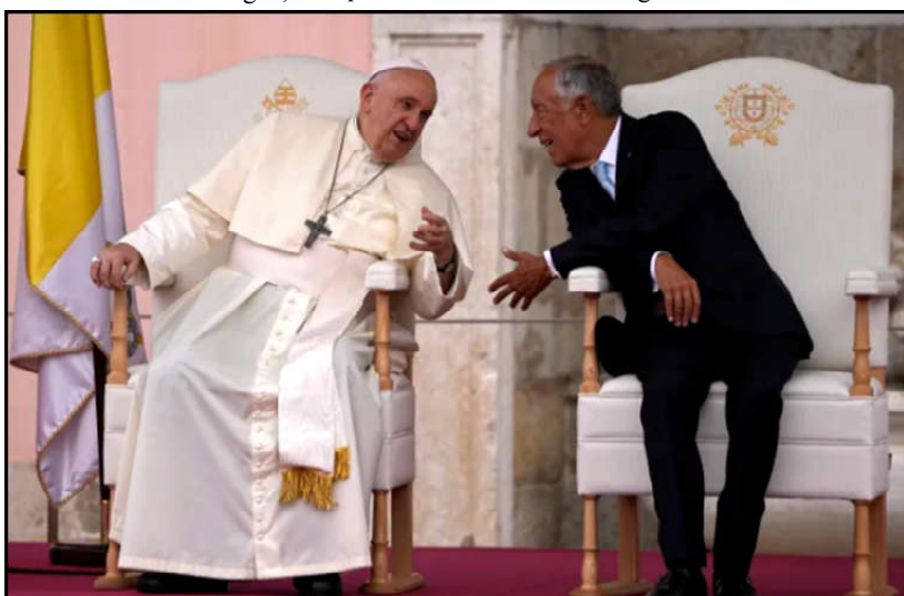
Pope Francis and Portugal's President Marcelo Rebelo de Sousa, right, converse at the Welcome Ceremony at the Belem presidential palace in Lisbon.