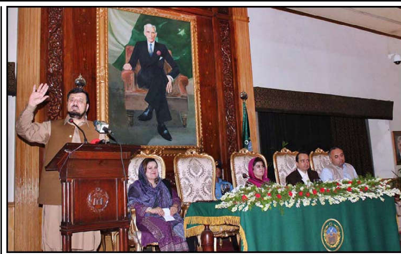
PESHAWAR: Governor Khyber Pakhtunkhwa Haji Ghulam Ali addressing during Women Excellence Award 2023 ceremony at Governor House.

floor cleaners, and air conditioning lies within the government's domain, he said and added creating a clean and conducive work environment for doctors was also the government's responsibility. Mohsin Naqvi shared an incident he witnessed at a hospital in Multan where five children were being treated on a single bed. He made it clear that it was not the fault of the doctor but rather a testament to the dedication of doctors who worked diligently to treat multiple patients under challenging circumstances. He expressed gratitude to doctors for their unwavering commitment despite the unfavorable conditions in hospitals.