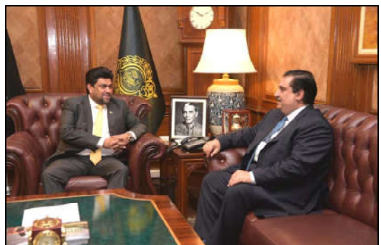
KARACHI: Federal Minister for Energy Khurram Dastagir meeting with Sindh Governor Kamran Khan Tessori at governor house.

"We cannot interfere in proceedings of trial court at this time. Let Islamabad High Court (IHC) decide. Possibility is there high court gives order for stopping trial tomorrow, the SC further remarked. The matter came up for hearing before a 3-member bench of SC presided over by Justice Yahya Afridi Wednesday.