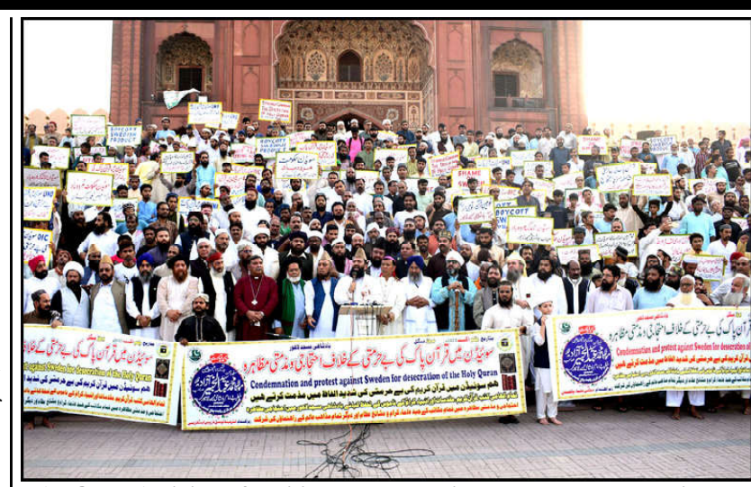
LAHORE: Activists of Majlis-e-Ulema Pakistan hold a protest against the burning of the Quran in Sweden, at Badshahi Mosque in Provincial Capital.