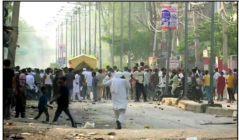
Communal clashes in Nuh, Haryana, during VHP procession. Anjuman Masjid set ablaze; 3 injured, 1 deceased, 2 home guards killed, dozen cops injured.

Monitoring Desk BEIRUT: The head of powerful armed group Hezbollah called on Tuesday for a halt to days of deadly clashes that have raged between rival factions in the Palestinian camp of Ain el-Hilweh in southern Lebanon. At least 11 people - most of them militants - have been killed in the camp since fighting broke out on Saturday between mainstream faction Fatah and hardline Islamists, security sources in the camp told Reuters. "This fighting must not continue because its repercussions are bad - for the camp's residents, for the dear Palestinian people... for the south, for all of Lebanon," Sayyed Hassan Nasrallah said in a televised address. The United Nations agency for Palestine refugees (UNRWA) said at least 2,000 people have fled their homes in the camp and UNRWA activities were suspended due to the violence. Negotiations between the rival factions have led to brief suspensions of fighting but have failed to secure a lasting ceasefire, with heavy clashes resuming on Tuesday. Hezbollah, which controls southern Lebanon and is vehemently opposed to Israel, has ties to Palestinian factions and supports their cause.