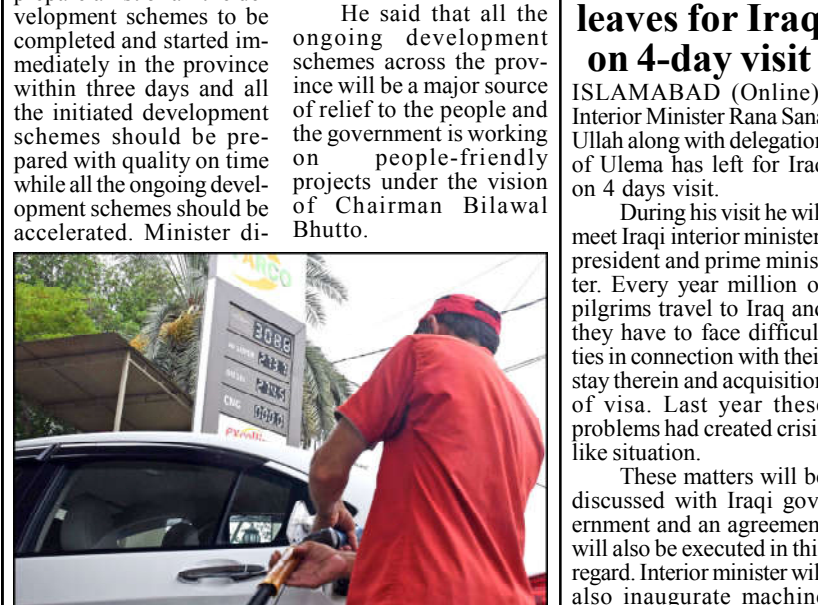
KARACHI: worker pumps petrol in a car at a fuel station, in Provincial Capital.

rects SBCA officials in the meeting said that plots should be allocated exclusively for the martyrs while the one-window operation system established for the public in the SBCA office should be further improved. He said that Chairman Bilawal Bhutto's vision is to provide all possible relief and facilities to the people on behalf of the government. All government institutions are taking practical steps to provide relief to the people according to the vision of Chairman Bilawal Bhutto Zardari. He said that all the ongoing development schemes across the province will be a major source of relief to the people and the government is working on people-friendly projects under the vision of Chairman Bilawal Bhutto.