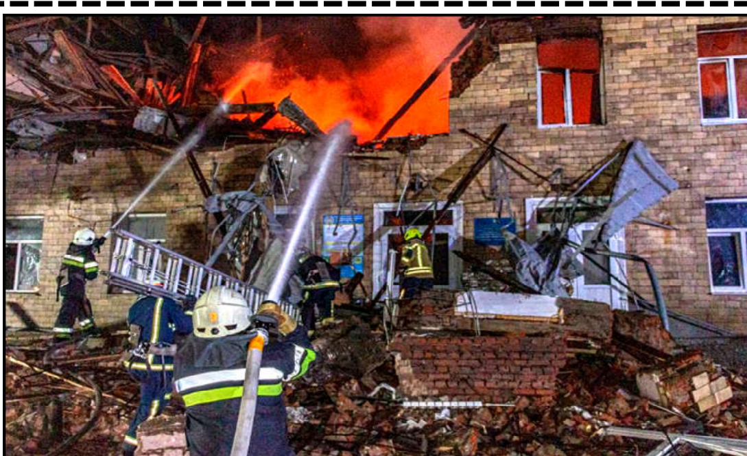
Rescuers work at a site of a building damaged by a Russian drone strike, amid Russia's attack on Ukraine, in Kharkiv, Ukraine.