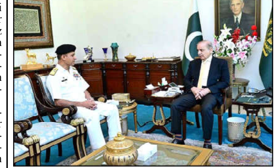
ISLAMABAD: Chief of Naval Staff Amjad Khan Niazi calls on Prime Minister Muhammad Shehbaz Sharif.

tribution, and shared benefits, and have achieved a number of early harvests. This has added new impetus to the economic and social development of Pakistan and laid a good foundation for regional connectivity and integration, he said, adding that it is a vivid testament to the all-weather friendship between China and Pakistan, and provides an important underpinning for building an even closer China-Pakistan community with a shared future in the new era. Stressing that China and Pakistan will continue to improve overall planning and expand and deepen cooperation, Xi said no matter how the international landscape may change.