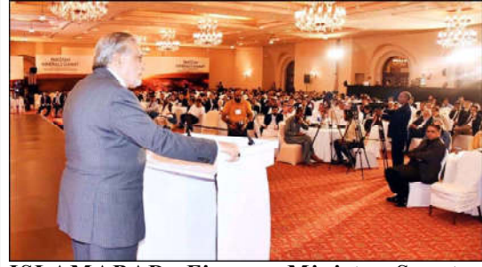
ISLAMABAD: Finance Minister Senator Mohammad Ishaq Dar addressed the closing session of Pakistan Minerals Summit "Dust to Development: Investment opportunities in Pakistan".

These centers would be established in different universities in Pakistan. Among them are National Center for Quantum Computing Lahore University of Management Sciences Lahore, Ghulam Ishaq Khan Institute of Engineering Sciences and Technology University of Engineering and Technology, Karachi and Institute of Computer Science, University of Engineering and Technology Lahore.