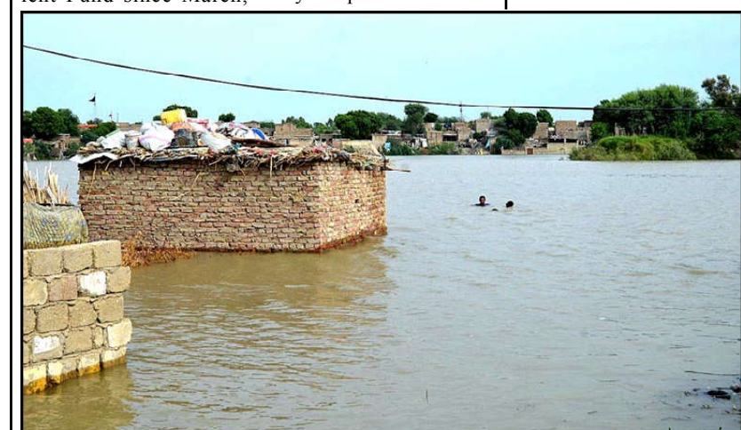
HYDERABAD: Flood water entered houses in kacha area at Saharash Nagar near Indus River.

2019 despite her persuasion and requested intervention. The complaint was admitted and assigned to Regional Director, Mirpurkhas who persuaded the matter with concerned authorities. In response, the Administrative Officer, Benevolent Fund Board, Karachi, requested for provision of certain documents, which were provided by the lady complainant.