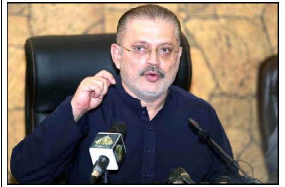
KARACHI: Sindh Minister of Information, Transport, and Mass Transit, Sharjeel Inam Memon addresses to media persons during press conference held in Karachi.

Qambar-Shajidskot, Dadu, Naushehro Feroze and Shikarpur while the same will be given to the people of district Khairpur on Wednesday. The housing documents would be distributed among people of Badin, Shaheed Benazirabad, Matiari and Jamshoro in the coming days, the minister said. He said the routes of newly launched electric buses will cover more than 50 kilometer distance from Malir Cant to Numash and from Malir Halt to Sadar via Landhi, Korangi respectively. Sindh government has empowered women in all sector of the society by giving them equal rights, Sharjeel said, adding that People's party always care for the women and it gave equal representation to women in every sector of the society. He said provincial government had decided to give ownership rights to shelter people who had lost their houses during floods and on one be allowed to undo the decision taken by PPP government.