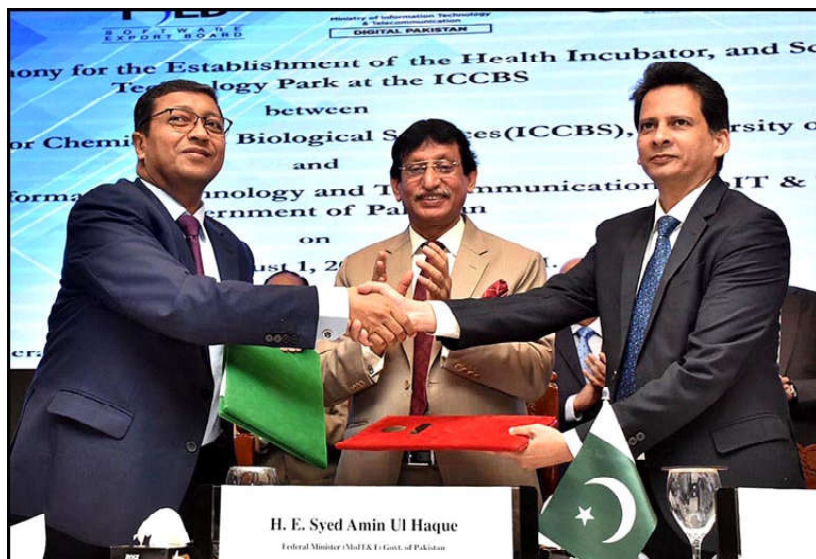
KARACHI: Federal Minister for IT and Telecommunication Syed Amin Ul Haque witnesses the MOU Signing Ceremony for the Establishment of the Health Incubator and Science Technology Park at the ICCBS between Ministry IT and Telecommunication ICCBS University of Karachi.

country in the last 75 years. We were hesitant due to some cartel or political reason. He underlined we should work for public interest and against the poverty. Today is a propitious day, he said adding nature has bestowed natural resources worth trillion dollars on Pakistan. We did not pay attention to natural wealth during the last 75 years. We did injustice to Pakistan during the last 75 years, he observed. We did injustice with its poor people and we did not pay their right to them.