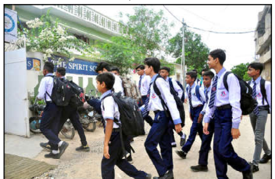
KARACHI: Students arrives in their school after long summer vacation, in Provincial Capital.