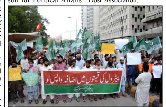
KARACHI: Activists of Markazi Muslim League (PMMI) are holding protest demonstration against the issues of inflation, unemployment, and hike in the prices of gas, electricity, petrol, and other essential commodities, at Karachi press club.