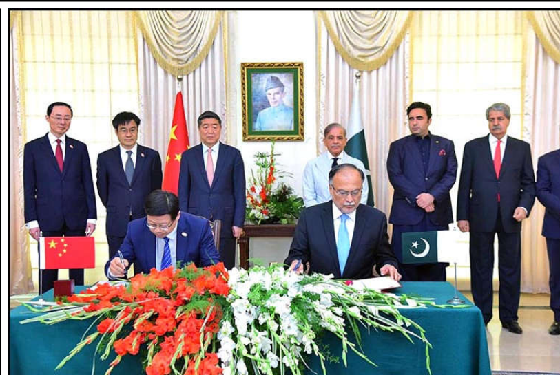
ISLAMABAD: Prime Minister Muhammad Shehbaz Sharif and Vice-Premier of State Council of China He Lifeng witnessing the signing ceremony of agreements/MoUs regarding cooperation between the two countries in various fields.

The ceremony was attended by Special Envoy of President Xi Jinping, Vice Premier of China and Member of the Politburo of the Central Committee of the Communist Party, He Lifeng, the ministers, members of the Chinese delegation, parliamentarians, chief ministers, senior officials and relevant authorities.