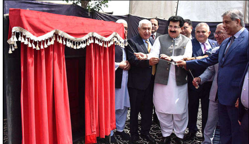
ISLAMABAD: Chairman Senate, Muhammad Sadiq Sanjrani, president of the Inter-Parliamentary Union (IPU), Duarte Pacheco and Federal Minister for Law and Justice, Senator Azam Nazeer Tarar inaugurating the ground breaking ceremony of the Permanent Headquarter of International Parliamentarians' Congress (IPC) at Diplomatic Enclave.