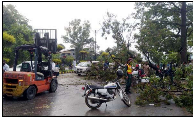
RAWALPINDI: Commuters pass near fallen tree due to heavy downpour of monsoon season while rescue operation underway, in Rawalpindi.

heinous act that can't be justified at all," he remarked. While paying tribute to the martyrs, the chief minister said that citizens of Khyber Pakhtunkhwa especially tribal people and our security forces have rendered matchless sacrifices for reinstating and establishing peace in the region; we will not let those sacrifices go in vain, he said. Meanwhile, the chief minister also met the elders of district Bajaur and heirs of the martyrs and expressed his heartfelt sympathies over the irreparable loss of human lives. He prayed for the higher ranks of martyrs and early recovery of the injured ones.