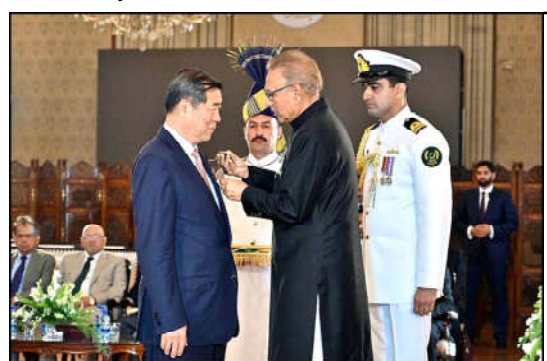
ISLAMABAD: President Dr. Arif Alvi conferring the award of Hilal-i-Pakistan upon the Special Representative of the Chinese President Xi Jinping and the vice-Premier of the State Council of China, Mr. He Lifeng, at a special investiture Ceremony held at Aiwan-e-Sadr.