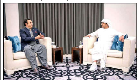
Speaking on the occasion, Bilawal said he was pleased to meet with Abdullah.

ABU DHABI (INP): Foreign Minister (FM) Bilawal Bhutto Zardari, who is presently on an official visit to the United Arab Emirates (UAE), met with his counterpart Abdullah bin Zayed Al Nahyan.