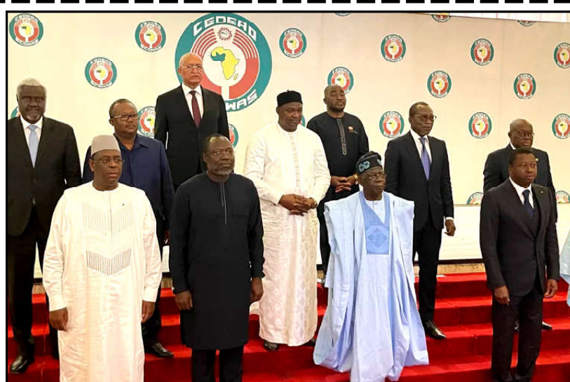
Nigeria President, Bola Ahmed Tinubu, second from left, poses for a group photograph with other West Africa leaders after a meeting in Abuja Nigeria.

The dead included a 10-year-old girl and her mother, according to Zelensky. More than 350 people were involved in the rescue operation, he said in a Telegram post. The morning attack also destroyed part of a four-story university building.