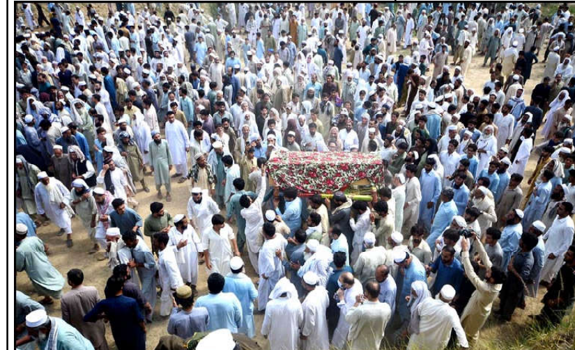
BAJAUR: People attend the funeral of the victims of a bomb explosion in Bajaur, Pakistan, 31 July 2023. At least 44 people were killed and dozens were injured in a suicide bomb attack that targeted a workers' convention of the Islamic political party Jamiat Ulema-e-Islam (JUI-F) in Khar.

KARACHI (INP): A Karachi man opened fire on his sister and brother-in-law for marrying of their own free will in the city's Pehalwan goth, police said on Monday.