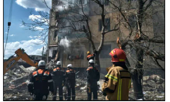
Emergency services work at a scene after a missile hit an apartment building in Kryvyi Rih, Ukraine.

Monitoring Desk ANKARA: Turkey's Foreign Minister Hakan Fidan on Sunday urged Sweden to take concrete steps to prevent burnings of the Quran, a Turkish foreign ministry source said. Sweden and Denmark have seen several protests in recent weeks where copies of the Quran have been damaged or burned, causing outrage among Muslims. Sweden's embassy in Baghdad was stormed and set ablaze by angry protesters. In a phone call, Fidan told his Swedish counterpart Tobias Billstrom that continuation of such "vile actions" under the guise of freedom of expression was unacceptable, the source said. Fidan and Billstrom also discussed Sweden's NATO military alliance membership application, the source added. Swedish Prime Minister Ulf Kristersson said on Sunday that he had held talks with Danish Prime Minister Mette Frederiksen and that they agreed the situation was dangerous. "We need to take measures to strengthen our resilience," he said in a post on Instagram. The Swedish government said this month that it would examine whether it could change Sweden's Public Order Act to give police the possibility to stop demonstrations that threatened Sweden's security.