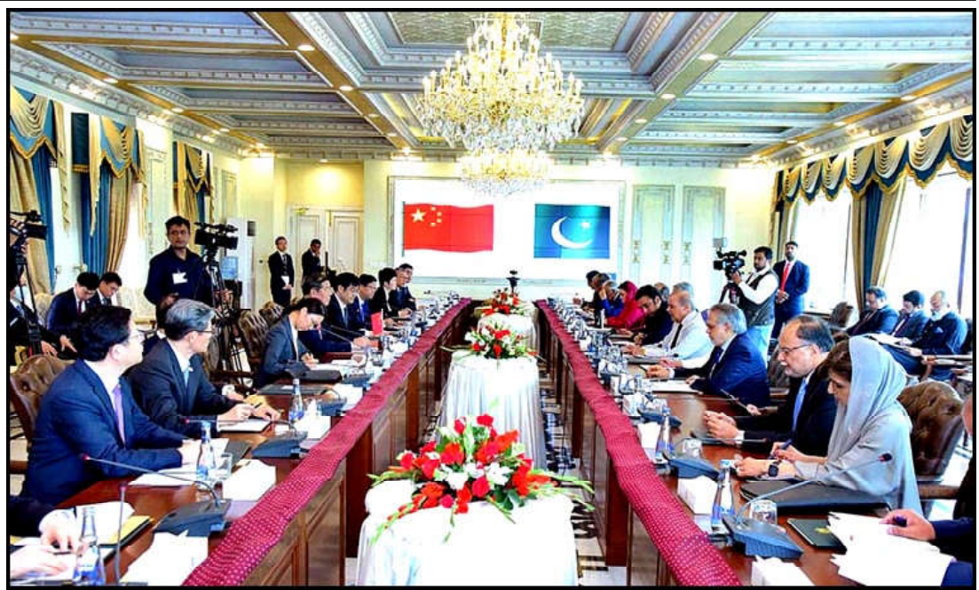
ISLAMABAD: Prime Minister Muhammad Shehbaz Sharif and Vice-Premier of State Council of China, He Lifeng in delegation level talks at Prime Minister's Office.

Council of China, Mr He Lifeng, who along with members of his delegation called on him, at Aiwan-e-Sadr, today. Welcoming the delegation, the President highlighted that Pakistan and China enjoyed an All-Weather Strategic Cooperative Partnership and always stood by each other in difficult times. He added that Pakistan and China had a unique relationship and the world must learn from the time-tested friendship between the two brotherly countries. He appreciated that bilateral relations between the two countries had continued to expand to new areas of cooperation.