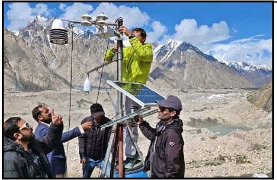
GILGIT: In the collaboration of EPI Gilgit-Baltistan, KIU, UOB, and University of Mallaan EvK2CNR successfully installed the Automate Weather Station in Askoli, Urdas and Candodia.

LAHORE (Online): Islamic University Bahawalpur is an educational institution wherein the scandal of obscene videos has surfaced. Chief security officer of the university was arrested in obscene videos scandal. It has been prayed in the petition that the matter is very sensitive, therefore, the court should order to constitute JC or tribunal to inquire into the matter. The court itself should monitor the inquiry of this scandal.