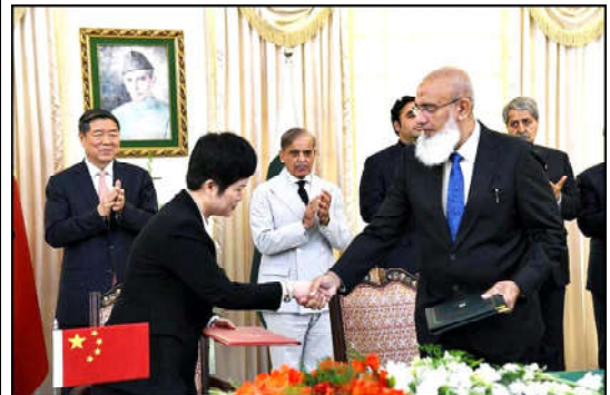
ISLAMABAD: Prime Minister Muhammad Shehbaz Sharif and Vice-Premier of State Council of China He Lifeng witnessing the signing ceremony of agreements/MoUs signed between the two countries in various fields.