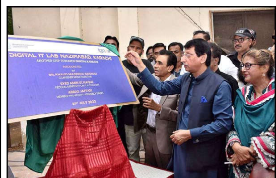
KARACHI: Federal Minister for IT & Telecom Syed Amin-ul-Haq and Former Minister and Convener MQM Pakistan Khalid Maqbool Siddiqi along with others inaugurating Free Digital IT Lab at Rashid Minhas Govt. Boys & Girls School Nazimabad at Rizvia Chowrangi.

Referring to his discussion with the Principal of Rashid Minhas Government Boys & Girls School Nazimabad, the minister said, "He is briefed regarding the provision of three months IT training to a batch of 300 students in the first instance that would be followed by another batch of 300 students after three months." "The successful students will also be issued certificates of IT training," he noted.