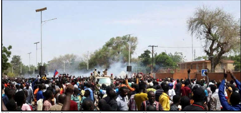
Nigerien security forces launch tear gas to disperse pro-junta demonstrators gathered outside the French embassy, in Niamey, the capital city of Niger.

Monitoring Desk HELSINKI: Denmark's foreign minister said Sunday the government will seek to make it illegal to desecrate the Quran or other religious holy books in front of foreign embassies in the Nordic country. Foreign Minister Lars Løkke Rasmussen said in an interview with the Danish public broadcaster DR that the burning of holy scriptures "only serves the purpose of creating division in a world that actually needs unity."