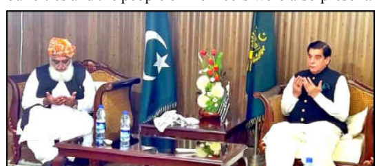
ISLAMABAD: Speaker National Assembly Raja Pervez Ashraf offering fateha for the martyrs of Bajur blast with President of Jamiat Ulama-e-Islam Maulana Fazal-ur-Rehman.

He said that we have to do positive marketing of our cities and the people of