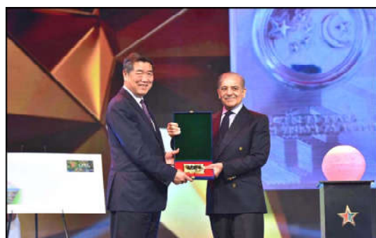
ISLAMABAD: Prime Minister Muhammad Shehbaz Sharif presenting a memento of Rs. 100 coin to Chinese Vice Premier He Lifeng at a ceremony to commemorate the 10th anniversary of CPEC.

Shehbaz said CPEC was going to turn around Pakistan's economy through the multiple programmes and initiatives.