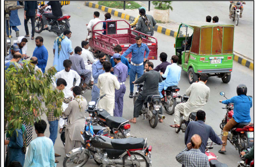
ISLAMABAD: Traffic wardens are issuing challan to motorcyclists against riding motorcycle without helmets at Raja Bazaar area in the city.