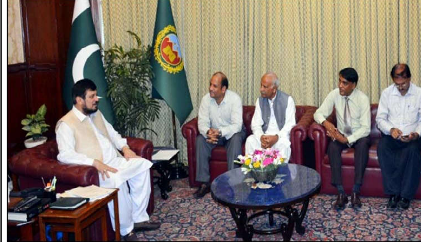
PESHAWAR: A delegation led by Priest Rauff Masih of the Seventh Day Adventist Church meeting with Governor Khyber Pakhtunkhwa, Haji Ghulam Ali.

DG KHAN (APP): Former Governor of Punjab, Sardar Zulfiqar Ali Khan Khosa, emphasized the need for collective efforts to ensure the country's survival and put it into the path leading to progress and prosperity. While talking to journalists at Khosa House, he called for focus towards national interests, highlighting the challenges of inflation and uncertain futures for the youth. Khosa hoped for relief measures from the caretaker government, and urged individuals to work for the country's betterment.