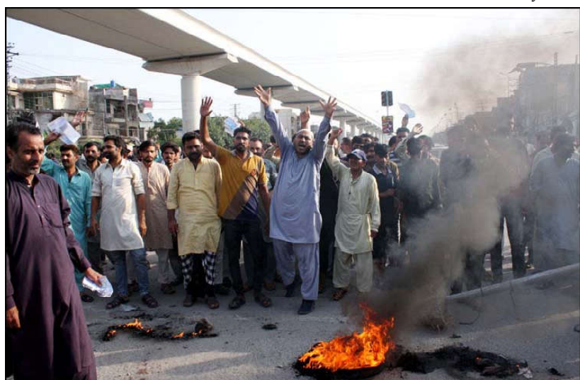
LAHORE: Residents of Kharak block road and burn tyres and electricity bills as they are holding protest demonstration against massive unemployment, increasing price of daily use products, inflation price hiking and the highly inflated electricity bills, held at Multan road in Lahore.

The health hazards, caused by the unfolding crisis. The Intergovernmental Panel on Climate Change (IPCC) has concluded that to avert catastrophic health impacts and prevent millions of climate change-related deaths, the world must limit temperature rise to 1.5°C. The past emissions have already made a certain level of global temperature rise and other changes to the climate-inevitable, he added. Qamar said that even global heating of 1.5°C is not considered safe; however, every additional tenth of a degree of warming is likely to take a serious toll on people's lives and health. Dr. Iftikhar, former Medical Superintendent Mayo Hospital.