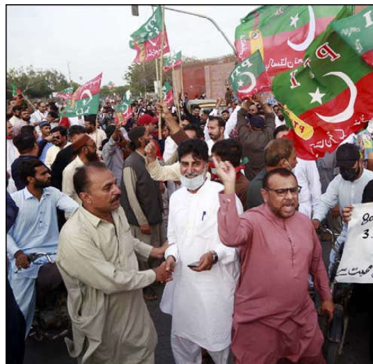
KARACHI: Supporters of Tehreek-e-Insaf (PTI) are holding protest demonstration in favor of PTI Chief Imran Khan and demanding of released from Jail, held at M.A. Jinnah road in Karachi.

ISLAMABAD (APP): The Capital Development Authority (CDA) is planning to develop several new modern parks in the federal capital to provide better recreational facilities to the residents of the city. "The civic authority has already developed around 37 public parks in the federal capital during the last ten years and is working on a policy to increase their number in the coming years," official sources in the CDA told APP. "We need three to four months to develop a new park after completion of the codal formalities." At present, they said the federal capital had six amusement parks, which were considered sufficient to cater to the recreational needs of Islamabad residents. "But the policy has been made that whenever a new sector will be developed, an amusement park will be constructed along," they added. The sources said that the CDA was developing several new sectors, including I-11, I-12, I-14, I-15, I-16, D-12, and Park Enclave, adding that Model Villages and parks were also being developed in the said areas. "As and when these areas are developed and completed, the new parks will be there to meet the demand and requirement of the general public as per CDA approved layout plan," they added.