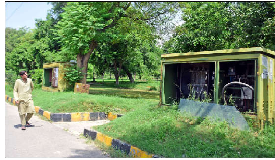
ISLAMABAD: A man walk past in front of open electric box alongside a road near Kachnar park in Federal Capital, which may cause any incident time as needs to attention for concern authority.

KARACHI (APP): Caretaker Federal Minister for Religious Affairs and Interfaith Harmony Aneeq Ahmed on Sunday paid a visit to Jamia Islamia Clifton and engaged in discussions with Ulema, fostering unity and collaboration for a shared religious harmony agenda. Addressing the religious scholars, he, in light of escalating social intolerance, raised a question on the dissemination of true message and purpose of Islam to fellow Muslims. He lamented that the tragic incident in Jaranwala highlighted the unfortunate reality of the nation. Aneeq asserted that any misconception regarding blasphemy or desecration of the Holy Quran must be dispelled. "No doubt, we cannot tolerate blasphemy or disrespect towards the Holy Quran under any circumstances. But it does not mean that we have to establish our own courts to deal with such sensitive issues," he added. He said what the message we had delivered in case of Jaranwala incidents as it has portrayed a negative image of Pakistan and Islam in the comity of nations.