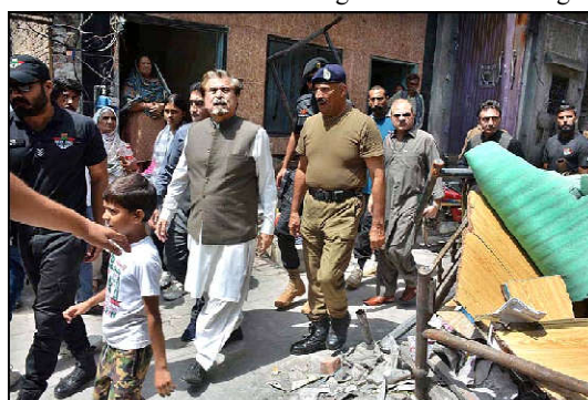
FAISALABAD: Caretaker Federal Minister for National Heritage & Culture Syed Jamal Shah is visiting a Christian Colony Jaranwala.

ISLAMABAD (Online): The Ministry of Law strongly condemned the criticism of the Chief Justice Islamabad High Court on social media and said that political parties should refrain from attacking the country's institutions. In a statement issued by the Ministry of Law and Justice, it has been said that the attack on the Chief Justice of the Islamabad High Court by a political party on social media is highly condemnable. Ministry said it is a responsible act for political parties to refrain from attacking national institutions. Keep clear that social media is heavily criticising the Chief Justice Aamer Farooq on petition to dismiss conviction of chairman PTI Imran Khan by additional and session judge Humayun Dilawar in Tosha Khana case. Former Information minister and PMLN leader Maryam Aurangzeb also criticised the social media criticism and wrote on that state terrorist (Imran Khan) who threatened Zeba Judge has now come down to "Oy Aamir Farooq, I will not leave you." Information Secretary of Pakistan Muslim League (N) Maryam Aurangzeb said that the person who threatened "Oy beautiful judge, I will not leave you" and the state terrorist of May 9 now "Oy Amir Farooq, I will leave you".