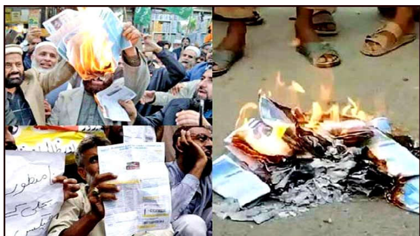
Citizens burn electricity bills as they are holding a protest demonstration against the highly inflated electricity bills

ing Karachi, Rawalpindi, Multan, Gujranwala, and Peshawar, demanding that the government to abolish imposed taxes on electricity, saying that increase in electricity bills is unbearable and demanded relief from the government. In July, the then federal cabinet gave its go-ahead to a massive increase in the base tariff of electricity by up to Rs7.50 per unit against the national average tariff determination of Rs4.96 by the power regulator National Electric Power Regulatory Authority. The regulator had hiked the tariff to increase revenue collection for the loss-making power distribution companies (Discos) during the current fiscal year. According to a Nepra statement, the revised national average tariff for the 2023-24 fiscal year has been determined at Rs29.78 per unit kWh, which is Rs 4.96 per unit higher than the previously determined national average tariff of Rs24.82.