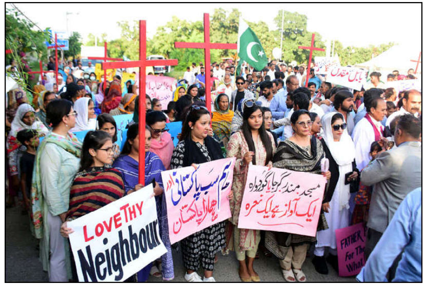
ISLAMABAD: Members of Christian community hold the holy cross and banner reading 'Justice should be given to the Christian community victims of Jaranwala tragedy' during a protest outside national press club.

ISLAMABAD (APP): The Ministry of Poverty Alleviation and Social Safety has approved 4,781 requests of deserving patients for health financing from May 2022 to March 2023 under the 'Tahafuz programme'. "A total of 15,729 requests of the deserving patients have been approved for health financing since the inception of the programme" an official source revealed. The initiative is aimed at catering to the catastrophic health expenditures of deserving patients through fourteen impaneled hospitals based in Islamabad, Punjab, Khyber Pakhtunkhwa (KP), Balochistan, Sindh, Gilgit-Baltistan (GB), and Azad Jammu and Kashmir (AJK), irrespective of geographical limitations and domicile. Tahafuz is a Public Sector Development Program (FY-2021-2024) demand-driven initiative designed to protect the extremely poor from catastrophic health expenditures. The program is also providing healthcare assistance to the poor who fall under the pre-defined eligibility criteria primarily based on BISP or National Socio-Economic Registry Poverty scores i.e. PMT.