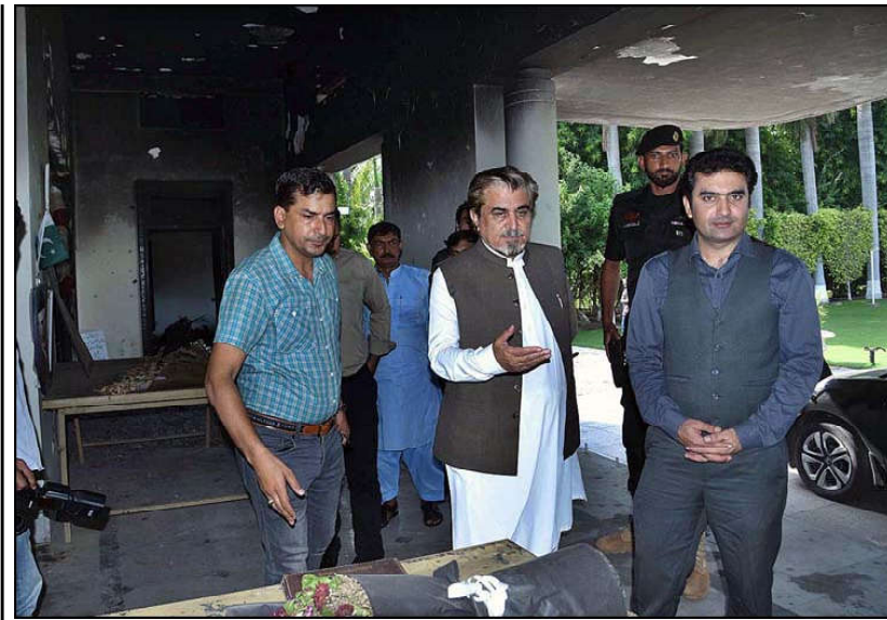
LAHORE: Caretaker Federal Minister for National Heritage & Culture Syed Jamal Shah is visiting Jinnah House.

including important figures and even the Prime Minister, had shown solidarity with the Christian community. Praising the exemplary educational services provided by the Christian community, Governor Haji Ghulam Ali said that the Christian community is contributing significantly to the progress and well-being of the nation. He emphasized the importance of ensuring facilities in all educational institutions, recognizing that children are the future and providing facilities in educational institutions is not just a duty but also vital for the bright future of the nation. The delegation expressed gratitude to the Governor for his willingness to address their concerns and offer cooperation in finding solutions. They also commended the steps taken by the Governor for promoting education in the province.