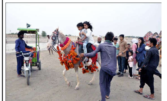
HYDERABAD: People are enjoying pleasant evening and cooling themselves during cloudy weather of summer season, at River Indus in Hyderabad.

He informed that 30 kg opium and over 100 kg hashish were recovered from a vehicle intercepted in a private housing society near Islamabad Airport. Two pistols and ammunition were also recovered from the vehicle. During the operation, a suspect, resident of Swabi was also arrested on