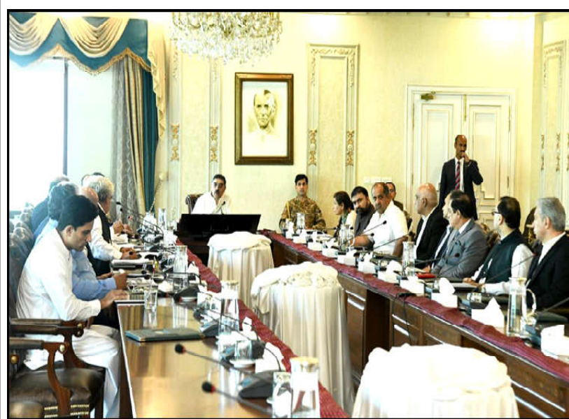
Caretaker Prime Minister Anwar-ul-Haq Kakar chairing an emergency meeting regarding electricity bills at the Prime Minister's House Islamabad.

for domestic consumers was Rs 3.82, Power Division officials said. The maximum electricity tariff in 2022 was Rs 31.02 per unit. In August 2023, the price of electricity is Rs 33.89 per unit. Meanwhile Officials of Ministry of Water and Power have said that electricity tariff is determined by NEPRA (National Electric and Power Regulatory Authority) electricity prices change under Consumer Price Index, due to KIBOR (Karachi Inter-bank Offered Rate) and fuel price adjustment also in electricity prices. According to details, an emergency meeting on electricity rates and bills was held on Sunday under the chairmanship of Caretaker Prime Minister Anwarul Haq Kakar. The Ministry of Water and Power gave a briefing in the meeting.