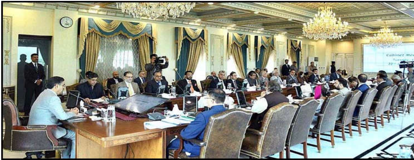
ISLAMABAD: Caretaker Prime Minister Anwaar-ul-Haq Kakar chairs meeting of the Federal Cabinet.

Vol. XIII No. 248 Reg. mails-B / ID-445 Wednesday August 23, 2023, Safar 05, 1445 A.H. Ph: 2158688, 2158997 Pages 4: Rs. 12