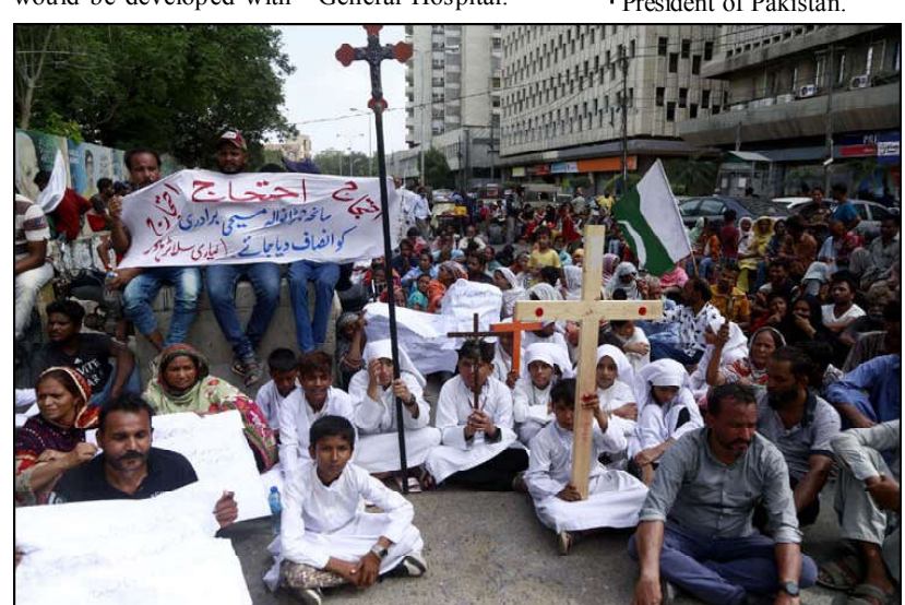
KARACHI: Members of Christian Community are holding protest demonstration against attacked on churches in Jaranwala incident and demanding for Justice, held at Karachi press club.