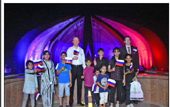
ISLAMABAD: Russian Ambassador to Pakistan Danila Ganich holding National Flags posing for a photo graph along with Pakistani Children at National Monument in order to commemorate National Flag Day of Russia.

Notably, this pursuit also saw the confiscation of more than (8) kg of environmentally hazardous polythene bags, firmly underscoring the commitment to preserving the local ecosystem.