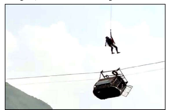
BATTAGRAM: Pakistan Army Special Service Group (SSG) Commandos take part in rescue operation after a cable car incident in Battagram.