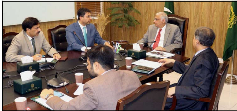
Caretaker Minister for Planning, Development and Special Initiatives, Muhammad Sami Saeed chairing a meeting to review progress on CPEC Projects in Islamabad