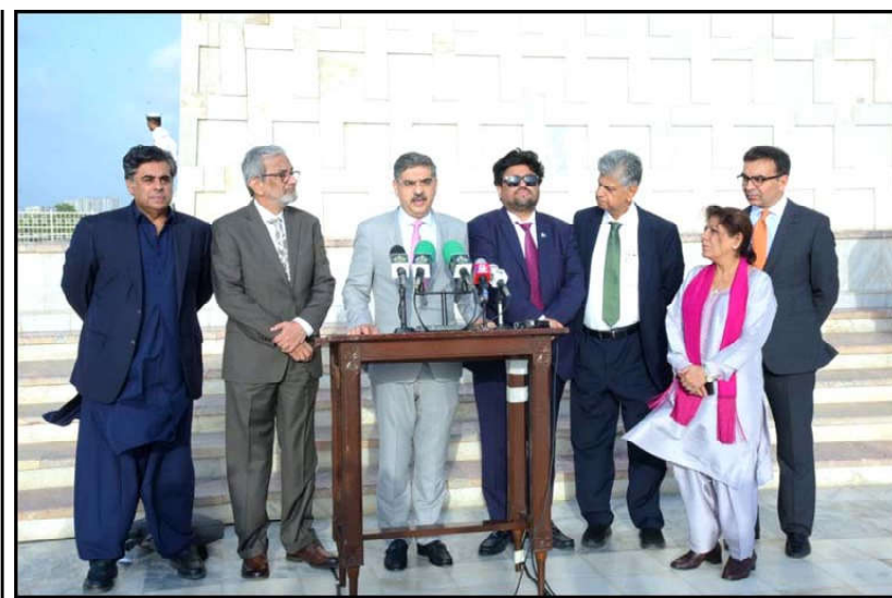
KARACHI: Caretaker Prime Minister Anwaar-ul-Haq Kakar talking to media after visiting Mazar-e-Quaid

Referring to an address of the Founder of the Nation on August 11, 1947 before the Constituent Assembly, he said it focused on the rights of the minorities and equality among individuals.