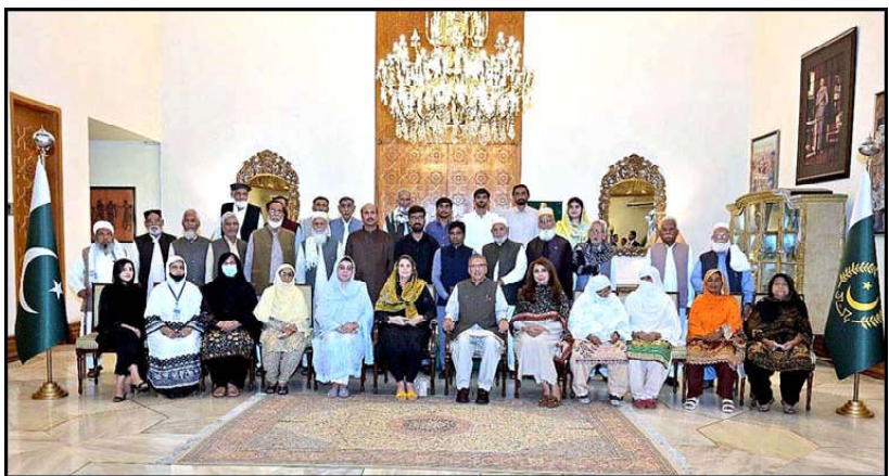
ISLAMABAD: President Dr Arif Alvi in a group photo with a delegation of Old Age Home, Aafiyat, Multan, at Aiwan-e-Sadr.

He maintained that a continuation of the previous government, the caretaker setup was generally supposed to carry on with the general policy until and unless there were any violations of rules or business. "The National Assembly has retired and we are waiting for the new elections," he said adding the second arm of the parliament the Upper House was still there but it could not do legislation alone till there was the Lower House. He asked the cabinet members to come up with a work plan by taking briefings from their respective ministries and the next cabinet meeting agenda would be based on that work plan.