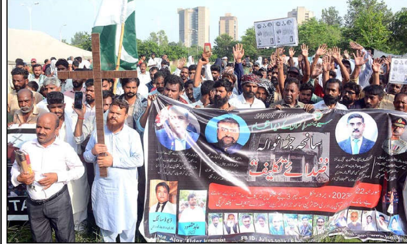
ISLAMABAD: Christians hold the holy cross and a banner reading 'Justice should be given to the Christian community victims of Jaranwala tragedy' during a protest to condemn the attack on churches.