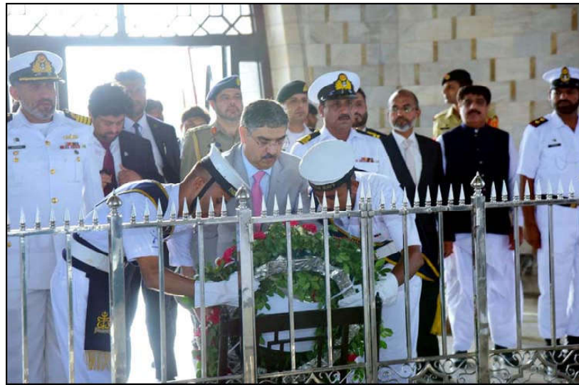
KARACHI: Caretaker Prime Minister, Anwaar-ul-Haq Kakar laying floral wreath at the Mausoleum of Father of the Nation, Quaid-e-Azam Muhammad Ali Jinnah, in Karachi.

here to pay homage to Q u a i d - e - A z a m Muhammad Ali Jinnah and reaffirm to work for the progress and prosperity of the country by highlighting the social contract under which a separate state came into being. Referring to an address of the Founder of the Nation on August 11, 1947 before the Constituent Assembly, he said it focused on the rights of the minorities and equality among individuals. Prime Minister Kakar expressed the optimism that the people of the country would excel in different fields on the basis of their talents and it was the future of the country.