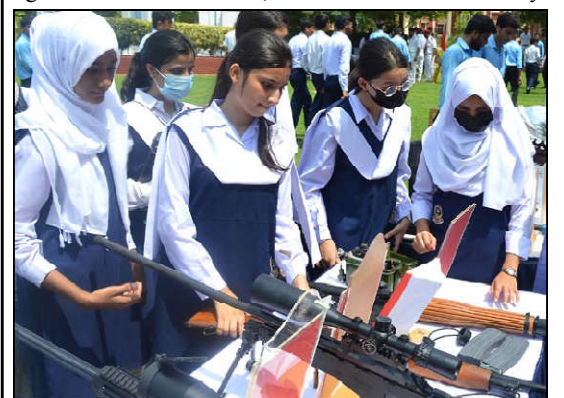
LAHORE: Girls student visiting stall during an event "A day with Pakistan Navy" organized by Pakistan Navy War College, Lahore.