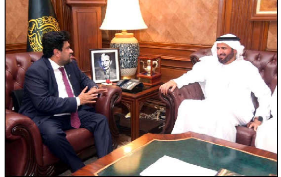
KARACHI: Governor Sindh, Kamran Tessori exchanging views with Dr. Tawfiq Bin Fawzan Al-Rabiah, Saudi Minister for Hajj and Umrah during meeting held at Governor House in Karachi.

And they will face no difficulties upon their arrival in Saudi Arabia, he added.