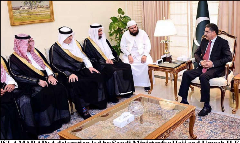
ISLAMABAD: A delegation led by Saudi Minister for Hajj and Umrah H.E. Dr. Tawfiq Bin Fawzan Al-Rabiah called on Caretaker Prime Minister Anwaar-