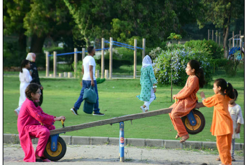
ISLAMABAD: Children are enjoying Sunday Holiday at Japanese Children Park in Federal Capital.