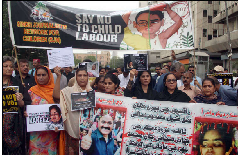
KARACHI: Members of civil society holds placards during protest in favor of their demands outside press club in Provincial Capital.