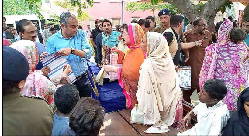
FAISALABAD: Punjab Chief Minister Syed Mohsin Naqvi is distributing supplies during his visit Danish School Camp regarding the incident Christian Colony Jaranwala.

He said that Islam had taught us to protect the rights of non-Muslims. "The letter of the Holy Prophet Hazrat Muhammad (Peace & blessings of Allah be upon him) which he wrote to the Christian community was a beacon for us." "In this letter, the Muslims were instructed to take care of the rights of the Christian community and this order remained in force till the Day of Judgment. Therefore, it was our religious obligation to follow the commandment given to us by our beloved Holy Prophet (Peace and blessings of Allah be upon him) because it was the greatest commandment for us," he added. On this occasion, the caretaker Chief Minister urgently called a meeting of his cabinet inside the church and the cabinet secretary presented its one-point agenda for financial assistance to compensate the affectees of the Jaranwala tragedy.