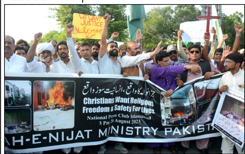
ISLAMABAD: Members of Rah-e-Nijat Ministry Pakistan and members of civil society participated in a protest to condemn the attack on churches and houses in Jaranwala Town of Faisalabad front of press club.

Sources said that deceased belong to South Waziristan, whose bodies have been shifted to their native areas. On the other hand, Caretaker Prime Minister Anwar Haq and Caretaker Chief Minister Punjab Mohsin Naqvi strongly condemned the bomb blast for the loss of precious lives and expressed regrets.