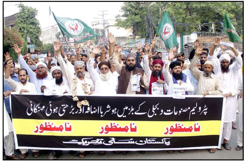
LAHORE: Activists of Sunni Tehreek (PST) are holding protest demonstration against inflation, unemployment and price hike of petroleum and other products, at Lahore press club.

Comiserating with the bereaved families, the minister prayed for the recovery of those who injured in the accident. Jamal Shah said that our sympathies are with the lamenting families who lost their loved ones.