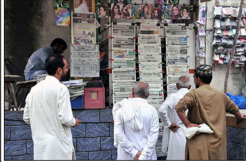
ISLAMABAD: People are reading a newspaper displayed for sale by a shopkeeper at Abpara Market.

Election Commission only for their own interests. Sirajul Haq alleged that PDM and PPP conspired to postpone the election adding the Election Commission should reconsider its decision and announce immediate elections, the caretaker government should conduct transparent elections instead of jumping around. Talking about inflation, Sirajul Haq said that according to a research, electricity prices have increased by 72 per cent in a few months, now the solution to all these problems lies only with the people.