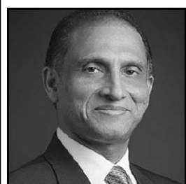
Aizaz Ahmad Chaudhry

The press is considered the fourth pillar of a democracy because it shines a light on issues that allow the public to make smart choices, especially at election time. The media can break its current trend of covering only the (outdated) political class by focusing on the young whose future is at stake. -- Courtesy Dawn