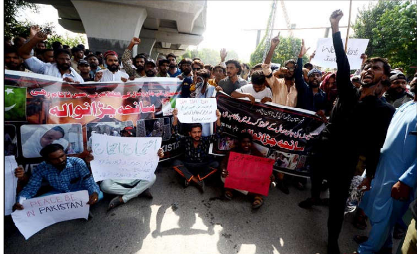
PESHAWAR: Members of the Christian minority hold placards as they shout slogans during a protest against mob attacks that erupted the day before in Jaranwala, near Faisalabad, in Peshawar, Pakistan, 20 August 2023. Armed mobs in Jaranwala targeted two churches and private homes, setting them on fire and causing widespread destruction. The attack was sparked by the discovery of torn pages of the Muslims holy book Koran with alleged blasphemous content near a Christian colony.