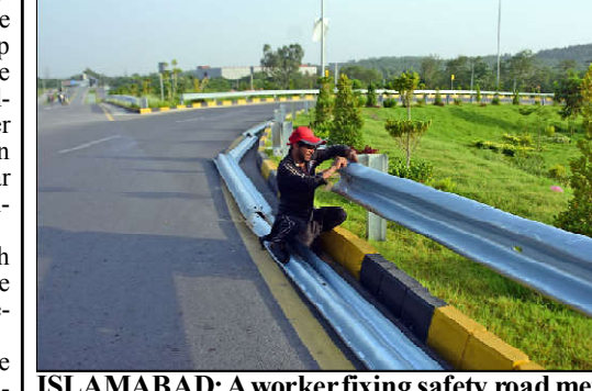
ISLAMABAD: A worker fixing safety road metal beam for traffic at 7th avenue bridge in Federal Capital.

employees involved in crimes and bringing them to justice. He further said that registration of tenants and domestic workers not only keeps a close eye on the miscreants but also prevents the elements involved in any kind of dubious activity. He urged the house owners to verify the backgrounds of people before giving them employment and get them registered with the nearest police station, Police Khidmat Markazs.