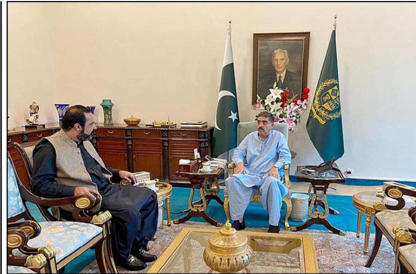
ISLAMABAD: Senator Arbab Umar Kasi calls on Caretaker Prime Minister Anwaar-ul-Haq Kakar.

In conclusion, FAFEN underscored that enhancing the delimitation process was pivotal to ensuring electoral fairness and preventing imbalances in population representation. The organization stressed that delimitation was a crucial mechanism for allocating political power and must be carried out justly, fairly, and transparently.