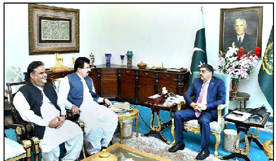
ISLAMABAD: Chairman Senate Muhammad Sadiq Sanjrani and Senator Danesh Kumar call on caretaker Prime Minister Anwaar-ul-Haq Kakar.

ISLAMABAD (APP): Caretaker Prime Minister Anwaar-ul-Haq Kakar on Thursday said that his government would make its utmost efforts to come up to the expectations of public representatives within the given short stint. The prime minister said this in a meeting with Senate Chairman Sadiq Sanjrani here. The Senate chairman congratulated the prime minister on assuming the office. Prime Minister Kakar thanked Sadiq Sanjrani, who expressed the hope that the caretaker government would not only assist in holding fair elections as per public expectations but also accelerate the course of economic development. Senator Danesh Kumar also attended the meeting. Caretaker Prime Minister Anwaar-ul-Haq Kakar has said that the government would be assiduously working to facilitate a free and fair election process in Pakistan according to the Constitution. On his Twitter handle on Wednesday, the prime minister thanked US Secretary of State Antony Blinken for his good wishes. "We place importance on our partnership with the US and deeply value the shared commitment to economic prosperity, democracy and stability in the region," he further posted. Earlier, the US secretary of state, in a tweet, congratulated the new Caretaker Prime Minister Anwaar-ul-Haq Kakar. "As Pakistan prepares for free and fair elections, in accordance with its constitution and the rights to freedom of speech and assembly, we will continue to advance our shared commitment to economic prosperity," Blinken added in his tweet.