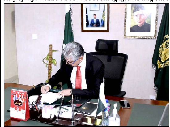
After assuming the responsibilities as the interim information minister, Murtaza Solangi held a meeting with the ministry's officers and his staff.

ISLAMABAD (APP): Murtaza Solangi on Thursday assumed charge as Interim Minister for Information and Broadcasting. "Murtaza Solangi arrived in his office at the Ministry of Information and Broadcasting after taking oath of his position (at the President's House)," said a news release.