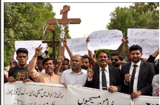
HYDERABAD: Members of Christian Community are holding protest demonstration against attack on churches in Jaranwala, at Hyderabad press club.

outburst floods (GLOFs) and enhance disaster risk management in the region. During the visit, the delegation engaged in productive meetings with the local communities wherein they sought valuable feedback about the ongoing project activities. The insights garnered from these discussions will play a pivotal role in ensuring that the project aligns with the needs and aspirations of the local communities further enhancing its effectiveness. Talking to the media, the Additional Secretary highlighted the alarming rise of over 3,000 lakes as a consequence of melting glaciers.