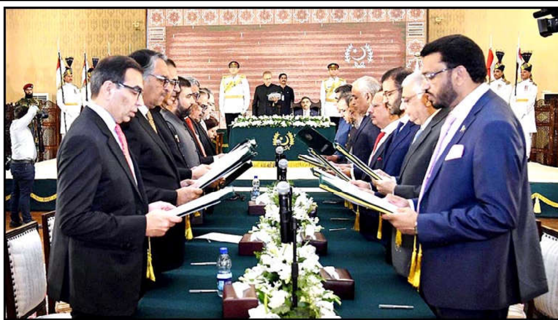
ISLAMABAD: President Dr. Arif Alvi administering the oath of office to members of the caretaker Federal Cabinet, at Aiwan-e-Sadr.