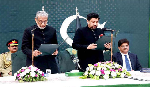
KARACHI (APP): Governor Sindh Kamran Khan Tessori on Thursday administered the oath to Caretaker chief minister of Sindh Justice (Rtd) Maqbool Baqir. The oath-taking ceremony held at the Governor House here, said a spokesperson of the Governor House. Judges of the Supreme Court, Consul Generals of different countries, former federal and provincial ministers, businessmen, political and social figures, senior officers and dignitaries of the city participated in the ceremony. On the occasion, the Governor of Sindh also congratulated Justice (Rtd) Maqbool Baqir on assuming the office of the caretaker Chief Minister of Sindh.