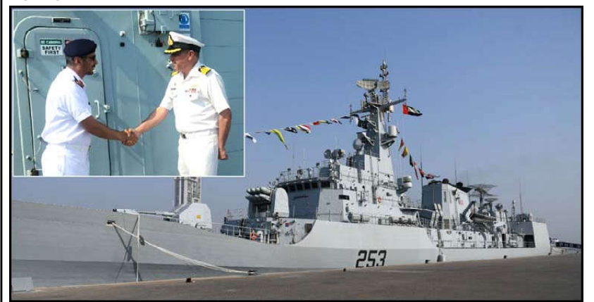
Commanding Officer PNS SAIF receiving Base Commander UAE Naval Forces on board during Pakistan Navy Ship's visit to UAE.