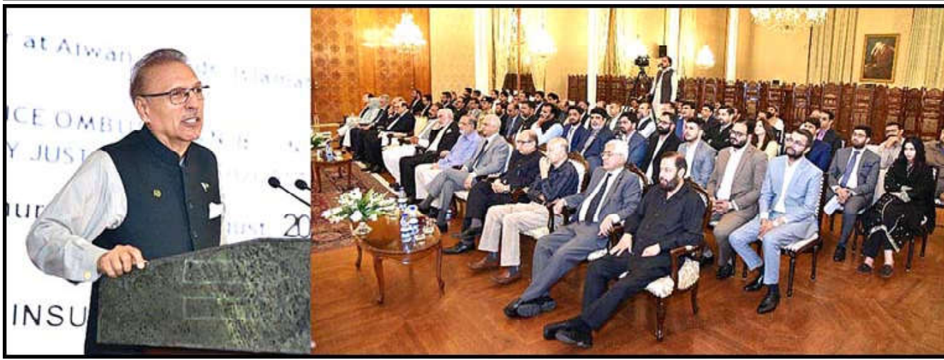
ISLAMABAD: President Dr. Arif Alvi addressing a seminar on "Insurance Ombudsman and Concept of Speedy Justice at the Doorstep", at Aiwan-e-Sadr.