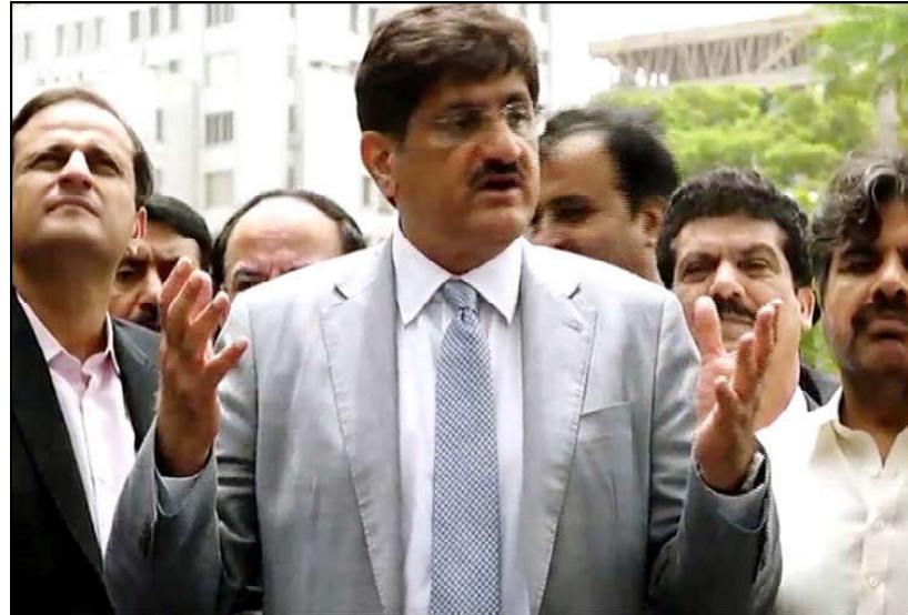
KARACHI: Sindh Chief Minister, Syed Murad Ali Shah talks with media persons during press conference after the Gujjar Nala implementation case, outside Supreme Court Karachi Registry building.