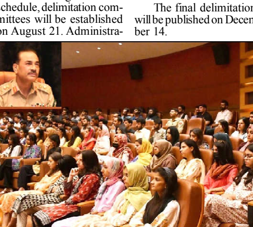
RAWALPINDI: Chief of Army Staff (COAS) General Asim Munir addresses to the 370 students that were interns at the yearly Inter-Services Public Relations (ISPR) Internship Programme.

Preliminary proposals will be made public on October 9. Representations on preliminary proposals can be filed between October 10 and November 8, and the Commission will address/hear these representations from November 10 to December 9. The final delimitations will be published on December 14.