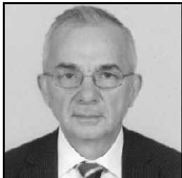
Ashraf Jehangir Qazi

The fact is that both in the West and in Muslim states, efforts need to be intensified to counter the forces of religious bigotry. The attacks on Islam's sacred symbols — indeed, the revered symbols of all faiths — in the West must stop, while Pakistani society must bring to justice all involved in such grotesque violence, and begin an internal reckoning that exorcises the demons of obscurantism tearing this country apart.