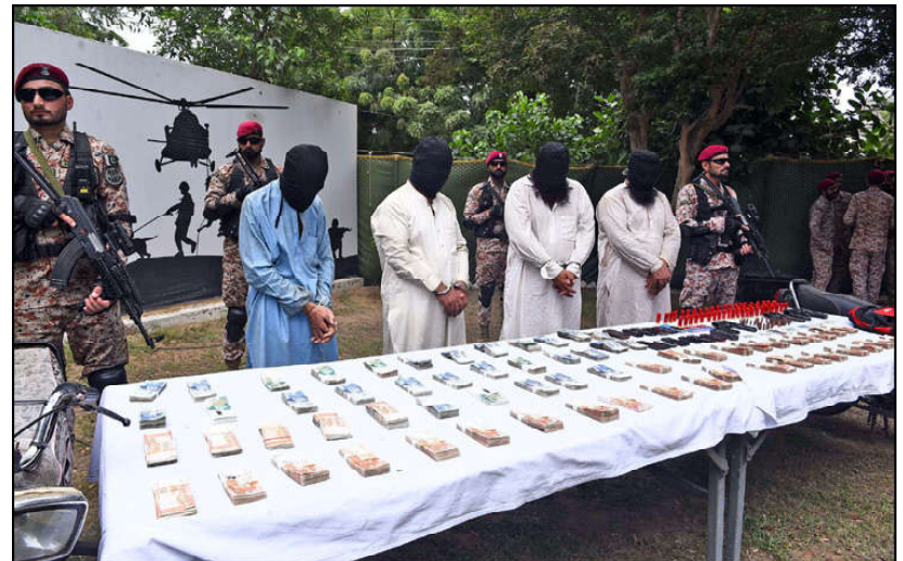
KARACHI: Rangers and Police personnel presents arrested robbers and recover money, to the media at Prady Police Station in Provincial Capital.

The IG Punjab said that with the support of good people, plots have been ensured for the families of more than 100 martyrs before 2017, while financial assistance is also being provided to the heirs of the martyrs for the construction of houses on these plots from the Punjab Police Endowment Fund.