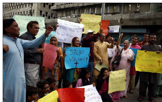
KARACHI: Members of Christian Community are holding protest demonstration against violence on minority community and condemn Faisalabad incident, held at Karachi press club.