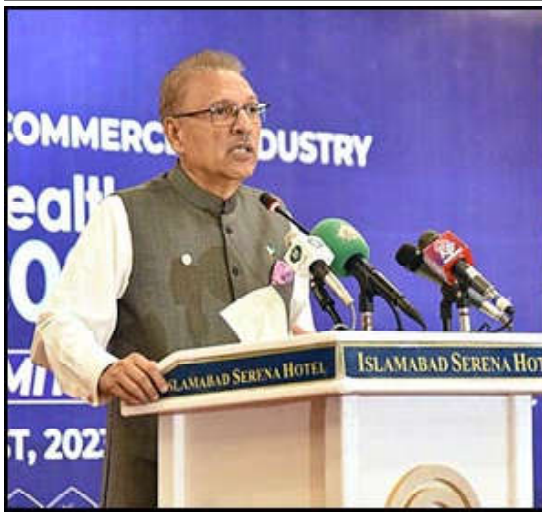
ISLAMABAD: President Dr Arif Alvi addressing the inaugural session of MED-Health Expo and Summit 2023.