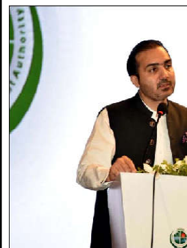
ISLAMABAD: Deputy Chairman Senate, Mirza Muhammad Afridi addressing the first ever Nazam Expo on Disaster Risk Reduction-Pedrr 2023 organized by National Disaster Management Authority (NDMA) in Islamabad.

Party sources said that Nawaz Sharif will leave for Lahore via GT Road in the form of a big rally.