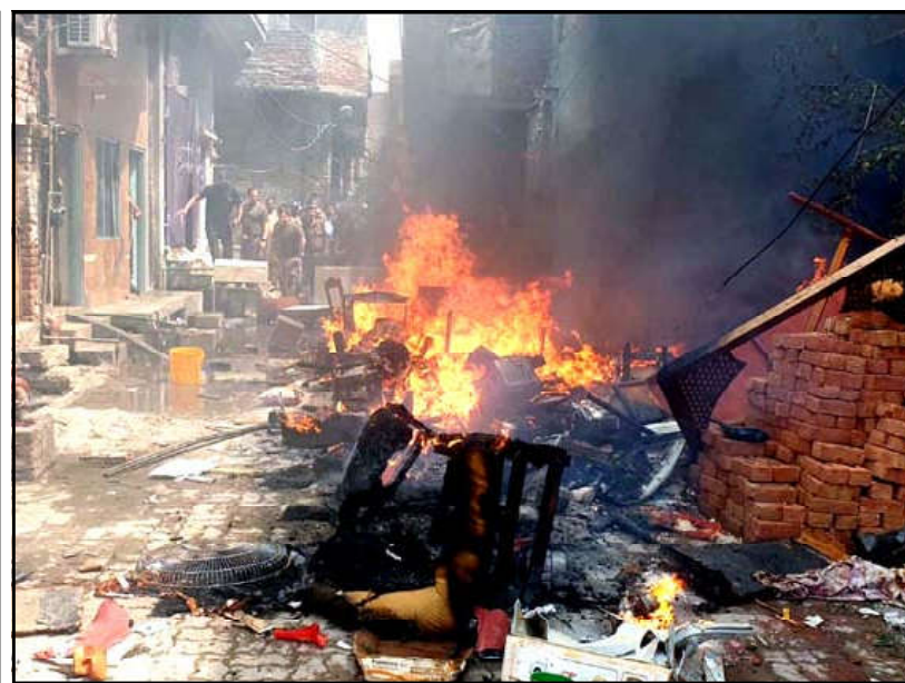
FAISALABAD: View of site after a mob enraged over blasphemy allegations set on fire several churches and a number of houses belonging to Christians in Jaranwala tehsil of Faisalabad.

"Horried to hear about the attack on Churches in Jaranwala, Faisalabad, violating the sanctity of places of worship is absolutely unacceptable. The administration must ensure the safety of the Christian community and their Churches," Bilawal said on X.