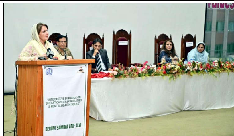
First Lady Begum Samina Alvi addressing an interactive dialogue on breast cancer, disabilities, and mental health issues, in Muzaffarabad.

ers in their access to health, education and employment opportunities. "We have to make them financially empowered by providing skilled-based education and health facilities," she added. Samina Alvi said an ignored segment of society were the people suffering from psychological issues, who hesitated to talk about their problems or go to a psychiatrist for treatment because of 'social stigma'. Around 24% of the country's population was suffering from various psychological issues, she added. The first lady also asked the women to spare five minutes every month for self-examination for early detection of breast cancer. A number of women died in Pakistan every year due to breast cancer, she added.