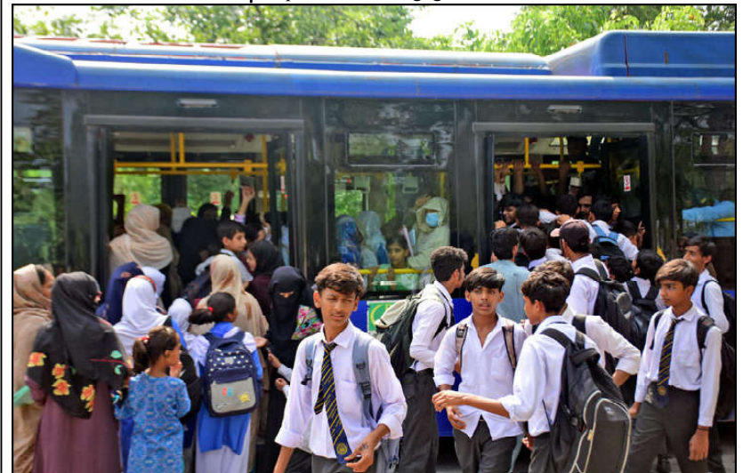
ISLAMABAD: A large number of students are struggling to board in Blue Line Bus Service as due to the extremely high prices of fares, it is now impossible for the students and Common people to use any other medium of transport across the country.

The letter says: "On behalf of the International Transport Workers' Federation (ITF), a global union federation representing nearly 18.5 million transport workers from 740 affiliates in over 150 countries, including Pakistan, we write to you to urgently initiate an investigation into Pakistan International Airlines' flight services management." "Suspected violations of PIA's SEP manual and flight and duty time limitations have been raised by our affiliate, the Pakistan Airlines Cabin Crew Association (PACCA). These issues are fundamental to the operational safety of Pakistan's flag carrier but even more crucial in light of the recent road traffic accident on 29 June 2023 that resulted in severe injuries to one cabin crew member at PIA and the tragic death of senior purser Rashida Majeed." It adds that PACCA expressed concerns in its letter to the PCAA on July 11 with regard to the violation of rules and laws specified within the SEP handbook of cabin crew, which is authorized by the Pakistan Civil Aviation Authority.