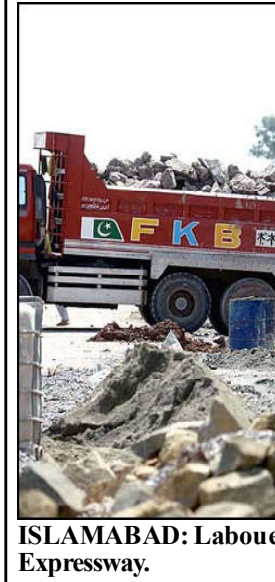
ISLAMABAD: Labourers busy in building a boundary wall on Islamabad Expressway.