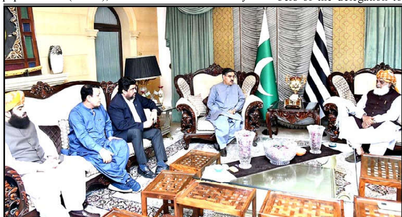
Caretaker Prime Minister Anwaar-ul-Haq Kakar visited the residence of President JUI-F Maulana Fazal Ur Rehman to express his condolences for those martyred in suicide attack in Khar, Bajaur at the JUI-F Workers' Convention Islamabad.