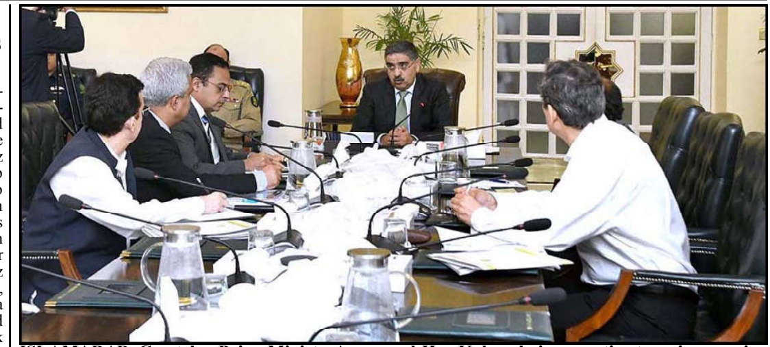
ISLAMABAD: Caretaker Prime Minister Anwaar-ul-Haq Kakar chairs a meeting to review ongoing road infrastructure projects.

ISLAMABAD (INP): Pakistan Muslim League-Nawaz (PML-N) Quaid and former three-time prime minister Nawaz Sharif has summoned top party leader to London to discuss plans for his return to Pakistan. The leaders who were directed to reach London included former prime minister Shehbaz Sharif, Azam Nazeer Tarar, Khawaja Asif, Rana Sanaullah, Khawaja Saad Rafique, Saiful Malook Khokhar, Ahsan Iqbal and Marriyum Aurangzeb.