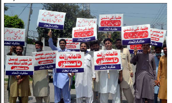
PESHAWAR: Pharmacy Students are holding protest demonstration for their rights, at Peshawar press club.