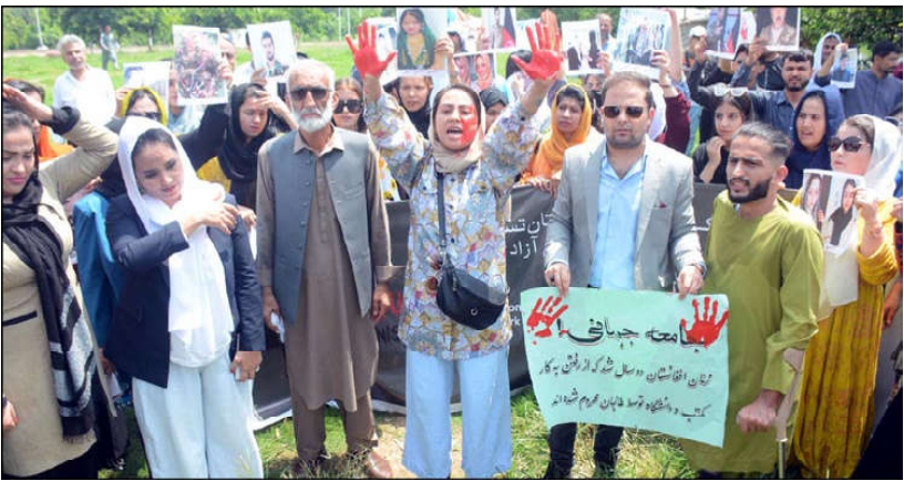
ISLAMABAD: An Afghan national with her hands and face painted black takes part with others in a demonstration against the Taliban government on the occasion of the second anniversary of the Taliban takeover of Afghanistan.

organizations besides senior officials led the rally which marched through major city streets including Quid e Azam Chowk, Mian Muhammad Road, Allama Iqbal Road, and central Shaheed chowk raising zindabad slogans for Pakistan and the valiant armed forces of the country. The rally expressed grave concern over the fast-deteriorating conditions of the people in strife-torn and fully-locked indefinite curfew-riddled Indian held Jammu and Kashmir for the past 10 days. India, it said, has later turned the occupied J&K state into the world's largest jail and garrison. The rally, through another resolution, called upon the international community especially the United Nations to immediately move for getting the special status of the disputed Jammu & Kashmir state restored — for onward early peaceful settlement of the Kashmir issue in line with the UN resolutions.