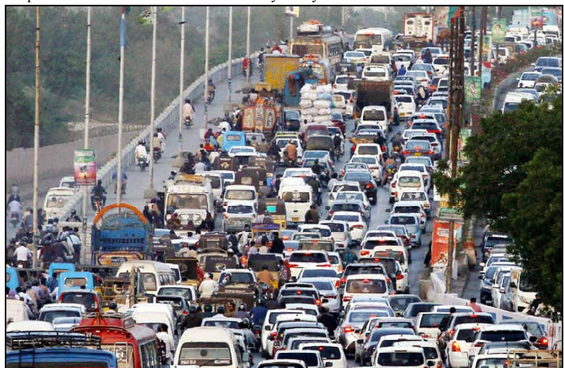
KARACHI: A large numbers of vehicles stuck in traffic jam due to construction and repairing work of Natha Khan Bridge located on Shahrah-e-Faisal in Karachi.