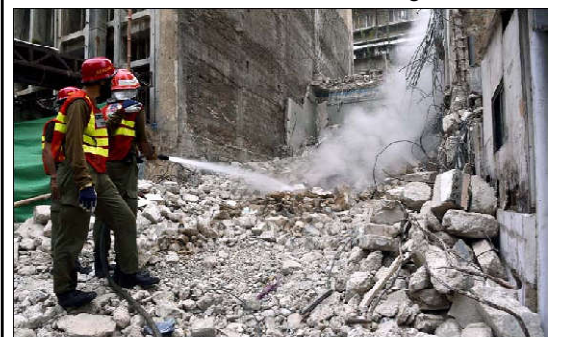
KARACHI: View of site after a fire broken out incident as the fire brigade officials are busy in extinguishing fire and rescue operation, located on I.I Chundrigar road in Karachi.