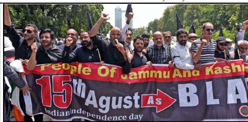
ISLAMABAD: Activists of All Parties Hurriyat Conference are shouting slogans during protest outside Foreign Office to commemorate Indian Independence Day as Black Day because of their oppressor attitude with the innocent citizens of Indian Occupied Jammu and Kashmir.