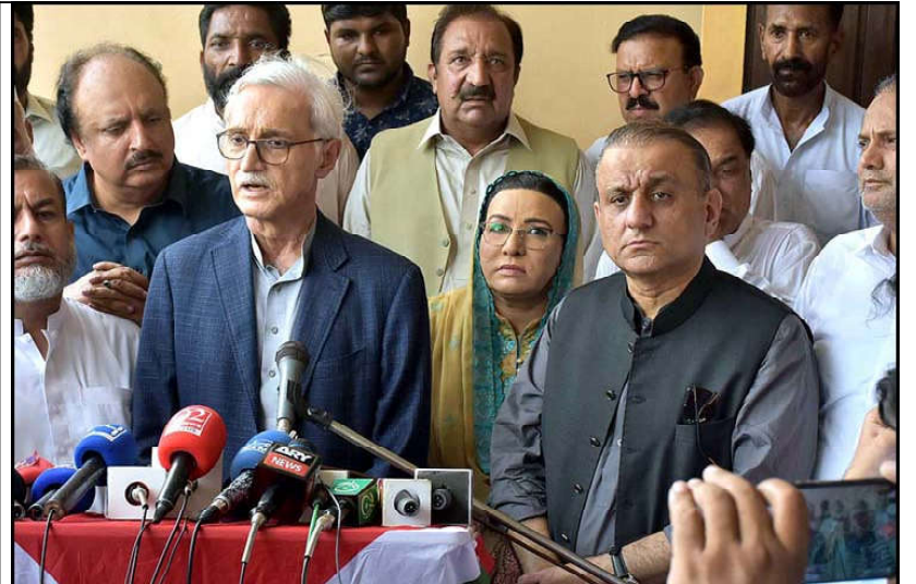
SIALKOT: The Chief Executive of Istehkam-e-Pakistan Party Jahangir Tareen, along with President Aleem Khan and Dr. Firdous Ashiq Awan addressing the media in Kobey Chak.

House to offer their extolments. Fawad Chaudhry said that Kakar's appointment as caretaker prime minister received collective appreciation. He expressed hope that the interim premier would fulfil the "heavy responsibility" that he had been entrusted with. Kakar thanked all the parties who had welcomed his appointment and said that he was grateful to the people who had expressed their good wishes for him. He said that he would strive to fulfil his duties to the best of his ability and that he would work for the betterment of the country.