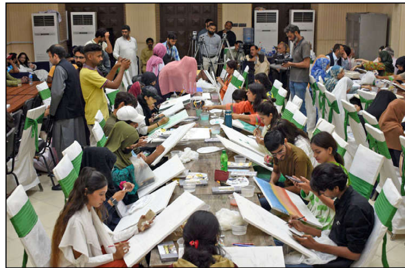
LAHORE: Students busy in painting competition in connection with Independence Day, at Lahore museum in Provincial Capital.