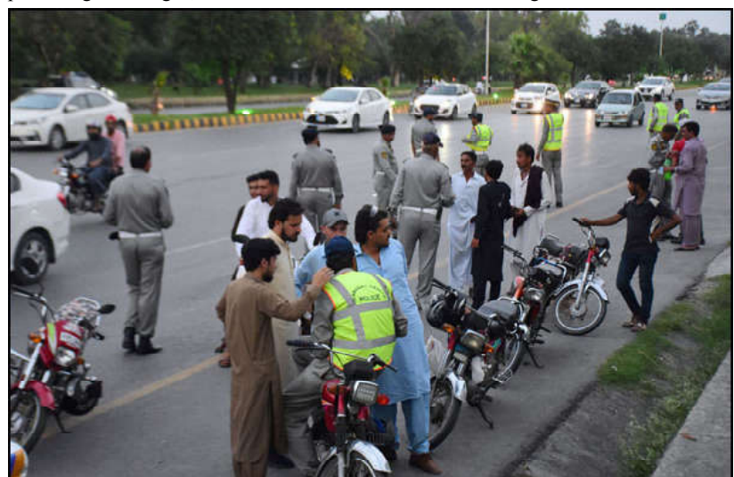
ISLAMABAD: Traffic police wardens busy in issuing challan ticket to motorcyclists for violating traffic rules, in Federal Capital.

"After the completion of LBDT, this tunnel will be used as a flushing tunnel to flush the deposited silt from the reservoir of the Main Dam," reads an official statement. China Gezhouba Group Company (CGGC) has been working on DHPP as the Main Works Contractor of DHPP. China Civil Engineering Construction Corporation (CCECC), Power Construction Corporation of China Ltd (PCCC), Zhongmei Engineering Group Ltd, and CGICOP are also involved in the project. DHPP is being constructed across River Indus, upstream of Dasu town in Upper Kohistan, KP. The 4320 MW DHPP is planned to be completed in two stages. The under-construction tunnel Stage-I is with an installed generation capacity of 2160 MW and the stage-II will be of 2160 MW capacity.