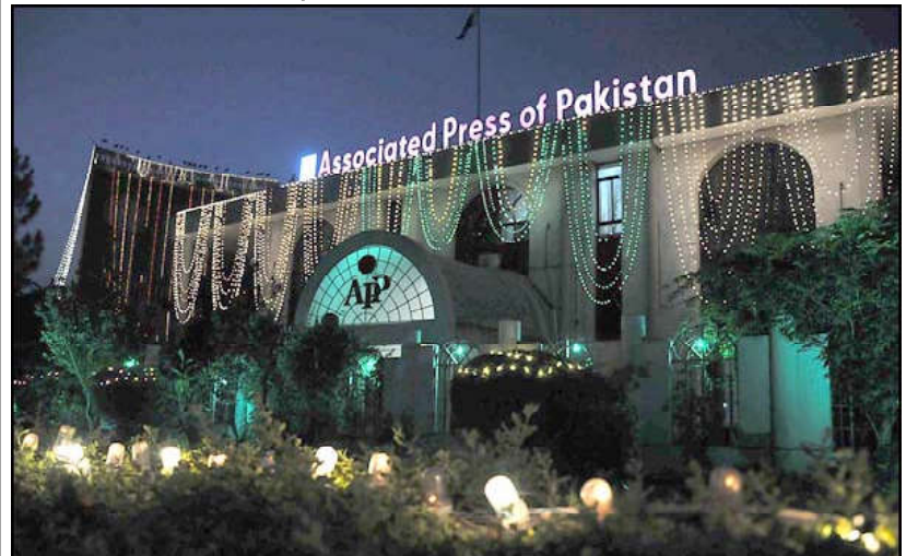
ISLAMABAD: The Building of Associated Press of Pakistan (APP) is decorated with the colorful lights in celebration of Independence Day.

DERA BUGTI (INP): Two traders were shot dead and as many were abducted by dacoits on Indus Highway in the limits of Naper Kot police, Dera Bugti on Sunday. A complete shutdown was observed and a sit-in was held in Dera Bugti against the killings and kidnapping of the traders. The protesters blamed the police for being in connivance with the dacoits kidnapping and killing innocent people.