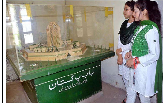
LAHORE: Visitors seeing the model of Bab-e-Pakistan Monument, the first stay of refugees in 1947.

pedestrians, and 471 passengers were among the victims of road traffic crashes. The statistics show that 315 accidents were reported in Lahore, which affected 305 persons, placing the provincial capital at top of the list, followed by 84 in Faisalabad with 71 victims and at third Multan with 78 accidents and 81 victims. According to the data, 1,145 motorbikes, 92 auto-rickshaws,