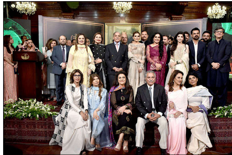
LAHORE: Prime Minister Shahbaz Sharif in a group photo with Journalists, Media workers, Artists and Technical resources during the launching ceremony of the Mobile App Radio Pakistan Awaz Khazana.

Mohsin Naqvi asserted that the shared responsibility of bequeathing a harmonious, robust, and flourishing Pakistan to the forthcoming generations. He underscored the pivotal role of exemplary unity and solidarity in confronting the challenges that lie ahead. Confidently, he envisioned a radiant future for Pakistan and emphasised that, through the benevolence of Allah Almighty, the Pakistani nation would triumph over every obstacle. He called upon all citizens to renew their commitment to prioritise the nation's growth over personal interests and collaboratively elevate the stature of Pakistan.