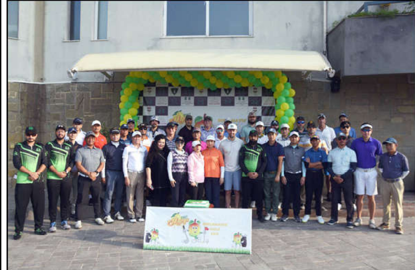
ISLAMABAD: Participants posing for a group photograph before Golf match titled "Mango Fest Diplomat Golf Cup" at Bahria Golf city in Federal Capital.