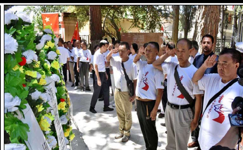
GILGIT: Chinese delegation paying tribute to their relatives who lost their lives during the construction of Karakoram Highway (1959-77) during their visit to Chinese Graveyard Daniyur.

opportunities for growth. "It is a time to renew our commitment to building a stronger and more prosperous Pakistan as envisioned by the Father of the Nation. I urge my fellow countrymen to work for the welfare and uplift of deprived sections of our society. Let's pledge to uphold the principles of democracy, freedom, equality, tolerance, forgiveness, socio-economic justice and moral and ethical values, as enunciated by Islam," a press release quoted the president as saying. He said 76 years ago, on this day, Pakistan gained independence after the historic struggle of the Muslims of the sub-continent under the dynamic leadership of Quaid-e-Azam Muhammad Ali Jinnah. The Muslims of India wanted a homeland for themselves where they could freely order their individual and collective lives in accordance with the teachings of Islam, he added.