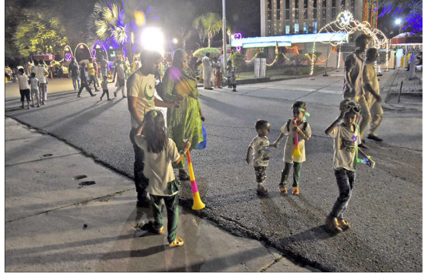
ISLAMABAD: People are enjoying during celebration Independence Day, in Federal Capital.

policies. She said that every year Kashmiris globally mark this day as black day to protest Indian imperialism, that has been forcibly occupying most of the state illegally and brutally for the last 76 years. The day will be marked with anti-India marches and protest demonstrations in all towns and cities, big and small, on both sides of the LoC. Protesters will wear black bands in their arms as a symbol of hostility towards India. People from all walks of life will hold anti-India protests and parades in Azad Jammu and Kashmir, including the capital city of Muzaffarabad and all other nine district headquarters, to reaffirm their intense hatred towards Indian imperialism.