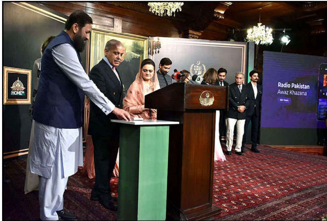
LAHORE: Prime Minister Shehbaz Sharif launches the Mobile App "Radio Pakistan Awaz Khazana".

Vol. XIII No. 240 Reg. mails-B / ID-445 Monday August 14, 2023, Muharramul Haram 26, 1445 A.H. Ph: 2158688, 2158997 Pages 4: Rs. 12