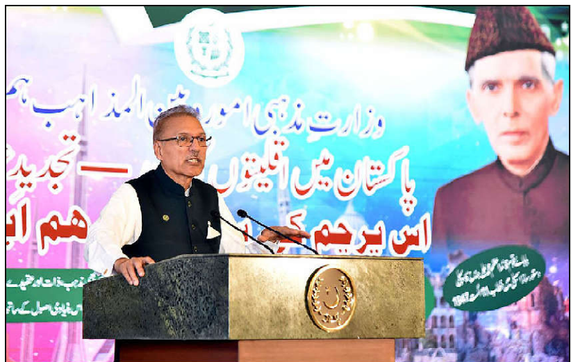
ISLAMABAD: President Dr. Arif Alvi addressing a ceremony in connection with celebration of Minorities' Day event, at Aiwan-e-Sadr.

However, he said, it was unrealistic to expect economic growth amidst incidents like the one on May 9, which was treason against Pakistan, the Pakistan Army, and the Chief of the Army Staff." To a question, he said the controversy over the appointment of the army chief was not a positive tradition. In other countries, such appointments were not publicized.