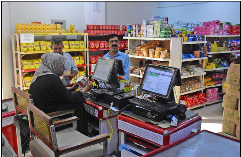
ISLAMABAD: A view of the empty Utility Store at Sitara Market as workers are sitting free due not visiting of customers following the ending of the subsidized prices of grocery after ending of the Prime Minister Scheme later than dissolving of the National Assembly.

"So far some $10 billion global funding has been extended to Pakistan and out of it $220 million alone has been given by Germany for flood disaster management. Around 500 million Euros project has been designed to address climate adaptation, mitigation and resilience of Pakistan," he informed. The German envoy told the participants that the first concrete approach on loss and damage fund at the COP-27 Sharm El-Sheikh was the result of a very good cooperation of MoCC and the German delegation led by Sherry Rehman the then Climate Change Minister of Pakistan and the German side represented.