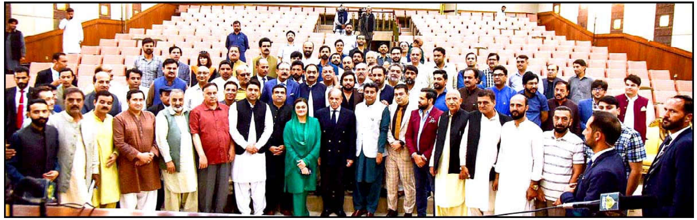
ISLAMABAD: Prime Minister Muhammad Shehbaz Sharif in a group photo with Beat Reporters at Prime Minister's office.

be exercised with great care to determine whether the law is according to the Constitution or not? The legislation for Supreme Court Reviews of Judgments and Orders Act is beyond the power of Parliament. The court said that there was no ambiguity in the Supreme Court decisions on the scope of revision, adding that Article 188 and the implementation of judicial decisions on it was binding on all. It said the Parliament knows that appeal and revision are two different things.