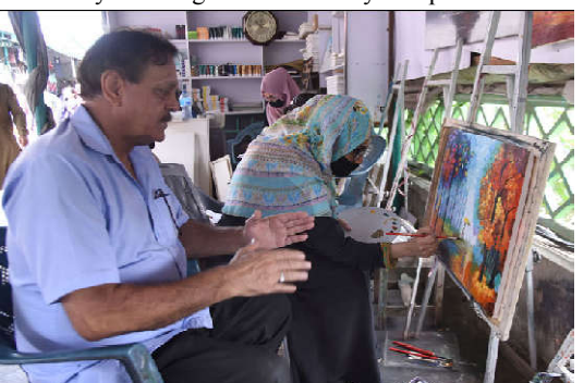
ISLAMABAD: A painter is teaching the painting to the girls at his pavilion in Weekly Friday Market at Sector H-9 in Federal Capital.

Kashmiris observe India's all national days including independence day as black day to condemn India for constantly denying Kashmiris' birth right to self-determination and to apprise the external world of India's ongoing worst reign of state terrorism making people of occupied Jammu Kashmir state besieged, at gunpoint by the Indian military and Para military troops.