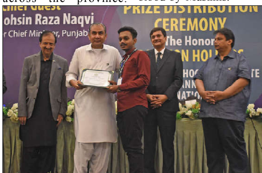
LAHORE: Caretaker Chief Minister of Punjab Muhsin Naqvi conferring the Gold medals and presenting certificates to position holders of Secondary School Examination, at local hotel in Provincial Capital.

At night on August 13, a vibrant display of fireworks is scheduled to illuminate the skies. Simultaneously, on the morning of August 14, flag-hoisting ceremonies will be held in unison across all divisional and district headquarters throughout Punjab. On the evening of August 14, national songs and anthems will be presented to the public in special events. Renowned singers will perform. All government and private buildings will be lit up across the province.