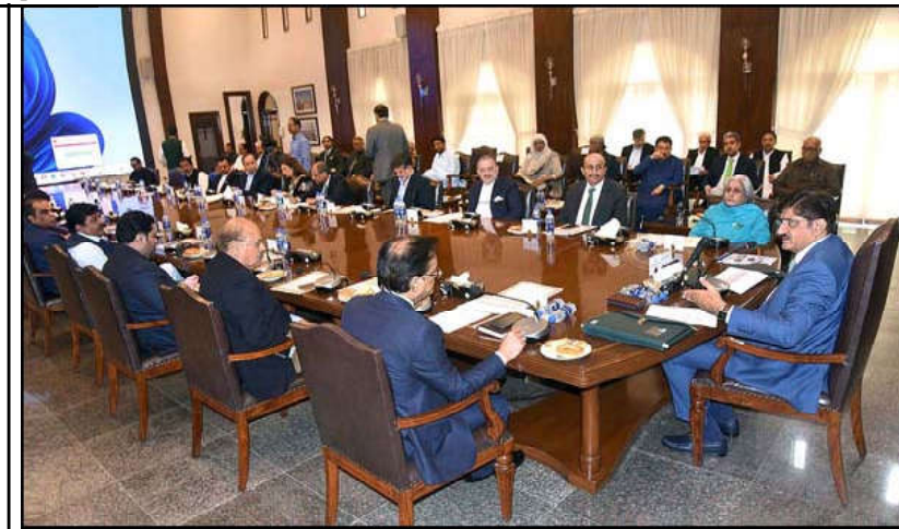
KARACHI: Sindh Chief Minister Syed Murad Ali Shah presides over a farewell cabinet meeting at CM House.

The theme of the meeting was "Awareness Raising Campaign Against Trafficking in Persons, Smuggling of Migrants and Child Protection Concerns".