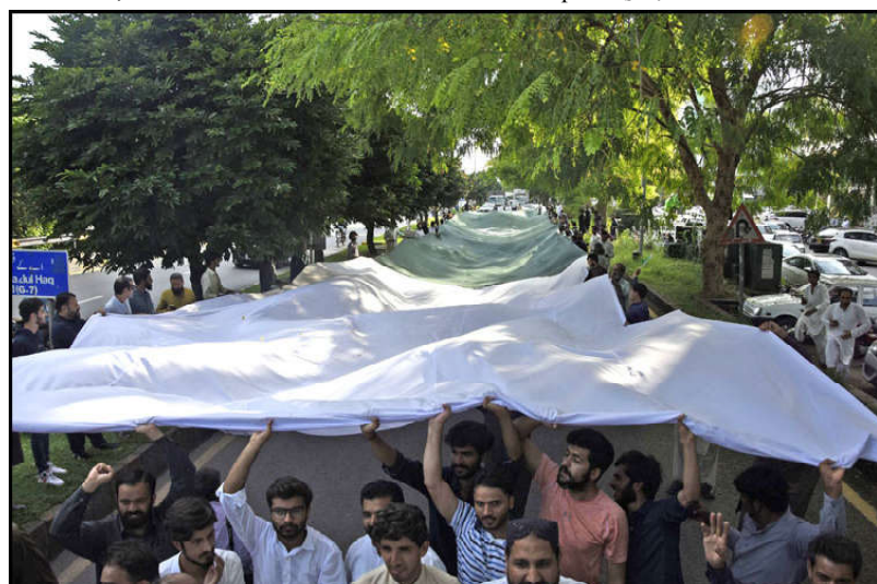
ISLAMABAD: Traders hold a National flag at Blue area during huge national flag ceremony in Federal Capital.

During thousand years of Muslim rule, he said there had never been any religious conflict among Muslims, Sikhs, and Buddhists, Christians and Zoroastrians and others. Sufism had also helped protect the society from the scourge of terrorism, citing two major fatwas against suicide attacks and terrorism.