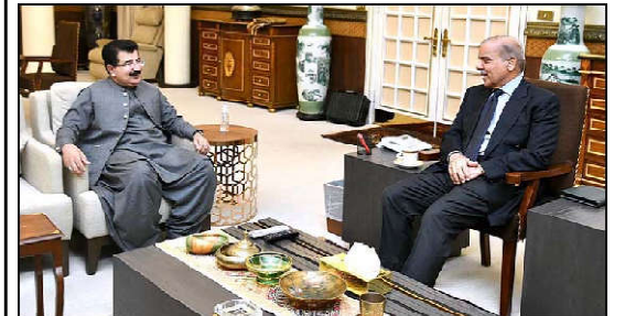
ISLAMABAD: Chairman Senate Muhammad Sadiq Sanjarani called on Prime Minister Muhammad Shehbaz Sharif.

ISLAMABAD (APP): The National Commission on the Status of Women (NCSW) in support of the Ministry of Human Rights & UN Women launched a commemorative postage stamp to spread awareness about gender-based violence in the country and to honour the victims. The first session of the event was a round table consultation on the increasing incidents of violence against women issues with Chairperson NCSW, Nilofar Bakhtiar and top leading gender experts in Pakistan. A resolution/charter of demands was then created and signed which pinpointed the mechanisms to reduce the prevalence of gender-based violence in the country which was shared with the audience at the end of the event. The second session of the event was an art exhibition consisting of pieces of art from the NCSW poster competition held in 2021 and 2022, as well as artwork brought in by Nagin Hayat from the Nomad Gallery and the Czech Embassy. This commemorative stamp was selected after a poster competition on ending violence against women which was held on December 2022.