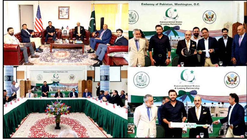
The two iconic superheroes are currently visiting the United States in connection with activities of Shahid Afridi Foundation.

ISLAMABAD (Online): Pakistan's Ambassador to the United States Masood Khan says Pakistan is the most philanthropic and giving nation on the face of the earth. He was talking to globally renowned cricketer Shahid Khan Afridi and legendary Squash champion Jahangir Khan in Washington during luncheon meeting.