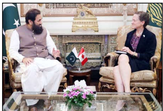
LAHORE: Canadian High Commissioner to Pakistan Leslie Scanlon meeting with Governor Punjab Muhammad Balighur Rehman at Governor House.

On the conclusion of the visit, the Saudi delegation also met with Army Chief General Syed Asim Munir and discussed various matters and brotherly relations between the two countries.