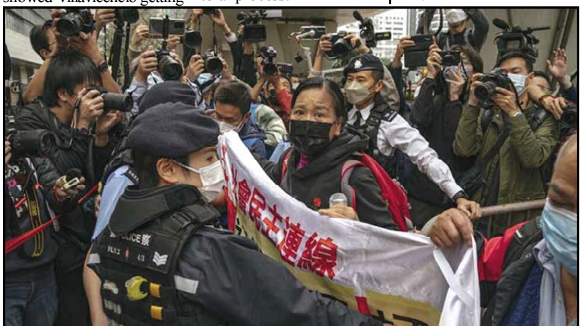
Hong Kong arrests 10 for 'foreign collusion' over violent pro-democracy protests.

Monitoring Desk DUBAI: A Panama-flagged tanker called White Pearl has caught fire near Assaluyeh on Iran's Gulf coast, Iranian state media reported on Thursday, adding that all crew members were safe. "Twenty-two of the ship's crew have been rescued by Iranian rescue teams after the ship's captain requested assistance from the port authorities," state TV quoted a local ports official as saying. The official said that the tanker, carrying 40,000 tons of liquefied petroleum gas, had experienced "a problem in the engine room due to a fire."