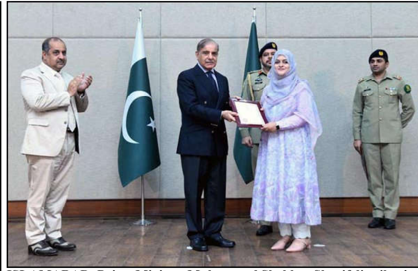
ISLAMABAD: Prime Minister Muhammad Shehbaz Sharif distributing appreciation certificates among the staff of the PM House and PM Office.

erty, unemployment and illiteracy. He pointed out that God Almighty had blessed Pakistan with immense minerals, fertile land and a capable human resource. He said we can exploit this potential by putting our efforts together saying this will also enhance the country's image in the comity of nations. The Prime Minister was appreciative of the support, advice and guidance provided to him by the staff of PM House and PM Office over the last 16 months. On the occasion, the staff of the PM House presented a portrait to the Prime Minister. Earlier, the Prime Minister distributed commendation certificates amongst the staff of the PM Office and PM House