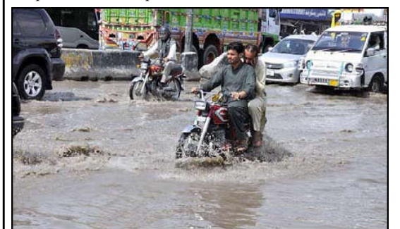
ISLAMABAD: Vehicle passing through rain water accumulated on road after heavy rain in the twin cities.