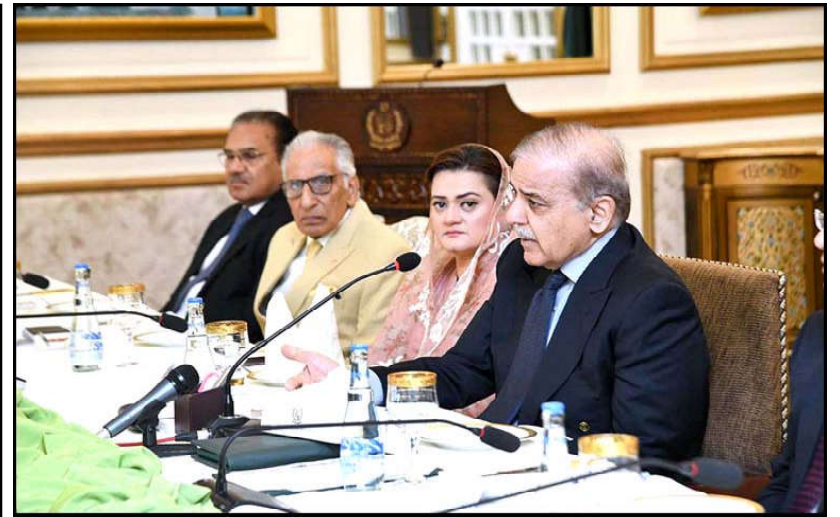
ISLAMABAD: Leader of the Opposition, Raja Riaz Ahmad calls on Prime Minister Muhammad Shehbaz Sharif as part of the consultation process for selection of the Caretaker Prime Minister.

ley of Kashmir turned red with their blood, he added. The prime minister made it clear that without resolving the issue of Kashmiris' right to self-determination, relations with India could not be normalized in any way. Meanwhile Prime Minister Shehbaz Sharif Thursday said Pakistan Muslim League-Nawaz Quaid Nawaz Sharif would come back to Pakistan next month and face his cases in courts. The prime minister, in an interview with a private news channel, said after the formation of the caretaker government he would visit London to consult Nawaz Sharif on his plan for return. Nawaz Sharif would lead the election campaign of his party and would be the next prime minister for the fourth time if the PML-N won the next election, he added.