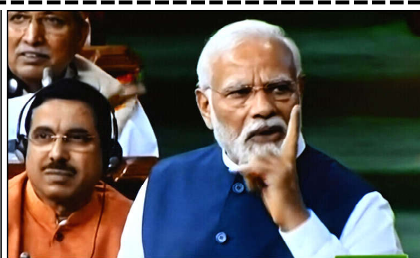
India's Prime Minister Narendra Modi (R) is seen on a television screen as he addresses the lower house Lok Sabha in New Delhi.

the west of the capital. Russian president Vladimir Putin is considering attending the G20 summit in person, a Kremlin source has claimed. The summit is set to take place in September in New Delhi, India, focusing on the theme "One Earth, One Family, One Future."