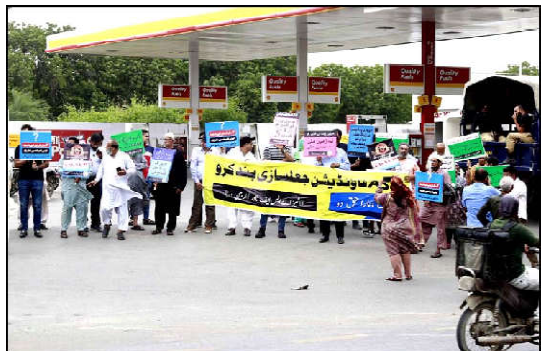
KARACHI: Victims of ASF Tower/Arabian Vista are holding protest demonstration for demanding ownership rights, at Shahrah-e-Faisal near Natha Khan Bridge in Karachi.