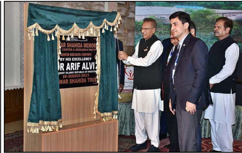
LAHORE: President Dr. Arif Alvi unveiling plaque during ground breaking ceremony the Sarwar Shahida Memorial Cardiac & Research Institute.

opening chapter. Pakistan's core objective, he maintained, is rooted in Quranic teachings of serving society and nurturing a strong sense of responsibility. The president encouraged virtues such as charity, truthfulness, respect for elders, empathy, and cooperation, particularly in the younger generation. While acknowledging the government's role in addressing major issues, he emphasised that every individual in the Islamic framework has a role to play in serving others.