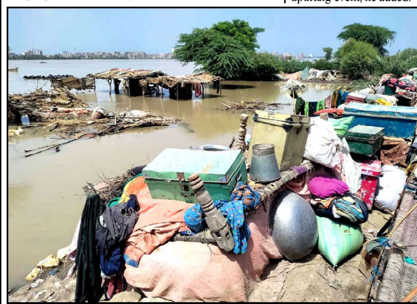
SUKKUR: View of stagnant water after low-level flood at Indus River while flood water entered riverside settlements, showing negligence of concerned authorities, in Sukkur.

LAKKI MARWAT (Online): One person was killed and 4 were injured during police firing on protesters in Lakki Marwat. The police firing incident took place in Dara Pizo area of Lakki Marwat city of Khyber Pakhtunkhwa (KPK). There are reports that the people of Wanda Jogi were protesting on the Indus Highway since late night against the arrest of their associates while the police opened fire on the protesters following exchange of bitter words. Police sources said that the police had arrested 4 people over the dispute with the Lakki Cement Factory.