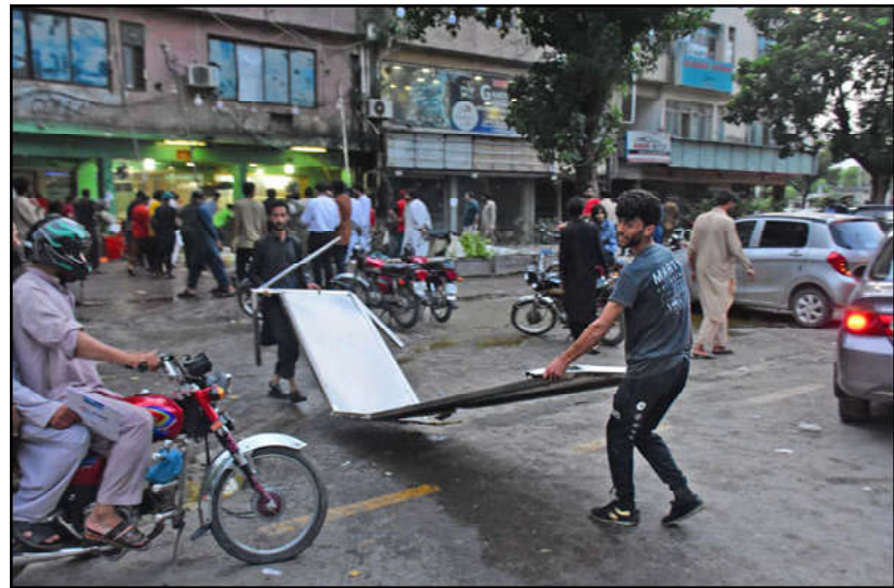
ISLAMABAD: Workers of Anti Encroachment Cell of CDA clears the encroachments of restaurants on footpath at G-8 Markaz during Anti Encroachment Operation in Federal Capital.