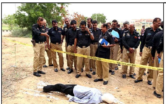
KARACHI: Police officials from Crime Scene Unit and Police Investigation Department are being given hands-on training at the mock crime scenes in Sindh Forensic DNA and Serology Laboratory (SFDL) held at ICCBS University of Karachi.

Talking to APP, she said that "We always buy clothes for ourselves and kids at the sales offered on Independence Day and other such occasions for the next season".