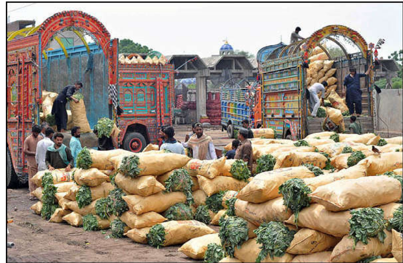
MULTAN: Labourers offloading sacks of vegetables from delivery truck at vegetable market.