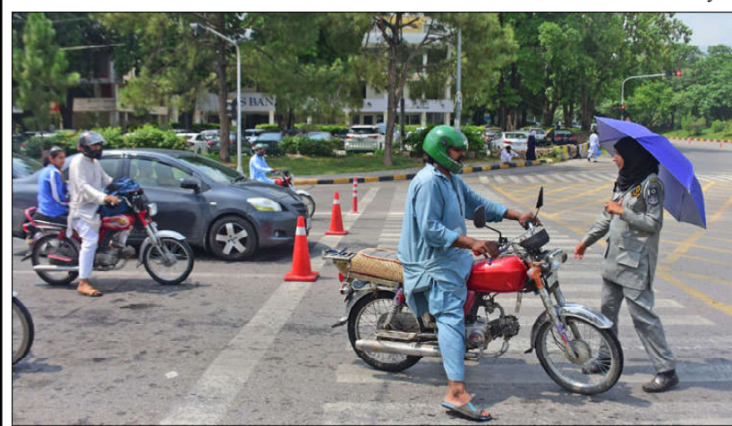
ISLAMABAD: A female traffic police warden is performing her duty at D-Chowk as the authorities appointed new crew to implement traffic rules effectively in Federal Capital.

A comprehensive update was furnished to the committee regarding the news of a golf course construction within Margalla Hills National Park (MHPN) near Sinyari village. Chairperson, IWMB, Rina Saeed Stated that ongoing demarcation of the National Park Boundary was following court directives, adding that 138 acres of land had purportedly been allocated by CDA for the golf course construction, a move contested as encroaching upon Margalla National Park Land.