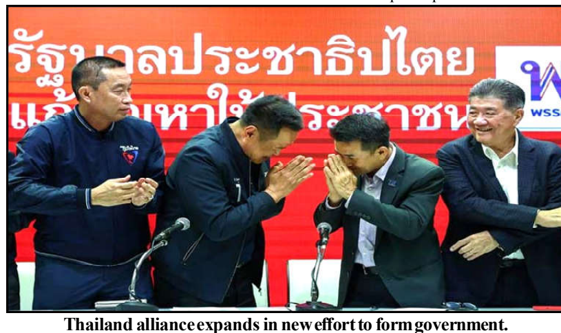
Thailand alliance expands in new effort to form government.

DUBAI: Iran has obtained the technology to build a supersonic cruise missile which is still under test, the semi-official Tasnim news agency reported on Wednesday.