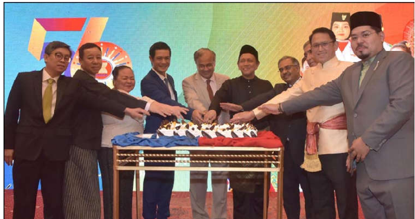
ISLAMABAD: Foreign Secretary Dr. Asad Majeed Khan, High Commissioner of Malaysia Mohammad Azhar Mazlan, and other ambassadors of ASEAN countries cutting the cake during the 56th Anniversary of the ASEAN Day Celebration at a local hotel.

and ensures the continuity of representative governance. The Court's ruling clarified that individuals or entities possess only the authority granted to them by the Constitution or the law, as per Article 4. The supervisory role of the caretaker government established after the dissolution of assemblies, as defined in Article 230 of the Elections Act of 2018, is limited to routine decisions during the interregnum and does not extend to major policy decisions. The resolution said the Supreme Court underscored that the responsibility for organizing elections within the prescribed timeframe, as stipulated in Article 224, lies squarely with the Election Commission of Pakistan.