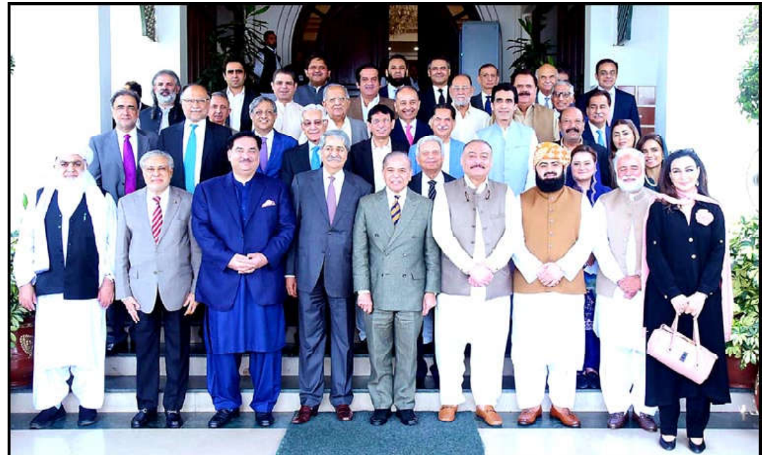
ISLAMABAD: Prime Minister Muhammad Shehbaz Sharif in a group photo with members of the Federal Cabinet.

ment, Federal Minister for Parliamentary Affairs Murtaza Javed Abbasi confirmed the development, saying that the elected government has completed its 5-year constitutional term. The parliamentary affairs ministry will issue a notification on the approval of the summary and the formation of the caretaker government, he added. Meanwhile, PM Shehbaz and Leader of the Opposition in NA now have three days as per the Constitution to finalise a name for the caretaker prime minister.