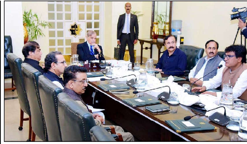
ISLAMABAD: Prime Minister Muhammad Shehbaz Sharif chairing a meeting to discuss the project of setting up an Olympic Village in Islamabad.

RAWALPINDI (APP): Federal Minister for Narcotics Control Nawabzada Shahzain Bugti here on Wednesday paid a farewell visit to Anti-Narcotics Control (ANF) Headquarters. Director General (DG) ANF Major General Muhammad Aneeq ur Rehman Malik, Hilal Imtiaz (Military) welcomed the Federal Minister. Other senior officers of ANF were also present on the occasion. Appreciating the performance of all departments of the institution, the minister expressed satisfaction and good wishes. The DG ANF also presented a souvenir to Nawabzada Shahzain Bugti. Qadri bids adieu to politics LONDON (Online): Chief of Pakistan Awami Tehreek (PAT) Dr Tahir ul Qadri has announced to quit politics. He made this announcement during a press conference here in London. He expressed his views with reference to his political future. Announcing to quit politics on this occasion he said he has discharged his obligation.