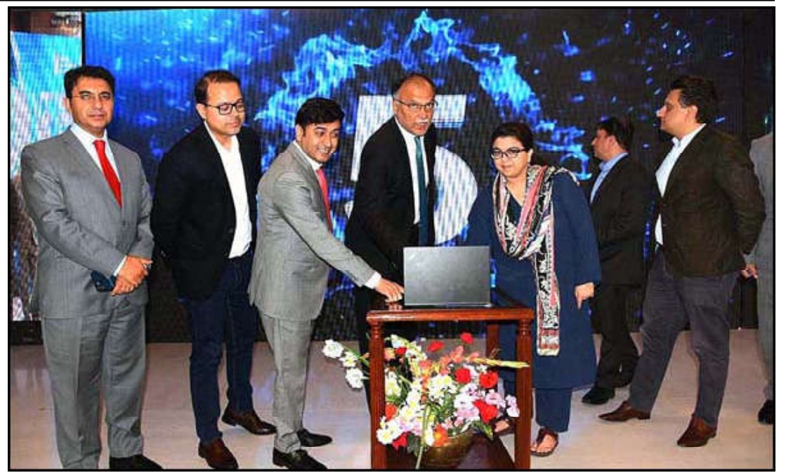
ISLAMABAD: Federal Minister for Planning, Development and Special Initiatives, Prof. Ahsan Iqbal along with Special Assistant to Prime Minister on Youth Affairs Shaza Fatima Khawaja launching Venture Capital Fund at Ministry of Planning.

ing and fastest-growing economies in the world in 10-15 years by ensuring peace, stability, and continuity of policies. "No country in the world has attained success in development without a decade of stability." Recounting the government's initiatives to match the technological changes taking place in the world, he said it established national centres for artificial intelligence, cyber security, big data cloud computing, automation and robotics. Besides, the minister said, a national centre for quantum computing had been set up laying a "future foundation" for information technology infrastructure to contest the development pace at the international level.