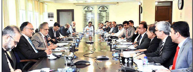
ISLAMABAD: Finance Minister Senator Mohammad Ishaq Dar chaired today meeting of the Executive Committee of the National Economic Council (ECNEC), which approved various national development projects.

setting up Overseas Commission in all provinces, reservation of 10 percent quota for the overseas Pakistanis in all public sector housing projects with 5 percent rebate in case of foreign exchange payment, establishment of dedicated counters at all airports of the country, awarding top ten overseas Pakistan who contributed remittances, allocation of 5 percent seats in the professional public sector educational institutes across Pakistan, need-based scholarship to the overseas Pakistan in the pursuit of higher education, dedicated national saving schemes at attractive rates and linking of NADRA central system at the union levels for various facilities and increasing of number of camp offices for attestation of documents, online biometric verification and auto removal of blacklist passports etc.