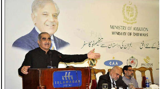
ISLAMABAD: Federal Minister for Aviation and Railways Khawaja Saad Rafique briefing on insightful Interactive Discussion with the Media Personnel at local hotel.