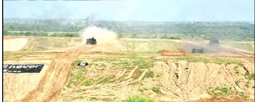
JHELUM: Chief of Army Staff (COAS), General Syed Asim Munir visited Tilla Field Firing Ranges, witnessed Live Fire and maneuvers of the advanced VT-4 tanks, shoot and scout capabilities of long range SH-15 artillery guns and innovative equipment display, near Jhelum.