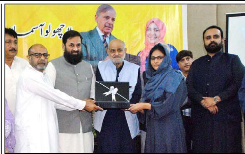
BAHAWALPUR: Governor of the Punjab Engr. Muhammad Baligh ur Rehman Distributing Laptops to students at the Prime Minister's Youth Laptop Program Ceremony at the Islamia University Bahawalpur.

The Governor said that during the previous tenure of Prime Minister Muhammad Nawaz Sharif, more than 0.5 million laptops were given to deserving students on merit. This scheme has been re-launched and this month more than 3000 students of the IUB will be given laptops on merit, he expressed. He said that the superiority of merit was the distinction of the Pakistan Muslim League (N). He said that PTI used the youth generation to promote hatred, adding, we will not allow the spread of hatred among the people of Pakistan through social media. He said that laptops had been provided to the youth on merit and their political affiliation was with any party.