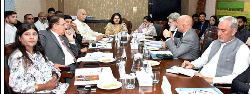
ISLAMABAD: Senator Scemez Ezdi, Chairperson Senate Standing Committee on Climate Change presiding over a meeting of the committee at Parliament House.

project "Dualization of road from Chistan to Chak No 46/3R via Dahnawala (41.154 km) including two-lane link road from Dahmawala to Chaki 175m (4.859 km)" to be executed in the Bahawalnagar District of the Punjab province by the National Highway Authority and the Ministry of Communications. The project was approved by ECNEC at a total cost of Rs. 8,962.982 million without FEC on a 50:50 cost-sharing basis between the Federal Government and the Government of Punjab with the condition of confirmation of Punjab Government cost share. A project submitted by the Ministry of Water Resources, namely "Construction of Awaram Dam (Revised)" was also accorded approval by ECNEC at a cost of Rs. 23, 579.263 without FEC. It would be executed in the Awaran District of Balochistan by the provincial Irrigation Department. The would be financed by federal and provincial governments on an 80:20 cost-sharing basis.