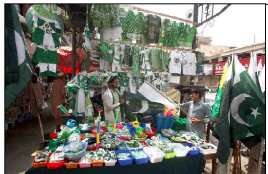
PESHAWAR: Pakistan flags, bunting, printed shirts and other items are being selling on roadside stall in connection of Independence Day of Pakistan coming ahead, at Saddar road.