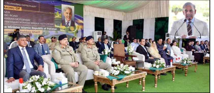
Prime Minister Muhammad Shehbaz Sharif addressing the ground breaking and inauguration ceremony of various development projects for Islamabad and Rawalpindi.

The President reminded the country about the speed of change taking place around the world and the need for Pakistan to get on the train faster.