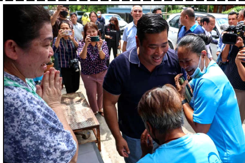
Vacharaesorn Vivacharawongse, 42, the second-eldest son of Thailand's King Maha Vajiralongkorn speaks to well-wishers at the Foundation for Slum Child Care supported by the Royal Family, in Bangkok, Thailand.

battlefield as Moscow's kamikaze drones are difficult to defend against. The drones fly low and slow to avoid traditional air defence systems and can be piloted directly by operators on the ground, unlike the Iranian-shaped drones which are pre-programmed to head to a target that cannot be changed once launched. Analysts have suggested that Russia's defence ministry is keen to get hold of more of the Lancet drones, which reportedly cost around £28,000 each, as a low cost way of making up for losses of their more expensive and sophisticated equipment.