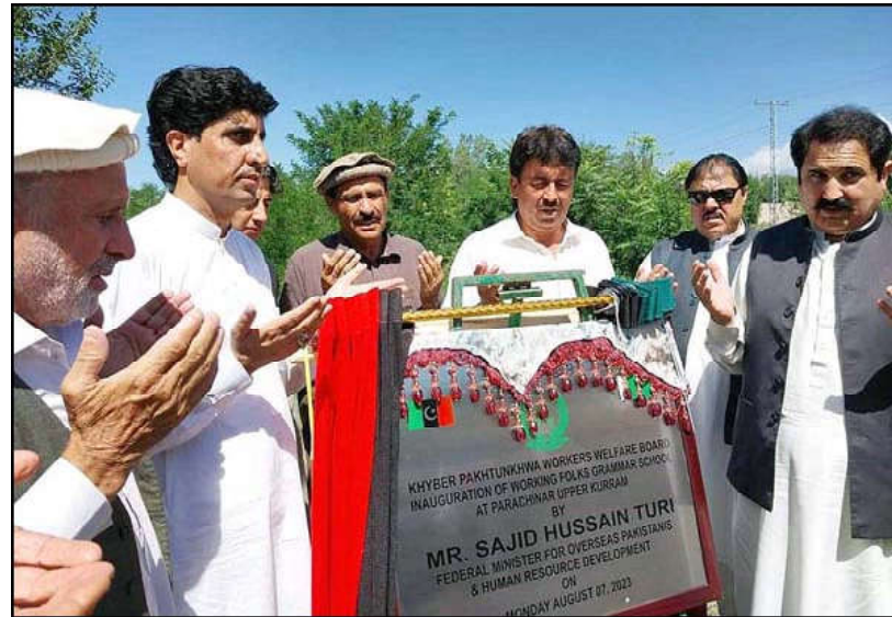
PARACHINAR: Federal Minister for Overseas Pakistani & HRD, Sajid Hussain Turi inaugurates Workers Folk Grammar School.

PID, Pakistan Television (PTV) and Associated Press of Pakistan (APP) had been restored here with his hectic efforts. He said that by inaugurating the PID regional office, another promise made to the local journalists has been fulfilled, adding, it was a good omen for the local journalist community. In this process, he said, Federal Minister for Information and Broadcasting Maryum Aurangzeb extended her full support. The special assistant said the caretaker government will hold its responsibilities within a few days.