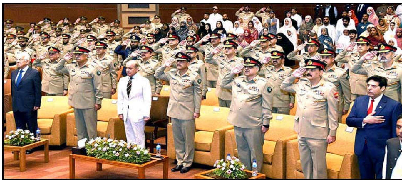
RAWALPINDI: Prime Minister Muhammad Shehbaz Sharif attends a ceremony to honor the Martyrs and Ghazis of Pakistan Army at General Headquarters.

The prime minister underlined that for the elimination of poverty and unemployment, they should rid Pakistan of foreign debts with sincerity, devotion and hard work.