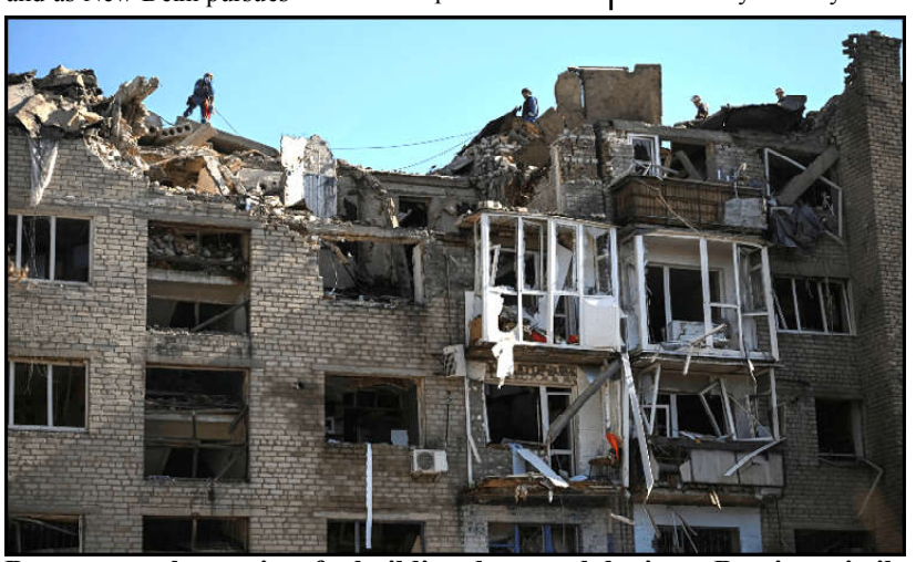
Rescuers work at a site of a building destroyed during a Russian missile strike, amid Russia's attack on Ukraine, in Pokrovsk, Donetsk region, Ukraine.

teorological Agency. Okinawa Gov. Denny Tamaki warned residents to brace for torrential rains and mudslides. "This could mean that the dangers about to hit the area where you are living are unusual and on a scale you have never experienced," he said of the storm. He asked people to prepare escape routes to safety in advance. "Do not let your guard down," he said. Large parts of Okinawa, including the main city of Naha, was being slammed by extremely heavy rainfall, according to weather reports.