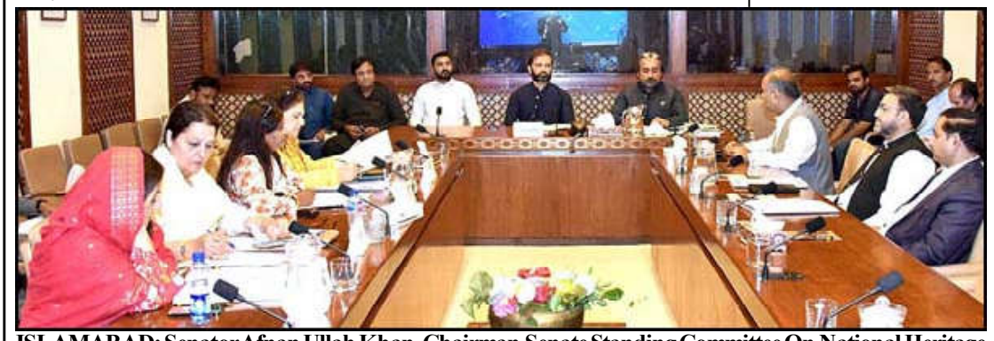
ISLAMABAD: Senator Afnan Ullah Khan, Chairman Senate Standing Committee On National Heritage & Culture presiding over a meeting of the committee at Parliament House.

A seven-day grace period has been granted to officers to enhance their performance standards. The emphasis lies on efficient policing, with special security arrangements slated for the upcoming August 14 events.