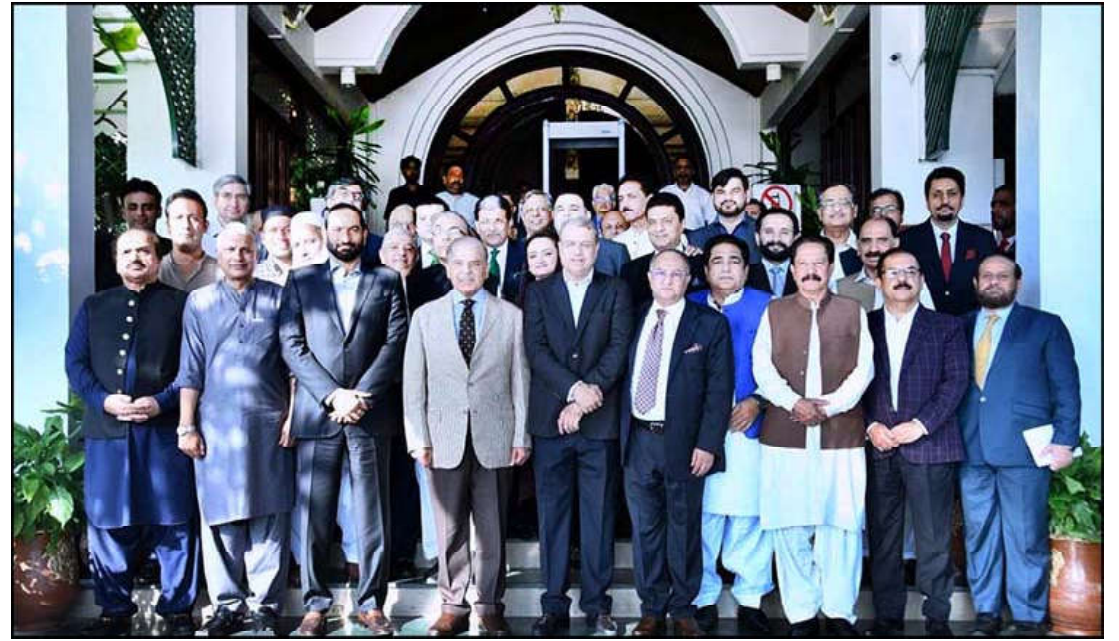
ISLAMABAD: Prime Minister Muhammad Shehbaz Sharif in a group photo with a delegation of Pakistan Broadcasters' Association, All Pakistan Newspapers Society & Council of Pakistan Newspaper Editors.

He said the media had a crucial role to play for the national unity and reduce the temperature as during the last four years, the previous government "poisoned" the society and the rectification was not that easy. He said with the IMF agreement, the country was saved from default and otherwise the situation could have been extremely difficult with long queues at filling stations and people taken to streets.