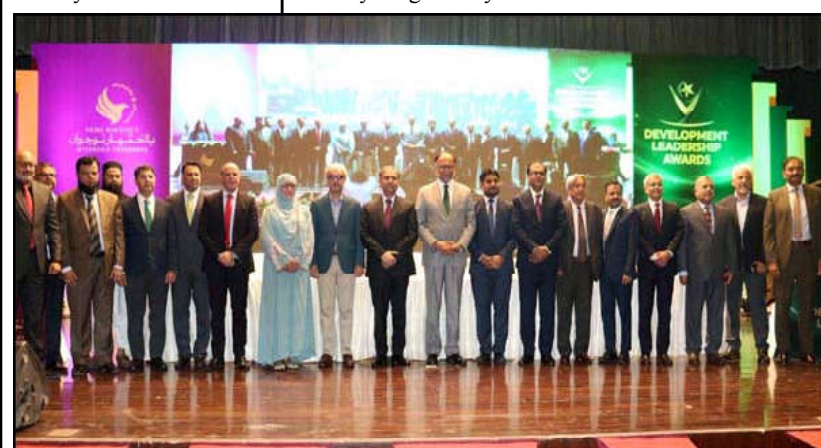
ISLAMABAD: Recognizing the contribution of unsung heroes in the development of Pakistan, the Ministry of Planning Development & Special Initiatives awarded Development Leadership Award to the 75 people and 60,000 interns to young graduates through the Prime Minister's Bakhshiyar Naujawan Internship Program (BNIP) during ceremony at Pakistan-China Centre.

"We envision these growth centers as catalysts for holistic growth where industry, academia, and government collaborate seamlessly, groundbreaking research meets practical application, and local communities flourish alongside the national economic expansion."