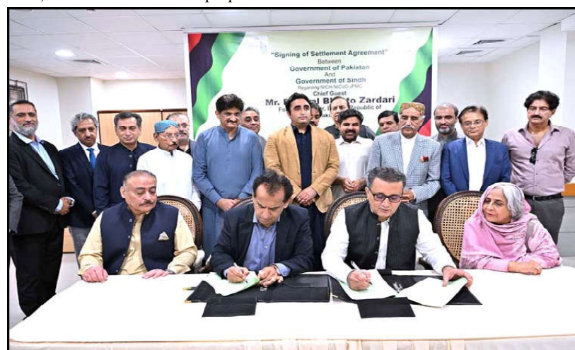
SUKKUR: The settlement agreement of Jinnah Post Graduate Medical College (JPMC) and Sindh Institute of Cardiovascular Diseases (SICVD) signed the MoU between Pakistan and Sindh Government. Chairman Pakistan People's Party and Foreign Minister Bilawal Bhutto Zardari, Federal Minister Syed Khurshid Shah, Federal Minister for National Health Services, Regulations, and Coordination Abdul Qadir Patel, Sindh Chief Minister Syed Murad Ali Shah, Health Minister Sindh Ezra Pechuho and others parents also.

However, as per the initial report, out of 12 total wheels of locomotive were jammed when the train started its journey from Karachi which should have been removed. Besides, a piece of railway track near the accident site was also damaged, which led to the accident.