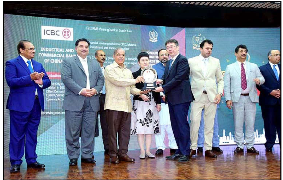
ISLAMABAD: Prime Minister Muhammad Shehbaz Sharif presenting awards to heads/representatives of Chinese companies operating in Pakistan under the CPEC.

The COAS reiterated, "Terrorism has no place in Pakistan and the involvement of Afghan nationals in terrorist incidents in Pakistan is detrimental to regional peace, stability and deviation from the Doha Peace Agreement by the interim Afghan Government." He also said, "Pakistan has concerns over sanctuaries available to banned outfits and liberty of action they enjoy on Afghan soil.