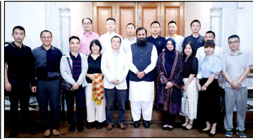
LAHORE: A delegation of Chinese Consulate led by the Chinese Consul General, Zhao Shiren in a group photo with Governor of Punjab Muhammad Balighur Rehman at Governor House.

Organization of Islamic Cooperation and the United Nations Organisation. The religious leadership also stated that the Muslim and Christian leaders would celebrate the Independence Day of Pakistan in a befitting manner. The religious leadership said, "We established Pakistan and make its a prosperous and progressive country." The religious leadership also stated that the Constitution of Pakistan provides equal rights to the followers of all religions. "No enemy of the country will be allowed to disturb peace in the country."