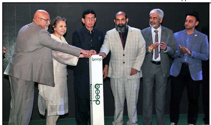
ISLAMABAD: Federal Minister for IT and Telecommunication Syed Amin Ul Haque launching Pakistan's First Communication APP "beep".