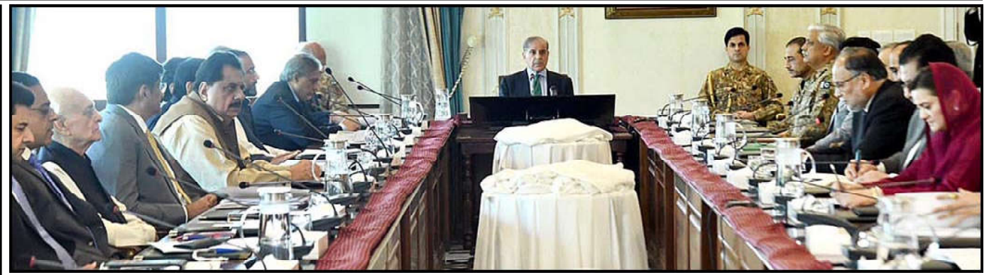
ISLAMABAD: Prime Minister Muhammad Shehbaz Sharif chairs a meeting of the Apex Committee of Special Investment Facilitation Council.

ISLAMABAD (APP): Chief of Staff of the Sultan's Armed Forces of Oman, Vice Admiral Abdullah Bin Khamis-Al-Raisi called on Chief of the Air Staff, Air Chief Marshal Zaher Ahmed Baber Sidhu at Air Headquarters on Monday and lauded the exceptional professionalism of the PAF personnel. During the meeting, key areas of mutual interest, geo-political environment and regional developments were discussed, a Pakistan Air Force (PAF) news release said. The Chief of the Air Staff briefed the visiting dignitary as regards to the overall framework of PAF's modernisation drive through smart procurements, induction of niche technologies and revamping of training in line with contemporary trends. The Air Chief reiterated his sound determination to further elevate the existing ties in areas of military cooperation and training, especially in the domains of cyber, electronic warfare, space and computing.