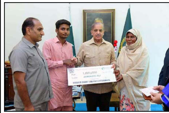
ISLAMABAD: Prime Minister Muhammad Shehbaz Sharif presenting a cheque of 1 million rupees to Jamshed Ali in recognition of his exceptional performance by securing the first position in Matriculation Examination 2023 in Gujranwala Board.

through seminars and project inaugurations; which would be augmented by the SIFC's website, being launched shortly. It gave final approval of the projects, presented by the ministries, for attracting investments from friendly countries, under the umbrella of SIFC, in key sectors of agriculture, livestock, mining, minerals, information technology and energy. The Apex Committee showed all-out support for successful conduct of the upcoming visit of a high-level delegation from the Kingdom of Saudi Arabia to Pakistan through the SIFC platform. The prime minister directed to make this inaugural visit a momentous event.