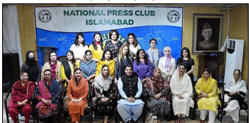
ISLAMABAD: Speaker National Assembly Raja Pervez Ashraf in a group photo with participants of the reception to pay tribute to "The Women Parliamentarians in Strengthening Democracy" at National Press Club.

She said BISP demonstrated exemplary financial management by disbursing Rs 404.2 billion during the last year, with a near-perfect utilization rate of 99.99%. This seamless disbursement mechanism ensured timely financial assistance to beneficiaries. A transformative step towards improving data accuracy and efficiency, the Dynamic Registry was launched for real-time socio-economic data updates. The transition from a static registry to a dynamic one with real-time updates ensured the most current information on beneficiaries. Notably, 2.8 million households were re-surveyed in the last five months alone.