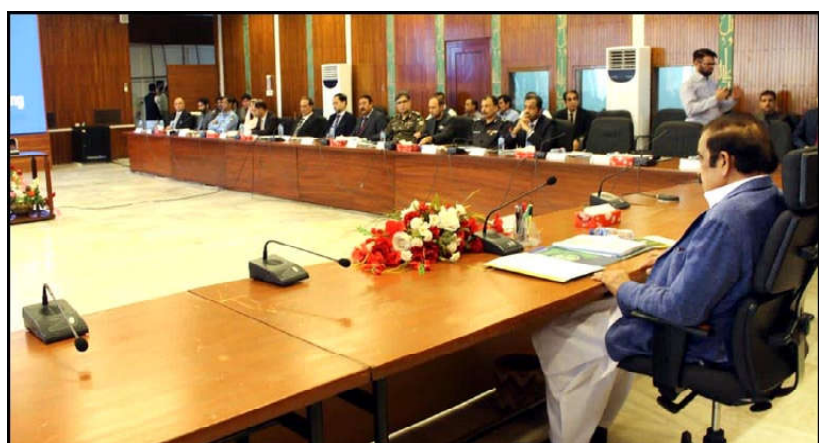
Federal Minister for Interior, Rana Sana Ullah Khan chairing NACTA's fourth board of Governors meeting in Islamabad.