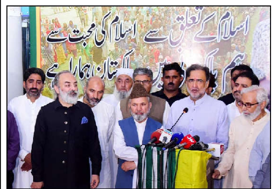
Adviser to the Prime Minister on Kashmir Affairs and Gilgit-Baltistan Qamar Zaman Kaira inaugurating the corner at National Monument Museum Islamabad.

The Adviser said that Prime Minister Muhammad Shehbaz Sharif and Foreign Minister Bilawal Bhutto Zardari were effectively highlighting the Kashmir issue at all available forums including the United Nations General Assembly (UNGA).