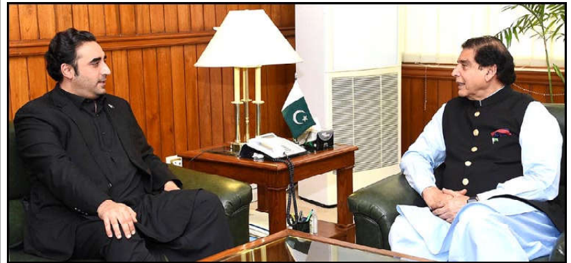
ISLAMABAD: Federal Minister for Foreign Affairs Bilawal Bhutto Zardari called on Speaker National Assembly Raja Pervez Ashraf at Parliament House

ists killed in attack were Afghan citizens. Decision has been taken to send cricket team to participate in world cup in India. We have never mixed sports with politics. There are security concerns. Pakistani team will have to be provided fool proof security. We are concerned over targeting minorities in India.