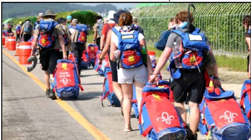
British scout members leave the World Scout Jamboree campsite in Buan, South Korea.

media that the overall "toll from the collapse" has reached five while, according to ISNA, rescue operations were underway to find others who may be trapped under the rubble. According to AFP, authorities had begun the demolition of one building when five others collapsed. Photographs from the scene issued by Tasnim showed rescuers and heavy equipment working below a pile of debris and twisted metal several metres (yards) high, with other unfinished and partially damaged buildings around them.