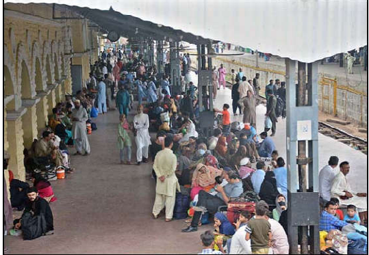
KARACHI: Many passengers are stuck at Cantt Station because of the derailed Hazara Express near Nawabshah.