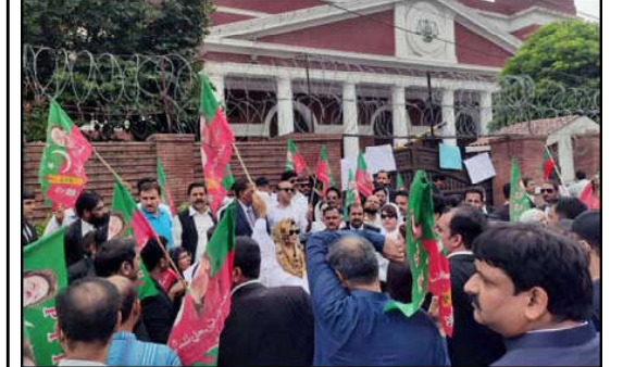
LAHORE: Advocate members of Tehreek-e-Insaf (PTI) are holding protest demonstration against arrested former prime minister and PTI Chairman Imran Khan, outside Supreme Court Registry.