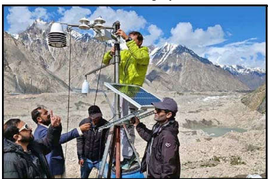
GILGIT: In the collaboration of EPI Gilgit-Baltistan, KTU, UOB, and University of Maitlaan EvK2CNR successfully installed the Automate Weather Station in Askoli, Urdas and Candolia.

petition Islamic University Bahawalpur is an educational institution wherein the scandal of obscene videos has surfaced. Chief security officer of the university was arrested in obscene videos scandal. It has been prayed in the petition that the matter is very sensitive, therefore, the court should order to constitute JC or tribunal to inquire into the matter. The court itself should monitor the inquiry of this scandal.