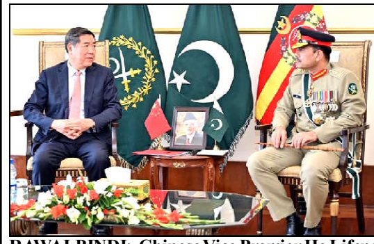
RAWALPINDI: Chinese Vice Premier He Lifeng met General Syed Asim Munir, COAS. During the meeting, matters of mutual interest and defence cooperation were discussed. Both reiterated the desire to further enhance and strengthen bilateral relations in all fields.

During the signing ceremony the minutes of the 11th Meeting of Joint Cooperation Committee