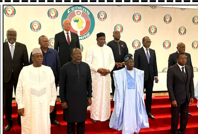
Nigeria President, Bola Ahmed Tinubu, second from left, poses for a group photograph with other West Africa leaders after a meeting in Abuja Nigeria.

Ukrainian officials said. One of the two missiles that hit the central city of Kryvyi Rihon destroyed part of an apartment building between the fourth and ninth floors. Interior Minister Ihor Klymenko said, Video showed black smoke billowing from corner units and burned out or damaged cars on a tree-lined street.