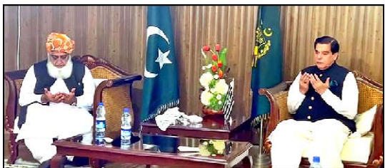
ISLAMABAD: Speaker National Assembly Raja Pervez Ashraf offering foteha for the martyrs of Bajur blast with President of Jamiat Ulema-e-Islam Maulana Fazal-ur-Rehman.

ISLAMABAD (APP): Minister for Information and Broadcasting Marriyum Aurangzeb on Monday said that contrary to reports and speculation by certain sections of the media, and as reported in Dawn newspaper today, Prime Minister Shehbaz Sharif has not chosen or ruled out any candidate for interim prime minister as yet. In a tweet, she said that