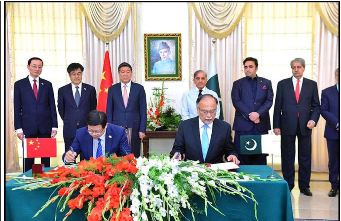
ISLAMABAD: Prime Minister Muhammad Shehbaz Sharif and Vice -Premier of State Council of China He Lifeng witnessing the signing ceremony of agreements/MoUs regarding cooperation between the two countries in various fields.

Prime Minister Shehbaz said CPEC was going to turn around Pakistan's economy through the multiple programmes and initiatives.