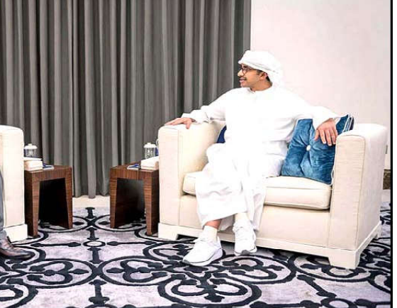
ABU DHABI: Foreign Minister of Pakistan Bilawal Bhutto Zardari expressed his heartfelt condolence with Foreign Minister of UAE Sheikh Abdullah Bin Zayed Al Nahyan on demise of Sheikh Saeed Bin Zayed, discussed bilateral relations & regional & global issues of mutual interest.

He praised China for embarking on the "journey of development