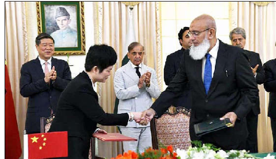
ISLAMABAD: Prime Minister Muhammad Shehbaz Sharif and Vice-Premier of State Council of China He Lifeng witnessing the signing ceremony of agreements/MoUs signed between the two countries in various fields.