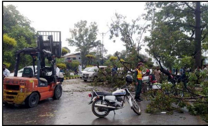
RAWALPINDI: Commuters pass near fallen tree due to heavy downpour of monsoon season while rescue operation underway, in Rawalpindi.

heinous act that can't be justified at all" he remarked. While paying tribute to the martyrs, the chief minister said that citizens of Khyber Pakhtunkhwa especially tribal people and our security forces have rendered matchless sacrifices for reinstating and establishing peace in the region; we will not let those sacrifices go in vain, he said. Meanwhile, the chief minister also met the elders of district Bajaur and heirs of the martyrs and expressed his heartfelt sympathies over the irreparable loss of human lives. He prayed for the higher ranks of martyrs and early recovery of the injured ones.