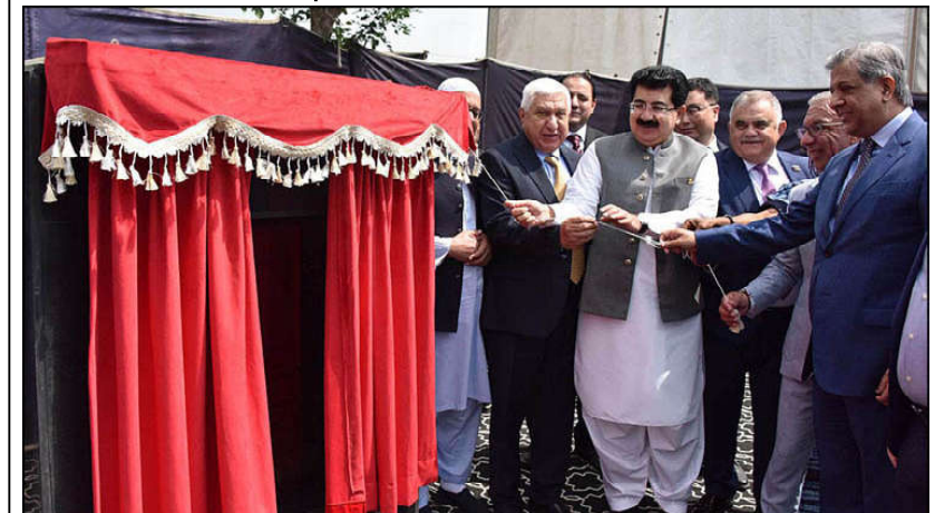
ISLAMABAD: Chairman Senate, Muhammad Sadiq Sanjrani, president of the Inter-Parliamentary Union (IPU), Duarte Pacheco and Federal Minister for Law and Justice, Senator Azam Nazeer Tarar in inaugurating the ground breaking ceremony of the Permanent Headquarter of International Parliamentarians' Congress (IPC) at Diplomatic Enclave.

Sheikh Abdullah Bin Zayed Al Nahyan appreciated the valuable contributions made by the Pakistani community in the development of the UAE.