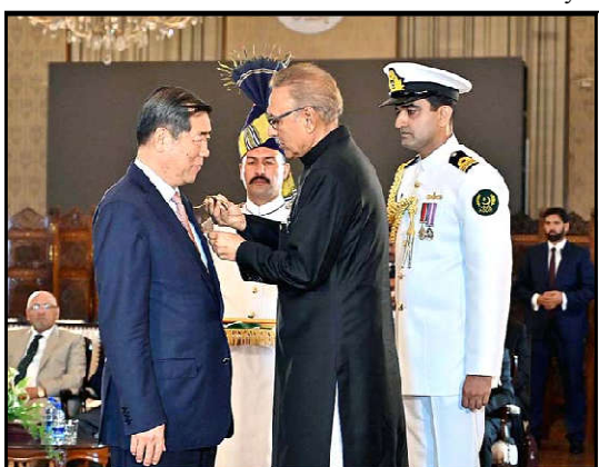
ISLAMABAD: President Dr. Arif Alvi conferring the award of Hilal-e-Pakistan upon the Special Representative of the Chinese President Xi Jinping and the vice -Premier of the State Council of China, Mr. He Lifeng, at a special investiture Ceremony held at Aiwan-e-Sadr.