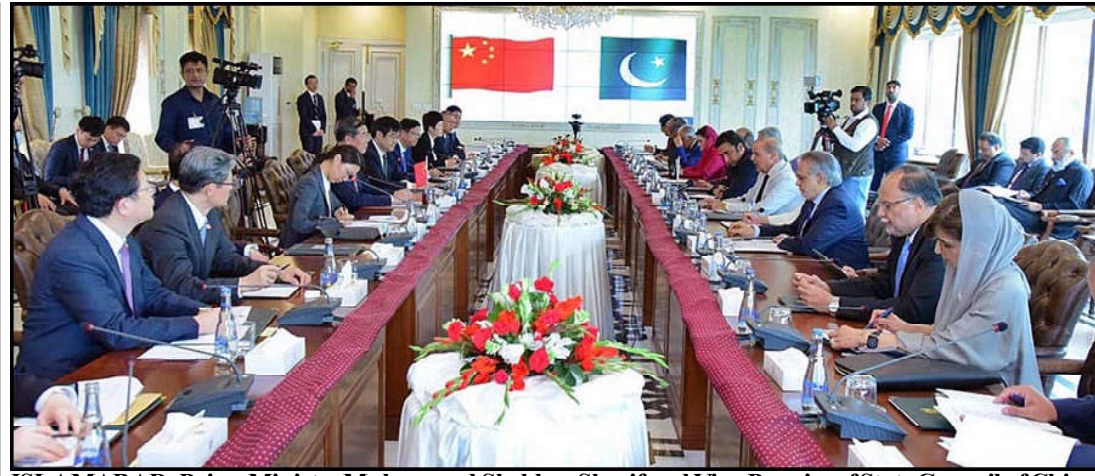
ISLAMABAD: Prime Minister Muhammad Shehbaz Sharif and Vice-Premier of State Council of China, He Lifeng in delegation level talks at Prime Minister's Office.

Conveying his gratitude to the President, the Chinese Vice-Premier recalled President Dr Arif Alvi's solidarity visit to China in March 2020, saying that the visit would be remembered by the people of China as he undertook it during a difficult time despite the risks of COVID-19 pandemic.