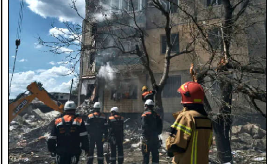
Emergency services work at a scene after a missile hit an apartment building in Kryvyi Rih, Ukraine.

Sweden and Denmark have seen several protests in recent weeks where copies of the Quran have been damaged or burned, causing outrage among Muslims. Sweden's embassy in Baghdad was stormed and set ablaze by angry protesters. In a phone call, Fidan told his Swedish counterpart Tobias Billstrom that continuation of such "vile actions" under the guise of freedom of expression was unacceptable, the source said.