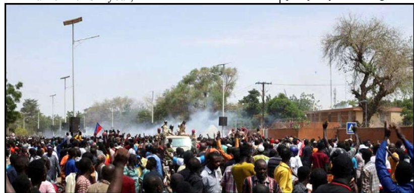
Nigerien security forces launch tear gas to disperse pro-junta demonstrators gathered outside the French embassy, in Niamey, the capital city of Niger.