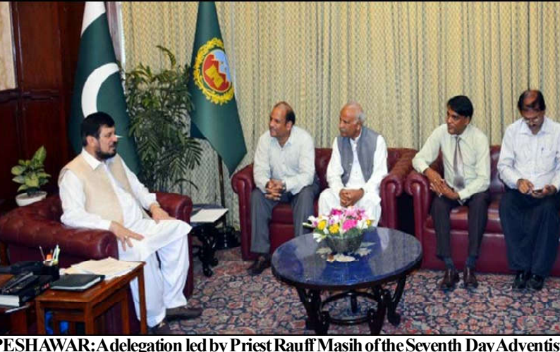
PESHAWAR: A delegation led by Priest Rauff Masih of the Seventh Day Adventist Church meeting with Governor Khyber Pakhtunkhwa, Haji GhulamAli.

Khosa hoped for ef measures from caretaker government, and urged individuals to work country's the betterment.