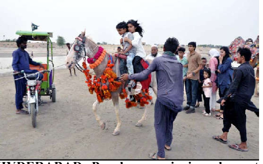
HYDERABAD: People are enjoying pleasant evening and cooling themselves during cloudy weather of summer season, at River Indus in Hyderabad.