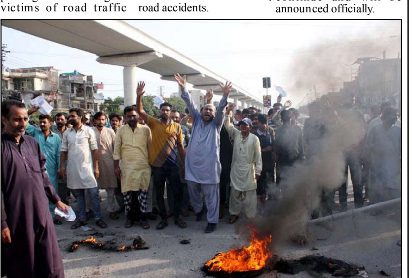
LAHORE: Residents of Kharak block road and burn tyres and electricity bills as they are holding protest demonstration against massive unemployment, increasing price of daily use products, inflation price hiking and the highly inflated electricity bills, held at Multan road in Lahore.

office of EC PESHAWAR (APP): Chief Secretary Khyber Pakhtunkhwa Chaudhry Nadeem Aslam, Inspector General of Police Akhtar Havat Gandapur on Sunday visited office of Provincial Commissioner KP in connection of local bodies by-elections.Polling remained peaceful throughout 21 districts without any break from 8am to 5pm.The Spokesman of ECP said that counting process is continue and will be