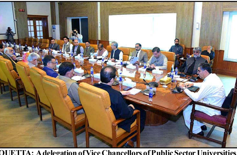
QUETTA: A delegation of Vice Chancellors of Public Sector Universities of Balochistan called on Caretaker Prime Minister Anwaar-ul-Haq Kakar.

The youth should be provided with ample opportunities to seek higher education so that the talented young lot could play their due role in the progress of the country, he said, adding the youth and manpower were the progress over higher the vital assets for a better