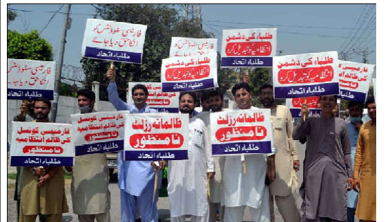
PESHAWAR: Pharmacy Students are holding protest demonstration for their rights, at Peshawar press club.