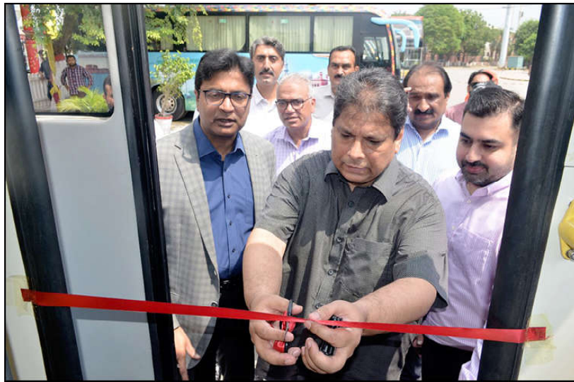
LAHORE: Caretaker Provincial Minister for Information and Culture Amir Meer inaugurates 4 new buses for Culture Department.

part of the effort to combat drug trafficking, a comprehensive crackdown had been initiated across Punjab. The chief minister received detailed briefings from the Secretary of Social Welfare regarding the rehabilitation process for drug addicts and from the Secretary of Health concerning the available treatment facilities. The briefing revealed that 'Roshan Ghar' currently houses up to 100 beds. Present on this occasion were Provincial Minister of Specialized Healthcare and Medical Education Dr. Javed Akram, along with the secretaries of Health, Industry and Excise, Commissioner of Lahore, Director General of Social Welfare, Deputy Commissioner, Principal of Allama Iqbal Medical College and other relevant officers.