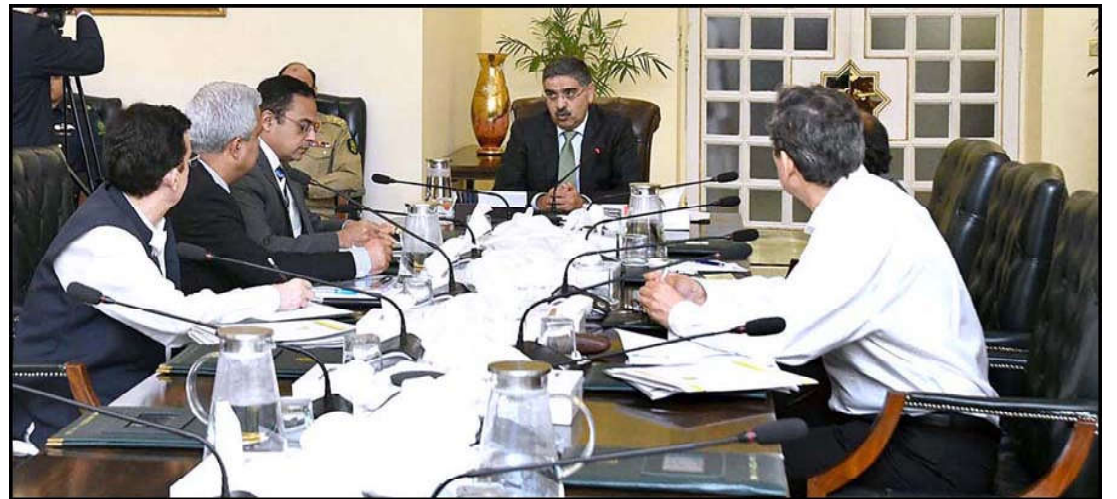
ISLAMABAD: Caretaker Prime Minister Anwaar-ul-Haq Kakar chairs a meeting to review ongoing road infrastructure projects.