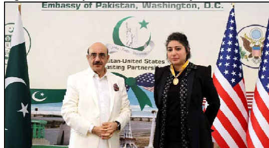
connection with Independence Day in Washington DC.