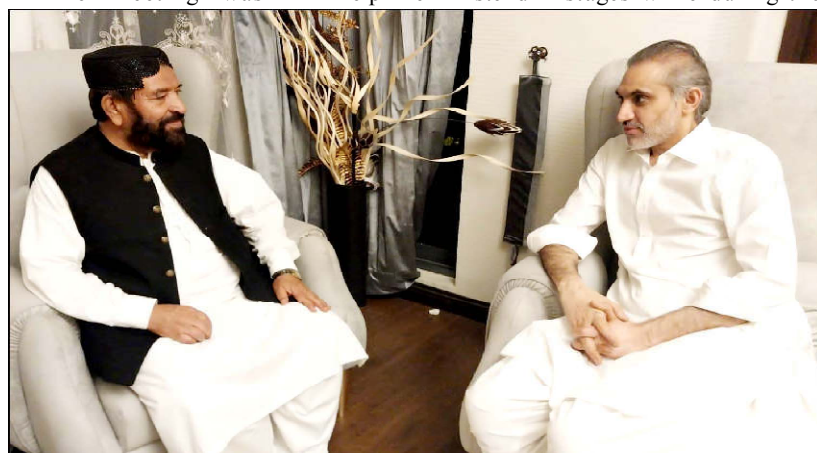
ISLAMABAD: Opposition leader Malik Sikandar Khan Advocate meeting with Balochistan Chief Minister Mir Abdul Qudus Bizenjo

of Karachi to Chaman highway. He also asked for adoption of the out of the box approach to expedite construction work because it was the responsibility of the government to provide facilities to the masses. The prime minister directed the relevant authorities to expedite work on the ongoing projects on priority basis and sought briefing over the proposed projects. He also asked for improving the road network linking Balochistan with other provinces.