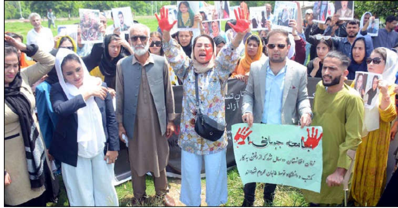
ISLAMABAD: An Afghan national with her hands and face painted red takes part with others in a demonstration against the Taliban government on the occasion of the second anniversary of the Taliban takeover of Afghanistan.