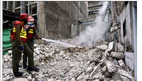
KARACHI: View of site after a fire broken out incident as the fire brigade officials are busy in extinguishing fire and rescue operation, located on LI Chundrigar road in Karachi.