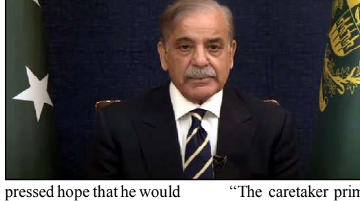
ensure free, fair and transparent elections in Pakistan becoming the caretaker and protect the right to vote of the people.