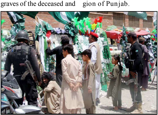
QUETTA: Pakistan flags, buntings, printed shirts and other items are being selling on roadside stalls in connection of Independence Day of Pakistan coming ahead, at Bacha Khan Chowk in Quetta.

The Karakorum Highway (KKH) is the precursor to the China Pakistan Economic Corridor (CPEC), which transformed the road connectivity into efficient link between Pakistan and China. The 1300 km long KKH starts from China's Xinjiang province, after passing placed the national flag of through Gilgit-Baltistan, China and fruits at the ends at Hasan Abdal region of Punjab.