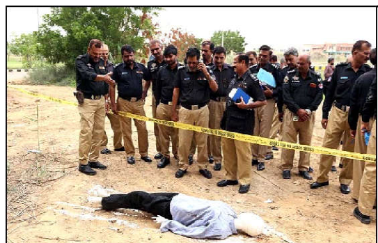
KARACHI: Police officials from Crime Scene Unit and Police Investigation Department are being given hands-on training at the mock crime scene in Sindh Forensic DNA and Serology Laboratory (SFDL) held at ICCBS University of Karachi.

Talking to APP, she said that "We always buy clothes for ourselves and kids at the sales offered on Independence Day and other such occasions for the next season".