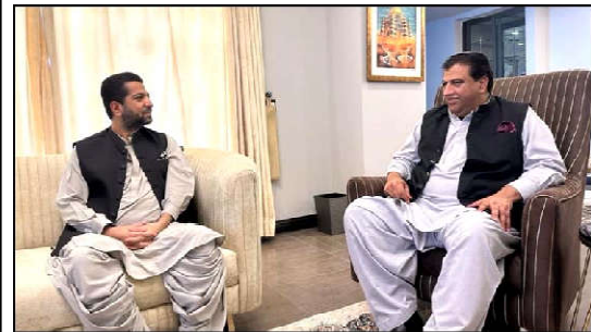
QUETTA: Principal Secretary to Chief Minister Balochistan Imran Gichki meeting with Home Minister Mir Ziaullah Lango

were protesting on the Indus Highway since late night against the arrest of their associates while the police opened fire on the protesters following exchange of bitter words. Police sources said that the police had arrested 4 people over the dispute with the Lakki Cement Factory.