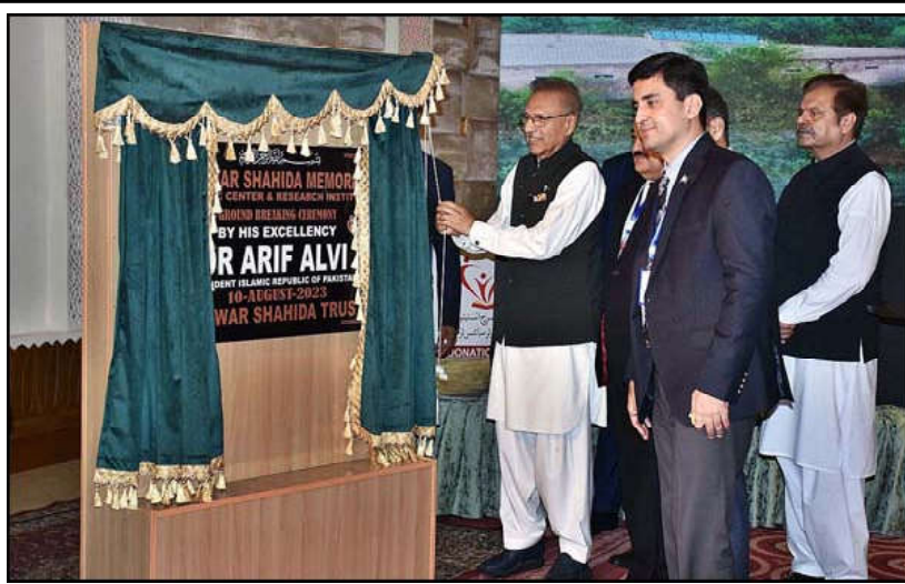
LAHORE: President Dr. Arif Alvi unveiling plaque during ground breaking ceremony the Sarwar Shahida Memorial Cardiac & Research Institute.

The president encouraged virtues such as charity, truthfulness, respect for elders, empathy, and cooperation, particularly in the younger generation. While acknowledging the government's role in addressing major issues, he emphasised that every individual in the Islamic framework has a role to play in serving others.