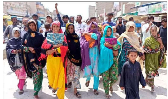
NASEERABAD: Residents of Dera Murad Jamali are holding protest demonstration against high handedness of land grabbers, at Dera Murad Jamali.

The prime minister said that his government played a constructive role to mend the ties with friendly countries.