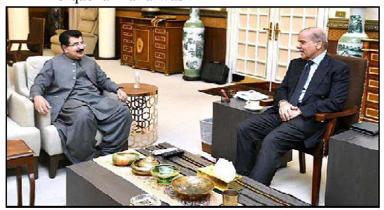
ISLAMABAD: Chairman Senate Muhammad Sadiq Sanjarani called on Prime Minister Muhammad Shehbaz Sharif.

Thus, the Chief Minister approved the matter of giving ownership rights to the people through the provincial cabinet keeping in view the interest of people. In this regard, guidelines were also issued for implementation on the decision of government by the Board of Revenue, it was mentioned further.