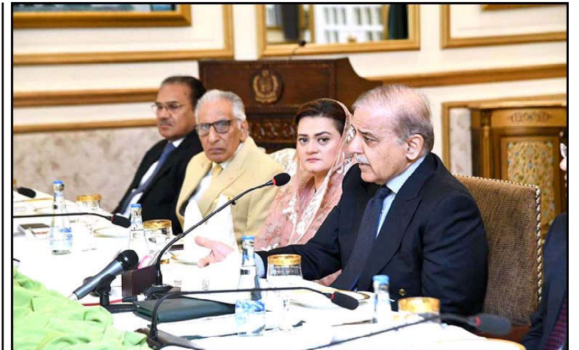
ISLAMABAD: Leader of the Opposition, Raja Riaz Ahmad calls on Prime Minister Muhammad Shehbaz Sharif as part of the consultation process for selection of the Caretaker Prime Minister.

ley of Kashmir turned red with their blood, he added. The prime minister made it clear that without resolving the issue of Kashmiris' right to self-determination, relations with India could not be normalized in any way. Meanwhile Prime Minister Shehbaz Sharif Thursday said Pakistan Muslim League-Nawaz Quaid Nawaz Sharif would come back to Pakistan next month and face his cases in courts. The prime minister, in an interview with a private news channel, said after the formation of the caretaker government he would visit London to consult Nawaz Sharif on his plan for return. Nawaz Sharif would lead the election campaign of his party and would be the next prime minister for the fourth time if the PM-LN won the next election, he added.