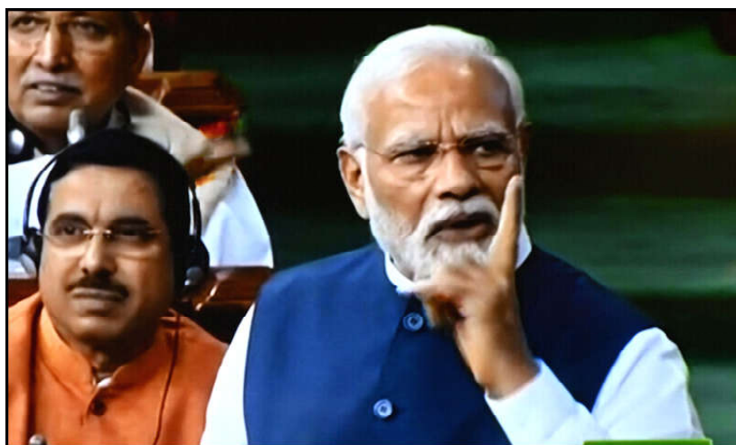
India's Prime Minister Narendra Modi (R) is seen on a television screen as he addresses the lower house Lok Sabha in New Delhi.

But Putin hasn't ruled out his attendance, the Kremlin official told NBC News, seeking to "re-launch himself on the world stage" ahead of next year's election. Likewise, the official claimed that Putin is keen to win over countries that aren't solid in their support for Russia in its invasion of Ukraine.