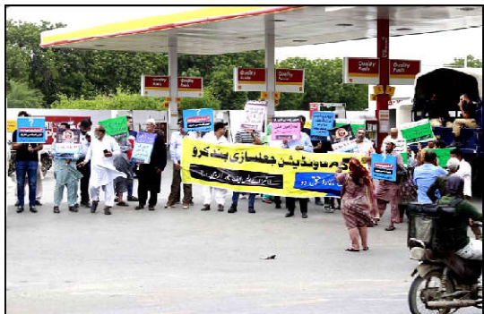
KARACHI: Victims of ASF Tower/Arabian Vista are holding protest demonstration for demanding ownership rights, at Shahr-e-Faisal near Natha Khan Bridge in Karachi.