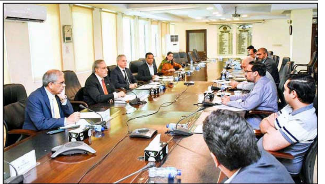
ISLAMABAD: Federal Minister for Finance and Revenue Senator Muhammad Ishaq Dar chaired the meeting of Steering Committee to oversee and guide the progress of work related to outsourcing of airports operations at Finance Division.

The visit of the Saudi delegation manifests the deep interest and willingness on both sides to transform the longstanding fraternal ties into concrete and mutually rewarding economic partnership. The visit will contribute to further enhancement of multifaceted collaboration between the two countries.