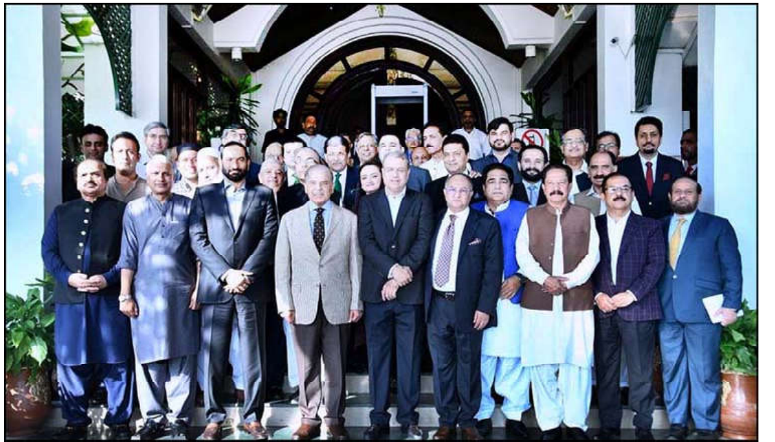
ISLAMABAD: Prime Minister Muhammad Shehbaz Sharif in a group photo with a delegation of Pakistan Broadcasters' Association, All Pakistan Newspapers Society & Council of Pakistan Newspaper Editors.

He said the media had a crucial role to play for the national unity and reduce the temperature as during the last four years, the previous government "poisoned" the society and the rectification was not that easy. He said with the IMF agreement, the country was saved from default and otherwise the situation could have been extremely difficult with long queues at filling stations and people taken to streets.