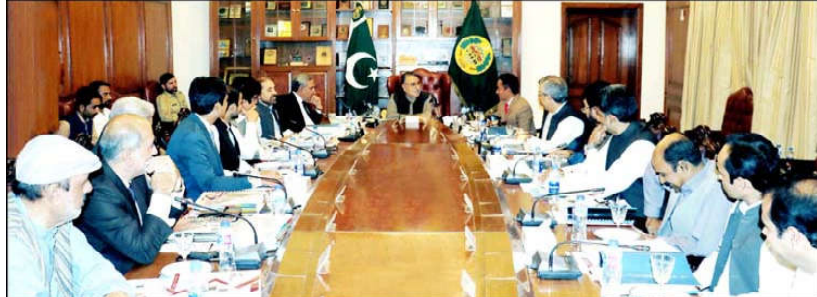
QUETTA: Governor Balochistan Malik Abdul Wali Khan Kakar presiding over 7th meeting of Senate of University of Turbat

The President reminded the country about the speed of change taking place around the world and the need for Pakistan to get on the train faster.