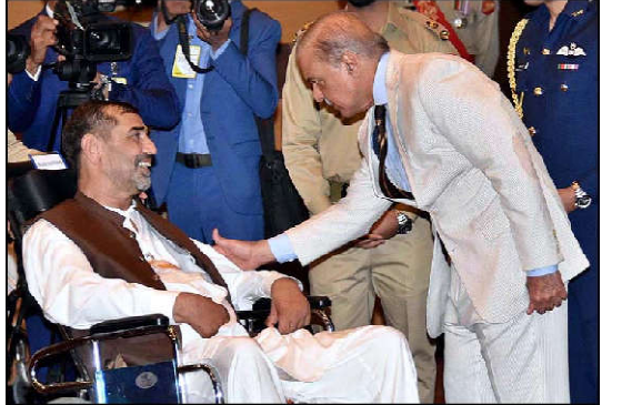
RAWALPINDI: Prime Minister Muhammad Shehbaz Sharif interacting with families of Martyrs during his visit of General.

fake news was being circulated on both social media and some television networks. No word was used in joints rather Parmelia fishplate was being used for railway signal system worldwide as the signal system did not work without it, he said. He explained that it was a special type of fishplate which was imported from Germany or Holland. Investigation into the accident was underway.