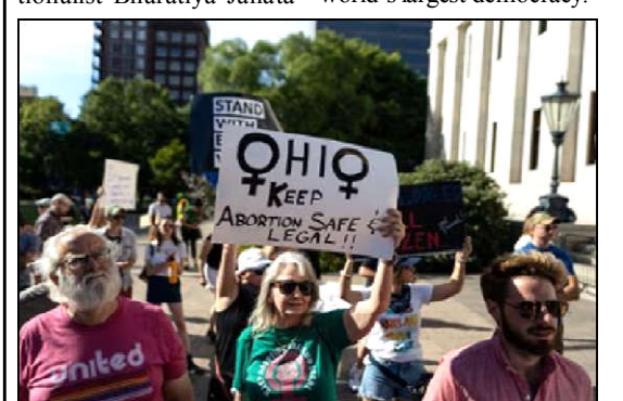
An abortion rights protester holds a sign that says "OHIO KEEP ABORTION SAFE & LEGAL!" at a rally in Columbus, Ohio.

Party (BJP) won 303 seats in the 543-member lower house in the 2019 election and is expected to comfortably defeat the no-confidence vote, which it has dismissed as a headline-grabbing gimmick. Gandhi, the scion of India's premier political dynasty, was restored to parliament on Monday after the Supreme Court last week suspended his defamation conviction over comments criticising Modi. The 53-year-old Gandhi was sentenced to two years imprisonment in March in a case that critics flagged as an effort to stifle political opposition in the world's largest democracy.