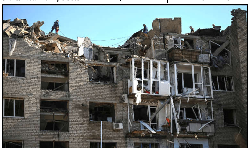
Rescuers work at a site of a building destroyed during a Russian missile strike, amid Russia's attack on Ukraine, in Pokrovsk, Donetsk region, Ukraine.

teorological Agency. Okinawa Gov. Denny Tamaki warned residents to brace for torrential rains and mudslides. "This could mean that the dangers about to hit the area where you are living are unusual and on a scale you have never experienced," he said of the storm. He asked people to prepare escape routes to safety in advance. "Do not let your guard down," he said. Large parts of Okinawa, including the main city of Naha, was being slammed by extremely heavy rainfall, according to weather reports.