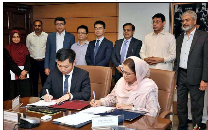
ISLAMABAD: Federal Minister for IT and Telecommunication Syed Amin Ul Haque witnessing signing of MoU between National Telecommunication Corporation (NTC) and Sunwalk.