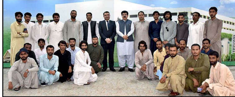
ISLAMABAD: Chairman Senate, Muhammad Sadiq Sanjrani in a group photo with the delegation of the students and faculty members of the University of Makran, Panjgur Balochistan at Parliament House.