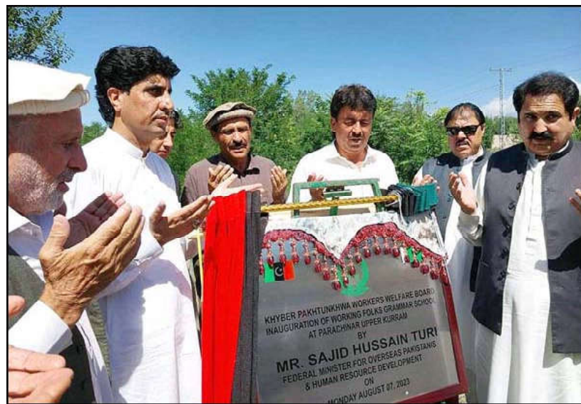
PARACHINAR: Federal Minister for Overseas Pakistanis & HRD, Sajid Hussain Turi inaugurates Workers Folk Grammar School.

PID, Pakistan Television (PTV) and Associated Press of Pakistan (APP) had been restored here with his hectic efforts. He said that by inaugurating the PID regional office, another promise made to the local journalists has been fulfilled, adding, it was a good omen for the local journalist community. In this process, he said, Federal Minister for Information and Broadcasting Maryum Aurangzeb extended her full support. The special assistant said the caretaker government will hold its responsibilities within a few days.