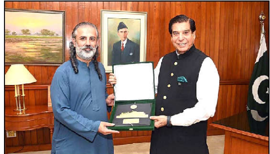
ISLAMABAD: Speaker National Assembly Raja Pervez Ashraf presenting souvenir to Federal Minister for Narcotics Control Nawabzada Shazain Bugti at Parliament House.

Similarly, he approved the reforms in the revenue and administrative structure as well as increase in the salaries of revenue staff. The approval was also given to appear in the departmental exam once instead of twice for the Tehsildar cadre, it was also mentioned in the official hand out. The Chief Minister said that all employees and officers are the machinery of state, as such those having the spirit of public service must get chance to come ahead.