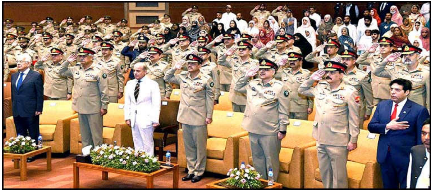
RAWALPINDI: Prime Minister Muhammad Shehbaz Sharif attends a ceremony to honor the Martyrs and Ghazis of Pakistan Army at General Headquarters.

The prime minister underlined that for the elimination of poverty and unemployment, they should rid Pakistan of foreign debts with sincerity, devotion and hard work.