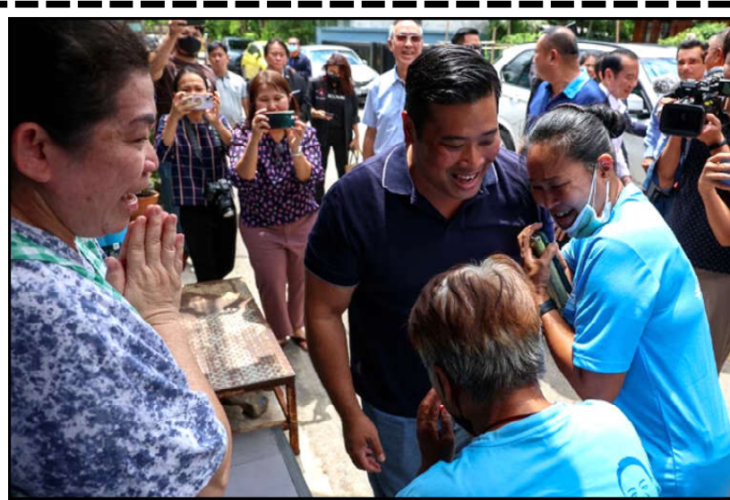
Vacharaesorn Vivacharawongse, 42, the second-eldest son of Thailand's King Maha Vajiralongkorn speaks to well-wishers at the Foundation for Slum Child Care supported by the Royal Family, in Bangkok, Thailand.

battlefield as Moscow's kamikaze drones are difficult to defend against. The drones fly low and slow to avoid traditional air defence systems and can be piloted directly by operators on the ground, unlike the Iranian-shahed drones which are pre-programmed to head to a target that cannot be changed once launched. Analysts have suggested that Russia's defence ministry is keen to get hold of more of the Lancet drones, which reportedly cost around £28,000 each, as a low cost way of making up for losses of their more expensive and sophisticated equipment.