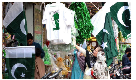
QUETTA: Woman selecting and purchasing national flag printed children dress on ahead of start 76 Independence Day celebration of 14 August.

These centres will enable the beneficiaries in far-flung areas to access the registration facilities through mobile vehicles which have been purchased with the support of the German government and GIZ. Highlighting the one-year performance of BISP, the source revealed that the quarterly stipend of Benazir Kafalat has been increased up to Rs 8750 per family which is given every quarter while the number of beneficiaries of the Benazir Income Support Programme has increased from 7.6 million families to 9 million during the last one year. The BISP staff ensured the distribution of relief money to the deserving ones in the worst conditions during the floods and 70 billion rupees.