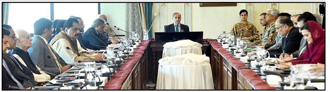
ISLAMABAD: Prime Minister Muhammad Shehbaz Sharif chairs a meeting of the Apex Committee of Special Investment Facilitation Council.

said that the country was facing a number of problems, when the PML-N assumed power in 2013, but it overcame the problems and put the country on development track. However, after it, an experiment was made and a man was put into power, who did not have any experience of running the government, and it led to devastation of the economy, he added. He said, "When the coalition government took power almost 14-months back, we made hard decisions to put the economy back on track and accepted conditions set by the International Monetary Fund in the light of the agreement made by the previous PTI government."