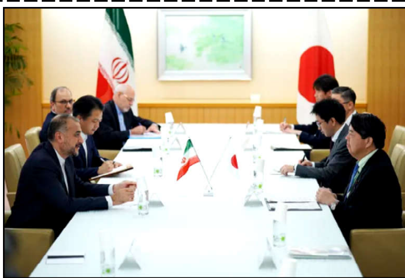
Japanese Foreign Minister Yoshimasa Hayashi and Iranian counterpart Hossein Amir-Abdollahian speak during their meeting in Tokyo.

It claimed the woman "was collecting data for an airstrike during Zelenskyy's visit." The woman attempted to establish Zelenskyy's route, times and visits in the region. She was detained when she tried to pass the information to the Russians, the statement said, without providing evidence.