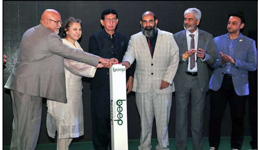
ISLAMABAD: Federal Minister for IT and Telecommunication Syed Amin Ul Haque launching Pakistan's First Communication APP "beep".