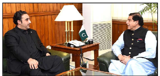
ISLAMABAD: Federal Minister for Foreign Affairs Bilawal Bhutto Zardari called on Speaker National Assembly Raja Pervez Ashraf at Parliament House

The president also briefed the delegation about the grave human rights situation in the Indian Illegally Occupied Jammu and Kashmir.