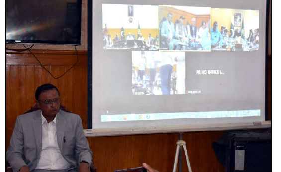
SIBI: Federal Minister for Railways Khawaja Saad Rafique addressing a ceremony of restoration of Sibi-Harnai railway section through video link.

jobs. Inside the FTZ, China Linyi Trade City Co., a merchandising firm, invested in warehousing facilities. "We have fully undertaken warehousing services of the Gwadar Port - Afghanistan fertilizer transfer trade since September 2020. It has completed the storage services of 800,000 tons of fertilizer by March 2023". In 2021, our warehousing service promoted the re-export trade by $60 million, highlighting the role that Gwadar Port has played in connecting surrounding landlocked countries." Liu Hui said in an interview. The company's project in FTZ consists of a commodity exhibition center and bonded warehouse.