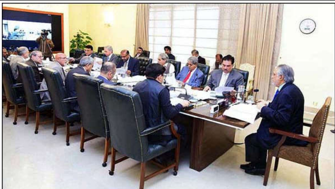
ISLAMABAD: Federal Minister Senator Mohammad Ishaq Dar chaired the meeting of the Cabinet committee on Inter-Governmental Commercial Transactions (CCoIGCT).

The Federal Minister for IT also lauded the efforts of National Information Technology.