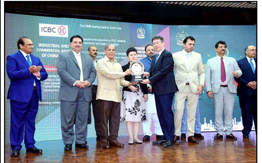
ISLAMABAD: Prime Minister Muhammad Shehbaz Sharif presenting awards to heads/representatives of Chinese companies operating in Pakistan under the CPEC.

He said that the lawyers of Balochistan are ranked among the best lawyers of the country, who have better awareness about law and legal affairs.