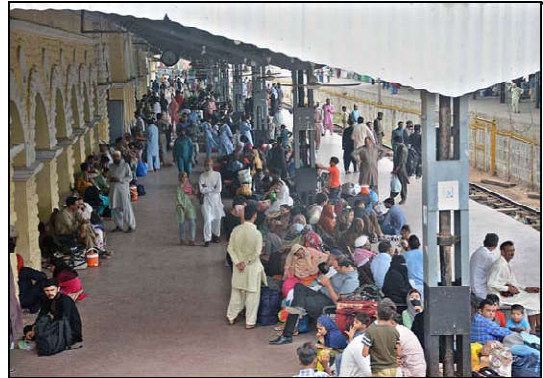
KARACHI: Many passengers are stuck at Cantt Station because of the derailed Hazara Express near Nawabshah.

The religious leadership said, "We established Pakistan and make it a prosperous and progressive country." The religious leadership also stated that the Constitution of Pakistan provides equal rights to the followers of all religions. "No enemy of the country will be allowed to disturb peace in the country."