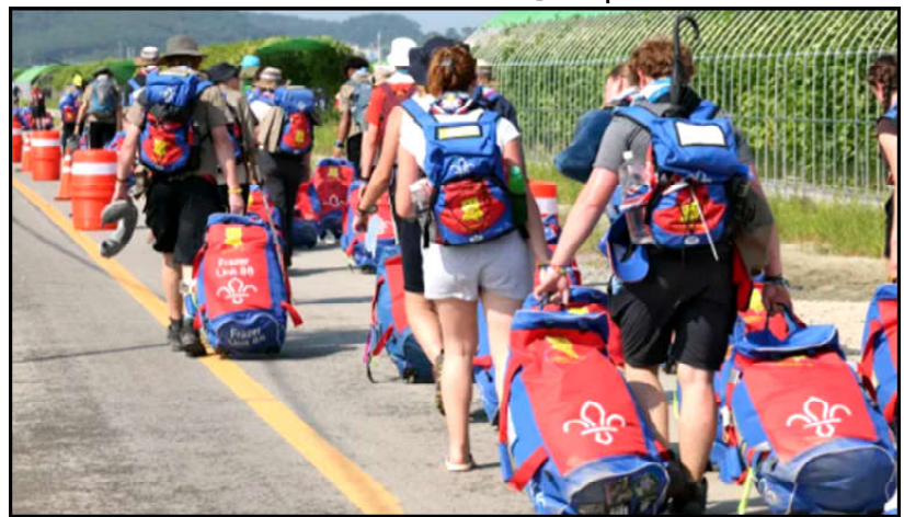
British scout members leave the World Scout Jamboree campsite in Buan, South Korea.

Monitoring Desk CABAZON: Two firefighting helicopters collided while responding to a blaze in Southern California, sending one to the ground in a crash that killed all three people on board. "Unfortunately, the second helicopter crashed and tragically all three members perished, which included one Cal Fire Division chief.