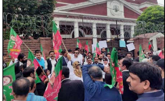
LAHORE: Advocate members of Tehreek-e-Insaf (PTI) are holding protest demonstration against arrested former prime minister and PTI Chairman Imran Khan, outside Supreme Court Registry.

Iranian Minister for Tourism Syed Ezzatollah Zarghami said that the purpose of organizing the Pakistan-Iran Tourism Forum is to increase facilities for tourists. He said that last year 93 lac 11 thousand foreign tourists visited Iran.