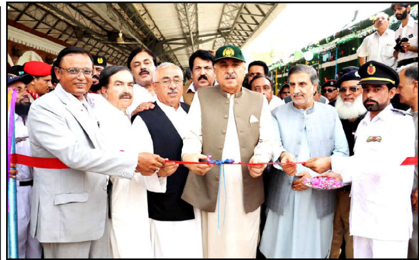
SIBI: Governor Balochistan Malik Abdul Wali Khan Kakar cutting ribbon to restore Sibi-Harnai railway section

"All the officers of the law department deserve praise, she expressed these views while addressing a simple but dignified ceremony of awarding excellence certificates to the officers of law and parliamentary affairs on Monday.