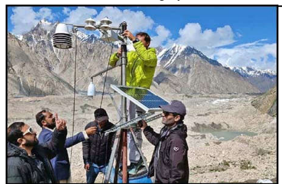
GILGIT: In the collaboration of EPI Gilgit-Baltistan, KIU, UOB, and University of Malilaan EvK2CNR successfully installed the Automate Weather Station in Askoli, Urdas and Candodia.

heinous act that can't be justified at all" he remarked. While paying tribute to the martyrs, the chief minister said that citizens of Khyber Pakhtunkhwa especially tribal people and our security forces have rendered matchless sacrifices for reinstating and establishing peace in the region; we will not let those sacrifices go in vain, he said.