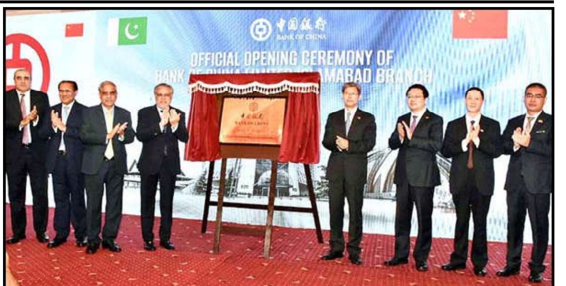
ISLAMABAD: Finance Minister Senator Mohammad Ishaq Dar inaugurated the Branch opening of Bank of China (BOC) at a ceremony.

its partnership with the IPU and provides regular support through its candidacy at International Organization in pursuit of global peace, prosperity, and economic stability. The Finance Minister also informed about the recent economic and financial measures taken by the government which have put the financial position of the country on an upward trajectory. The Finance Minister also mentioned that keeping in view its Strategic position in the region.