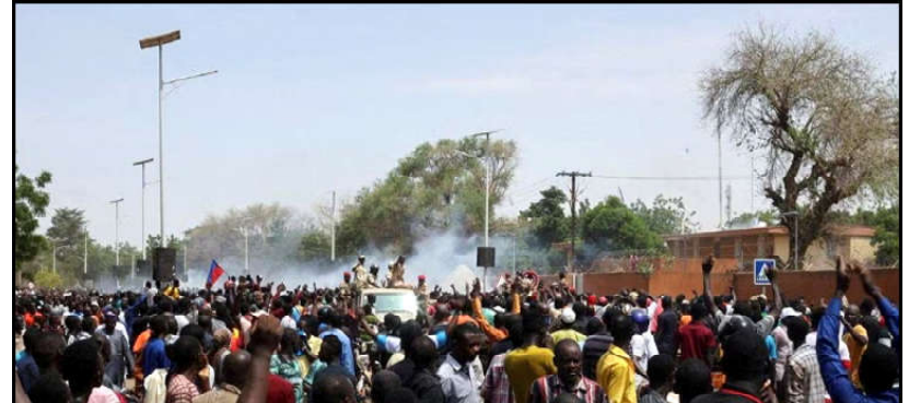
Nigerien security forces launch tear gas to disperse pro-junta demonstrators gathered outside the French embassy, in Niamey, the capital city of Niger.

Monitoring Desk HELSINKI: Denmark's foreign ministers said Sunday the government will seek to make it illegal to desecrate the Quran or other religious holy books in front of foreign embassies in the Nordic country. Foreign Minister Lars Løkke Rasmussen said in an interview with the Danish public broadcaster DR that the burning of holy scriptures "only serves the purpose of creating division in a world that actually needs unity."