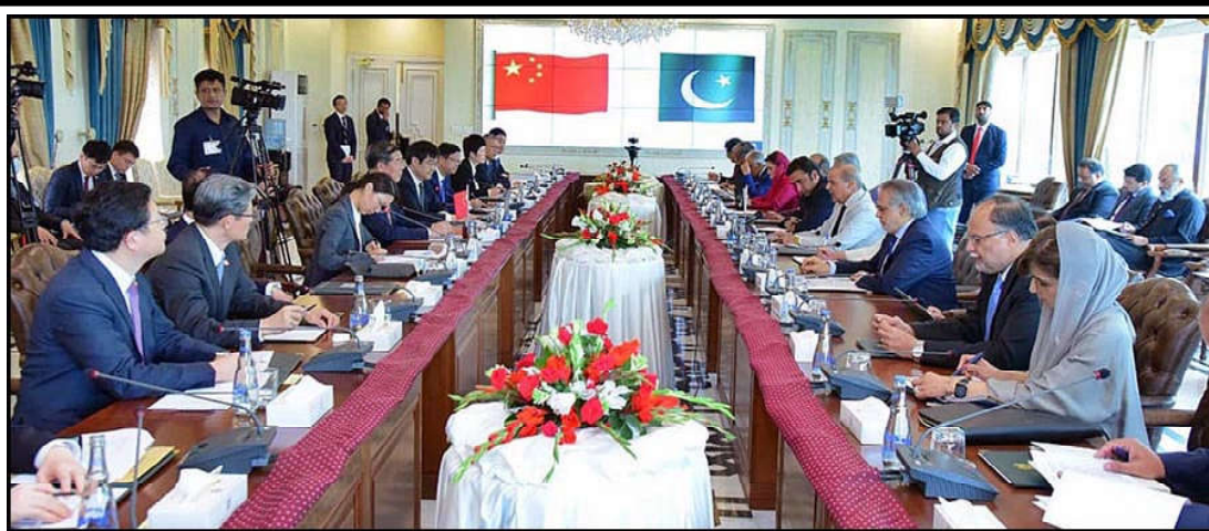
ISLAMABAD: Prime Minister Muhammad Shehbaz Sharif and Vice-Premier of State Council of China, He Lifeng in delegation level talks at Prime Minister's Office.

Talking about the China-Pakistan Economic Corridor (CPEC), the President said that CPEC would transform the economic landscape of Pakistan, besides bringing prosperity to the region. He added that CPEC had considerably helped in overcoming the shortage of electricity in Pakistan. He maintained that Pakistan would continue to extend firm support to China on all its core issues.