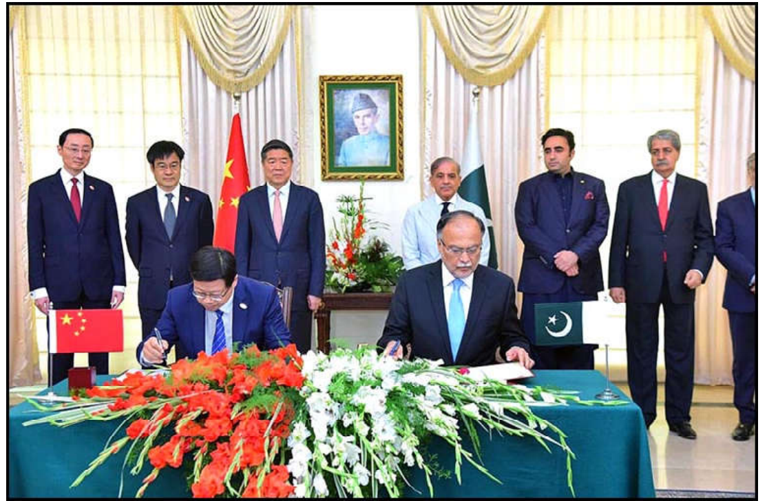
ISLAMABAD: Prime Minister Muhammad Shehbaz Sharif and Vice-Premier of State Council of China He Lifeng witnessing the signing ceremony of agreements/MoUs regarding cooperation between the two countries in various fields.

He also expressed gratitude to the Chinese leadership for supporting Pakistan at the critical juncture with financial support and thanked the Export-Import Bank of China and commercial banks for their loans' roll over in the last few months.