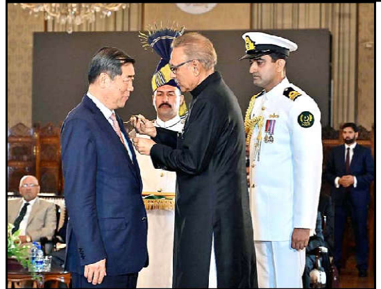
ISLAMABAD: President Dr. Arif Alvi conferring the award of Hilal-e-Pakistan upon the Special Representative of the Chinese President Xi Jinping and the vice-Premier of the State Council of China, Mr. He Lifeng, at a special investiture Ceremony held at Aiwan-e-Sadr.