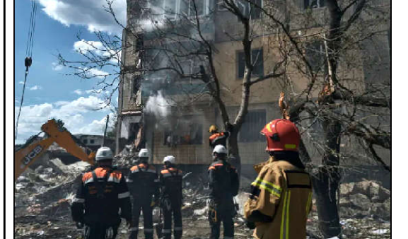
Emergency services work at a scene after a missile hit an apartment building in Kryvyi Rih, Ukraine.

Sweden and Denmark have seen several protests in recent weeks where copies of the Quran have been damaged or burned, causing outrage among Muslims. Sweden's embassy in Baghdad was stormed and set ablaze by angry protesters. In a phone call, Fidan told his Swedish counterpart Tobias Billstrom that continuation of such "vile actions" under the guise of freedom of expression was unacceptable, the source said. Fidan and Billstrom also discussed Sweden's NATO military alliance membership application, the source added. Swedish Prime Minister Ulf Kristersson said on Sunday that he had held talks with Danish Prime Minister Mette Frederiksen and that they agreed the situation was dangerous. "We need to take measures to strengthen our resilience," he said in a post on Instagram. The Swedish government said this month that it would examine whether it could change Sweden's Public Order Act to give police the possibility to stop demonstrations that threatened Sweden's security.