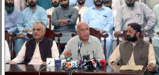
QUETTA: Central President National Party (NP) Dr. Abdul Malik Baloch addresses to media persons during press conference, at Quetta press club.

He alleged that the distribution of land is continuing in Gwadar while the jobs are being sold in the province.