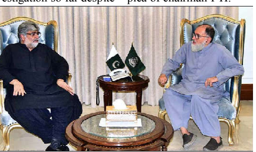
QUETTA: Caretaker Chief Minister Balochistan MirAli Mardan Khan Domki meeting with Caretaker Provincial Minister Prince Ahmed Ali Baloch.

It is pertinent to mention here SC changed the