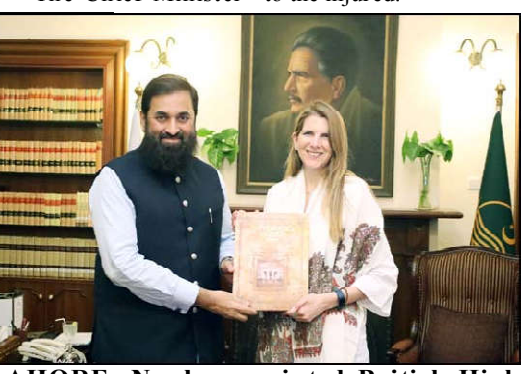
LAHORE: Newly appointed British High Commissioner to Pakistan, Jane Marriott, presenting historical book of Governor House to Governor Punjab Muhammad Balighur Rahman