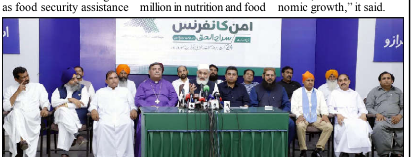
LAHORE: Ameer Jamaat-e-Islami Sirajul Haq talking to media persons af-

release added. "US flood relief assistance complements the efforts of the US-Pakistan Green Alliance, which advances cooperation in agriculture, clean energy, and water to support climate resilience, energy transformation, and inclusive eco