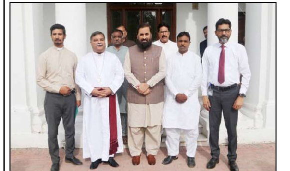
LAHORE: A delegation led by Bishop of Lahore, Nadeem Kamran in a group photo with Governor Punjab Muhammad Balighur Rehman at Governor House.

Caretaker Minister for Information and Broadcasting Murtaza Solangi also attended the meeting.