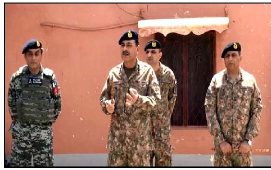
Chief of Army Staff General Syed Asim Munir interacting with officers and troops deployed in Sherwahi area near Asman Manza in South Waziristan District