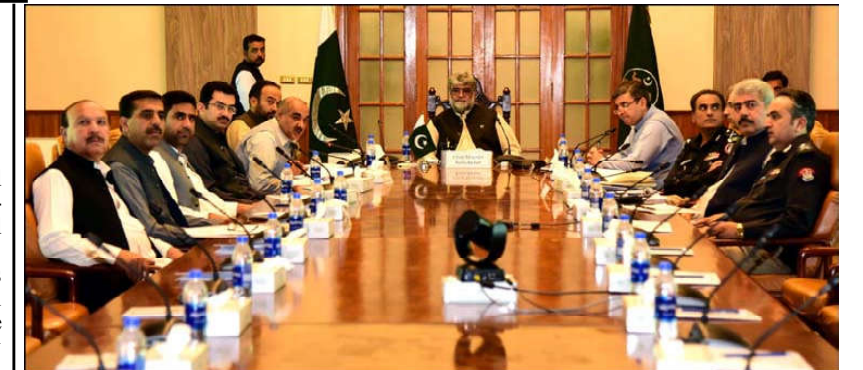
QUETTA: Chief Minister Balochistan Mir Ali Mardan Kha Domki being briefed about affairs of department of Home and Tribal Affairs. Caretaker Home Minister and Chief Secretary are also present