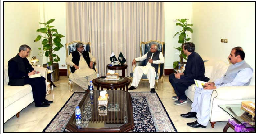
QUETTA: Caretaker Federal Minister for Communication Ashraf Tarar meeting with Chief Minister Balochistan Mir Ali Mardan Khan Domki

Referring to the rescue operation of trapped eight passengers of a cable car in Battagram, the prime minister said the country's infrastructure was becoming a threat to human lives. "We were overwhelmingly over the moon as we heard the rescue of the last kid..."