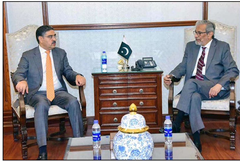
KARACHI: Caretaker Chief Minister of Sindh Maqbool Baqar called on caretaker Prime Minister Anwar-ul-Haq Kakar.