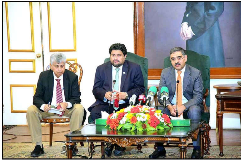
KARACHI: Flanked by Governor Sindh and Federal Minister for Information & Broadcasting, Caretaker Prime Minister Anwaar-ul-Haq Kakar addressing a press conference.

He said that the chief justice was putting his own future at stake by safeguarding the PTI chief.