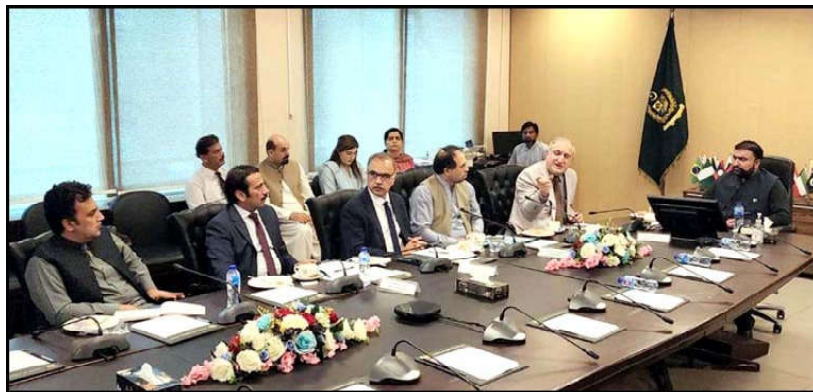
ISLAMABAD: Caretaker Federal Minister for Interior and Narcotics Control, Sarfraz Ahmad Bugti chairing a briefing session, at Ministry of Narcotics Control in Islamabad.

The Federal Minister directed the Member NHA to take steps on emergent basis for rehabilitation of the damaged bridges.