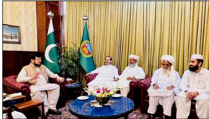
PESHAWAR: A delegation of district Banno led by former caretaker provincial minister Hamid Shah meeting with Governor Khyber Pakhtoonkhwa Haji Ghulam Ali.

The arrested were involved in robberies, snatching and tempering of mobile phones. A motorcycle and snatched mobile phones from the possession of the arrested.