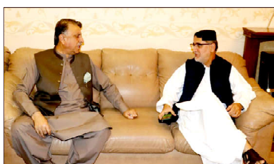
QUETTA: President Balochistan National Party Sardar Akhtar Jan Mengal meeting with Governor Balochistan Malik Abdul Wali Khan Kakar