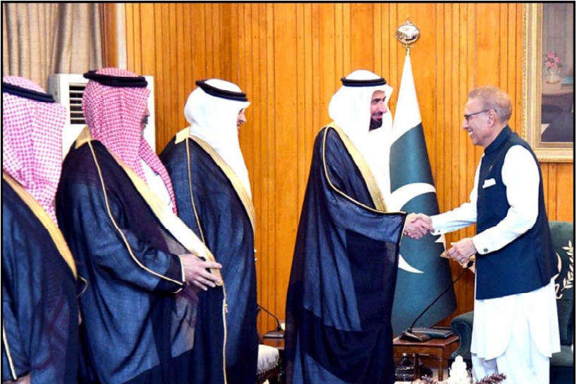
ISLAMABAD: President Dr. Arif Alvi welcoming the Saudi Minister for Hajj and Umrah, Dr. Tawfiq bin Fawzan Al-Rabiah, who along with his delegation, called on President Dr. Arif Alvi, at Aiwan-e-Sadr.