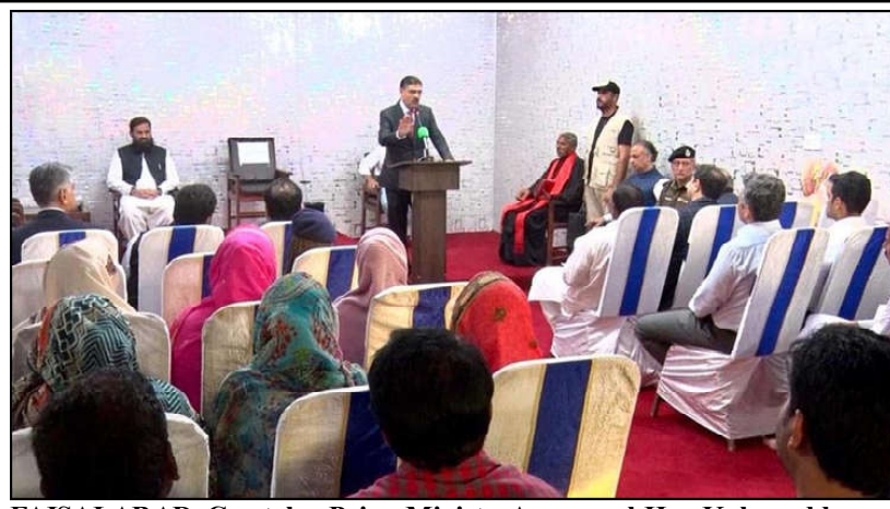
FAISALABAD: Caretaker Prime Minister Anwaar-ul-Haq Kakar addresses a congregation arranged in support of the Christian community members who were affected by mob violence in Tehsil Jaranwala.

The document said that after the dissolution of the FATA Tribunal, all the cases were transferred to other courts which increased the burden of cases on existing courts.