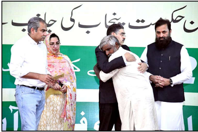
FAISALABAD: Caretaker Prime Minister Anwaar-ul-Haq Kakar distributes cheques of 2 million rupees each to individuals from the Christian community whose residences were damaged due to mob violence in Tehsil Jaranwala.