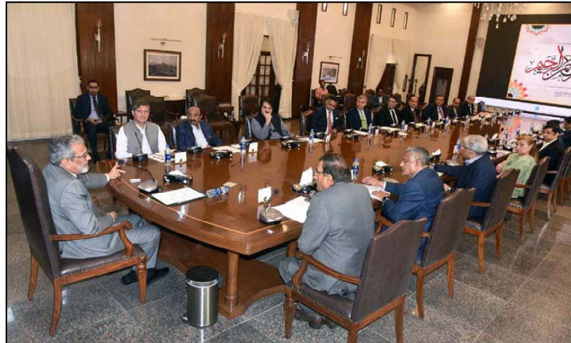
KARACHI: Caretaker Sindh Chief Minister, Justice (Ret'd) Maqbool Baqar presides over an introductory cabinet meeting held at CM House in Karachi.

The cabinet after a thorough discussion decided to expedite work on the ongoing development schemes, and to accelerate work on the foreign-funded projects so that they could be completed well in time.