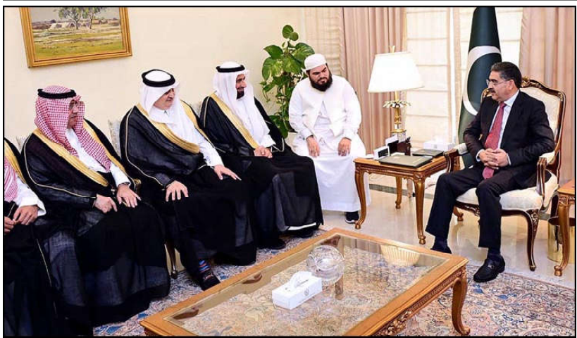
ISLAMABAD: A delegation led by Saudi Minister for Hajj and Umrah H.E. Dr. Tawfiq Bin Fawzan Al-Rabiah called on Caretaker Prime Minister Anwaar-ul-Haq Kakar.