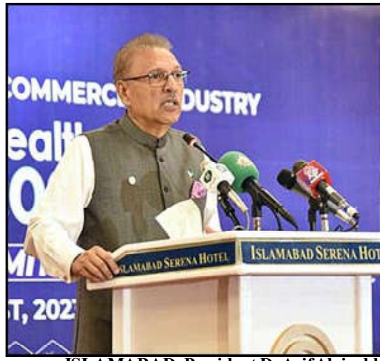
ISLAMABAD: President Dr Arif Alvi addressing the inaugural session of MED-Health Expo and Summit 2023.