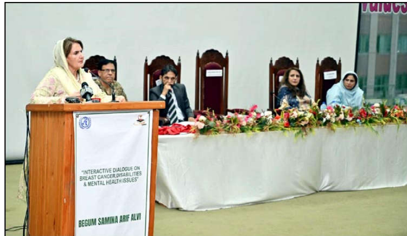
First Lady Begum Samina Alvi addressing an interactive dialogue on breast cancer, disabilities, and mental health issues, in Muzaffarabad.

ers in their access to health, education and employment opportunities. "We have to make them financially empowered by providing skilled-based education and health facilities," she added. Samina Alvi said an ignored segment of society were the people suffering from psychological issues, who hesitated to talk about their problems or go to a psychiatrist for treatment because of 'social stigma'. Around 24% of the country's population was suffering from various psychological issues, she added. The first lady also asked the women to spare five minutes every month for self-examination for early detection of breast cancer. A number of women died in Pakistan every year due to breast cancer, she added.