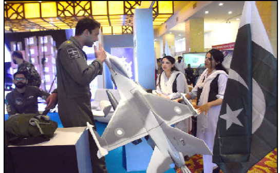
ISLAMABAD: Students are being briefed by the representative of Pak Air force about Aircrafts during "3rd International Property and Construction Industry Expo" in connection with the Independence Day at Pak China Friendship center in Federal Capital.

ing with the interim prime minister and his team. "We, of course, will continue to partner with Pakistan on areas of mutual interest, including our interest in Pakistan's economic stability, prosperity, and security, and the conduct of free and fair elections and the respect for democracy and the rule of law." Kakar was sworn in on Monday as the prime minister to head a caretaker government that will oversee parliamentary elections during the country's most challenging period in the economic field.