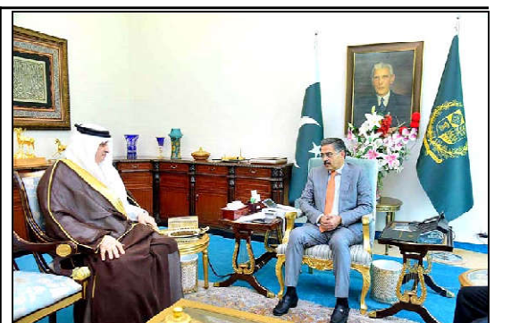
ISLAMABAD: Ambassador of Saudi Arabia, Nawaf bin Saeed Al-Malki calls on Caretaker Prime Minister Anwaar-ul-Haq Kakar.

LAHORE (INP): Jamat-e-Islami (JUI) Emir Sirjul Haq on Wednesday gave a call for holding nationwide protest against the whooping increase in petroleum prices on Friday. Haq said the caretaker government had endorsed the unjust policies of the outgoing coalition government by increasing the prices of petrol and diesel. Calling it an injustice to the poor people of the country, he said the rulers were putting pressure on them to please the International Monetary Fund (IMF). He urged the caretaker government to provide relief to the masses. The JI chief also asked people to join his party's peaceful protest against the petroleum prices.