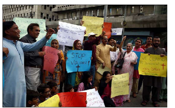
KARACHI: Members of Christian Community are holding protest demonstration against violence on minority community and condemn Faisalabad incident, held at Karachi press club.