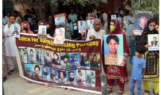
QUETTA: Members of Voice for Baloch Missing Persons are holding protest demonstration for recovery of their loved one, at Quetta press club.