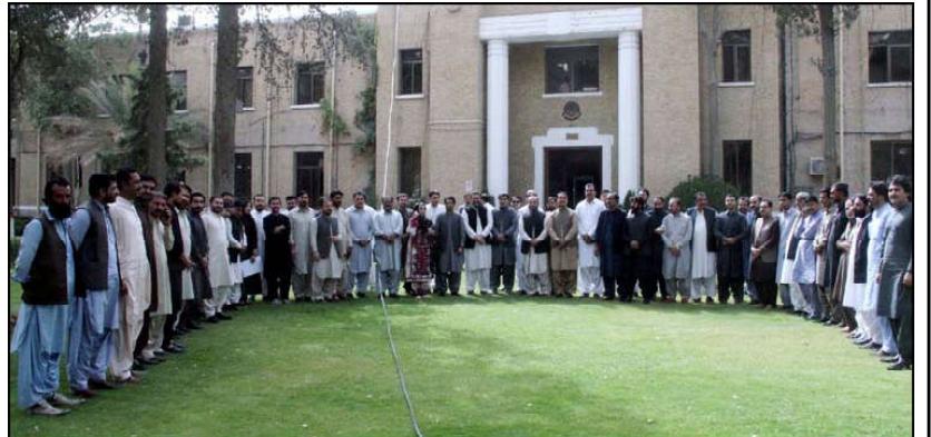
QUETTA: Members of BCS Officers Action Committee are holding protest demonstration for acceptance of their demands, held at Chief Secretary office in Quetta.