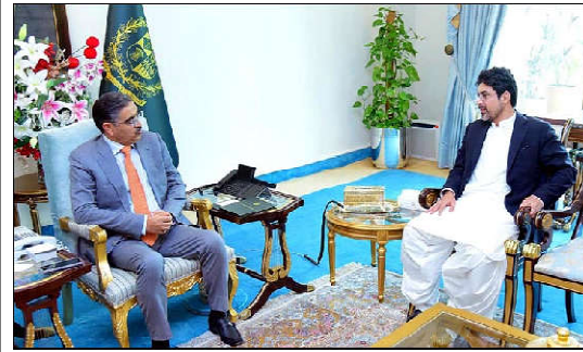
ISLAMABAD: Former Senator Saif Magsi calls on Caretaker Prime Minister Anwaar-ul-Haq Kakar.