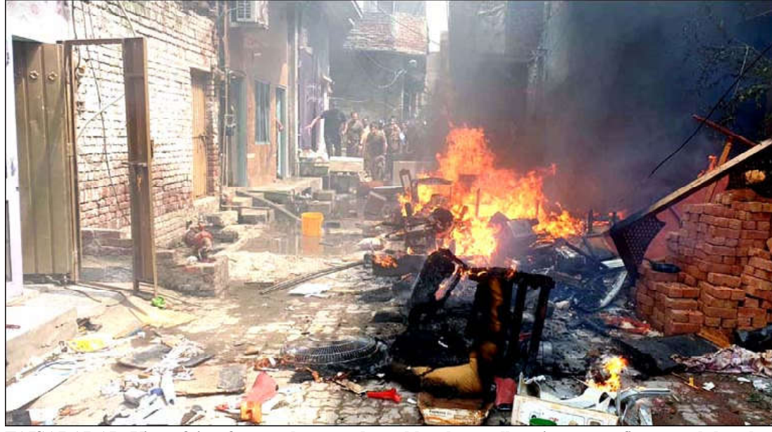
FAISALABAD: View of site after a mob enraged over blasphemy allegations set on fire several churches and a number of houses belonging to Christians in Jaranwala tehsil of Faisalabad.

Ph: 2841470/2841473 Vol: XVI No. 92, Muharramul Haram 29, 1445 AH Thursday August 17, 2023, Pages 08, Price Rs.15