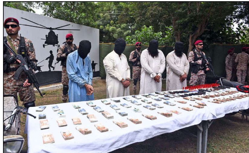
KARACHI: Rangers and Police personnel presents arrested robbers and recover money, to the media at Prady Police Station in Provincial Capital.