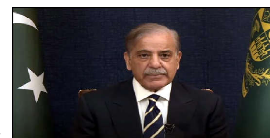
The prime minister Monetary Fund (IMF).

cal leadership and people said after the successful for reposing trust in his conclusion of the agreement leadership and government. with the International