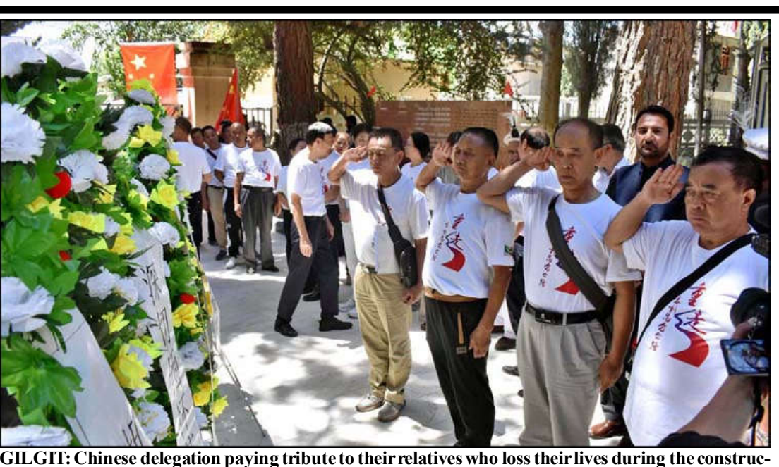
GILGIT: Chinese delegation paying tribute to their relatives who loss their lives during the construction of Karakoram Highway (1959-77) during their visit to Chinese Graveyard Daniyor.