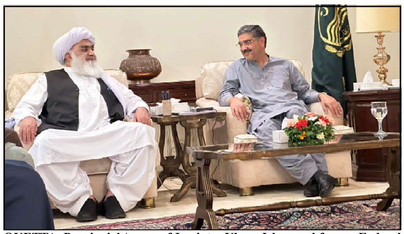
QUETTA: Provincial Ameer of Jamiat-e-Ulema Islam and former Federal Minister Maulana Abdul Wasey meeting with nominated Caretaker Prime Minister Anwaar-ul-Haq Kakar.

RAWALPINDI (APP): The on Sunday strongly con-