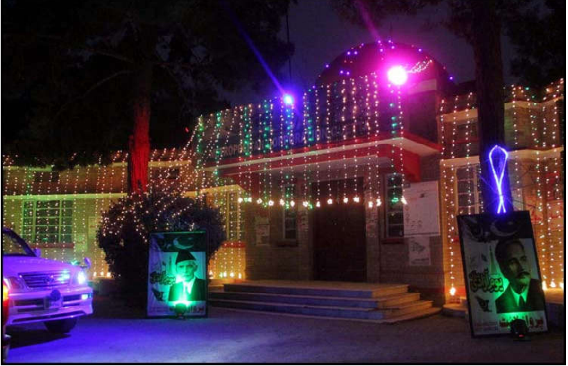
QUETTA: A beautiful illuminated view of lighting at Government building on the eve of Independence Day celebrations coming ahead, in Quetta.

cal leadership and people said after the successful for reposing trust in his conclusion of the agreement leadership and government. with the International