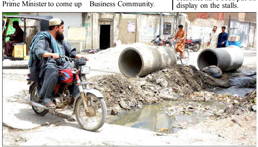
QUETTA: A view of sewerage water accumulated on Sirki Road Gawalmandi Chowk which creating problems for motorists need attention of concerned

National flags, pin badges, green and white dresses, toys and other accessories have been put on display on the stalls