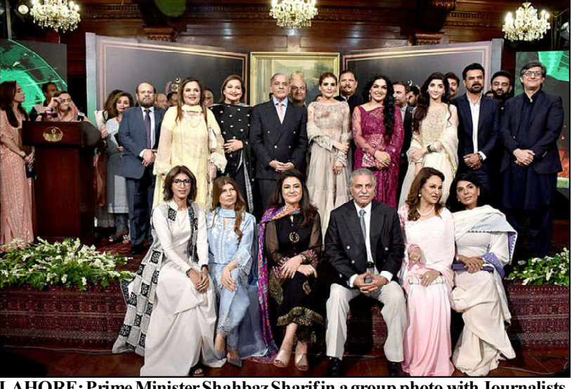
LAHORE: Prime Minister Shahbaz Sharifin a group photo with Journalists, Media workers, Artists and Technical resources during the launching ceremony of the MobileApp Radio Pakistan Awaz Khazana.

collaboratively elevate the stature of Pakistan.