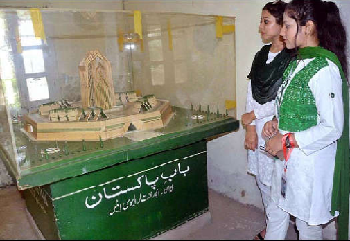
LAHORE: Visitors seeing the model of Bab-e-Pakistan Monument, the first stay of refugees in

According to the showed that 693 drivers, 45 data, 1,145 motorbikes, 92 underage drivers, 178 auto-rickshaws.