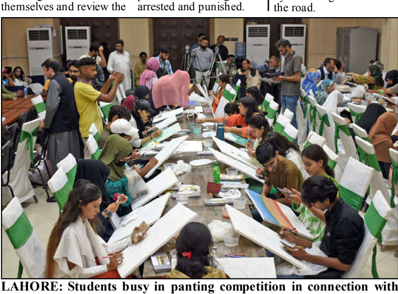
Independence Day, at Lahore museum in Provincial Capital.

The IGP also ordered action against those involved in one-wheeling, aerial firing, rioting and immoral acts."Those who display arms in public and perform aerial firing will be