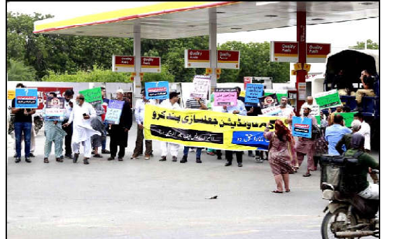
KARACHI: Victims of ASF Tower/Arabian Vista are holding protest demonstration for demanding ownership rights, at Shahr-e-Faisal near Natha Khan Bridge in Karachi.