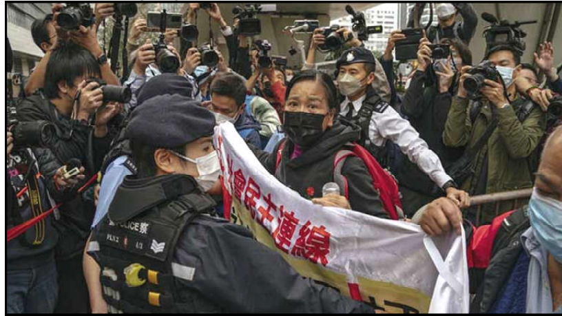
Hong Kong arrests 10 for 'foreign collusion' over violent pro-democracy protests.

China and Russia could call a procedural vote next week, but a senior U.S. official said they were confident they have the minimum nine votes needed to hold the meeting.