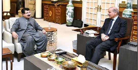
ISLAMABAD: Chairman Senate Muhammad Sadiq Sanjranani called on Prime Minister Muhammad Shehbaz Sharif.

ISLAMABAD (APP): Pakistan, highlighting SIFC as a single window to facilitate foreign investment in various sectors. During the visit, views were exchanged with the Saudi delegation on specific development projects. The delegation members apprised the Pakistani side of benefits and their proposals about Saudi investment in various sectors of Pakistan. On the occasion, both the sides reiterated their resolve to work together to enhance bilateral cooperation in various sectors and projects. On the conclusion of the visit, the Saudi delegation also met with Army Chief General Syed Asim Munir and discussed various matters and brotherly relations between the two countries. The delegation was given a detailed briefing about the true potential of