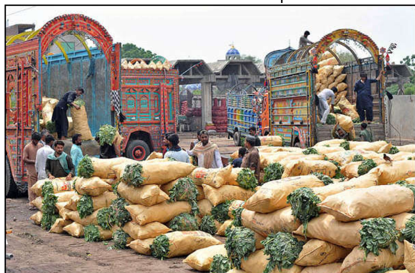
MULTAN: Labourers offloading sacks of vegetables from delivery truck at vegetable market.

locally sourced materials and minimizes the environmental impact associated with mass production. He said each creation becomes a work of art, preserving the essence of Pakistani culture. He said hand-carved furniture of Pakistan reflects the rich cultural heritage and craftsmanship of the region that attracts foreign buyers. He said these pieces often incorporate intricate designs and motifs that are deeply rooted in the country's history and traditions. He said the creation of hand-carved furniture involves skilled artisans who have honed their craft over generations and their expertise and dedication contribute to the uniqueness.