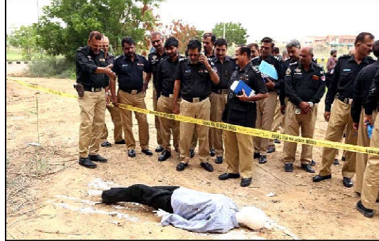
KARACHI: Police officials from Crime Scene Unit and Police Investigation Department are being given hands-on training at the mock crime scenes in Sindh Forensic DNA and Serology Laboratory (SFDL) held at ICCBS University of Karachi.

The president encouraged virtues such as charity, truthfulness, respect for elders, empathy, and cooperation, particularly in the younger generation. While acknowledging the government's role in addressing major issues, he emphasised that every individual in the Islamic framework has a role to play in serving others.