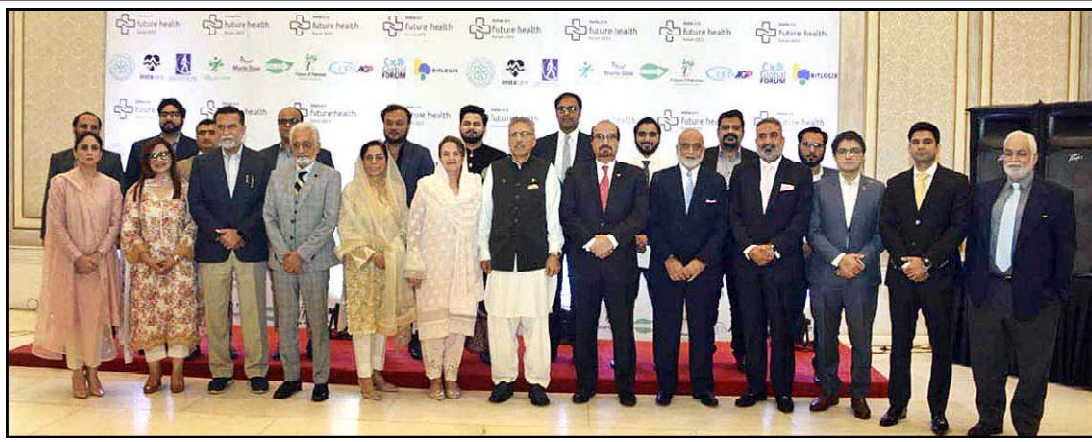
LAHORE: President Dr. Arif Alvi in a group photo with healthcare professionals attending the Instacare Future Health Forum 2023 on Advancing Healthcare with Artificial Intelligence and Machine Learning.

ISLAMABAD (APP): The National Commission on the Status of Women (NCSW) in support of the Ministry of Human Rights & UN Women launched a commemorative postage stamp to spread awareness about gender-based violence in the country and to honour the victims. The first session of the event was a round table consultation on the increasing incidents of violence against women issues with Chairperson NCSW, Nilofar Bakhtiar and top leading gender experts in Pakistan. A resolution/charter of demands was then