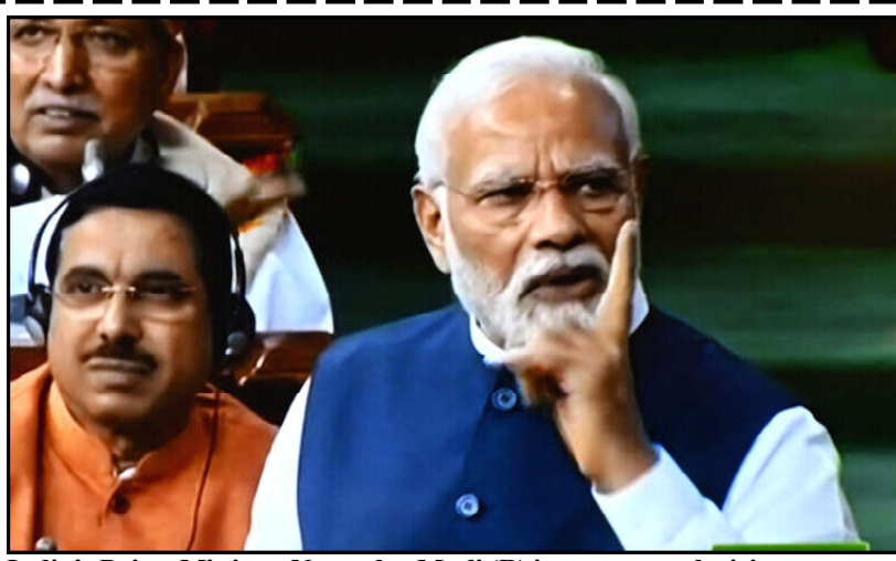
India's Prime Minister Narendra Modi (R) is seen on a television screen as he addresses the lower house Lok Sabha in New Delhi.

But Putin hasn't ruled out his attendance, the Kremlin official told NBC News, seeking to "relaunch himself on the world stage" ahead of next year's election. Likewise, the official claimed that Putin is keen to win over countries that aren't solid in their support for Russia in its invasion of Ukraine.