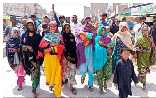
NASEERABAD: Residents of Dera Murad Jamali are holding protest demonstration against high handedness of land grabbers, at Dera Murad Jamali.