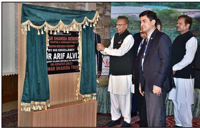
LAHORE: President Dr. Arif Alvi unveiling plaque during ground breaking ceremony the Sarwar Shahida Memorial Cardiac & Research Institute.