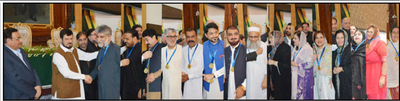
PESHAWAR: Governor Khyber Pakhtunkhwa Haji Ghulam Ali distributing awards under the auspices of the Federation of Pakistan Chambers of Commerce & Industry (FPCCI) at Governor's House.

According to the SCII press release, the award was given in recognition of the SCII meritorious services in domains of trade, commerce, and industrial development.