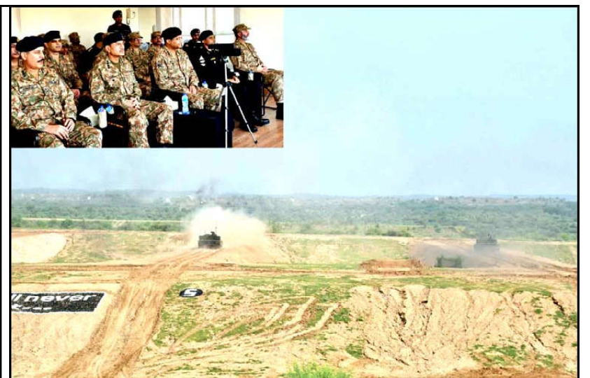
JHELUM: Chief of Army Staff (COAS), General Syed Asim Munir visited Tilla Field Firing Ranges, witnessed Live Fire and maneuvers of the advanced VT-4 tanks, shoot and scoot capabilities of long range SH-15 artillery guns and innovative equipment display, near Jhelum.

Dead bodies were handed over to their heirs after necessary formalities. Further action is being taken by relevant authorities.