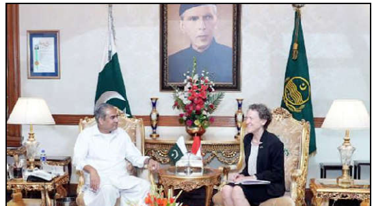
LAHORE: Canadian High Commissioner Ms. Leslie Scanlon meeting with Caretaker Chief Minister Punjab Mohsin Naqvi

during the campaign, more than 13 million saplings will be planted across the province. The chief minister was also informed that under the 10 billion tree project, the total area of forests in the province has been increased by 6.3 per cent. Speaking on the occasion, the chief minister lauded the efforts of Khyber Pakhtunkhwa forest and wildlife department in promoting tree plantation and their preservation adding that it is gratifying that the Forest Department is taking result-oriented steps under a comprehensive strategy to this effect.