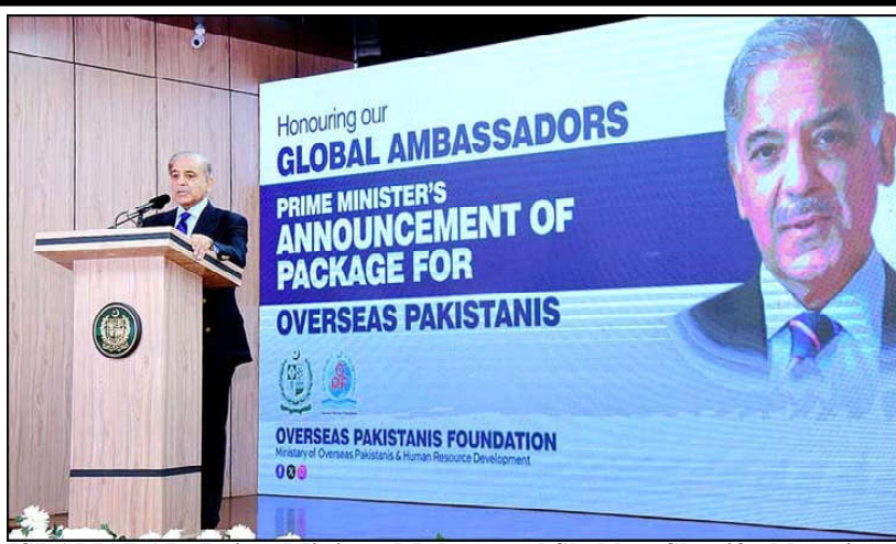
ISLAMABAD: Prime Minister Muhammad Shehbaz Sharif addressing a ceremony regarding Special Incentives Package for Overseas Pakistanis.