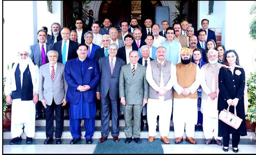
ISLAMABAD: Prime Minister Muhammad Shehbaz Sharif in a group photo with members of the Federal Cabinet.

Ph: 2841470/2841473 Vol: XVI No. 86, Muharramul Haram 22, 1445 AH Thursday August 10, 2023, Pages 08, Price Rs.15