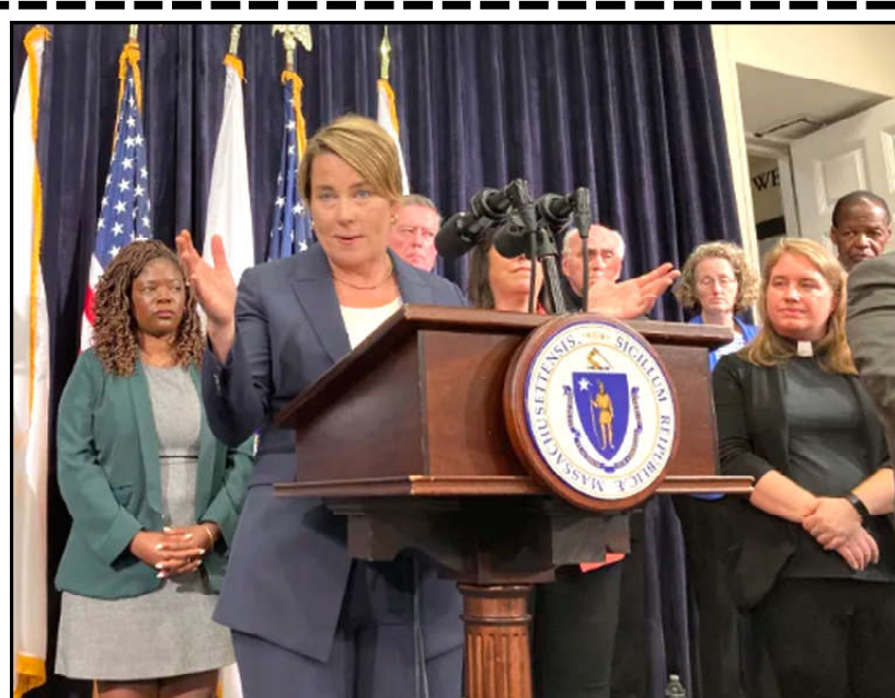
Massachusetts Gov. Maura Healey declares a state of emergency in Boston, citing the influx of migrants to the state in need of shelter.

According to RT, the incident occurred within the premises of the Zagorsk Optical-Mechanical Plant — a designing and manufacturing optical and electronic equipment company