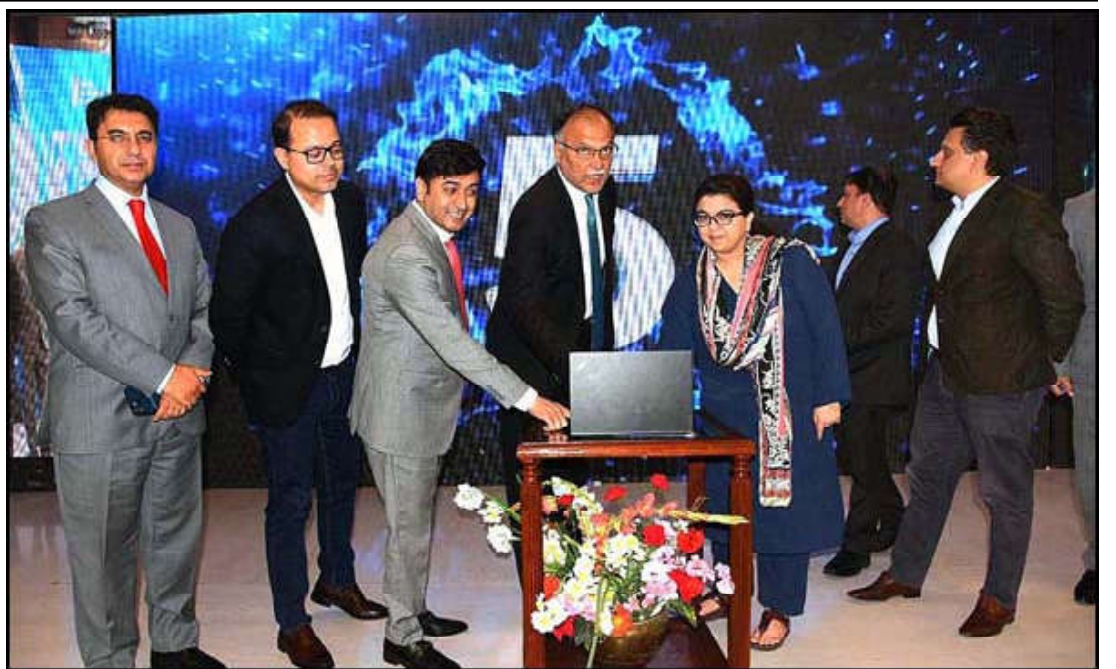
ISLAMABAD: Federal Minister for Planning, Development and Special Initiatives, Prof. Ahsan Iqbal along with Special Assistant to Prime Minister on Youth Affairs Shaza Fatima Khawaja launching Venture Capital Fund at Ministry of Planning.

ing and fastest-growing economies in the world in 10-15 years by ensuring peace, stability, and continuity of policies. "No country in the world has attained success in development without a decade of stability." Recounting the government's initiatives to match the technological changes taking place in the world, he said it established national centres for artificial intelligence, cyber security, big data cloud computing, automation and robotics. Besides, the minister said, a national centre for quantum computing had been set up laying a 'future foundation' for information technology infrastructure to contest the development pace at the international level.