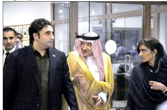
ISLAMABAD: Foreign Minister Bilawal Bhutto Zardari, talking with Deputy Foreign Minister of the Kingdom of Saudi Arabia Eng. Waleed bin Abdulkarim Al-Khurajji after the meeting at Ministry of foreign Affairs in Federal Capital.

It may be mentioned here six persons including two police cops and one female were injured in hand grenade attack occurred on Joint road on Wednesday.