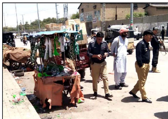
QUETTA: Police officials inspect the site of incident at Joint road where miscreants threw a hand grenade

He said that the performance of each and every institutions should also be seen on ground instead of mere paper work.