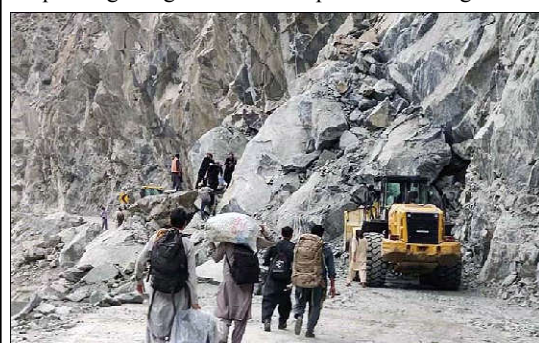
GILGIT: People crossing the blocked road on Juglot Skardu Road after land sliding near Rondou area.

Pakistani pilgrims would be allowed to enter Iraq through Baghdad and Al-Najaf Airports and Al-Saib port through while the government of Iraq uplifts the restriction of entry and exit from one airport.