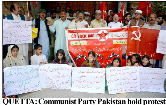
QUETTA: Communist Party Pakistan hold protest outside Quetta Press Club.