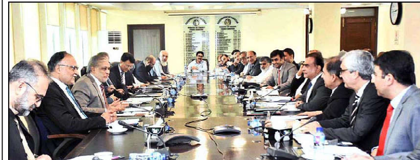
ISLAMABAD: Finance Minister Senator Mohammad Ishaq Dar chaired today meeting of the Executive Committee of the National Economic Council (ECNEC), which approved various national development projects.

setting up Overseas Commission in all provinces, reservation of 10 percent quota for the overseas Pakistanis in all public sector housing projects with 5 percent rebate in case of foreign exchange payment, establishment of dedicated counters at all airports of the country, awarding top ten overseas Pakistan who contributed remittances, allocation of 5 percent seats in the professional public sector educational institutes across Pakistan, need-based scholarship to the overseas Pakistan in the pursuit of higher education, dedicated national saving schemes at attractive rates and linking of NADRA central system at the union levels for various facilities and increasing number of camp offices for attestation of documents, online biometric verification and auto removal of blacklist passports etc.