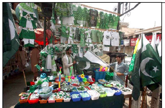
PESHAWAR: Pakistan flags, bunting, printed shirts and other items are being selling on roadside stall in connection of Independence Day of Pakistan coming ahead, at Saddar road.

The Governor Punjab said that according to the report of Transparency International, corruption had increased during the tenure of PTI. He said that the issue of the IUB had been exaggerated on social media. Associating dirty videos on social media with the University without research is hurtful, he said and added that a high-level investigation was being conducted on all aspects of the University's financial affairs, drugs and harassment.