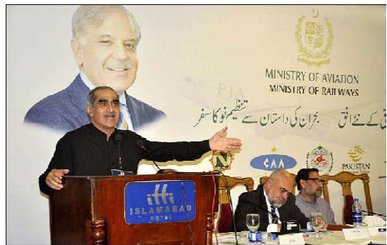
ISLAMABAD: Federal Minister for Aviation and Railways Khawaja Saad Rafique briefing on insightful interactive discussion with the media personnel at local hotel.

CJ IHC inquired did they tell any reason for not arranging meeting with PTI chairman.