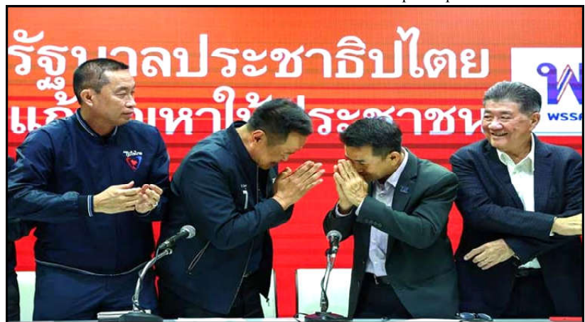
Thailand alliance expands in new effort to form government.

The invitation to Thant Sin also "raises doubts" about South Korea's ban on arms exports to Myanmar and could imply its intention to permit the sale, despite the junta's responsibility for attacks on civilians, Andrews said.