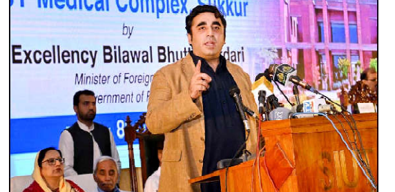
SUKKUR: Chairman Pakistan People's Party and Foreign Minister Bilawal Bhutto Zardari addressing at the inaugural ceremony of Sindh Institute of Urology and Transplantation (SIUT) Medical Complex Sukkur

Speaker National Assembly Raja Pervaiz Ashraf presented memorable shields to all political leaders, acknowledging their commendable and positive roles in the activities of the 15th National Assembly.