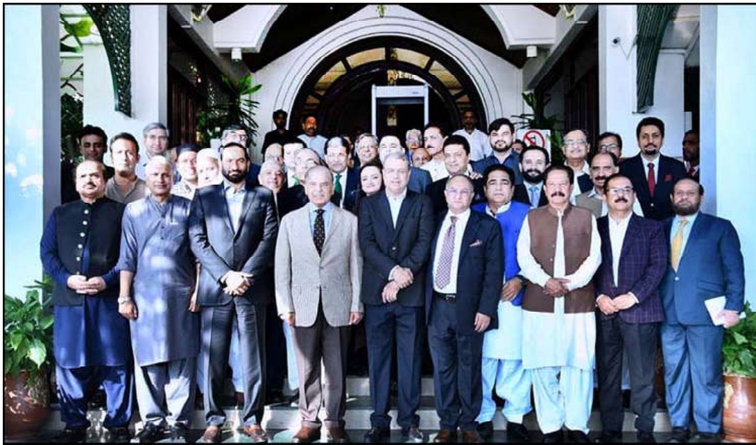
ISLAMABAD: Prime Minister Muhammad Shehbaz Sharif in a group photo with a delegation of Pakistan Broadcasters Association, All Pakistan Newspapers Society & Council of Pakistan Newspaper Editors.