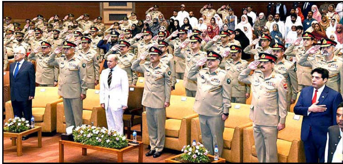
RAWALPINDI: Prime Minister Muhammad Shehbaz Sharif attends a ceremony to honor the Martyrs and Ghazis of Pakistan Army at General Headquarters.

Ph: 2841470/2841473 Vol: XVI No. 85, Muharrumul Haram 21, 145 AH Wednesday August 09, 2023, Pages 08, Price Rs. 15