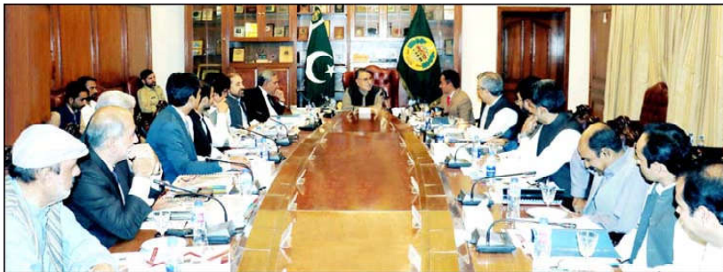
QUETTA: Governor Balochistan Malik Abdul Wali Khan Kakar presiding over 7th meeting of Senate of University of Turbat

minister said. "Establishment of National University of Science and Technology Khuzdar Campus, COMSATS Quetta and Gwadar campuses, Expansion of Pakistan Halal Authority offices to Quetta and Gwadar, Establishment of Pakistan Standards and Quality Control Authority offices in Tattan, Chaman and Gwadar for boosting trade activities to generate revenues and appointment of Science Counsellor in Beijing to represent Pakistan and engage in scientific cooperation were few of the landmarks.