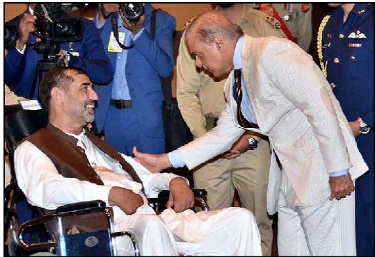
RAWALPINDI: Prime Minister Muhammad Shehbaz Sharif interacting with families of Martyrs during his visit of General.

fake news was being circulated on both social media and some television networks. No wood was used in joints rather Parmelia fishplate was being used for railway signal system worldwide as the signal system did not work without it, he said. He explained that it was a special type of fishplate which was imported from Germany or Holland. Investigation into the accident was underway.