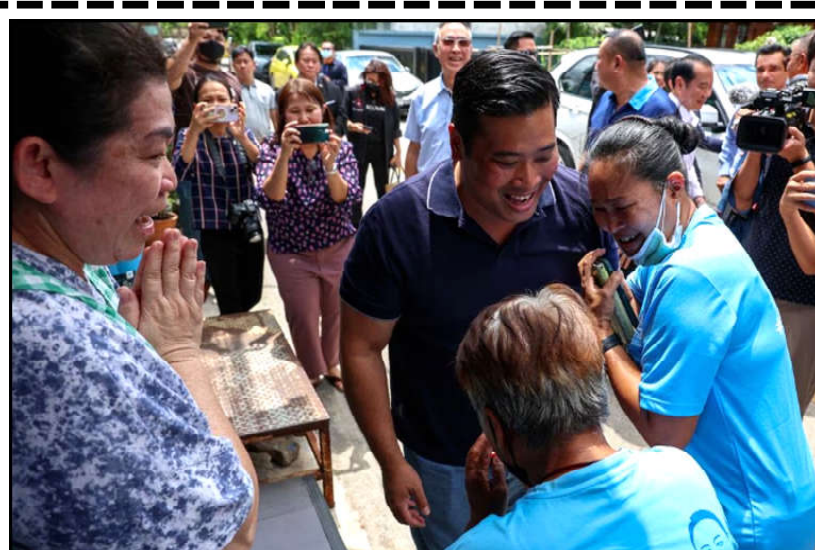
Vacharaesorn Vivacharawongse, 42, the second-eldest son of Thailand's King Maha Vajiralongkorn speaks to well-wishers at the Foundation for Slum Child Care supported by the Royal Family, in Bangkok, Thailand.

battlefield as Moscow's kamikaze drones are difficult to defend against. The drones fly low and slow to avoid traditional air defence systems and can be piloted directly by operators on the ground, unlike the Iranian-shahed drones which are pre-programmed to head to a target that cannot be changed once launched. Analysts have suggested that Russia's defence ministry is keen to get hold of more of the Lancet drones, which reportedly cost around £28,000 each, as a low cost way of making up for losses of their more expensive and sophisticated equipment.