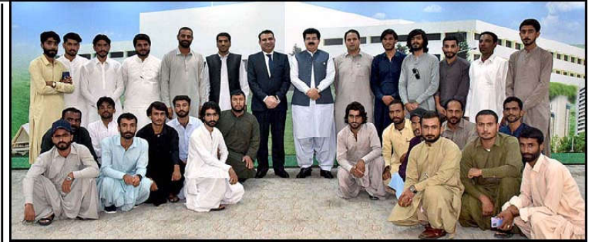
ISLAMABAD: Chairman Senate, Muhammad Sadiq Sanjrani in a group photo with the delegation of the students and faculty members of the University of Makran, Panjgur Balochistan at Parliament House.

Addressing the meeting, the Governor said that the universities are established to impart higher education to the students, so we should focus on provision of necessary facilities to them.