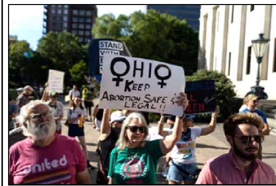
An abortion rights protester holds a sign that says 'OHIO KEEP ABORTION SAFE & LEGAL!' at a rally in Columbus, Ohio.