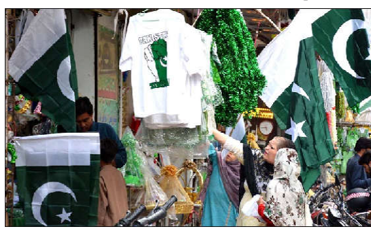
QUETTA: Woman selecting and purchasing national flag printed children dress on ahead of start 76 Independence Day celebration of 14 August.

Highlighting the one-year performance of BISP, the source revealed that the quarterly stipend of Benazir Kafalat has been increased up to Rs 8750 per family which is given every quarter while the number of beneficiaries of the Benazir Income Support Programme has increased from 7.6 million families to 9 million during the last one year. The BISP staff ensured the distribution of relief money to the deserving ones in the worst conditions during the floods and 70 billion rupees.