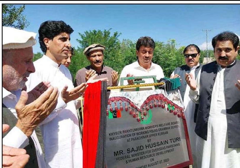
PARACHINAR: Federal Minister for Overseas Pakistanis & HRD, Sajid Hussain Turi inaugurates Workers Folk Grammar School.

PID, Pakistan Television (PTV) and Associated Press of Pakistan (APP) had been restored here with his hectic efforts. He said that by inaugurating the PID regional office, another promise made to the local journalists has been fulfilled, adding, it was a good omen for the local journalist community. In this process, he said, Federal Minister for Information and Broadcasting Maryum Aurangzeb extended her full support. The special assistant said the caretaker government will hold its responsibilities within a few days.