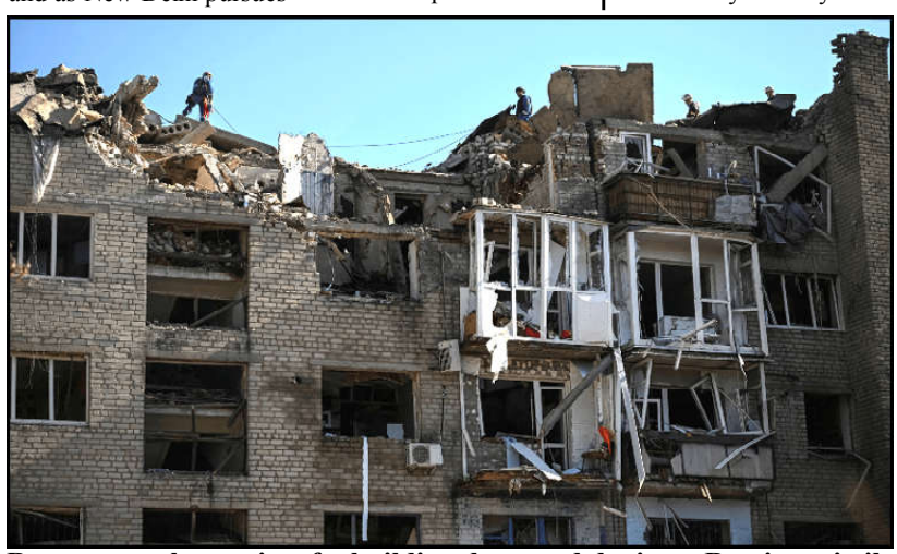
Rescuers work at a site of a building destroyed during a Russian missile strike, amid Russia's attack on Ukraine, in Pokrovsk, Donetsk region, Ukraine.

Monitoring Desk BANGKOK: The second-eldest son of Thailand's King Maha Vajiralongkorn visited a child-care centre for underprivileged families on Tuesday during a surprise visit to the kingdom, the first time he has been back in his homeland in 27 years. The trip by Vacharaesorn Vivacharawongse, 42, comes at a fraught time for the Thai royal family.