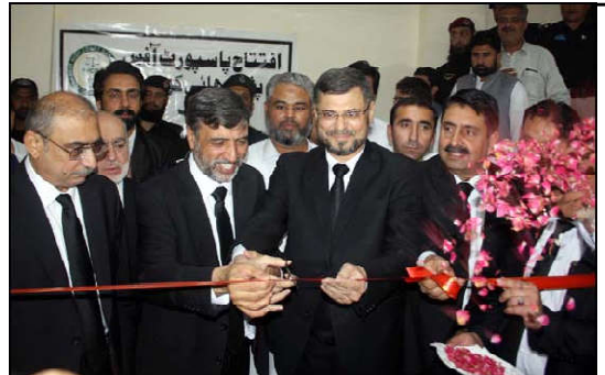
PESHAWAR: Peshawar High Court Acting Chief Justice, Justice Mohammad Ibrahim Khan inaugurating the Passport Office during a ceremony held at High Court premises in Peshawar.

departments should complete their operational preparations," he added. Dr Jamal Nasir said that the Punjab government had completed all arrangements to deal with calamities like floods. The minister was briefed that around 50 villages of Langarwala could be affected in case of flooding in the Jhelum, while the district administration has established four flood relief camps. The minister also inspected stalls set up by departments. Later, the minister also visited THQ Hospital Sahiwal. The minister reviewed the facilities being provided to patients and checked the attendance and availability of medical staff.