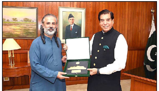
ISLAMABAD: Speaker National Assembly Raja Pervaiz Ashraf presenting souvenir to Federal Minister for Narcotics Control Nawabzada Shazain Bugti at Parliament House.

Later, the session of assembly was adjourned for an indefinite period.