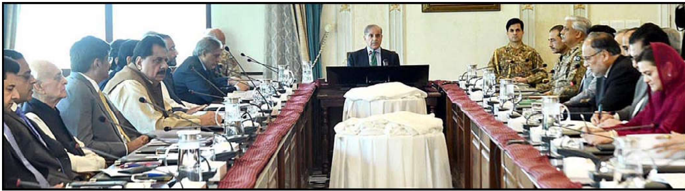
ISLAMABAD: Prime Minister Muhammad Shehbaz Sharif chairs a meeting of the Apex Committee of Special Investment Facilitation Council.