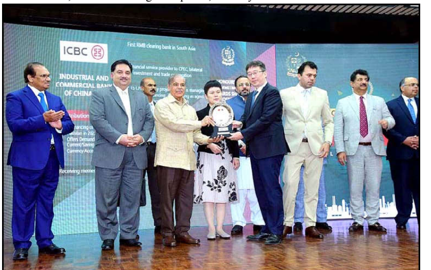
ISLAMABAD: Prime Minister Muhammad Shehbaz Sharif presenting awards to heads/representatives of Chinese companies operating in Pakistan under the CPEC.

During an interactive session, the COAS paid rich tribute to the supreme sacrifices of brave and resilient tribals of Pakistan and appreciated their indomitable resolve for standing shoulder to shoulder with the Security Forces in defeating the menace of terrorism.