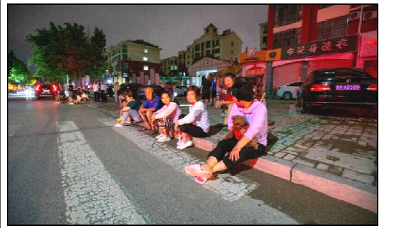
People gather on a street in Pingyuan county, Dezhou city, in China's eastern Shandong province, following a 5.4-magnitude earthquake that shook eastern China.

China also urged the Philippines to restore the Second Thomas Shoal and said it had allowed transport of daily necessities including food to the grounded ship, according to the Chinese statement, adding that it had used the water cannon to avoid collision from a direct interception.