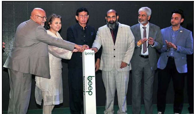
ISLAMABAD: Federal Minister for IT and Telecommunication Syed Amin Ul Haque launching Pakistan's First Communication APP "beep".