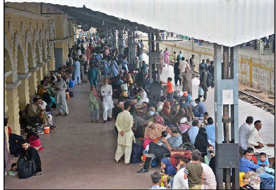
KARACHI: Many passengers are stuck at Cantt Station because of the derailed Hazara Express near Nawabshah.

The religious leadership said, "We established Pakistan and make its a prosperous and progressive country." The religious leadership also stated that the Constitution of Pakistan provides equal rights to the followers of all religions. "No enemy of the country will be allowed to disturb peace in the country."