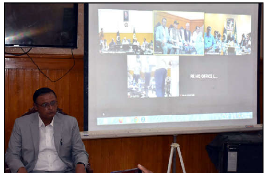
SIBI: Federal Minister for Railways Khawaja Saad Rafique addressing a ceremony of restoration of Sibi-Harnai railway section through video link.

Before 2015, the Gwadar Port Free Trade Zone was just an idea. Now, the FTZ has attracted some 20 companies in banking, insurance, logistics and food processing with a combined investment of $420 million,