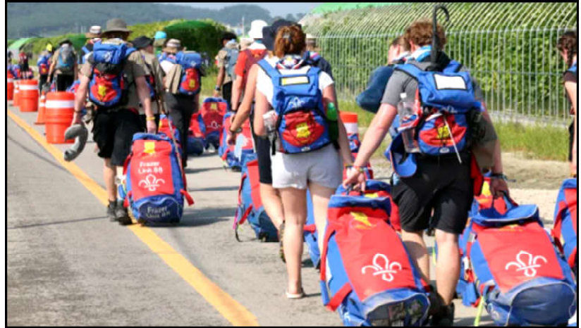
British scout members leave the World Scout Jamboree campsite in Buan, South Korea.

Monitoring Desk CABAZON: Two firefighting helicopters collided while responding to a blaze in Southern California, sending one to the ground in a crash that killed all three people on board. "Unfortunately, the second helicopter crashed and tragically all three members perished, which included one Cal Fire Division chief.