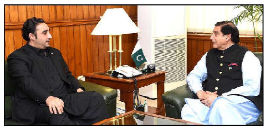
ISLAMABAD: Federal Minister of Foreign Affairs Bilawal Bhutto Zardari called on Speaker National Assembly Raja Pervez Ashraf at Parliament House

This move was seen as an opportunity for more time, deliberation, and reconciliation on the bill, given the valuable feedback provided by various stakeholders.