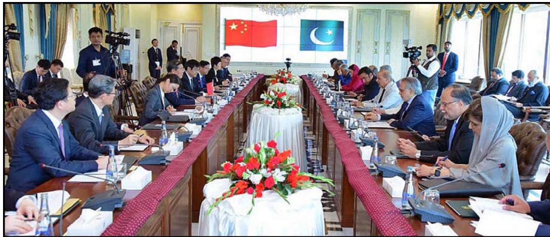
ISLAMABAD: Prime Minister Muhammad Shehbaz Sharif and Vice-Premier of State Council of China, He Lifeng in delegation level talks at Prime Minister's Office.