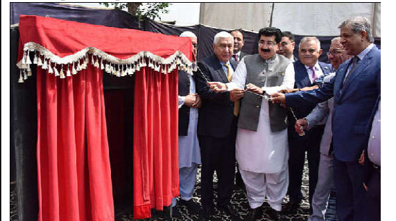
ISLAMABAD: Chairman Senate, Muhammad Sadiq Sanjrani, president of the Inter-Parliamentary Union (IPU), Duarte Pacheco and Federal Minister for Law and Justice, Senator Azam Nazeer Tarar inaugurating the ground breaking ceremony of the Permanent Headquarter of International Parliamentarians' Congress (IPC) at Diplomatic Enclave.

Minister for Communication, Maulana Asad Mehmood, expressed his condolences for the loss of JUI-F workers and stood in solidarity with the bereaved families. He stressed that the attack wasn't merely targeting a specific party but was an attack on the entire nation, its economy, democracy, and innocent citizens. He lamented that political workers who stood firmly for the constitution and democracy were continuously becoming targets of violence.