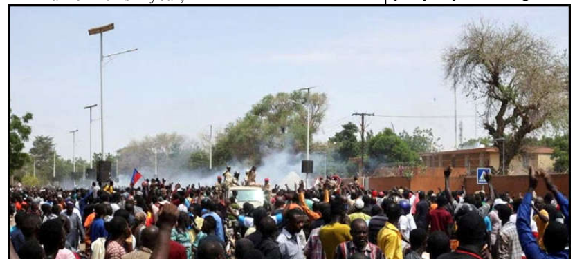
Nigerien security forces launch tear gas to disperse pro-junta demonstrators gathered outside the French embassy, in Niamey, the capital city of Niger.

Monitoring Desk HELSINKI: Denmark's foreign ministers said Sunday the government will seek to make it illegal to desecrate the Quran or other religious holy books in front of foreign embassies in the Nordic country. Foreign Minister Lars Løkke Rasmussen said in an interview with the Danish public broadcaster DR that the burning of holy scriptures "only serves the purpose of creating division in a world that actually needs unity."