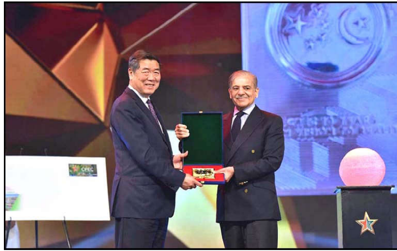
ISLAMABAD: Prime Minister Muhammad Shehbaz Sharif presenting a memento of Rs. 100 coin to Chinese President Special Representative and Vice Premier Mr. He Lifeng at a ceremony to commemorate the 10th anniversary of CPEC.

Ph: 2841470/2841473 Vol: XVI No. 79, Muharramul Haram 13, 1445 AH Tuesday August 01, 2023, Pages 08, Price Rs.15