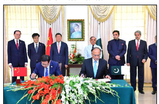
ISLAMABAD: Prime Minister Muhammad Shehbaz Sharif and Vice-Premier of State Council of China He Lifeng witnessing the signing ceremony of agreements/MoUs regarding cooperation between the two countries in various fields.

ISLAMABAD (Online): Under the 10-year celebrations of China Pakistan Economic Corridor (CPEC) Pakistan and China on Monday signed a memorandum of understanding (MoUs) to enhance further bilateral co-operation and to promote strong economic ties between the two brotherly countries.