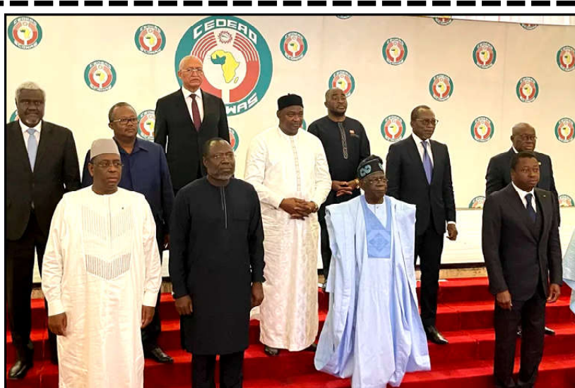
Nigeria President, Bola Ahmed Tinubu, second from left, poses, for a group photograph with other West Africa leaders after a meeting in Abuja Nigeria.

Zelensky said Sunday in his nightly video address. It was not clear whether the missile strikes were in retaliation for his comments. Meanwhile, a Ukrainian artillery strike on the partially occupied Donetsk province killed two people and wounded six others in the regional capital, according to Denis Pushilin, the Moscow-installed leader of the illegally annexed province. A bus was also hit as Ukrainian forces shelled the city of Donetsk multiple times Monday, Pushilin said. Neither side's claims could be independently verified.