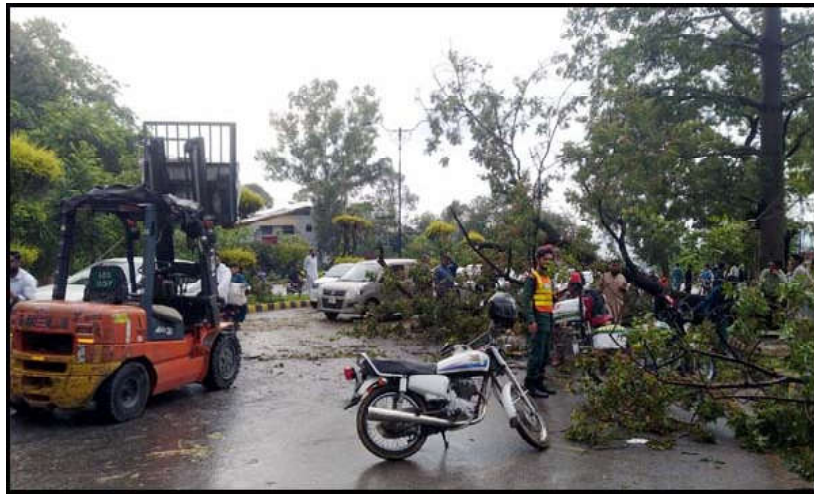
RAWALPINDI: Commuters pass near fallen tree due to heavy downpour of monsoon season while rescue operation underway, in Rawalpindi.