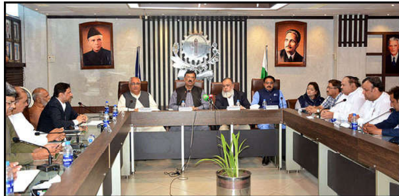
FAISALABAD: State Minister for Industries & Production Mr. Tasneem Ahmed Qureshi is addressing the business community at Faisalabad Chamber of Commerce & Industry (FCCI).