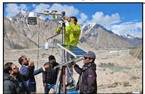
GILGIT: In the collaboration of EPI Gilgit-Baltistan, KIU, UOB, and University of Mailaan EvK2CNR successfully installed the Automate Weather Station in Askoli, Urdas and Candodia.

heinous act that can't be justified at all" he remarked. While paying tribute to the martyrs, the chief minister said that citizens of Khyber Pakhtunkhwa especially tribal people and our security forces have rendered matchless sacrifices for reinstating and establishing peace in the region; we will not let those sacrifices go in vain, he said.