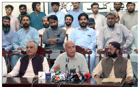
QUETTA: Central President National Party (NP) Dr. Abdul Malik Baloch addresses to media persons during press conference, at Quetta press club.

and his companions in the party's fold, Dr. Abdul Malik Baloch said that NP is the bouquet of all nationalities. Referring to the country's situation, the President of NP said that the country is facing socio-economic challenges. The state's institutions are in confrontation against each other, adding he charged. Under the given circumstances, the free and fair elections are the only solution to the country's problems, he insisted. He also said that the people got nothing in the name of development for last five years. He alleged that the distribution of land is continued in Gwadar while the jobs are being sold in the province.