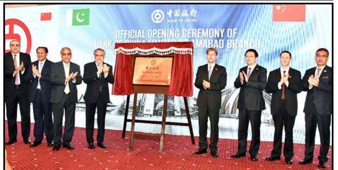
ISLAMABAD: Finance Minister Senator Mohammad Ishaq Dar inaugurated the Branch opening of Bank of China (BOC) at a ceremony.

its partnership with the IPU and provides regular support through its candidacy at International Organization in pursuit of global peace, prosperity, and economic stability. The Finance Minister also informed about the recent economic and financial measures taken by the government which have put the financial position of the country on an upward trajectory. The Finance Minister also mentioned that keeping in view its Strategic position in the region.