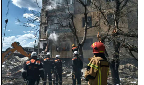
Emergency services work at a scene after a missile hit an apartment building in Kryvyi Rih, Ukraine.

Sweden and Denmark have seen several protests in recent weeks where copies of the Quran have been damaged or burned, causing outrage among Muslims. Sweden's embassy in Baghdad was stormed and set ablaze by angry protesters. In a phone call, Fidan told his Swedish counterpart Tobias Billstrom that continuation of such "vile actions" under the guise of freedom of expression was unacceptable, the source said. Fidan and Billstrom also discussed Sweden's NATO military alliance membership application, the source added. Swedish Prime Minister Ulf Kristersson said on Sunday that he had held talks with Danish Prime Minister Mette Frederiksen and that they agreed the situation was dangerous. "We need to take measures to strengthen our resilience," he said in a post on Instagram. The Swedish government said this month that it would examine whether it could change Sweden's Public Order Act to give police the possibility to stop demonstrations that threatened Sweden's security.