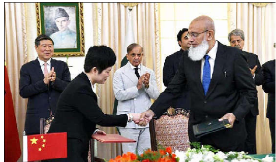
ISLAMABAD: Prime Minister Muhammad Shehbaz Sharif and Vice-Premier of State Council of China He Lifeng witnessing the signing ceremony of agreements/MoUs signed between the two countries in various fields.