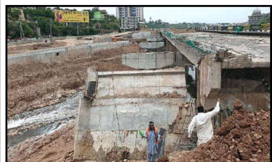
RAWALPINDI: Labourers busy in construction work underway on the collapsed bridge at Swan near High Court.