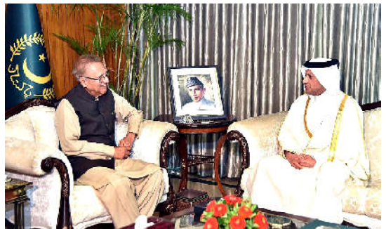
ISLAMABAD: The outgoing Ambassador of Qatar to Pakistan, Sheikh Saoud Bin Abdulrahman Faisal Al-Thani called on President Dr Arif Alvi at Awwan-e-Sadr