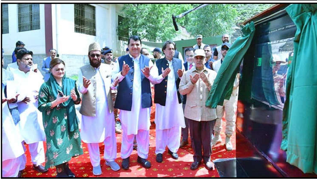
TORGHAR: Prime Minister Muhammad Shehbaz Sharif laying the foundation stone of the RCC Bridge on the River Indus that will connect Torghar with Buner District, Torghar, KP.