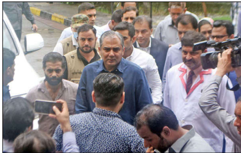
LAHORE: Caretaker Chief Minister of Punjab Mohsin Naqvi arrives at Mozang Teaching Hospital to examine the condition of injured during fallen of shelter incident during rain, in Provincial Capital.

supervising their care. If necessary, the injured will be referred to other hospitals for treatment, he added. Emphasizing that the city's drainage situation was under control, Mohsin Naqvi assigned provincial ministers to monitor rainfall and potential flooding in their respective divisions. Instructions have been issued to all commissioners and deputy commissioners to take necessary measures in response to possible flooding. He said eight provincial secretaries were monitoring the performance of WASA and water drainage in their respective zones as they remained present in the field to supervise activities.