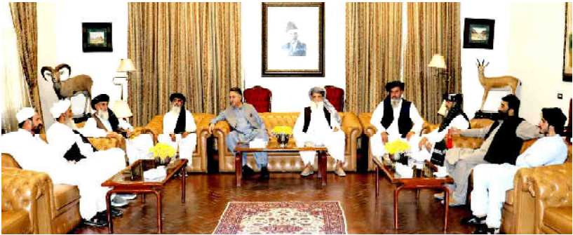
QUETTA: A delegation of Kucklak led by tribal leader Char Gul meeting with Governor Balochistan Malik Abdul Wali Khan Kakar

Launched in 2013, CPEC is a corridor linking the Gwadar port in southwestern Pakistan with Kashgar in north-west China's Xinjiang Uygur Autonomous Region, which highlights energy, transport and industrial cooperation.