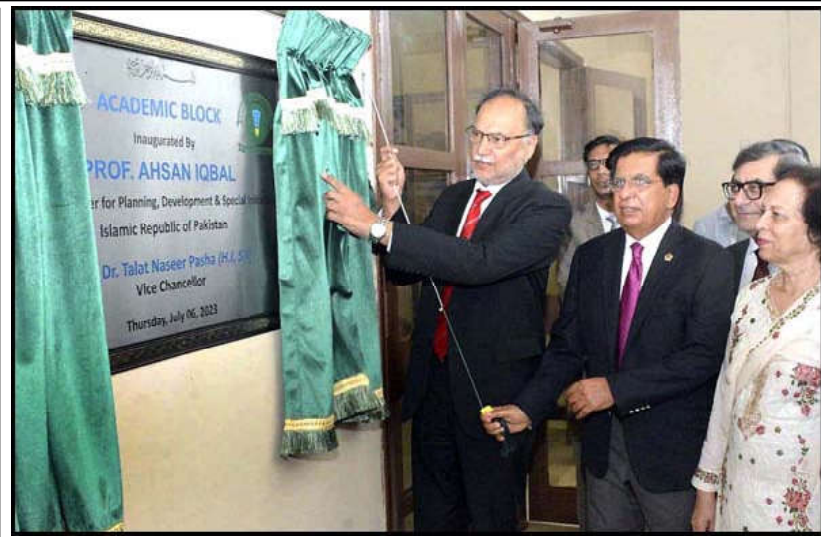
LAHORE: Federal Minister for Planning and Development and Special Initiatives Professor Ahsan Iqbal is inaugurating the project of University of Education College.

He said that if nation would be divided then country's progress and prosperity was not possible. Ahsan Iqbal said that with the grace of Allah Almighty, once again the world was reposing confidence in Pakistan. He said that focus should be on developing brain power instead of muscle power as the future of any country was based on innovations made in classrooms and laboratories. The US-Pakistan knowledge Corridor initiative was taken under which scholarships were given to 10,000 PhDs in top 100 American universities, he added. He said the country's future was linked with universities and they should not only focus on providing education but also on research, innovation, academia and industrial linkages, community service, technologically enabled.