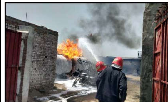
MULTAN: Fire extinguishers are busy in dousing a fire that erupted at a chemical factory, in Multan.