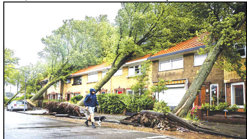
A man walks his dog by uprooted trees following a storm in Haarlem, the Netherlands.

The Belfast-born law professor said she believes the cross-section of "high-value" and "non-high-value" detainees she met with — the Biden administration gave her free rein to talk to anyone — "recognized the importance of sitting in a room with me." "I think there was a shared understanding that at this point, with only 30 of them left, while I can make recommendations and they will hopefully substantially change the day-to-day experience of these men, the vast majority of their lives was lived in a context where people like myself.