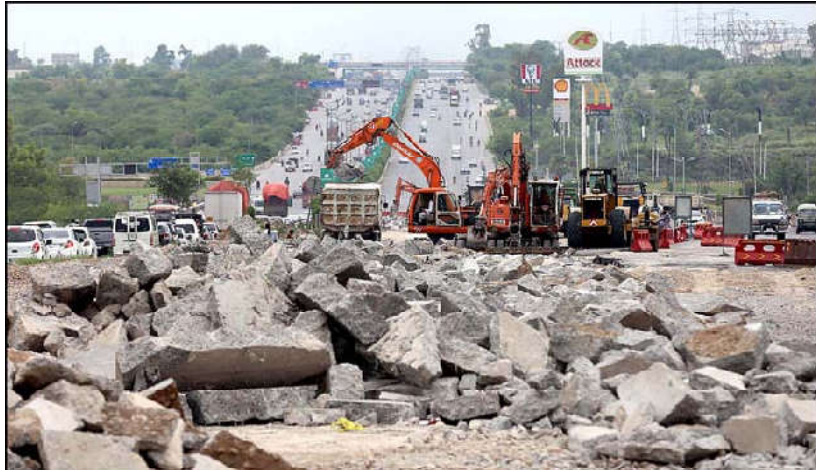
ISLAMABAD: Heavy machinery being used to expand Islamabad Expressway during development in Federal Capital.

While discussing civilian trials under the Army Act, the law minister explained that the Act and rules made thereunder were guaranteeing the rights of the accused such as engaging a counsel of his choice to engage, the right to have access to family members or friends and right to file an appeal etc. Individuals have also the right to move constitutional courts against the judgments of the military court, he added.