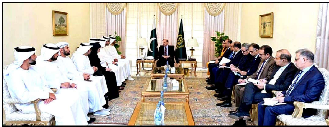
ISLAMABAD: President Designate COP28 and Minister for Industries & Technologies of UAE Dr Sultan Al Jaber call on Prime Minister Muhammad Shehbaz Sharif.