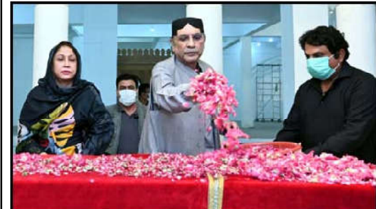
GARHI KHUDABUX: PPP Co-Chairman Asif Ali Zardari and Faryal Talpur are showering rose petals and offers Fateha for the peace of departed soul of Benazir Bhutto during their visit to Bhutto Mausoleums in Garhi Khuda Bux.

demolish all illegal encroachments along with the rivers and streams and clear the waterways in all the cities just before the full monsoon season. "An early and rapid information system must be set in place so that the people living in the low-lying areas should get immediate information about the flood situation", the government directed the related State functionaries including the Divisional and district administrations across the State. Following many impending additional rains during the season in the region, authorities have decided to enhance and improve the capacity of the SDMA to deal with any eventuality during monsoon in the region.