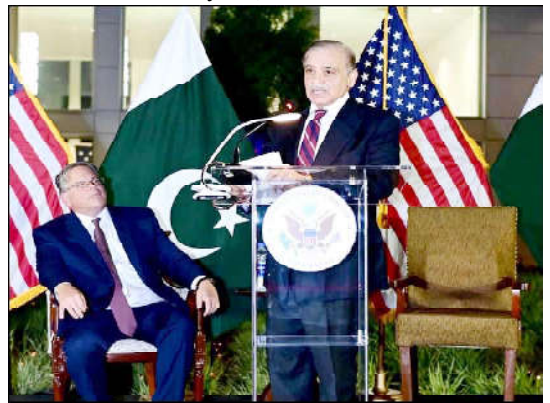
ISLAMABAD: Prime Minister Muhammad Shehbaz Sharif addressing a ceremony of the celebration of the 247th Independence Day of the United States of America

He said about five years ago when Pakistan was facing serious power outages, the then government established 5000 megawatts of LNG-based power plants and the entire equipment was brought from the United States.