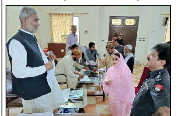
NASEERABAD: Deputy Commissioner Ayesha Zehri visiting a polling station during Local Bodies elections

The government has stepped up its efforts to ensure strict implementation of the Environmental Protection Act 2012 to protect the environment and to monitor the compliance of environmental laws at development sites. The official said the government has purchased Ambient Air Mobile Monitoring Stations to analyze the air quality index in Hub and Gwadar and curb air pollution. The Environment Protection Department is conducting a feasibility study on solid waste management to resolve the issue on permanent bases and protect.