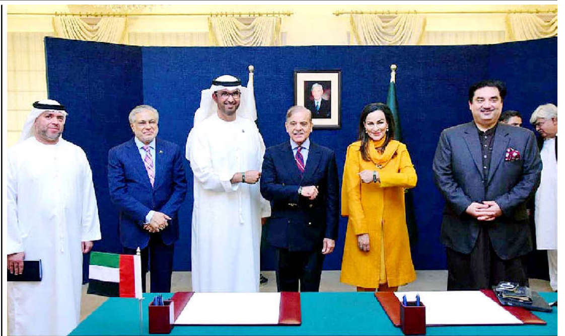
ISLAMABAD: Prime Minister Muhammad Shehbaz Sharif, UAE's President-designate for COP28 Dr Sultan Ahmed Al Jaber, Federal Minister for climate change Ms Sherry Rehman displaying COP28's wrist band as a display of commitment to climate change agency