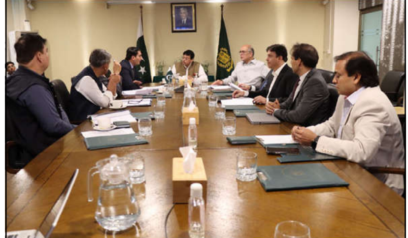
Federal Minister for IT and Telecommunication Syed Amin Ul Haque chairing policy Committee meeting of Research & Development Fund in Islamabad.

2023-24 was approved. The meeting was attended by high-ranking officials from the IT sector, including the Secretary IT and representatives from the Cabinet Division and Finance Ministry. The CEO of USF briefed the chair about the ongoing projects. The minister also presided over the Policy Committee meeting of the Research & Development Fund. The CEO of Ignite, a government-owned technology innovation organization, presented various future projects during the meeting. The annual budget of Ignite for FY 2023-24, amounting to Rs 3,206 million, was approved. Syed Amin Ul Haque highlighted the challenges faced by telecom companies in importing equipment and upgrading systems due to limited Letters of Credit (LCs), causing delays in completing USF's ongoing projects. The minister assured his commitment to addressing this issue and finding suitable solutions.