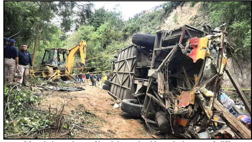
Mangled wreckage of bus lying on its side at the bottom of cliff.

The app went live on Apple and Android app stores in 100 countries at 23:00 GMT on Wednesday, and will run with no ads for now, but its release in Europe has been delayed over data privacy concerns.