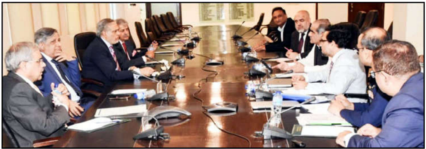
Federal Finance Minister Senator Muhammad Ishaq Dar chaired a meeting on restructuring of PIA at Finance Division.

ISLAMABAD (APP): The per tola price of 24 karat gold increased by Rs 1,800 and was sold at Rs 207,800 on Thursday against its sale at Rs. 206,000 the previous day. The price of 10 grams of 24 karat gold also increased by Rs1,543 to Rs178,155 from Rs 176,612 whereas the price of 10 grams 22 karat gold went up to Rs 163,309 from Rs161,894, All Sindh Sarafa Jewellers Association reported. The price of per tola and ten-gram silver remained constant at Rs 2480 and Rs 2,126.20 respectively. The price of gold in the international market decreased by $23 to $1905 from $1928, the association reported.