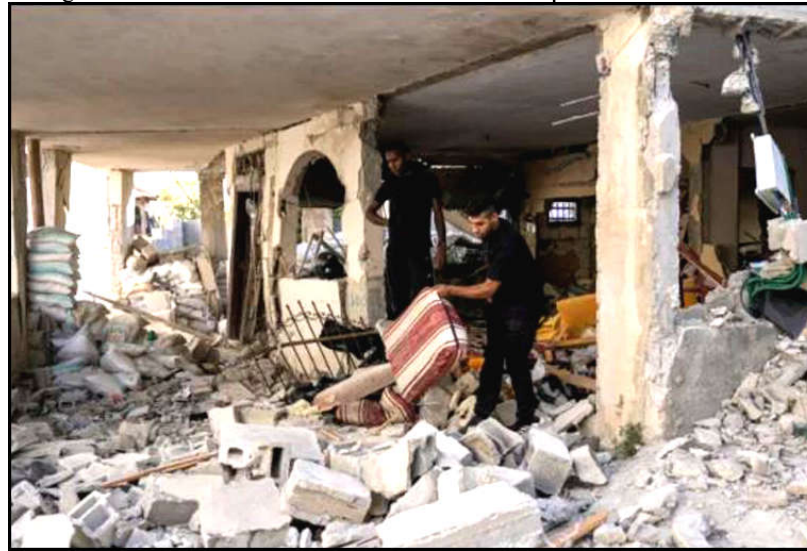
Palestinians inspect a damaged house in the Jenin refugee camp in the West Bank.