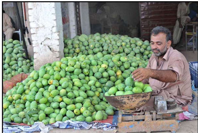
MULTAN: A trader selling seasonal fruit mango at Fruit Market.

200 of them recorded gains and 112 sustained losses, whereas the share price of 23 companies remained unchanged. The three top-trading companies were WorldCall Telecom with 28,845,201 shares at Rs.1.21 per share; Pak Elektron with 16,169,219 shares at Rs.10.66 per share and Pak Petroleum with 14,126,634 shares at Rs.67.24 per share. Mehmood Text witnessed a maximum increase of Rs.43.15 per share price, closing at Rs.725.00, whereas the runner-up was Shield Corp with an Rs.21.97 rise in its per share price to Rs.314.86.