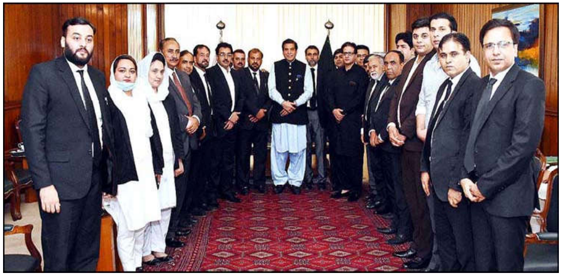
ISLAMABAD: Speaker National Assembly Raja Pervez Ashraf in a group photo with delegation of Gujjar Khan Bar Council at Parliament House.

mittee that the process of filling the vacant Chair in Uzbekistan was nearing completion. However, no candidate met the requirements for appointment as the Chair in Iran. Discussions were underway with Columbia University to overcome the challenges hindering the appointment of a Chair there. The Chairman directed the ministry to provide a university-wise breakdown of the vacant chairs abroad, along with reasons for the prolonged vacancies.