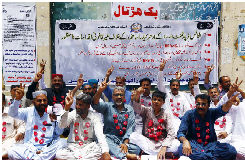
KARACHI: Members of Sindh Balochistan Art and Drawing Teachers Association are holding protest demonstration for acceptance of their demands, at Karachi press club

He said Pakistan was not against the freedom of speech but no one had the right to desecrate any one's belief or fan hatred in this garb.