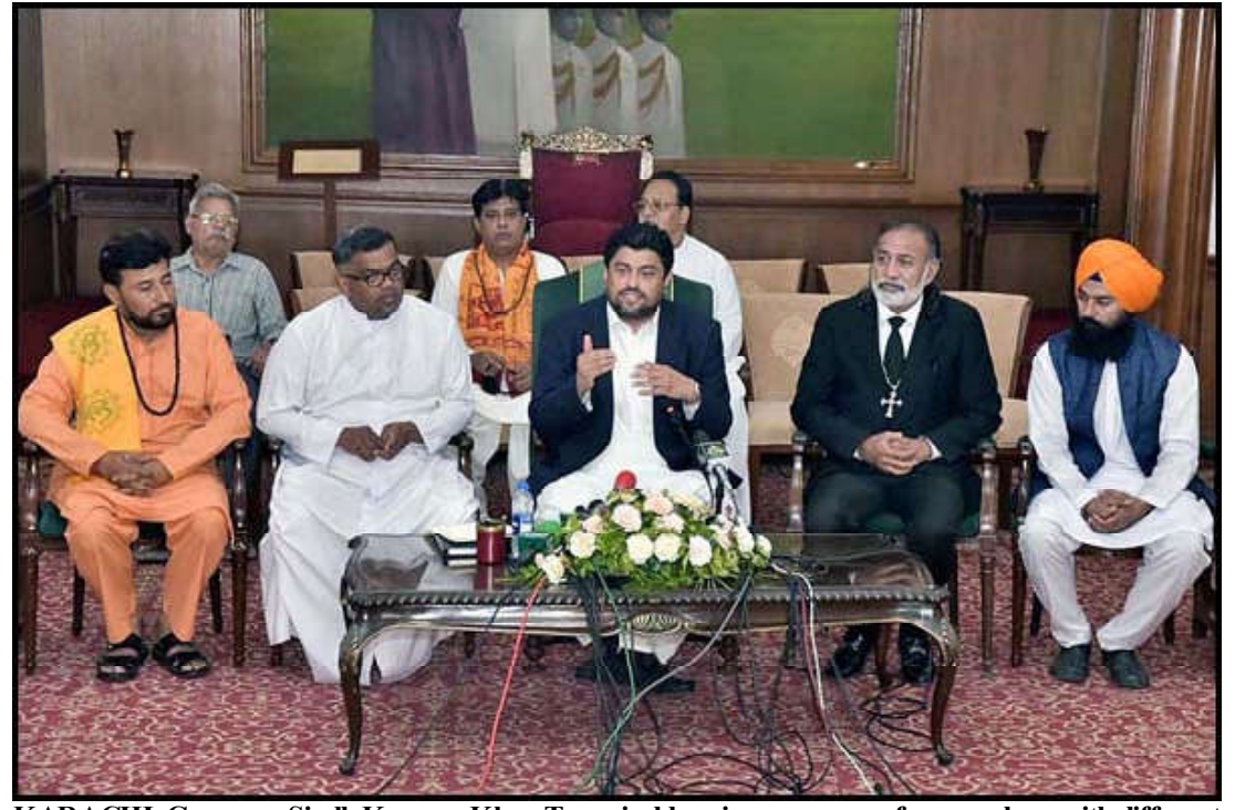
KARACHI: Governor Sindh Kamran Khan Tessori addressing a press conference along with different religious leader against the burning of holy Quran outside a Stockholm Mosque at Governor House.

Government Rules of Business, 2011 were approved to facilitate the training of public prosecutors at the Center for Professional Development of Public Prosecutors. Financial assistance was also approved for the affected children and families of deceased children in Ahmadpur East tehsil of Bahawalpur. In a significant decision, the cabinet granted financial autonomy to the medical superintendents of all government hospitals in Punjab.