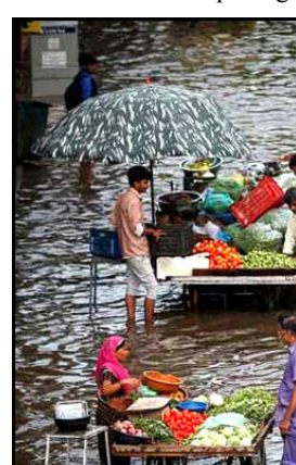
People buy fruits from a street vendor at a market in Gadaref city in war-torn Sudan.

Prigozhin later abandoned his advance on Moscow and struck a deal with the Kremlin, accepting exile in neighbouring Belarus. Andrey Kartaplov, the head of the State Duma Defence Committee, stated that there is no threat regarding a drop in the combat potential of the Russian military in the mid-term and long-term perspective.