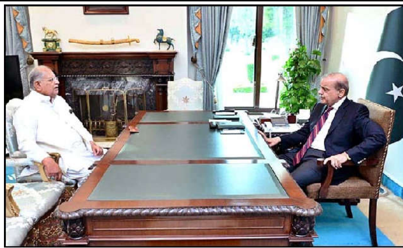
ISLAMABAD: Federal Minister for Human Rights, Riaz Hussain Pirzada talks on Prime Minister Muhammad Shehbaz Sharif.

ISLAMABAD (INP): The Islamabad High Court (IHC) on Monday adjourned hearing on an intra court appeal of former minister Shireen Mazari regarding the remarks of Defence Minister Khawaja Asif about her in 2016 at National Assembly till Thursday. The IHC sought arguments on maintainability of the ICA from the petitioner's lawyer on next hearing.