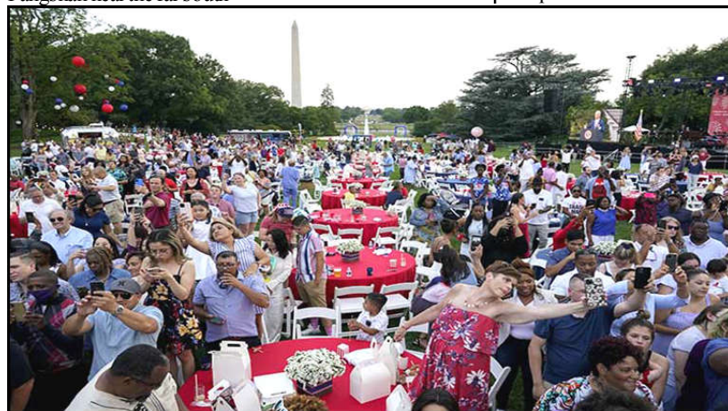
Fanfare, golf and boos have marked July Fourth for US presidents.

Pingtung, which looks out on the Taiwan Strait, South China Sea, Pacific Ocean and Bashi Channel that separates Taiwan from the Philippines, is a highly strategic spot to watch Chinese military activity, and a potential landing site in an invasion.