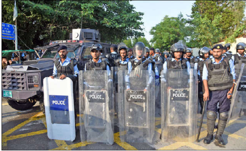
ISLAMABAD: Police personnel stand guard outside Sweden Embassy during the Protest of Jamat-e-Islami against burning of Holy Quran in Sweden.

The Muslim world should prevent the repetition of such anti-Islamic behavior and not let the perpetrators of hurting the feelings of Muslims go unpunished, he added.