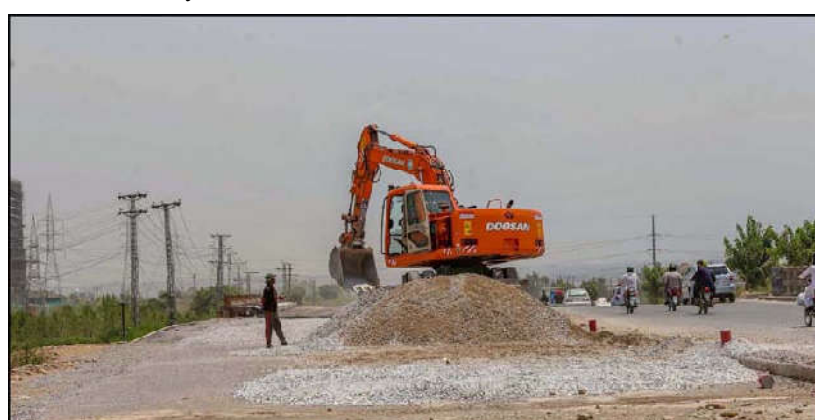
ISLAMABAD: Heavy machinery being used to expand lanes for smooth traffic on Islamabad Expressway.

Tourists also took a keen interest in the cable car to cross the Swat River, said a resident.