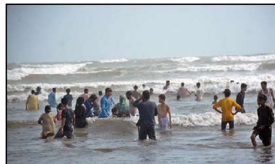
KARACHI: A large number of people enjoy in water and get some relief from hot weather at Seaview.

Governor Punjab said that the entire nation is united in the fight against terrorism. Governor Punjab extended condolences to the families of the martyrs and prayed that Allah Almighty grant the deceased a place in His mercy and give the courage to the bereaved to bear this loss with patience and perseverance. He also prayed for the speedy recovery of Lance Naik who was injured in this terrorist incident.