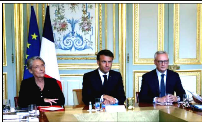
French President Emmanuel Macron, French Prime Minister Elisabeth Borne and Economy Minister Bruno Le Maire attend a government emergency meeting at the emergency crisis center of the Interior Ministry in Paris.