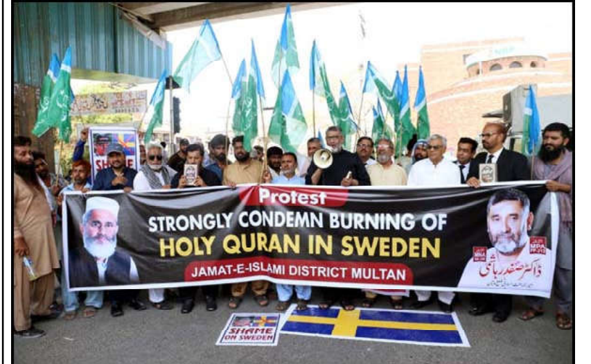
MULTAN: Members of Jamat-e-Islami (JI) are holding protest demonstration to condemn the latest incident of desecration of the Holy Quran in Sweden, held in Multan