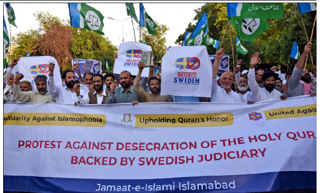
ISLAMABAD: Workers of Jamat-e-Islami holds protest outside Sweden Embassy against burning of Holy Quran in Sweden.

Shehbaz Sharif vowed to continue the journey of economic stability and national development with the same direction, spirit and struggle.