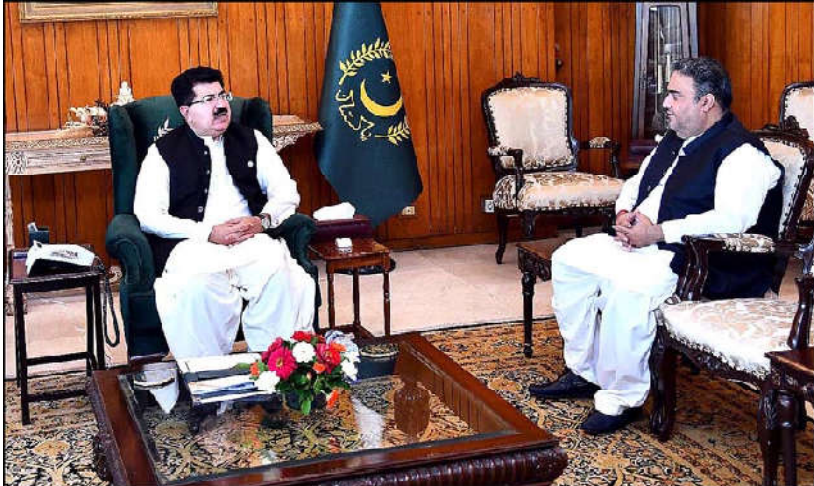
ISLAMABAD: Senator Danesh Kumar called on the Acting-President, Muhammad Sadiq Sanjrani at Aiwan-e-Sadr.