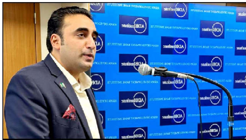
TOKYO: Foreign Minister Bilawal Bhutto Zardari speaking at the Asian Development Bank Institute on the topic Pakistan and Japan in the Asian Context