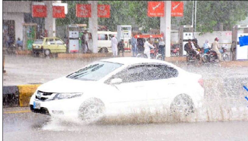
ISLAMABAD: Motorists are on their way at Murree Road during heavy rain fall of Pre-monsoon spell in Federal Capital.

Alam Lohar was famous for his rendition of "Heer Waris Shah" along with other songs such as "Saif-ul-Malook" and "Jugn". He was awarded Prize of Performance in 1979 by the government of Pakistan.