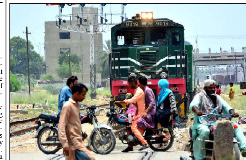
HYDERABAD: Dangerous moment as a motorcyclists crossing railway track while the train is approaching at makki shah area

A 29-member rugby contingent including 25 players and four officials from UAE have reached Lahore to participate in the two-match Asia Rugby Men's Division 1 series. The international match officials from Hong Kong, Singapore, Malaysia, Qatar and Japan will supervise the two-match Asia Rugby Men's Division 1 series. Asia Rugby has also appointed Rizwan Malik as the Citing Commissioner for the entire tournament.