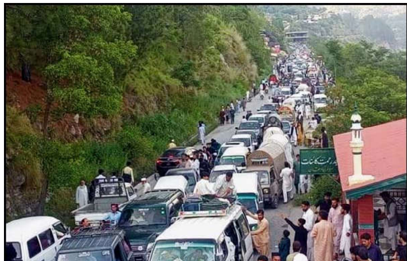
ABBOTTABAD: A large numbers of vehicles stuck in traffic jam due to negligence of traffic police staffs and illegal parking, at Galyat area in Abbottabad

the MoU, Meezan Bank Limited has pledged to provide financial support to the KU for capacity-building initiatives specifically designed for faculty members. The primary objective of the MoU is to empower the faculty with a comprehensive understanding of Islamic banking principles, practices, and emerging trends. This partnership aims to equip them with up-to-date knowledge and specialized skills, thereby raising the standards of education and research in Islamic banking. On this occasion, the EVP and Head of Shariah Audit of