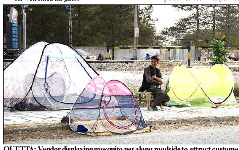
QUETTA: Vendor displaying mosquito net along roadside to attract customers

The OGDCL's installation of the gas processing plant, along with their community development endeavors, showcases their dedication to the welfare of the local population and sets an example of responsible corporate citizenship in the country.