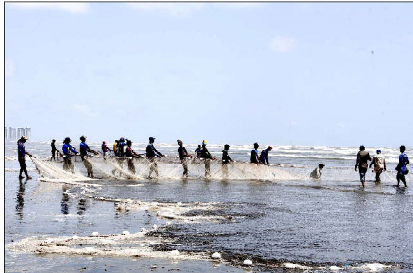
KARACHI: Fishermen drawing back their fish catching net from sea at the end of day, during heavy summer season, at Seaview Beach of Karachi

One library each was also established at Khyber, Mohmand, Bajaur, Kurram, Orakzai, North Waziristan and South Waziristan. He said work on solarization of colleges costing around Rs 1.6 billion was launched. The official said Rs 1.399 billion earmarked to provide 5,500 internships to tribal students.