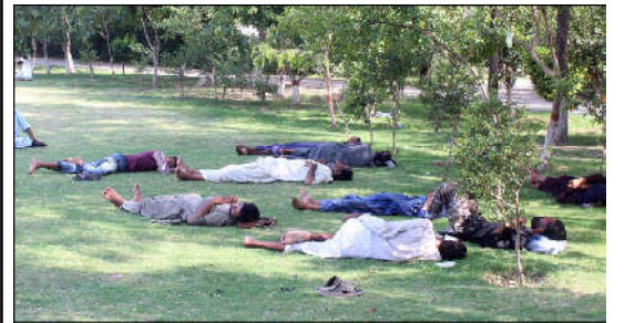
ISLAMABAD: Laborers are taking rest under the shadow of trees at Liaquat Bagh during high temperature in City.

Moreover, he said that national-level conferences and forums on literature often exclude children from active participation.