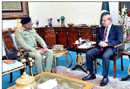
ISLAMABAD: Chairman Joint Chiefs of Staff Committee General Sahir Shamshad Mirza calls on Prime Minister Muhammad Shehbaz Sharif