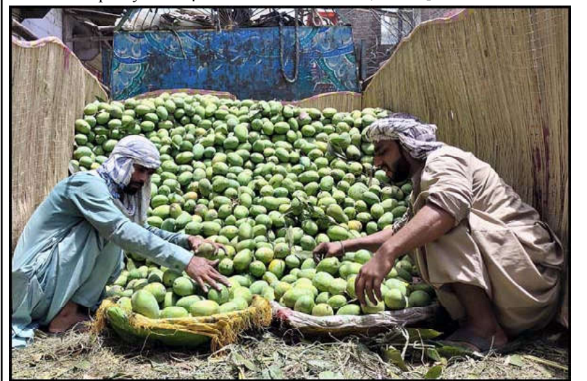
LARKANA: Labourers busy in unloading mangoes from a delivery truck at Fruit Market.

However, Chamber President urged the government to improve financial management and discipline.