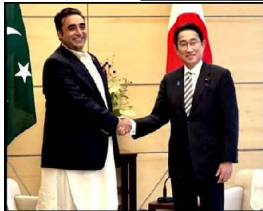
Foreign Minister Bilawal Bhutto Zardari meeting with Japanese Prime Minister Fumio Kishida in Tokyo

He asserted that the terrorists and their perpetrators would be taken to task. The Minister said that the whole nation pays salute to the brave souls of the security forces.