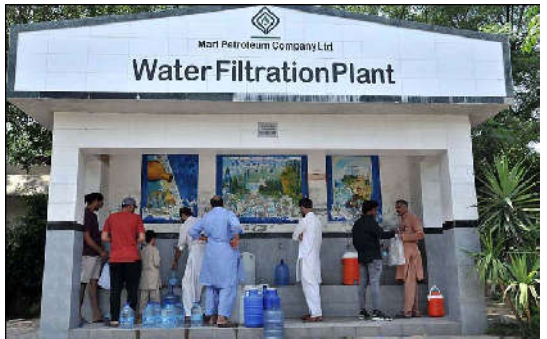
ISLAMABAD: People fill their pots with clean drinking water from water filtration plant in I-8 Sector.

According to deputy commissioner Rawalpindi, the PTI leader has been put under house arrest for another 15 days under Maintenance of Public Order (MPO) section 3.