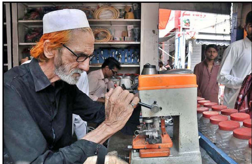
ISLAMABAD: An elderly person busy in making duplicate key at Aabpara Market.

He expressed serious apprehensions about a hike in electricity.