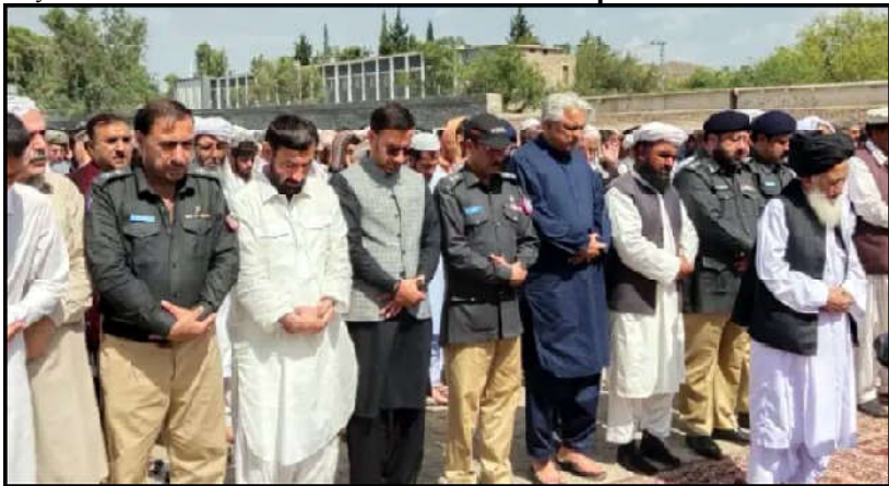
Funeral prayer of the martyred policemen being offered in Zhub