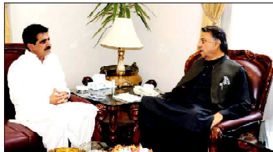
QUETTA: Central Executive Member of Balochistan National Party Haji Zahid Baloch meeting with Governor Balochistan Malik Abdul Wali Khan Kakar

"We also deliberated on investments and joint ventures by Japanese enterprises in Pakistan."