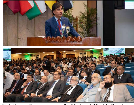
Addressing the conference, the Secretary Population said that multi-sectoral approach is being adopted in Balochistan to improve Family Planning and Reproductive Health Services, aiming at improving the health of mothers and children.

lights the case of Balochistan in the “National Conference on Resilient Pakistan: Calibrating Population and Resources” held on July 14-15, 2023 at the Supreme Court of Pakistan, Islamabad.