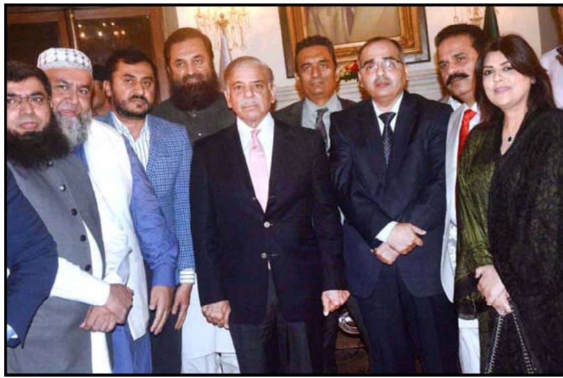
LAHORE: Prime Minister Shehbaz Sharif in a group photo with the delegation members of Chamber Of Commerce at Governor House.

He also lauded efforts of organizers for holding the exhibition and suggested that these events should be arranged in future to benefit people associated with the industry.