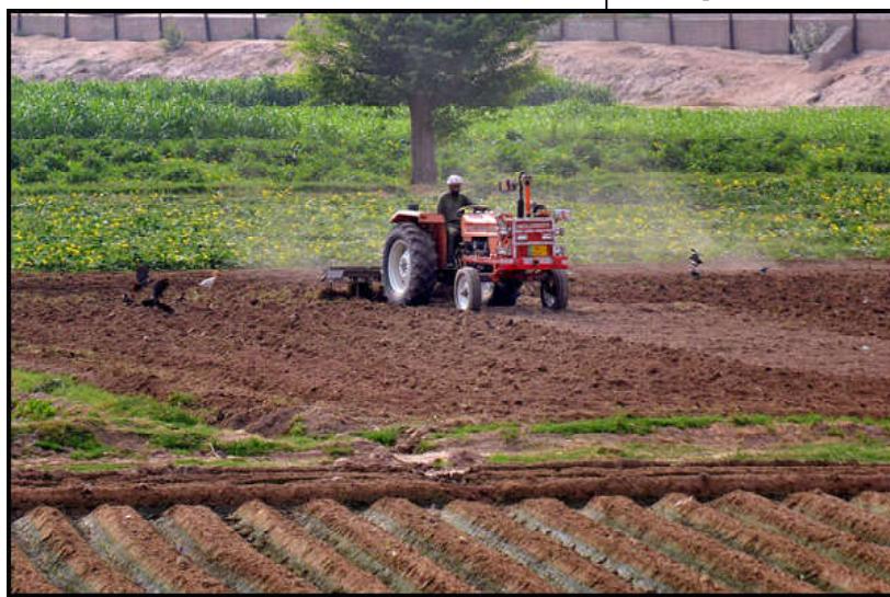
MULTAN: A farmer ploughing field before the next crop by the help of tractor at the outskirts of the city.

It also has significant importance in building a closer China-Pakistan partnership with a shared future in the new era, its developer added. The two countries have jointly built four 300,000-kilowatt nuclear power units.