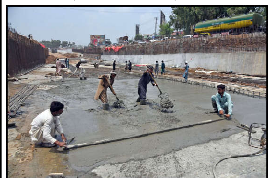
ISLAMABAD: Laborers are busy in their work during the construction of Interchange at National Highway in Federal Capital.

He said that the Opposition parties must follow moral legitimacy as they were bound to abide by the rule of law of the country.