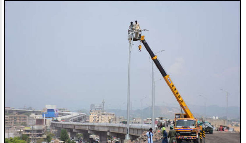
ISLAMABAD: Workers of Capital Development Authority (CDA) are busy in giving final touch to the newly constructed Bara Kaho Interchange to meet the dead line for inaugurating by PM in Federal Capital.

The hospital will be equipped with 12 emergency beds, 10 orthopedic beds, 15 cardiology beds, six surgical ICU beds, six cardiac ICU beds, 14 surgical beds, 15 general medicine beds, eight neurology beds, five medical ICU beds, four cardiac care units, and five beds for weapon injuries and physiotherapy.