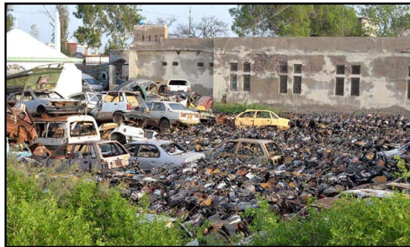
HYDERABAD: A large number of seized vehicles and motorcycles parked at Hatri Police Station in a miserable condition.

Multan Police was taking concrete steps to maintain peace in the city.