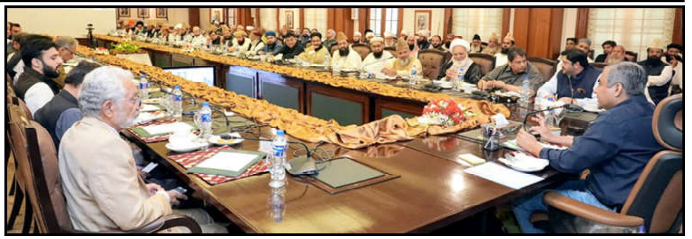
LAHORE: Caretaker Chief Minister Punjab Mohsin Naqvi presiding over meeting of Ittehad Bainul Muslimeen Committee Punjab. More than 70 renowned Ulema Karam, Mashaikh of all schools of thought along with representative literary and religious personalities participated in the meeting