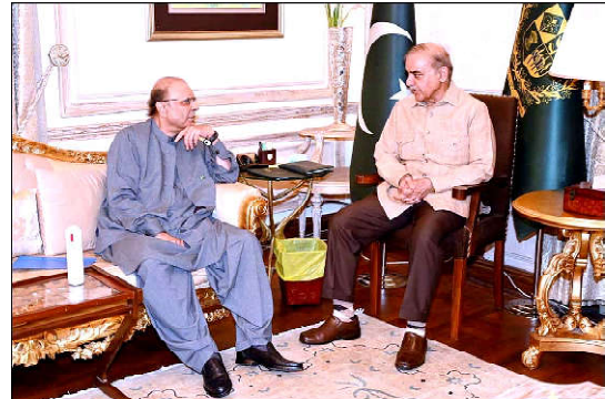
LAHORE: Former President PPP Asif Ali Zardari calls on Prime Minister Muhammad Shehbaz Sharif.

Asserting that the ongoing situation could no longer persist, the minister stated that Pakistan would utilize all possible resources and measures to safeguard its territory and citizens.