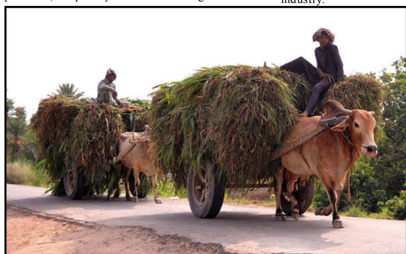
MULTAN: Bull cart holders on the way loaded with green fodder for animals after cutting from the field

The event witnessed active participation from WUS faculty members, including Malecha.