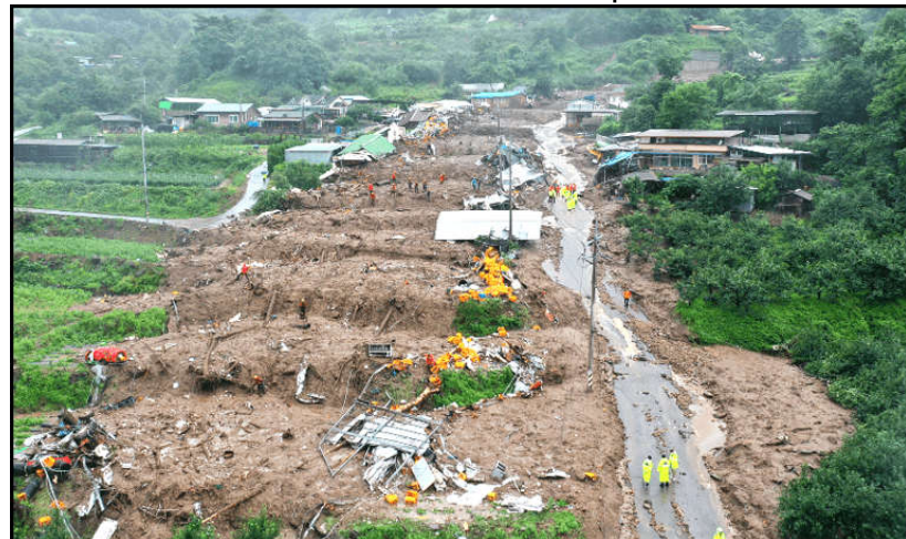
A general view shows landslide caused by torrential rain in Yecheon, South Korea.

to secure the rights of self-determination for Sikhs in the Punjab region, where they form the majority, and which is currently governed by India. In an official communication dated July 13, 2023, High Commissioner Verma addressed the Government of Canada, stating that the Sikh for Justice's 'illegal' referendum is an ineffective effort to undermine the Canada-India relationship. Furthermore, he warned Canadian Sikhs, mentioning that millions of India's supporters in Canada would counter the