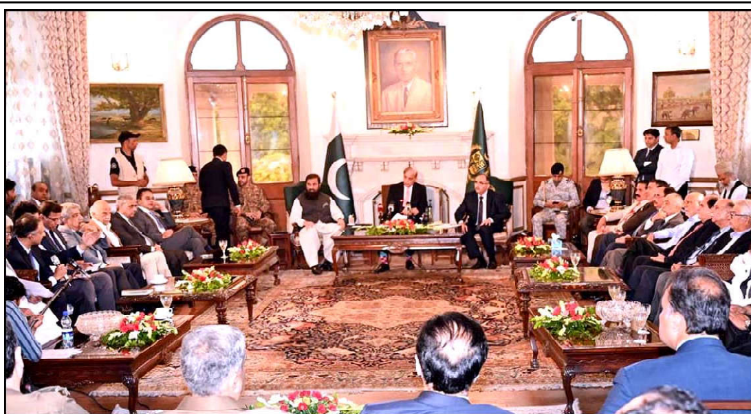
LAHORE: Prime Minister Shehbaz Sharif addresses a delegation of members of Lahore Chamber of Commerce and renowned businessmen

He said that at the time when the hockey is on decline in the country, it is our utmost endeavor to promote hockey and make Balochistan hub of the national sport.