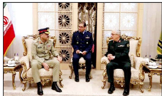
Chief of the Army Staff General Syed Asim Munir in a meeting with Chief of General Staff for the Armed Forces of Iran Mohammad Bagheri