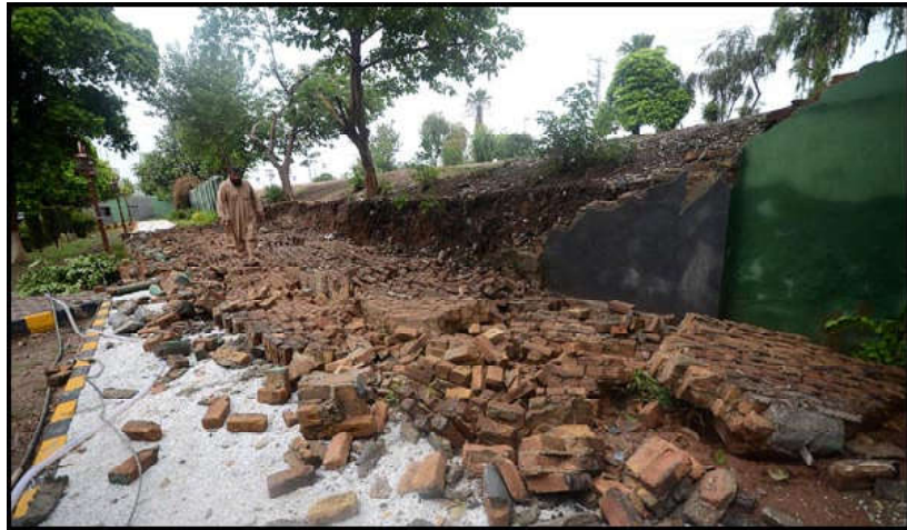
PESHAWAR: A view of fallen wall of Jinnah Park Due to heavy rain.

She said the dire political and human rights situation in the occupied territory had left India exposed at the international level. Lauding the sacrifices of people living at the Line of Control (LoC), adding that Kashmiris had been braving the brunt of firing at the LoC with the utmost courage. She urged the people of IIOJK to observe a complete strike on July 19 on both sides of the line of control.