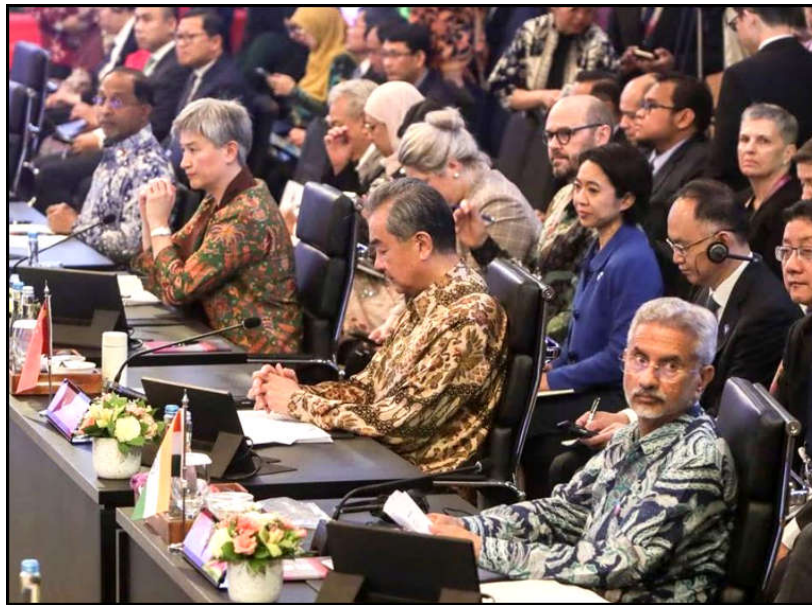
Malaysia's Foreign Minister Zambry Abdul Kadir, Australia's Foreign Minister Penny Wong, China's Communist Party's foreign policy chief Wang Yi, India's Foreign Minister Subrahmanya Jaishankar attend the East Asia Summit Foreign Ministers' Meeting in Jakarta, Indonesia.

both sides, Wang told Jaishankar during their meeting on Friday. "The two sides should support each other and accomplish things together, rather than wear each other down or suspect each other," Wang said. India and China should not let specific issues define their overall relationship, he said. The two sides agreed to hold the next round of military commander-level talks on border issues at an early date, the Chinese foreign ministry said. Since 2020, New Delhi has also ramped up scrutiny of Chinese businesses, banning more than 300 Chinese apps, including TikTok. It has also intensified scrutiny of investments by Chinese firms.