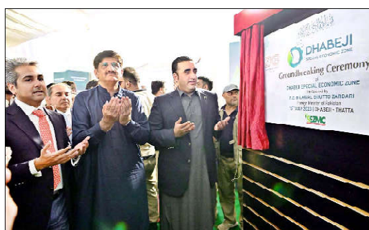
THATTA: Chairman Pakistan People's Party and Foreign Minister Bilawal Bhutto Zardari offers Dua after unveiling the plaque of the groundbreaking ceremony of Sindh Government flagship project Dhabeji Special Economic Zone at Dhabeji.

He said that projects like Karachi-Thatta Dual Carriageway, Jhirik Bridge on River Indus and Thar Coal Mining were completed ahead of schedule under PPP-mode, adding that the projects run by the Sindh government were recognized worldwide.