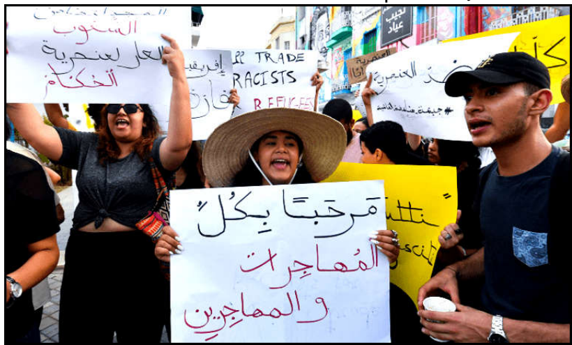
Demonstrators lift placards and chant anti-racism slogans during a protest in Tunis.

Monitoring Desk GENEVA: Some 289 children are known to have died in the first half of 2023 while trying to cross the Mediterranean Sea to Europe, the United Nations said. The figure is double that recorded in the first six months of 2022, the U.N. children's agency Unicef said, as it called for expanded safe, legal and accessible pathways for children to seek protection in Europe. Verena Knaus, a Unicef official, said the true figures were likely to be higher as many shipwrecks on the central Mediterranean leave no survivors or go unrecorded. "These deaths are absolutely preventable." Knaus said that in the first six months of 2023, an estimated 11,600 children made the crossing. Tunisian rights groups called on Friday called emergency aid and shelters for migrants expelled from Sfax last week, as dozens of people protested in Tunis in support of their plight.