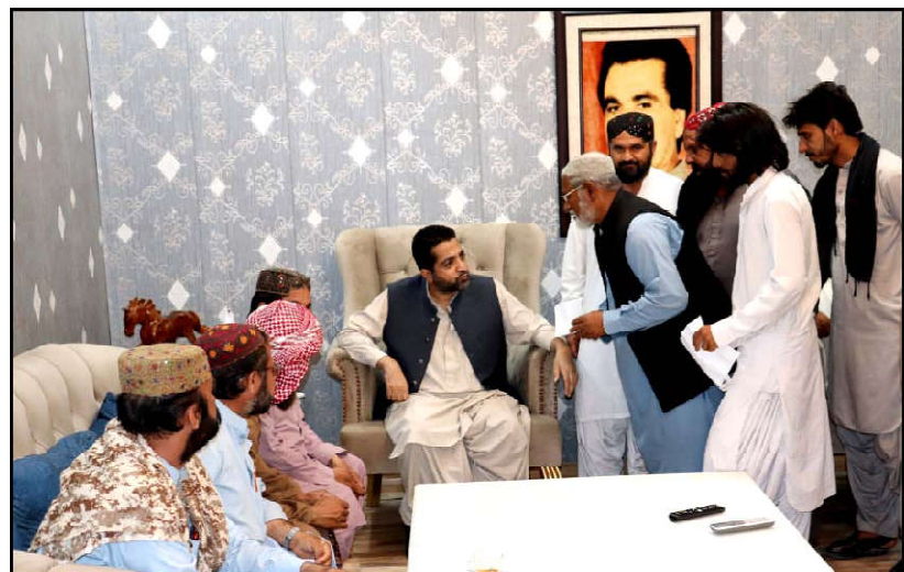
QUETTA: Home Minister Mir Ziaullah Langko listening problems of people