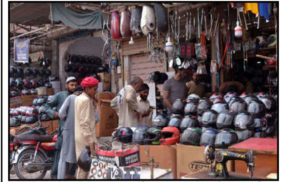
MULTAN: Motorcyclists purchasing safety helmets from a shop. District Govt has issued a notification to enforce the order of wearing helmets to ban petrol refueling to motorcyclists, and a zero-tolerance policy for motorcycle riders without helmets has been adopted.

According to police officials, a woman and two male persons died on the spot while two were injured badly.