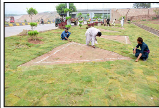
ISLAMABAD: Workers of Capital Development Authority (CDA) are busy in giving final touch to the newly constructed Bara Kaho Interchange to meet the dead line for inaugurating by PM in Federal Capital.

"The order will never ever be acceptable to the general run of Kashmiris," he said. Prof Soz said that restoration of Statehood was not the main demand of the people of the occupied territory. He said, "A group of so-called Kashmiri politicians has now come into the open by suggesting the restoration of the statehood as the main demand of the people." "This is, however, not the main demand, that is why some people have gone to the Supreme Court of India to appeal against the Indian government's Ordinance issued on August 5, 2019.