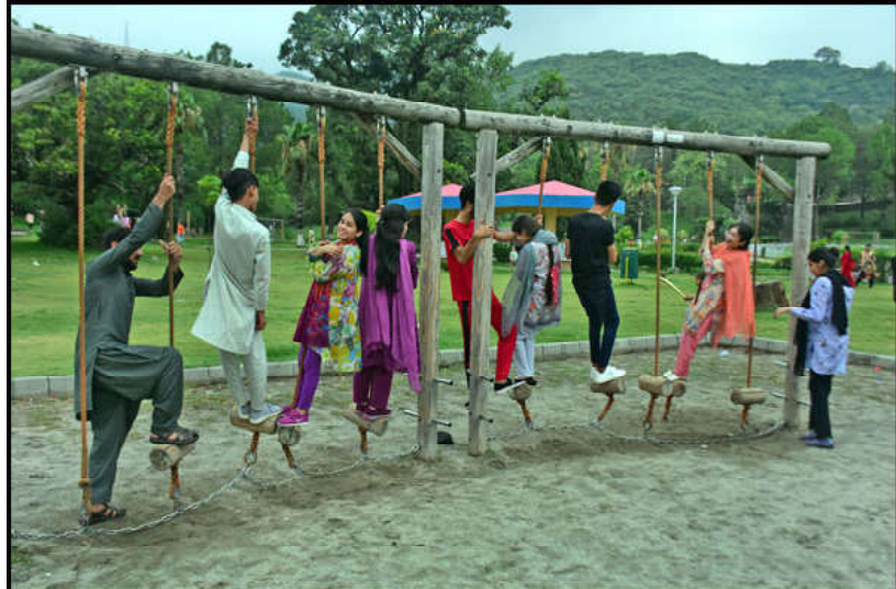
ISLAMABAD: Families are enjoying at Japanese Children Park during pleasant weather after rain in Federal Capital.

He also requested citizens to assist police in curbing crime as successful policing is not possible without the cooperation of citizens.