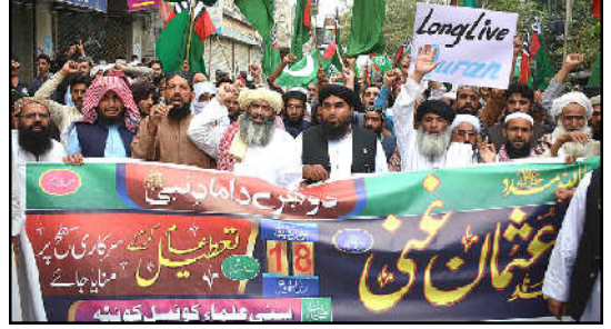
QUETTA: Activists of Suni Ulema Council hold protest out Quetta Press Club.