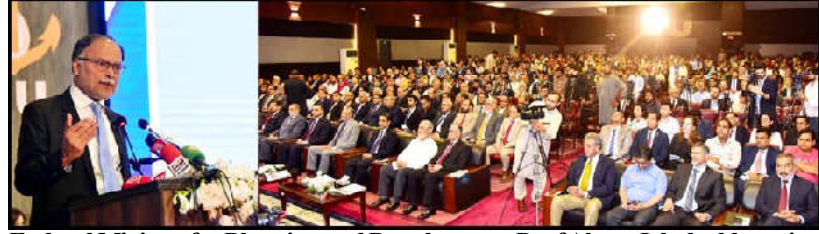
Federal Minister for Planning and Development Prof Ahsan Iqbal addressing the seminar on "CPEC- The Road to Prosperity and Growth Amidst Challenges" in Islamabad.