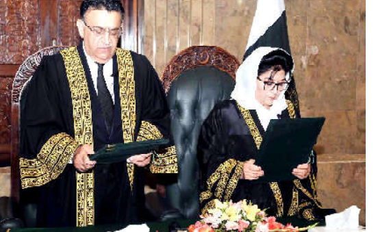
ISLAMABAD: Chief Justice Mr. Justice Umar Ata Bandial administering the oath to Justice Musarrat Hilali, Chief Justice Peshawar High Court as Judge of the Supreme Court of Pakistan

ISLAMABAD (Online): Islamic world, the OIC must chalk out a coordinated and comprehensive strategy, aimed at raising global awareness about its perspective and building legal and political deterrence against rising incidents of anti-Muslim hatred and Islamophobia. While welcoming the convening of an urgent debate at the Geneva-based Human Rights Council on the issue, the Prime Minister further underscored that the OIC must raise the issue with the UN Secretary-General and at other relevant forums and bodies within the UN system. The OIC Secretary-General echoed Pakistan's condemnation and concerns about the despicable incidents of the public desecration of the Holy Quran. He reaffirmed OIC's firm commitment to tackle the contemporary scourge of Islamophobia. The Secretary General lauded Pakistan's leading role in OIC deliberations in general and on this issue in particular. He emphasized that as the collective voice of the