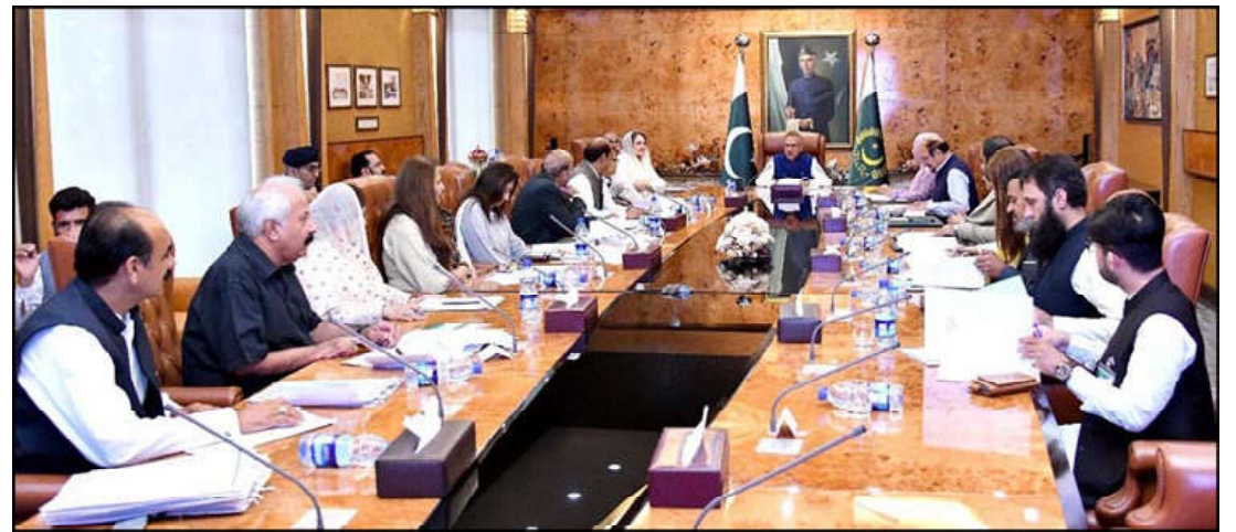
ISLAMABAD: President Dr. Arif Alvi chairing a meeting regarding the framework for the classification of disabilities, at Aiwan-e-Sadr.

would be standing on its own feet and generating resources itself, he added. The launch ceremony was attended by Federal Minister for Information and Broadcasting Marriyum Aurangzeb, Minister of State for Poverty Alleviation Faisal Kareem Kundi, members of diplomatic community and BISP beneficiaries.