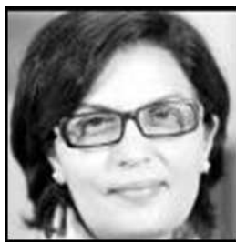
Dr Sania Nishtar

In Pakistan, polarization and rhetoric are at their peak and many conflicts abound whilst a terrifying brain drain and flight of capital are underway. With the recent IMF SLA, we have narrowly averted the threat of a sovereign default. However, it is critical now that we focus on a long-term plan for meaningful economic reform that will help prevent such a situation in the future. But first, we must introspect. Why have we landed in this situation? And beyond what's apparent, for example the numbers, we need to get a sense of their true determinants.