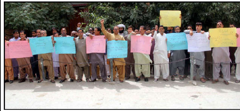
QUETTA: A protest demonstration being held by Balochistan Hindu Council and Hindu Panchayat Quetta against desecration of Holy Quran in Sweden.