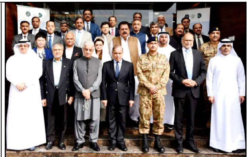
ISLAMABAD: Prime Minister Shehbaz Sharif, Chief of Army Staff General Syed Asim Munir and others in a group photo during inauguration ceremony of Land Information and Management System - Center of Excellence (LIMS - COE)

Independent Report QUETTA: Youm-e-Taqaddus-e-Quran was observed with due respect and enthusiasm in Quetta and other parts of Balochistan on Friday. The peaceful rallies were taken out and demonstrations staged marking the Youm-e-Taqaddus-e-Qura'an in the provincial metropolis and different other districts. Call for peaceful observance of the day was given by the Prime Minister Muhammad Shabbaz Sharif. A big rally was taken out by the Pakistan Muslim League-Nawaz (PML-N) Balochistan to mark the