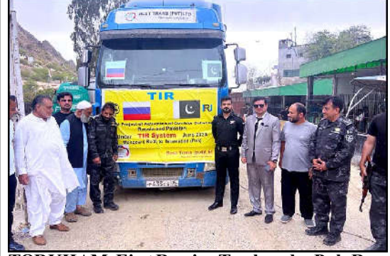
TORKHAM: First Russian Truck under Pak-Russia Road Trade Agreement reaches Torkham.

He said that the newly elected chairman and vice chairman of Ziarat district council would work on priority basis to resolve the public issues.