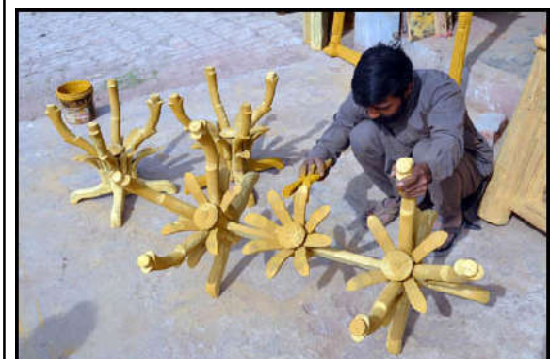
LAHORE: A wood worker given the final touches and polishes on a clothes hanger stand at Shahdara Furniture Market.