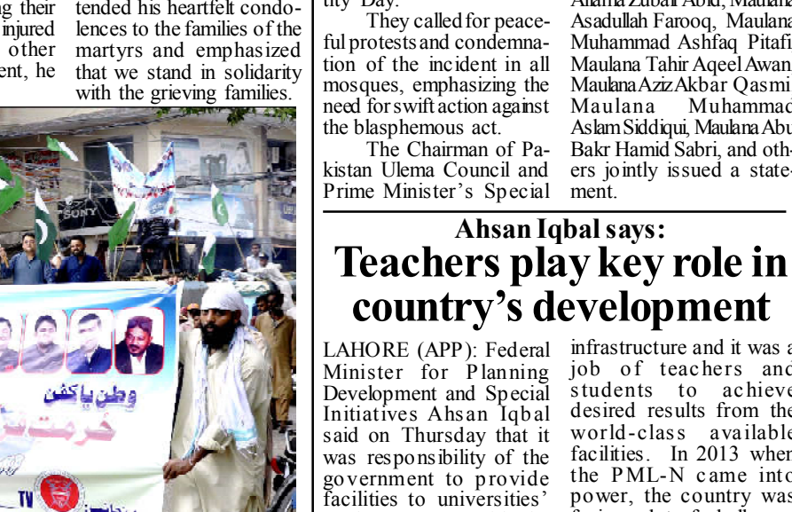
HYDERABAD: Members of Pakistan Zindabad Movement (PZM) holding protest demonstration against desecration of Holy Quran in Sweden, at Hyderabad press club