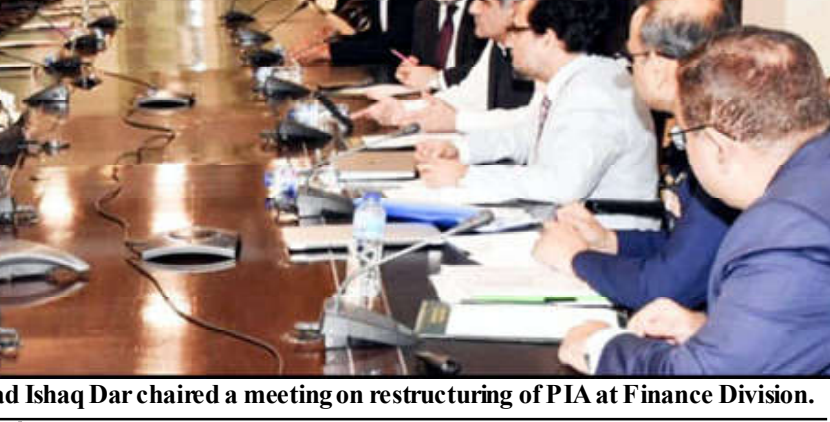
Federal Finance Minister Senator Muhammad Ishaq Dar chaired a meeting on restructuring of PIA at Finance Division.