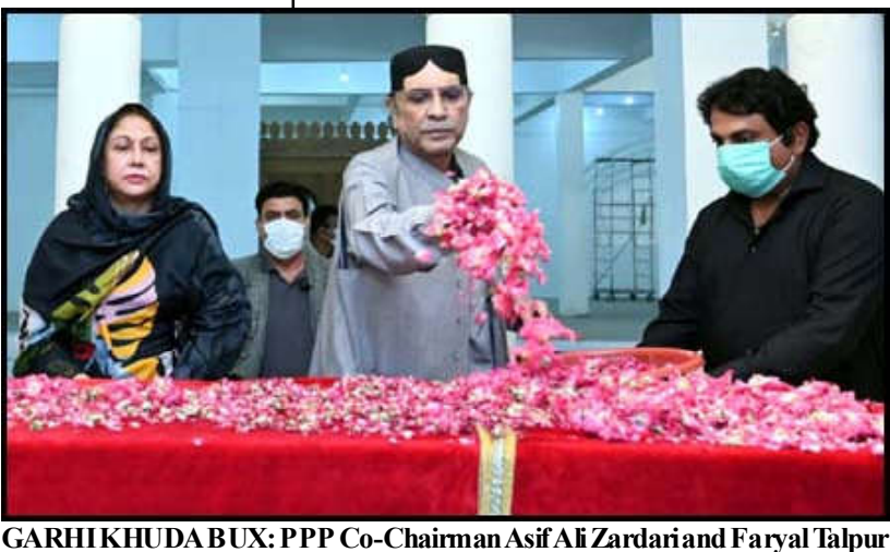
are showering rose petals and offers Fateha for the peace of departed soul of Benazir Bhutto during their visit to Bhutto Mausoleums in Garhi Khuda Bux.

ISLAMABAD (Online): addressing its competence and the way forward on the disputes between Pakistan and India concerning the Kishenganga and Ratle Hydroelectric Projects; and, wider questions of the interpretation and application of the Indus Waters Treaty." The court had upheld its competence and determined that it will now move forward to address the issues in dispute, she added. She said, "the Indus Waters Treaty is a foundational agreement between Pakistan and India on water sharing.