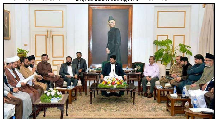
KARACHI: A delegation of Tanzeem-e-Azadari meeting with Governor Sindh Kamran Khan Tessori

The PPP Chairman saluted the Jiyalas (party workers) who were flogged, endured the hardships of imprisonment and embraced martyrdom for the sake of democracy during the Zia regime.