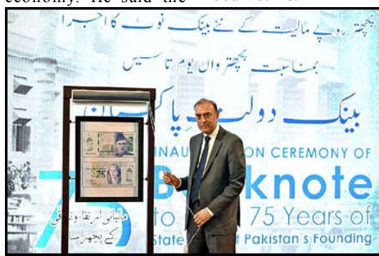
KARACHI: Governor State Bank of Pakistan Jameel Ahmad inauguration revealing the new banknote of Seventy Five Rupees during celebrating 75 years of SBP Establishment during ceremony at State Bank.