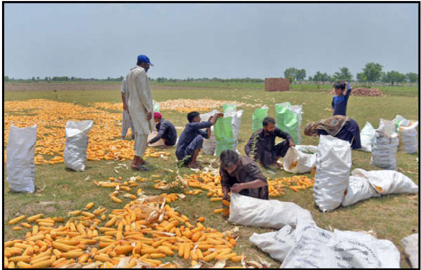
FAISALABAD: Formers are packing the Corns in sacks at Field along the Satyana Road in City.