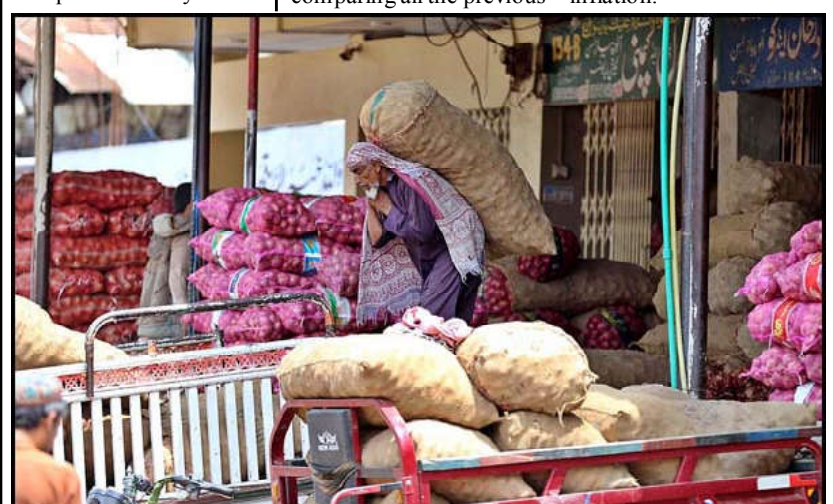
ISLAMABAD: An elderly labourer on the way loading a sack on a Suzuki van on Fruit and Vegetable market.