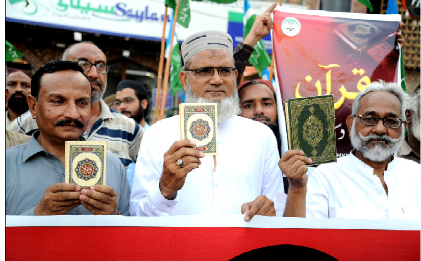
HYDERABAD: Workers of Jamaat-e-Islami hold a protest against burn of Quran Pak in Sweden