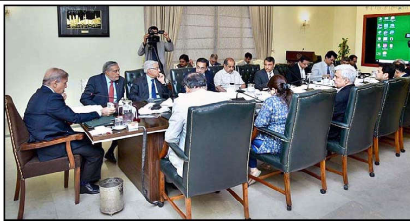
ISLAMABAD: Prime Minister Muhammad Shehbaz Sharif chairs a meeting regarding PSDP projects.

Subsequently, hearing of the case was adjourned till date in office.