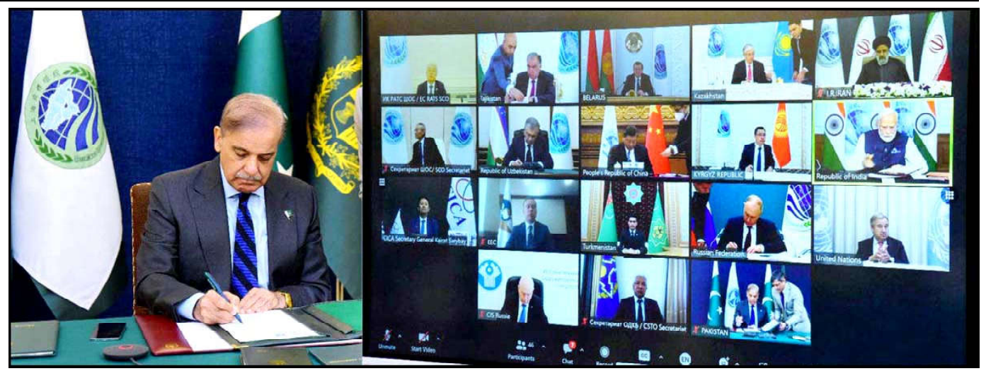
ISLAMABAD: Prime Minister Muhammad Shehbaz Sharif signing Joint Declaration and other documents adopted at the conclusion of the 23rd Shanghai Cooperation Organisation (SCO) Summit held virtually

He pointed out that diplomatic point-scoring must be avoided by all countries and said that all forms of terrorism, including State terrorism, must be condemned.