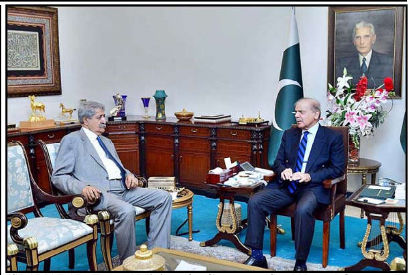
ISLAMABAD: Federal Minister for Commerce, Syed Naveed Qamar calls on Prime Minister Muhammad Shehbaz Sharif.

China's controls, to take effect from August 1, will apply to eight gallium-related products: gallium antimonide, gallium arsenide, gallium metal, gallium nitride.