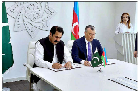
BAKU: Federal Minister for Overseas Pakistani Affairs and HRD, Sajid Hussain Turi signing MoU with his Azerbaijan counterpart on social welfare.

The meeting was further briefed that under the PM's Youth Programme, distribution process of laptops among the talented youth would commence soon.