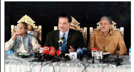
PHOOL NAGAR: Federal Minister for Power, Engr. Khurram Dastgir Khan addressing a press conference in Phool Nagar.

The communications minister said that the Yarik-Saggu and Saggu-Zhob CPEC project was going to start soon.