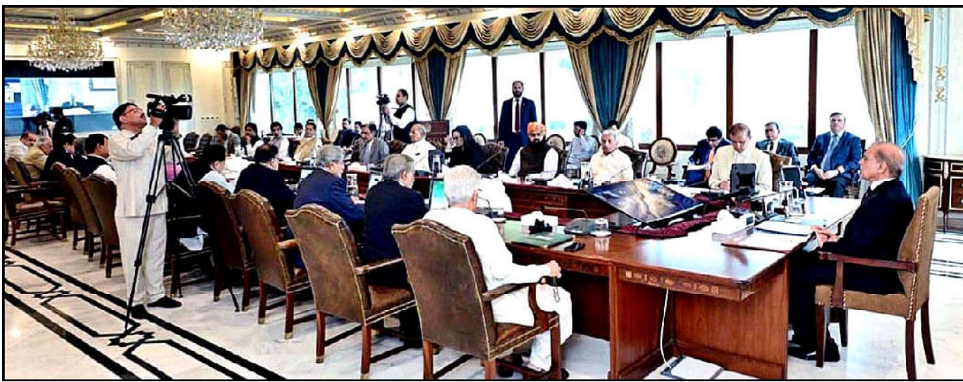
ISLAMABAD: Prime Minister Muhammad Shehbaz Sharif chairs a meeting of the Federal Cabinet

Ph: 0300-3898091 Vol: 05. No. 197 Zil Hajj 15, 1444 AH Tuesday July 04, 2023 Pages 04 Price Rs. 12.00