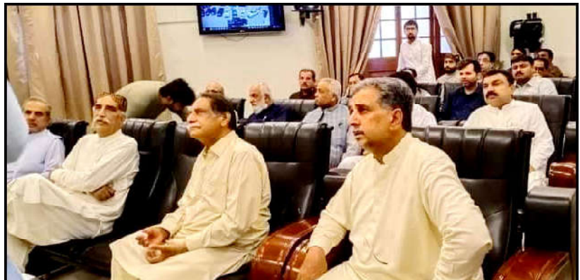
the spillways of Tarbela Dam have been opened," he added.

"After many years, the level of Tarbela Dam has increased to 12.6 feet after which