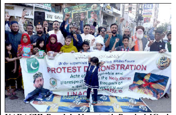
KARACHI: People holds protest in Provincial Capital against the burning the Quran in Sweden

He said respecting the Holy Quran is an integral part of every Muslim's faith, adding, such an incident is extremely unbearable in the name of freedom of expression." The Muslim world should prevent the repetition of such anti-Islamic behavior and not let the perpetrators of hurting the feelings of Muslims go unpunished, he added.