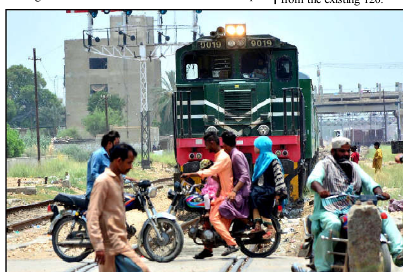
HYDERABAD: Dangerous moment as a motorcycle crossing railway track while the train is approaching at makki shah area

Firing was still continuing till last reports came in.