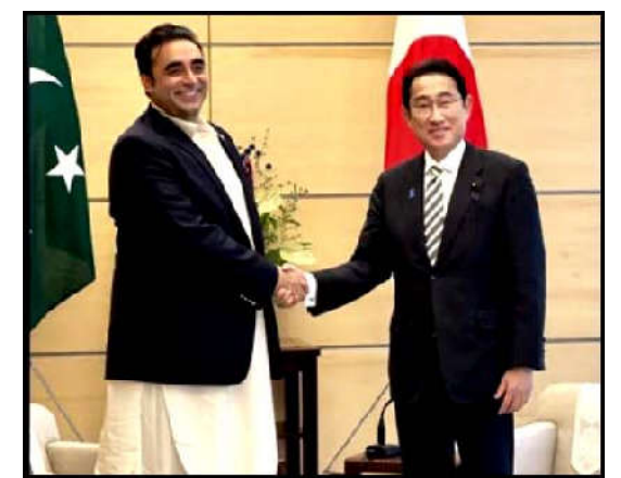
Foreign Minister Bilawal Bhutto Zardari meeting with Japanese Prime Minister Fumio Kishida in Tokyo

ing more avenues of cooperation. The foreign minister also invited his Japanese counterpart to visit Pakistan at your convenience to further our discussions. He said Pakistan and Japan were longstanding friends and share a special bond based on deep-rooted linkages that go far in history and time. The people of Pakistan carry a deep sentiment of warmth and affection for Japan and the Japanese people. We have always stood with each other in times of need, he said.