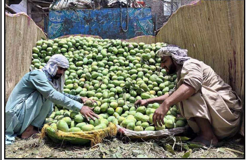
LARKANA: Labourers busy in unloading mangoes from a delivery truck at Fruit Market.

provide a breathing space in the recovery of Pakistan's creditworthiness but also enable the resumption of dollar inflow from various bilateral and multilateral lenders. He said that the business community hopes that the industry reforms introduced by the government in the budget would be implemented. The framework for the development of five Es, Energy, E-Pakistan, environment, equity and empowerment would be shared with the business community and stakeholders will be taken on board, he added. However, Chamber President urged the government to improve financial management and discipline.