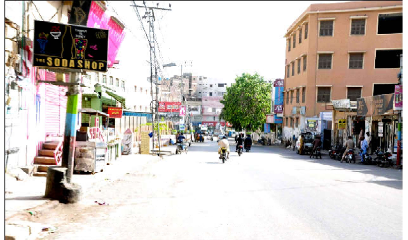
HYDERABAD: View of city gives desert look due to hot weather of summer season, located on Hussainabad area in Hyderabad

The injured was shifted to Jinnah Hospital for medical assistance. Further investigation was underway.