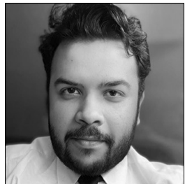
Syed Sheheryar Raza Zaidi

Pakistan's long-running political soap opera continues, adding layers of intrigue with each passing day. Every day, Pakistanis long disenchanted by the shenanigans of the ruling elite, watch from the edge of their seats as the fate of their country hangs in the balance between the Supreme Court and the military.