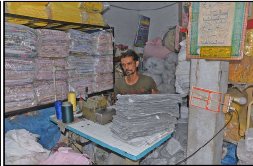
FAISALABAD: A worker is busy in his work at Tissue making factory, to earn daily wages for the livelihood of his family.