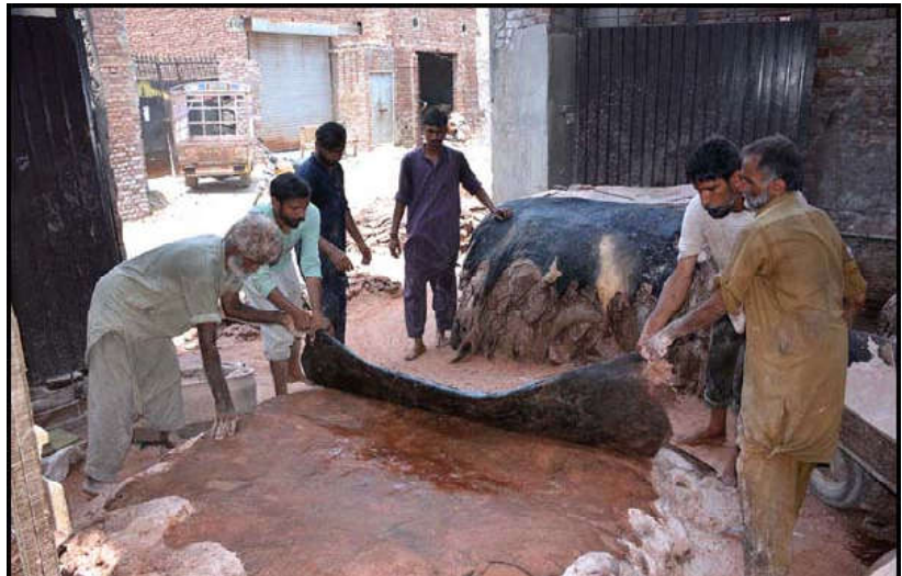
FAISALABAD: Workers preserving sacrificial animal hides at their warehouse.