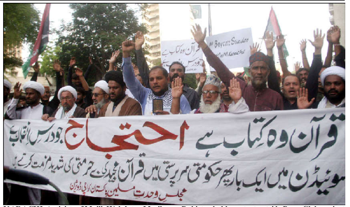
KARACHI: Activists of Majlis Wahdat-e-Muslimeen Pakistan holds protest outside Press Club against the burning of Quran Pak in Sweden.

However, the source, a cabinet member, said that he would not be returning just yet. The PML-N supreme is convicted in the Al-Azizia and the Aveinfield Apartment references filed by the National Accountability Bureau (NAB) in the aftermath of the Panama Papers case.