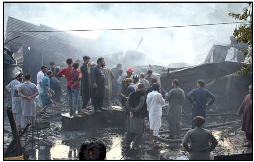
MUZZAFFERABAD: A destructive view of the warehouse as burnt after fire due to short circuit, near Tanga stop at the Capital of AJK.

Tasneem Qureshi said that peace, tolerance, brotherhood and obedience to the commands of Allah Almighty were the messages conveyed through sacrifices and performance of Hajj. Meeting such requirements through practical measures would fulfill real objectives of the recently concluded EidulAzha event, he added.