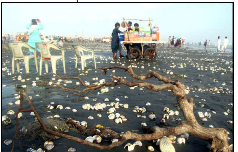
KARACHI: A view of the sea shells at Sea View after the recent storm in Arabian Sea in Provincial Capital.

Barrister Feroze Jamal Kakakhel hailed the innovation and public acceptance of Pakhtunkhwa Radio and said that the media as a whole can light the candles of hope in the society by pulling the society and people from the morass of growing anxieties and despair. On a question of Dr. Abasin, the Minister said that Eid is not only for children but also for adults. On Eid, he said, most of the families get together after a long separation away from their city or homeland, while the pilgrims also return to their homes after the obligation of Hajj and share the joys with each other.