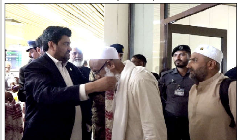
KARACHI: Governor Sindh Kamran Khan Tessori receiving the pilgrims warmly with flower garlands as first hajj flight landed at Karachi International Airport during post hajj operation

During the meetings, the matters related to bilateral cooperation in trade and investment came under discussion.