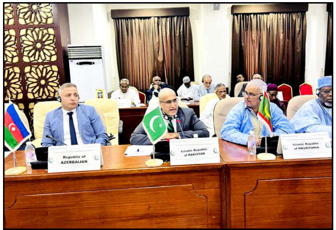
JEDDAH: Pakistan's Ambassador to the OIC Fawad Sher participating in extraordinary meeting of Organization of Islamic Countries (OIC) called to discuss incident of the Holy Quran's desecration in Sweden.

Turkey in late January suspended talks with Sweden on its NATO application after a similar incident of desecration of the Holy Quran by a Danish far-right politician near the Turkish embassy in Stockholm.