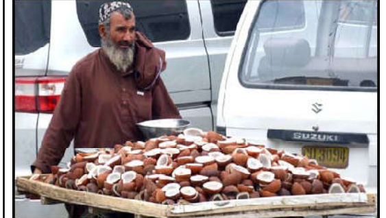
QUETTA: An elderly man pushing his handcart full of coconuts for selling to earn livelihood for his family.