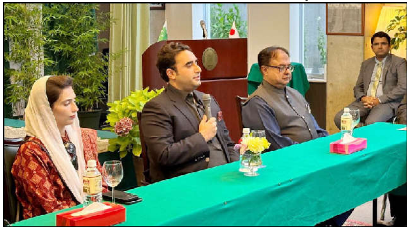
Foreign Minister Bilawal Bhutto Zardari speaking at a function organized by the Pakistan diaspora in Tokyo