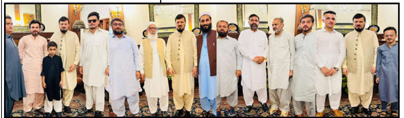
PESHAWAR: Khyber Pakhtunkhwa Governor Haji Ghulam Ali in a group photo with people during Eid greeting at Governor House.

So far over 2,50,000 cards have been restored. Mr Kundi said that the holders of blocked cards either contact the local office of BISP or sent message on 8171. For the redressal of the complaints of beneficiaries, he said a new system for direct recovery from banks is being introduced during the current month.