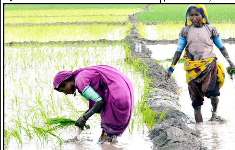
HYDERABAD: Female farmers are busy in seeding rice crops in their fields at the bypass.

BRASILIA (Xinhua/APP): Brazilian financial analysts raised their projected GDP expansion in 2023 from 2.14 to 2.18 percent, the seventh consecutive weekly upgrade, and upped the 2024 forecast from 1.20 to 1.22 percent, the Central Bank of Brazil. Analysts lowered the forecast inflation for the year from 5.12 to 5.06 percent, and for next year, from 4.00 to 3.98 percent, according to the bank's weekly Focus survey of the country's top financial institutions. Brazil's target inflation is 3.25 percent for 2023 and 3 percent for 2024, with a 1.5 percentage point margin of tolerance in both cases. Market analysts maintained the forecast for the benchmark Selic interest rate at 12.25 percent for this year.