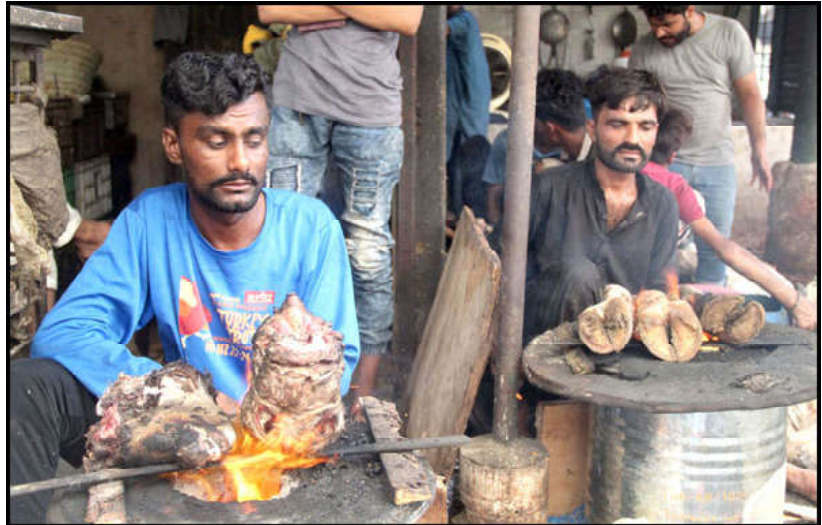
KARACHI: Workers are peeling the "Siri Paye" outside their shop at nanak warha area, the paye and Siri is the one of the favorite and famous dish in Pakistan.

about the leadership role. To a question about relief to poor people, he said despite economic challenges, the government has provided maximum relief to employees, and pensioners besides the people working in the private sector. About load-shedding of gas and electricity, he said, we have issued directives to the department concerned to ensure energy supply during cooking breakfast, lunch and dinner timing. He said that a discussion has been made with Azerbaijan regarding the provision of LNG cargo to Pakistan before next winter. To a question about IMF, he said a nine-month relief through an agreement has been made to run the economic affairs in a proper manner. He hoped that heavy investment from the Gulf region would boost business activities besides open job opportunities in Pakistan.