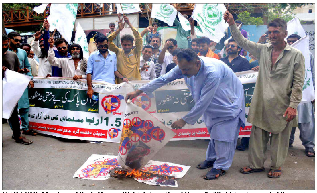
KARACHI: Members of Basic Human Rights International Council of Pakistan Agency holding protest demonstration against desecration of Holy Quran in Sweden in front of Karachi press club