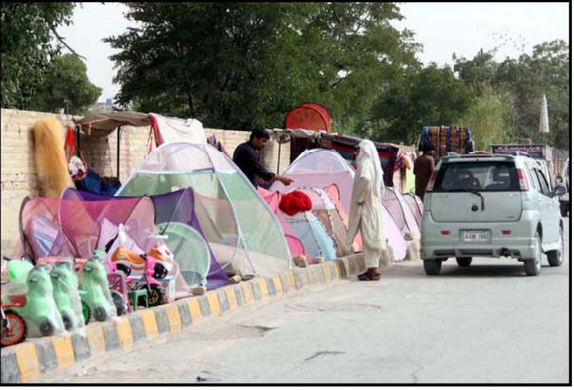
QUETTA: Vendorsells mosquitoes net to earn his livelihood for support his family during hot day of summer season at a roadside stall located on