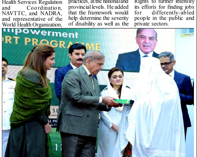
ISLAMABAD: Prime Minister, Muhammad Shehbaz Sharif distributing smart cards and cheque books relating to Benazir Social Protection Account among the beneficiaries

The President urged the Ministry of Human Rights to further intensify