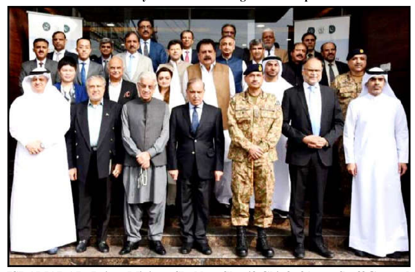
ISLAMABAD: Prime Minister Shehbaz Sharif, Chief of Army Staff General Syed Asim Munir and others in a group photo during inauguration ceremony of Land Information and Management System-Center of Excellence (LIMS-COE)