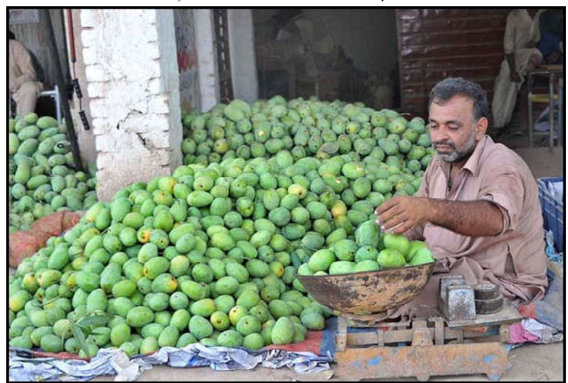
MULTAN: A trader selling seasonal fruit mango at Fruit Market.

(sd/) JUDGE Banking Court Hazara Division, Abbottabad.