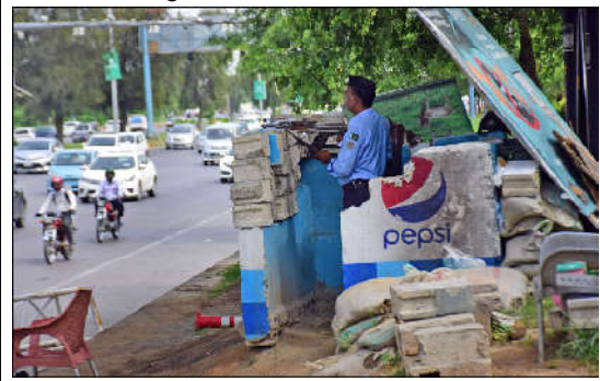
ISLAMABAD: A Police personal holding gun stand guard at Police Check Post at Faizabad, to make the Capital secure as the wearied condition of his bunker needs attention of high authority.

Minister Al Jaber expressed gratitude to Minister Rehman for her invitation to visit Pakistan and acknowledged Pakistan's leadership in representing the Global South during COP27, noting the establishment of the Loss and Damage Fund, which enhanced the vulnerable countries' stake in climate negotiation processes. He anticipated direct engagement and continuous support from Pakistan as the UAE prepares for COP28, highlighting that Pakistan is not just a great friend of the UAE.