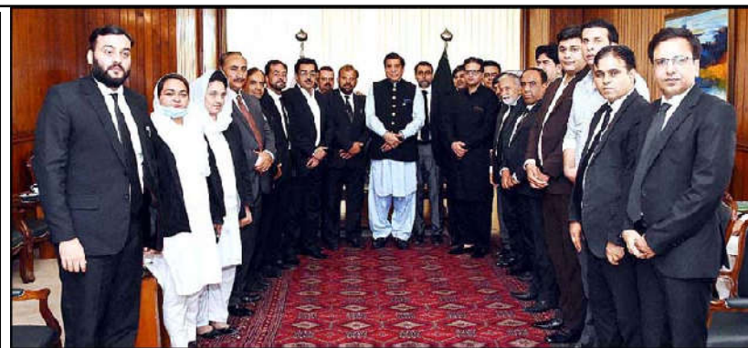
ISLAMABAD: Speaker National Assembly Raja Pervez Ashraf in a group photo with delegation of Gujjar Khan Bar Council at Parliament House.

The spokesperson re-counted that the people of Pakistan had witnessed the remarkable achievements and fruits of high-quality development stimulated by CPEC since its inauguration in 2013. "Under the first phase of CPEC, China invested around US$ 25.4 billion in Pakistan, primarily in energy and transport infrastructure sectors. CPEC projects have added: 8000 MWs of energy to the national grid; 510 km of highways; 932 km of road networks; and 820 km.