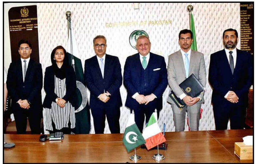
ISLAMABAD: Andreas Ferrarese the Italian Ambassador in Pakistan and Secretary Ministry of Economic Affairs in a group photo after signs the Exchange of Letter with Pakistan and Italy extend Pakistan â€™ Italian Debt Swap Agreement (PIDS) timeline until December 2024, at the Ministry of Economic Affairs.

SCODA also revealed that demonstration area will set an innovation lab targeting China's Cross-Border Interbank Payment System, aiming to expand the utility of the system among SCO members and the China-proposed Belt and Road Initiative.