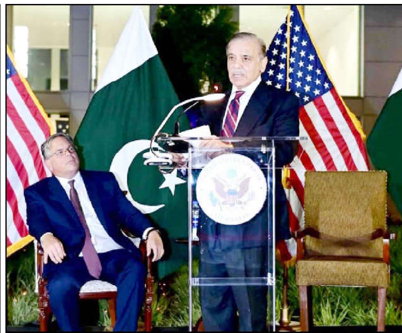
ISLAMABAD: Prime Minister Muhammad Shehbaz Sharif addressing a ceremony of the celebration of the 247th Independence Day of the United States of America

He felicitated President Joe Biden, and the people and the government of the United States on their 247th Independence Day.