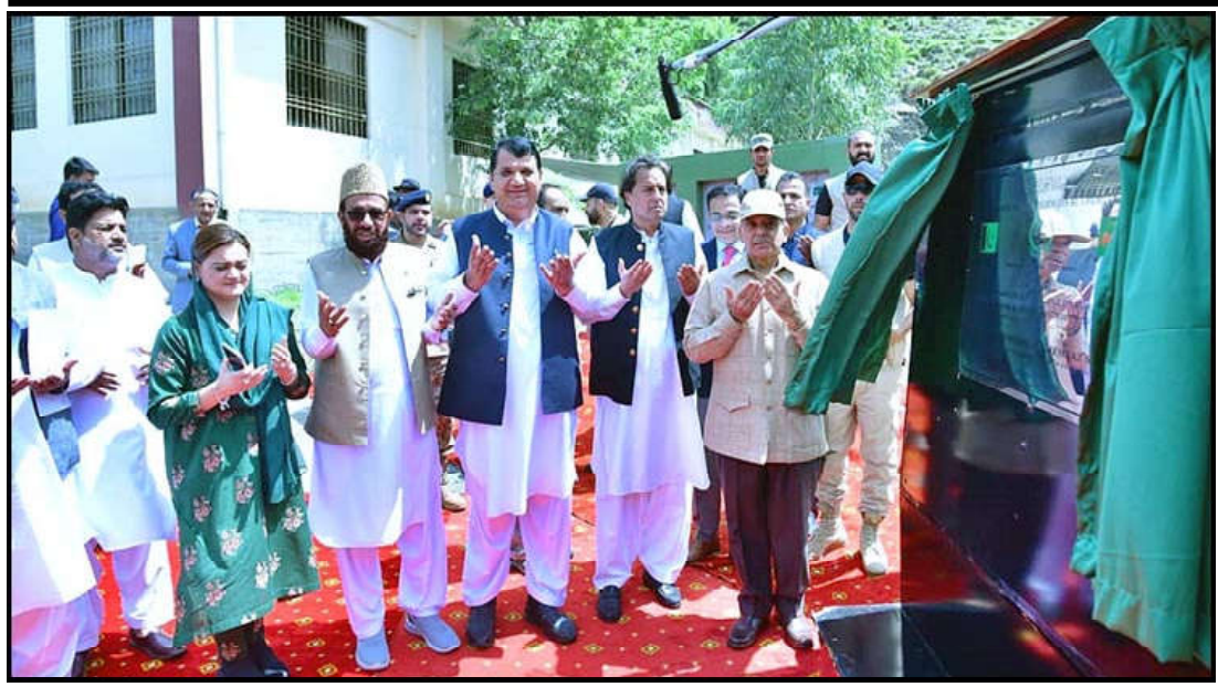
TORGHAR: Prime Minister Muhammad Shehbaz Sharif laying the foundation stone of the RCC Bridge on the River Indus that will connect Torgahar with Buner District, Torgahar, KP.