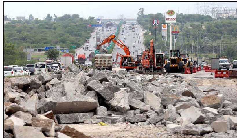
ISLAMABAD: Heavy machinery being used to expand Islamabad Expressway during development in Federal Capital.

Along with Benazir Kafaalat, Benazir educational scholarships are also being given out to the children of registered families, however, 70 percent attendance in the school is mandatory to receive educational scholarships.