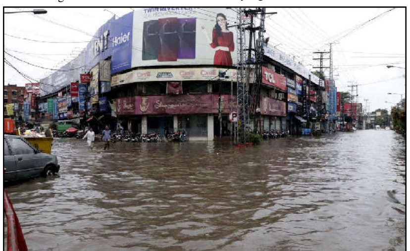
LAHORE: Commuters are facing difficulties in transportation due to stagnant rainwater due to poor sewerage system caused by heavy downpour of monsoon season, at Queens road in Lahore.

crises compelled increasingly large numbers of people to flee their homes. The tragedy of such immense proportions was believed to have taken place in the presence of maritime authorities. It was also believed that Pakistani nationals were forced to stay below the deck by the crew, which maltreated them during the journey. Referring to the tragedy during the hearing today, Justice Bandial noted that innocent and poor people were tricked into going abroad on the pretext of better jobs. "Citizens are duped by human traffickers and pay millions of rupees," the top judge said, pointing out that even children and women were becoming victims of human smuggling. "Does the government have statistics on the number of children being smuggled," the CJP asked.