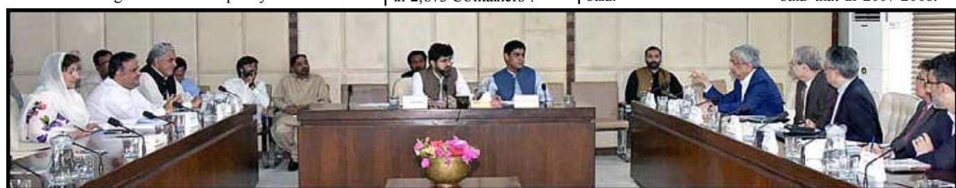
ISLAMABAD: Senator Zeeshan Khanzada, Chairman Senate Standing Committee on Commerce presiding over a meeting of the Committee at Parliament House.

$11,613.57 million to $7,263.49 million in FY2023, showing negative growth of 37.46 percent. Meanwhile, on year-on-year basis, the export of services increased by 19.77 percent by growing from $15.14 million in May 2022 to $616.96 million in May 2023. However, services imports into the country decreased by 11.84 percent, from $977.85 million to $862.11 million. On month-on-month basis, the export of services increased by 19.78 percent in May 2023 when compared to the imports of $15.08 million in April 2023. The imports of services also grew by 31.60 percent in May 2023 compared to imports of $655.10 million in April 2023, PBS reported.