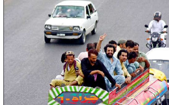
ISLAMABAD: Passengers are travelling on the roof top of the bus without any safety, which needs the attention of concern authority