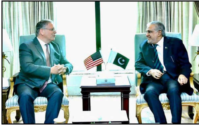
ISLAMABAD: Donald Blome, Ambassador of the United States of America to Pakistan called on Federal Minister for Finance and Revenue Senator Muhammad Ishaq Dar.

Dar appreciated the support and cooperation of the US and reiterated the desire of the government to further deepen bilateral economic and trade ties with the US. On the occasion, Donald Blome expressed confidence in the policies and programmes of the government for bringing economic sustainability to the country. He also extended his support to further promote bilateral economic, investment and trade relations between the two countries.