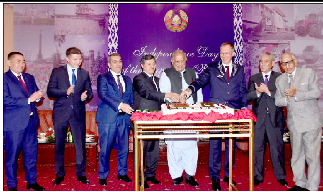
ISLAMABAD: Federal Minister for Human Rights Mian Riaz Hussain Pirzada cutting the cake along with the Ambassador of Republic of Belarus to Pakistan Andrei Metelitsin and others on the occasion of the celebrations of the Independence Day of Republic of Belarus, at Serena Hotel in Federal Capital.

the government came into power in April last year, CPEC has been revived which remained halted by the previous government. Several projects of power, infrastructure, water and others have been completed in Gwadar which are ready for the groundbreaking. While chairing the meeting to review progress over the special 12th JCC, the planning minister directed the relevant stakeholders to finalize the arrangements for the event. The minister also asked the relevant ministries to share their pending issues so that they can be taken with Chinese authorities during the visit.