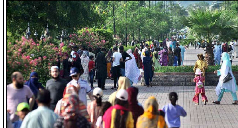
ISLAMABAD: A large number of people visiting Rawal Lake View Park in a pleasant day in the city.