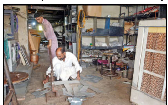
FAISALABAD: An Iron smith are busy in their work at shop at Dajkot Road in City.

The wheat seed availability was recorded at 511,378 metric tons before the processing stage, out of which companies processed 462,048 metric tons and certified seed tags