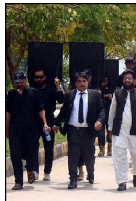
ISLAMABAD: Security personnel secure a vehicle carrying Pakistan's former Prime Minister Imran Khan arrives to appear in a court.

of issue and also summoned list of those who took loans. Audit report 2019-2020 of energy ministry was reviewed in the meeting. Report identified more than 4000 billion irregularities.