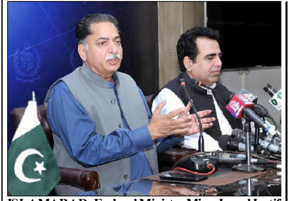
ISLAMABAD: Federal Minister Mian Javed Latif addressing a press conference at PID Media center.