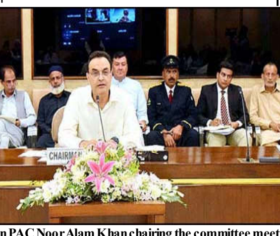
ISLAMABAD: Chairman PAC Noor Alam Khan chairing the committee meeting at Parliament House.

dealing with criminals. Safeguarding the lives and property of citizens in the capital city is the foremost responsibility of Islamabad capital police. The cases of motorcycle and motor vehicle theft were discussed, and efforts were made to apprehend the culprits.