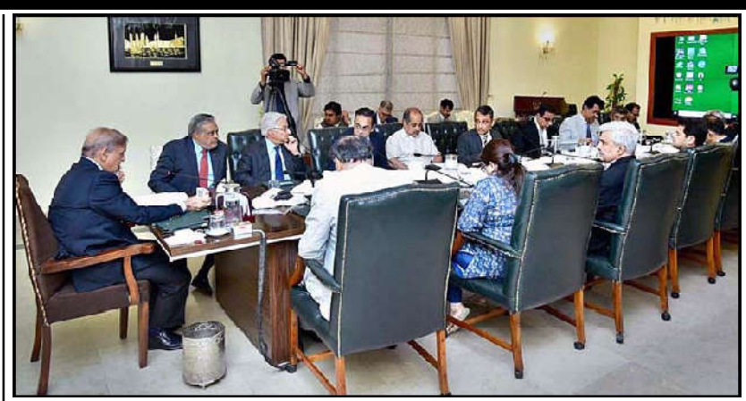
ISLAMABAD: Prime Minister Muhammad Shehbaz Sharif chairs a meeting regarding PSDP projects.

ISLAMABAD (Online): Rain-wind/thundershower (with isolated heavy falls) is expected in Kashmir, Gilgit Baltistan, Khyber Pakhtunkhwa, Islamabad, Potohar region and upper Punjab.