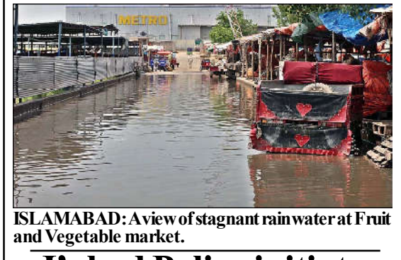
ISLAMABAD: A view of stagnant rainwater at Fruit and Vegetable market.

ISLAMABAD (APP): Allama Iqbal Open University (AIOU) is commencing the first phase of Autumn 2023 semester from July 2023, and for convenience of the students, the university had established prospectus sale points at Union Council level throughout the country.